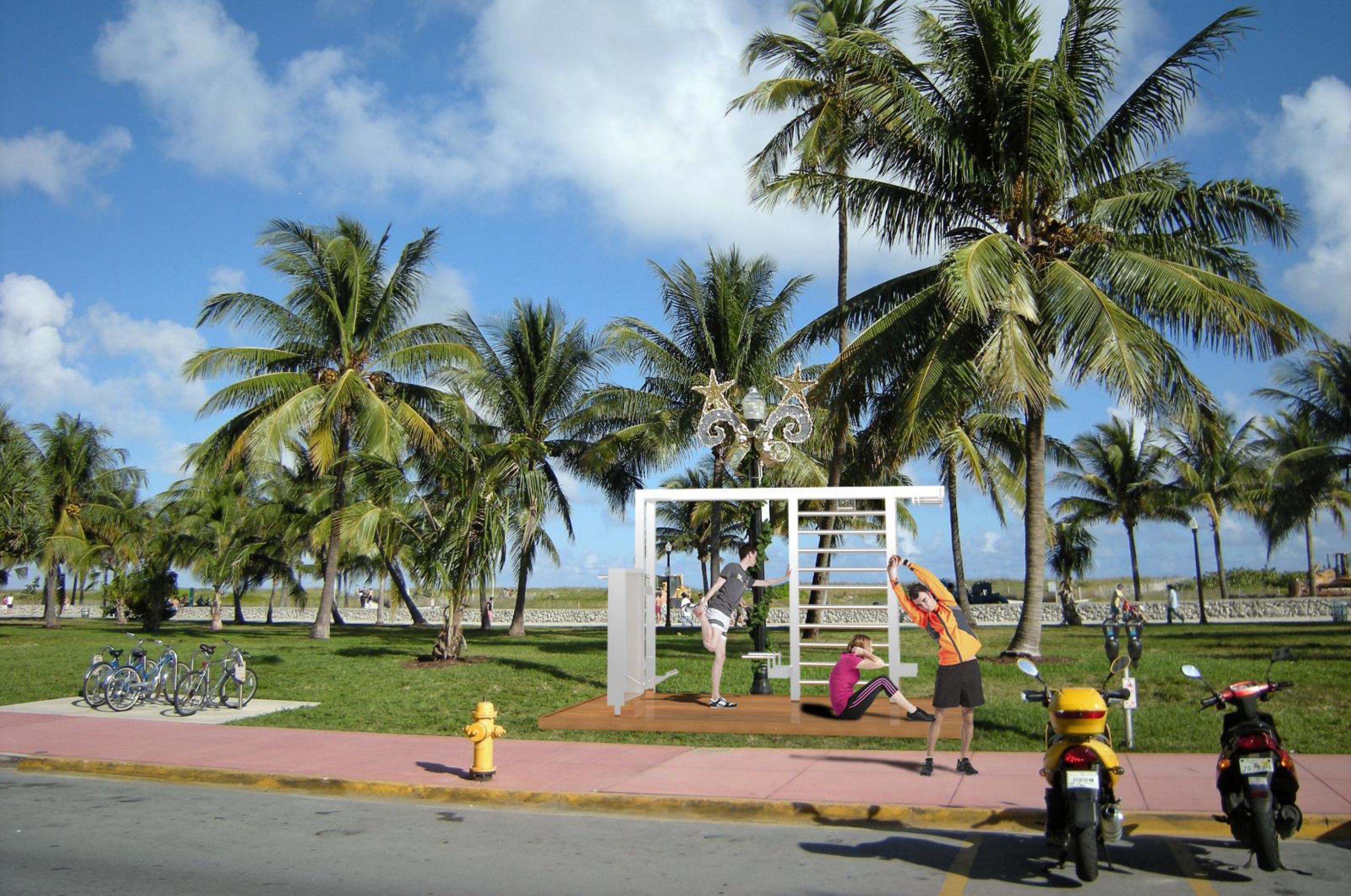
Artistic Simulation | Ocean Drive, Miami Beach