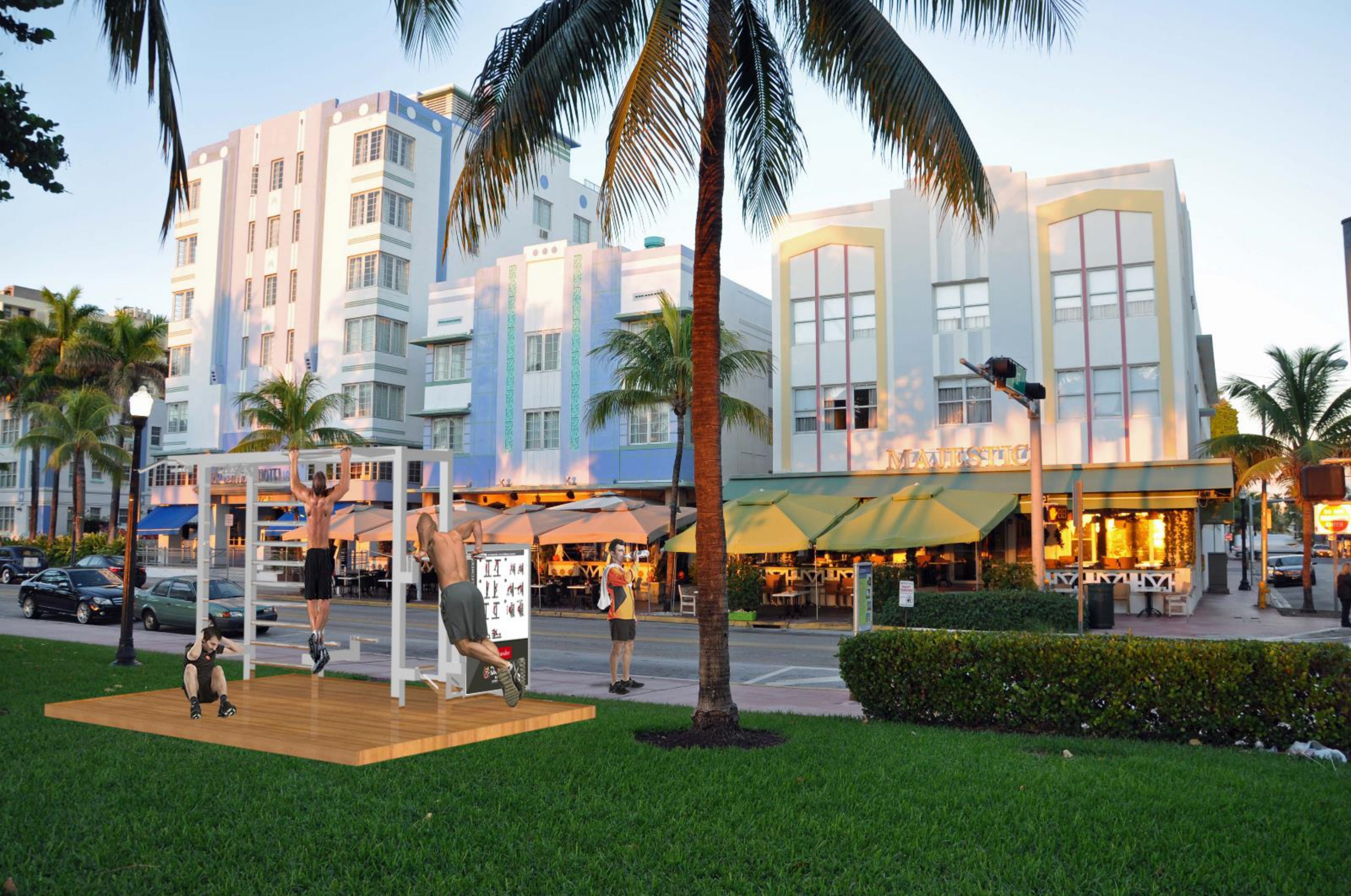
Artistic Simulation | Ocean Drive, Miami Beach