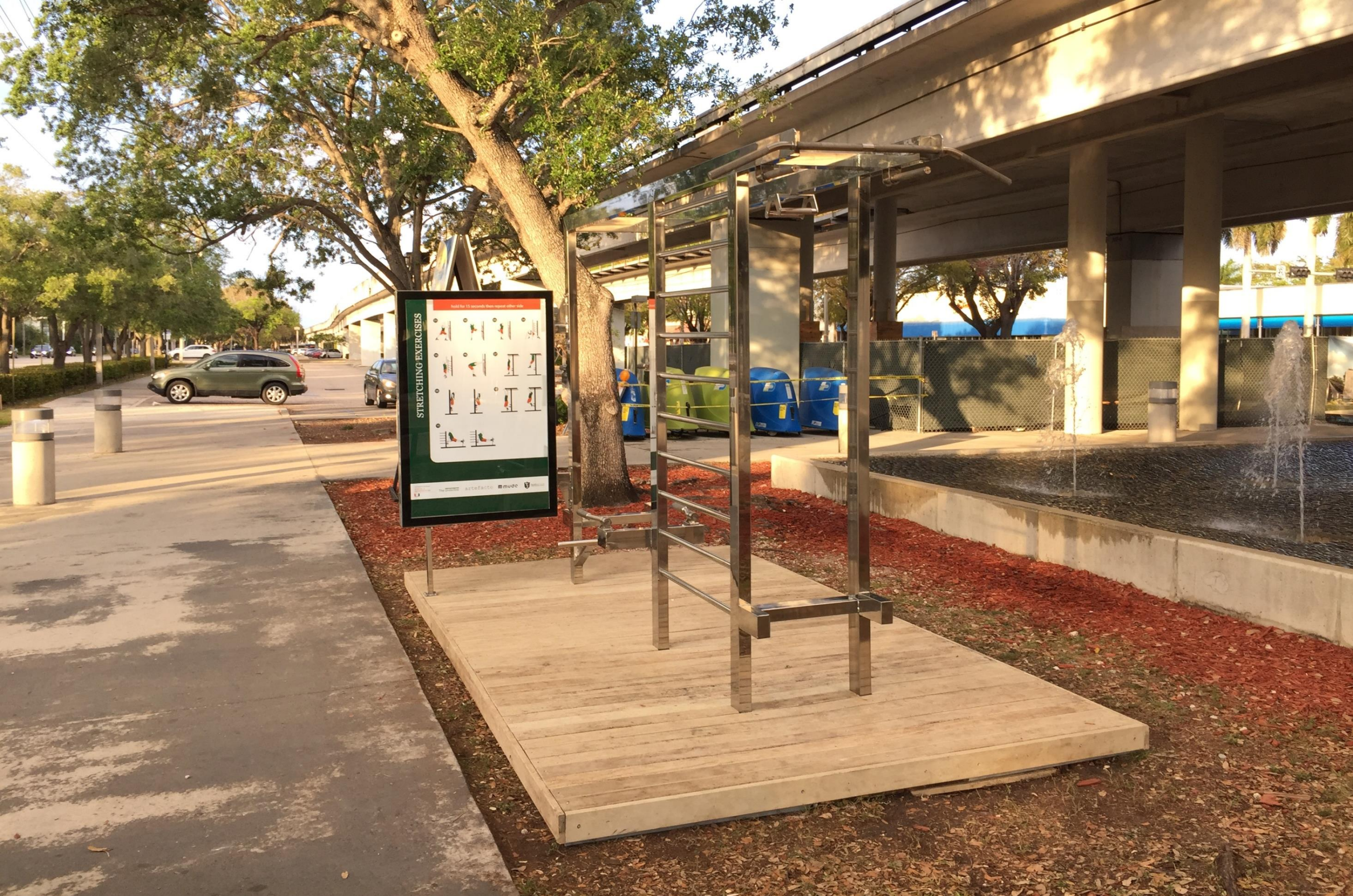
First USE installed in Miami – 5400 Ponce de Leon BLVD, Miami - FL