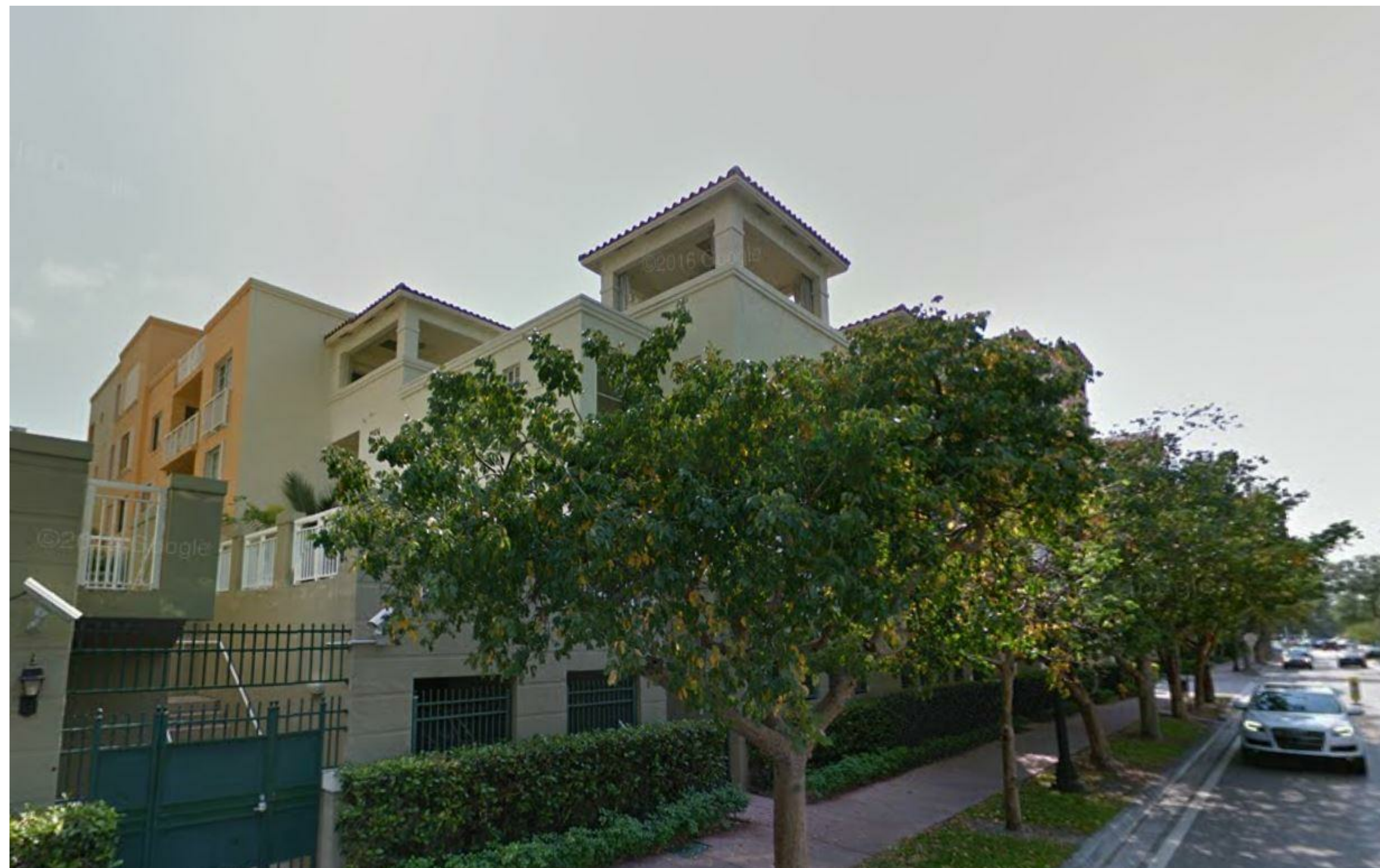
Neighbor 5 (419 2ND ST.)