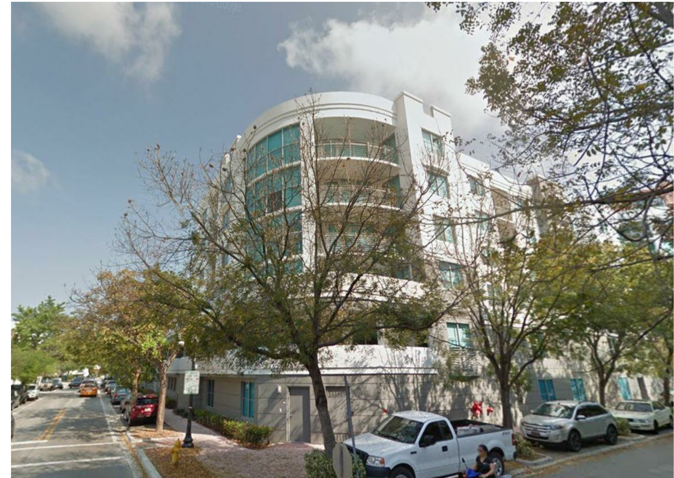
Neighbor 3 (110 WASHINGTON AVE.)

SKLAR architecture 2310 HOLLYWOOD BLVD. HOLLYWOOD, FL 33020 www.sklararchitect.com TEL - (954) 925-9292 FAX - (954) 925-6292 AA 0002849 IB 0000894 NCARB CERTIFIED