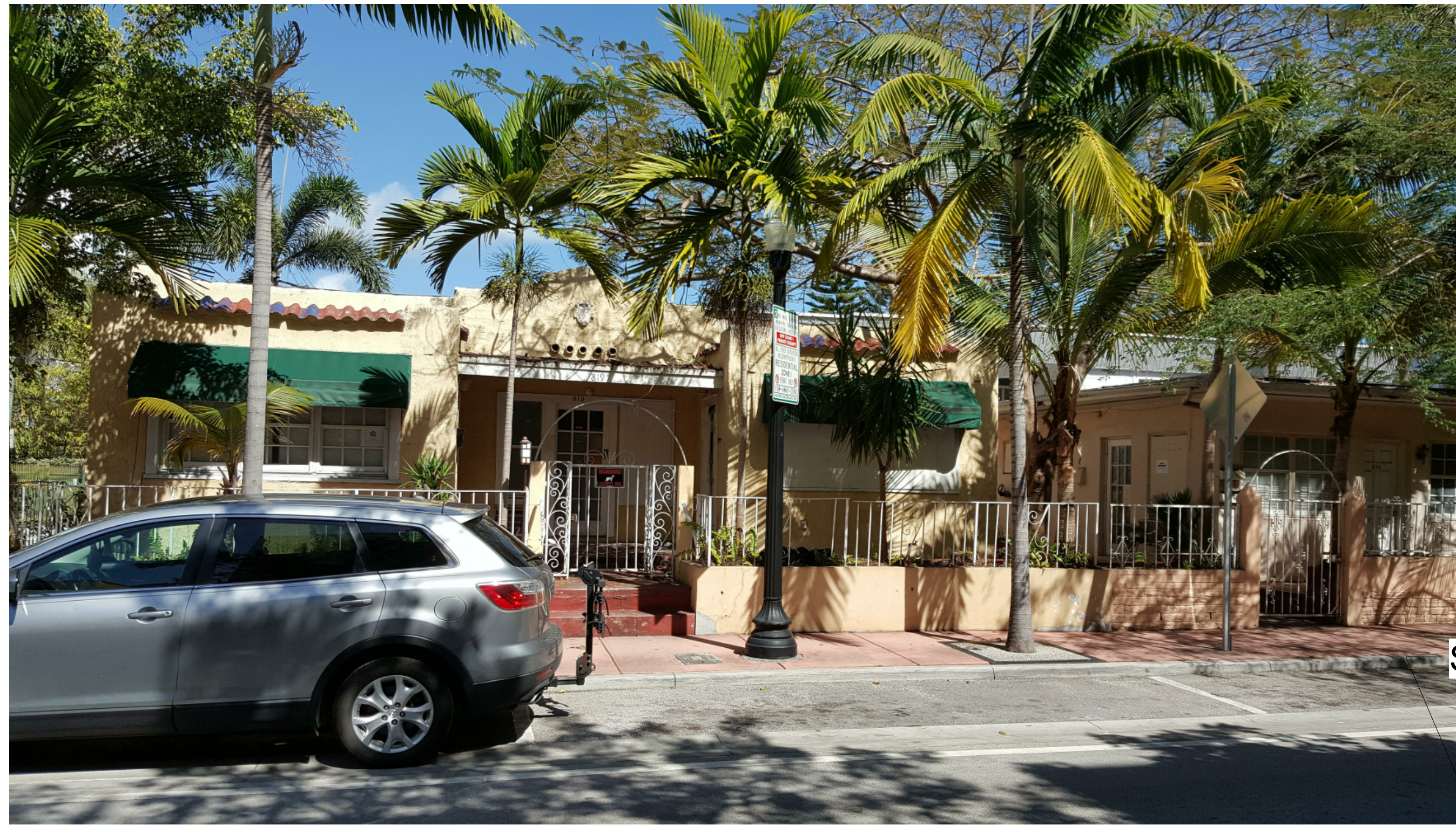
Neighbor 1 (819-821 2ND ST.)