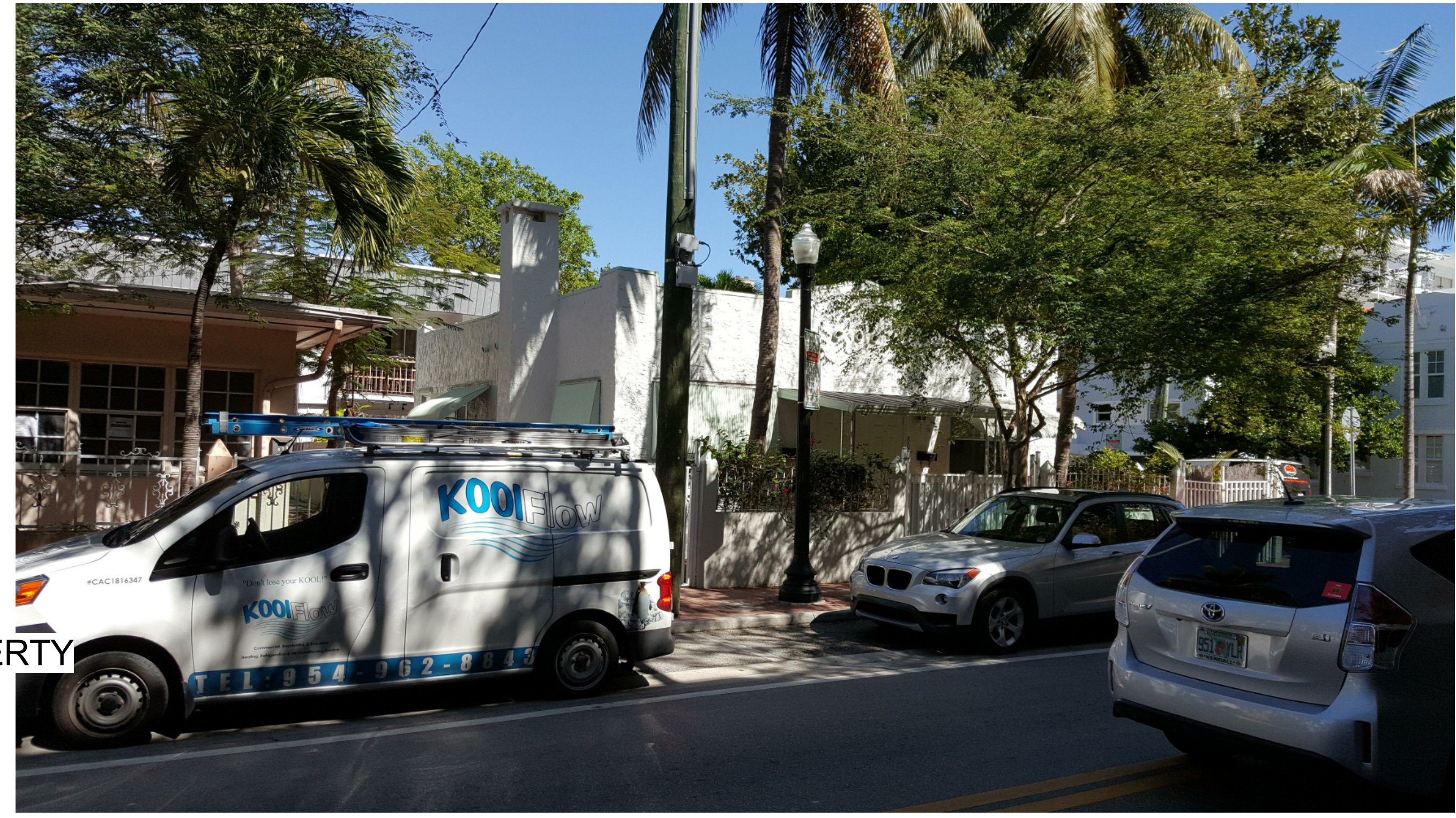
Neighbor 2 (803-805 2nd ST.)