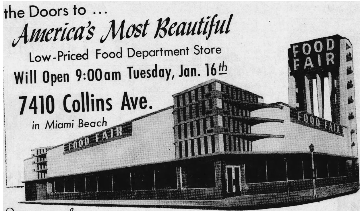
Food Fair advertisement, Miami Herald, January 16, 1951

of demolition is substantial, all existing architectural features of both facades are proposed to be retained and restored.