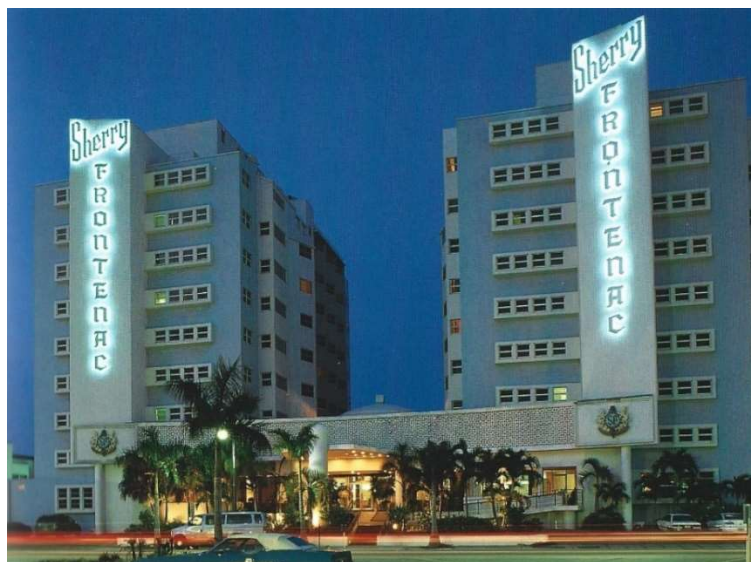
Figure 16. Sherry Frontenac Hotel, 1990s. (MiMo: Miami Modern Revealed)