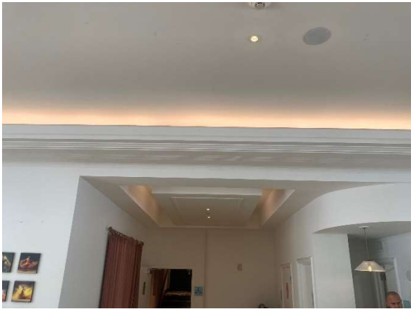
Figure 32. Detail of floating ceiling and cornice, September 2023.