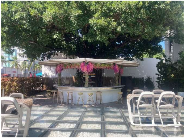
Figure 18. Detail of patio, September 2023.

situated on an oolite base lines the property at Washington Avenue. (Figure 20) A metal gate at the rear of the patio opens to the narrow courtyard between the two wings of the building. (Figure 21) The courtyard is paved with oolite and is heavily landscaped.