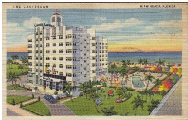
Figure 10. Postcard depicting the Caribbean Hotel, 1940s.