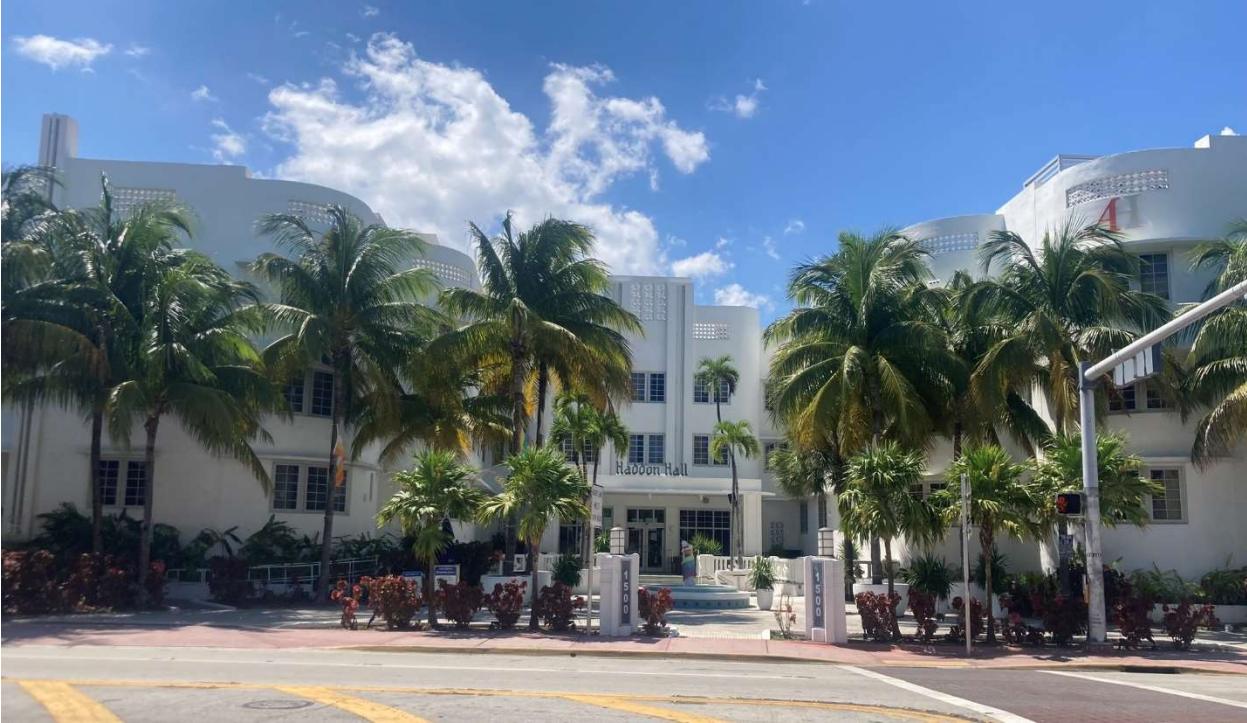
Figure 25. View of 1500 Collins Avenue, looking west, September 2023.

The former Haddon Hall Hotel, at 1500 Collins Avenue, is a U shaped Streamline Moderne building. (Figure 25) It is constructed of concrete block covered with stucco and has a spread footing foundation.