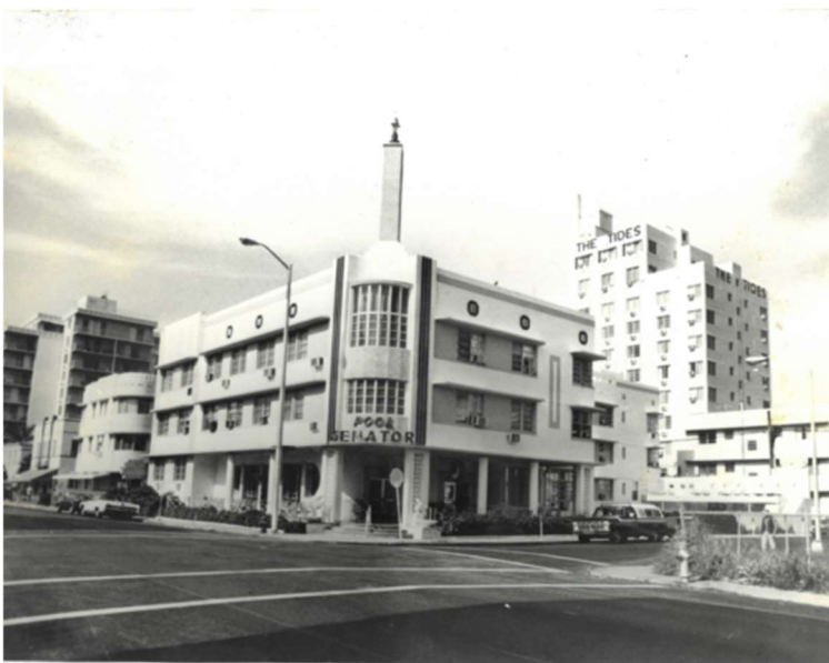
Figure 7. Senator Hotel, 1970s.