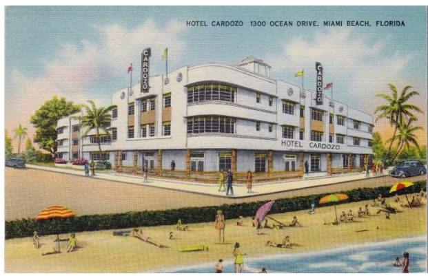
Figure 14. Postcard depicting the Cardozo Hotel, 1940s.