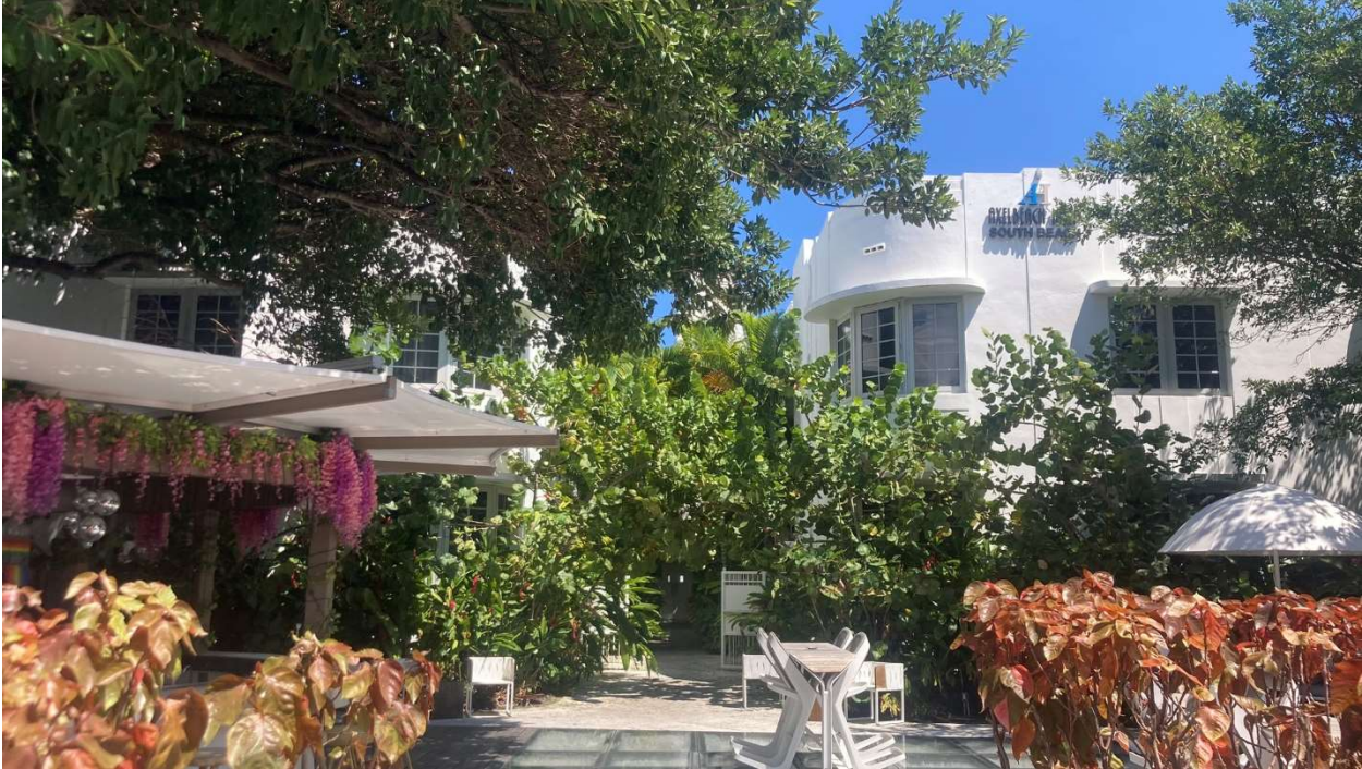
Figure 2. 1453-55 Washington Avenue, September 2023.