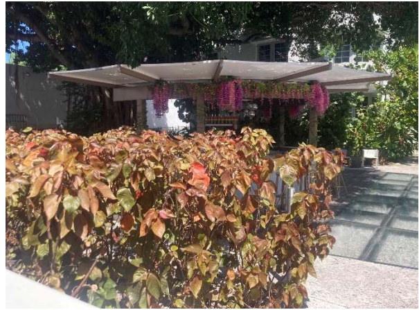
Figure 19. Detail of planting beds, September 2023.