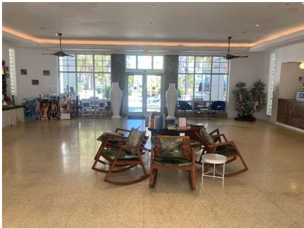
Figure 30. View of Lobby, looking east, September 2023.

The lobby features patterned terrazzo flooring (Figure 30, Figure 31), a floating ceiling (Figure 32), decorative molding at the cornice (Figure 32), and a rounded marble-clad reception desk. (Figure 33)