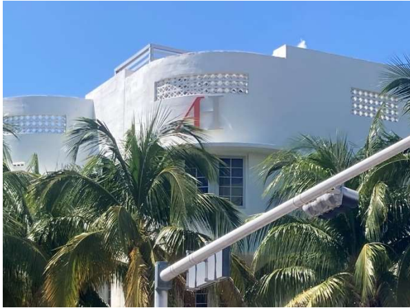
Figure 28. Detail of breeze block, September 2023.

Significant details at the front (east) façade include rounded corners with continuous eyebrows over the windows (Figure 26), projecting bay at the central section (Figure 27), breeze block (Figure 28) and terrazzo at the entrance. (Figure 29) The other elevations are not readily visible due to the proximity of neighboring structures.