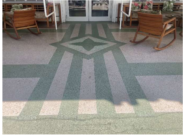
Figure 29. Detail of terrazzo flooring, September 2023.

The lobby features patterned terrazzo flooring (Figure 30, Figure 31), a floating ceiling (Figure 32), decorative molding at the cornice (Figure 32), and a rounded marble-clad reception desk. (Figure 33)