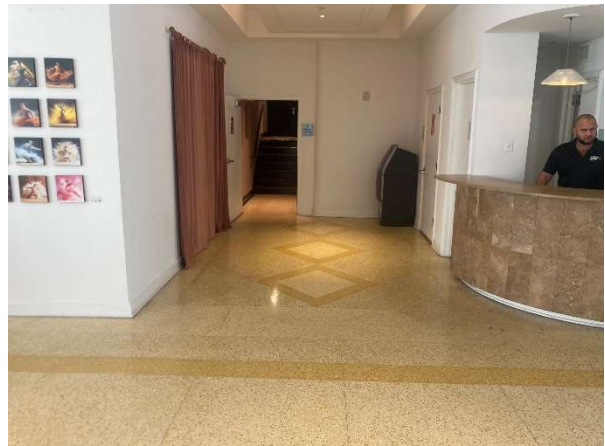
Figure 31. Detail of terrazzo flooring, September 2023.