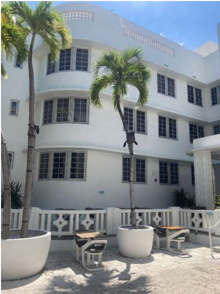
Figure 26. Detail of rounded corner, September 2023.