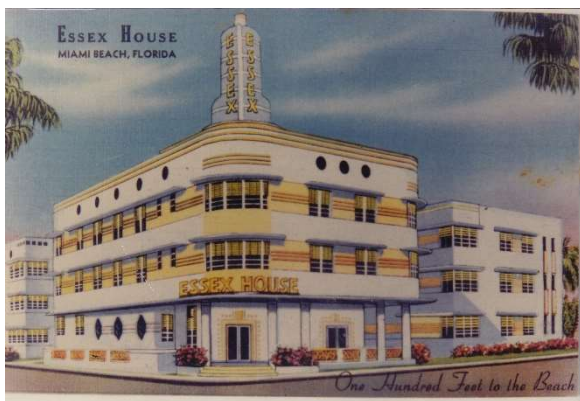
Figure 13. Postcard depicting the Essex House, 1940s. (Miami Beach Visual Memoirs)