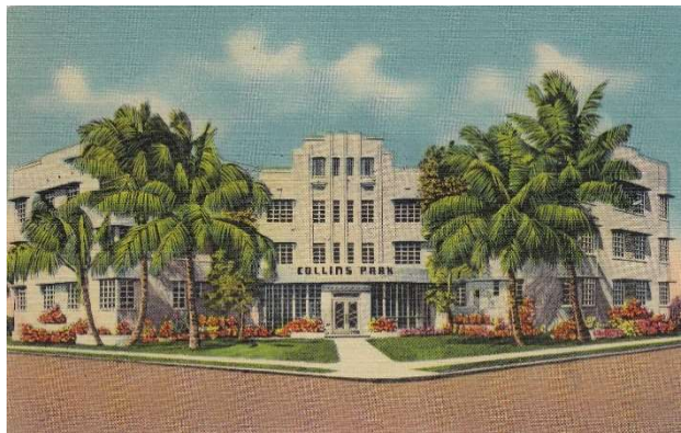
Figure 12. Postcard depicting the Collins Park Hotel, 1940s.