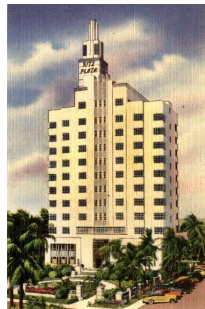
Figure 8. Postcard depicting the Grossinger Beach (Ritz Plaza) Hotel, 1940s.