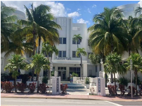
Figure 22. View of patio between wings of Haddon Hall, looking west, September 2023.