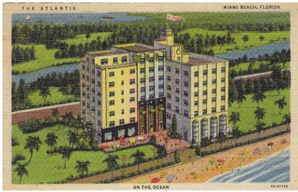
Figure 5. Postcard depicting the Atlantis Hotel, 1940s. (Miami Beach Visual Memoirs)