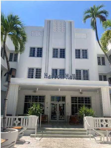
Figure 27. View of central bay, September 2023.