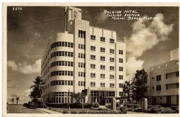
Figure 9. Raleigh Hotel, 1940s.