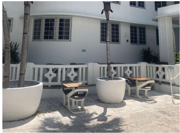
Figure 23. Detail of concrete fence at patio, September 2023.

A rectangular pool was constructed in 1952 for the Haddon Hall Hotel. (Figure 24) It is surrounded by oolite deck. A spa is situated at the north end of the pool. The pool deck is surrounded by lush landscaping.