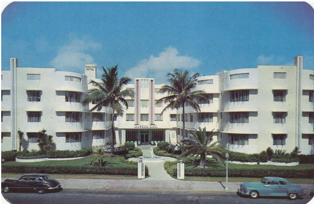
Figure 4. Postcard of Haddon Hall Hotel, c. 1955.

The U.S. Army Technical Training Command took over the hotel in May 1942. It was returned to the owner on July 6, 1944, and a permit for hotel renovations was issued the next day. A 70'x28' swimming pool was permitted in October 1952, and terraces, fencing and miscellaneous one-story buildings associated with the pool were also added in 1952-53. Other than maintenance, it appears that very little modification has been made to the exterior. The interior of the hotel has experienced some reconfiguration and remodeling.