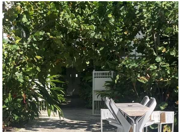
Figure 21. Detail of metal gate at rear of patio, September 2023.

The former Haddon House Hotel is situated on the east side of the property and faces Collins Avenue. It has an irregular U-shaped plan with a small setback from the pedestrian sidewalk. A patio paved with oolite is situated between the wings of the U. (Figure 22) The patio is lined with stucco-covered concrete piers and fences (Figure 23), and a circular fountain is located at the center. (Figure 22) An accessible ramp is located at the south end of the patio.