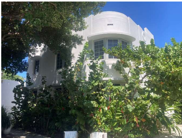
Figure 37. Detail of rounded corner and eyebrow, September 2023.

Significant features at the front (west) façade include rounded corners (Figure 37, Figure 38), eyebrows (Figure 39), chevron motifs and medallions (Figure 40) The other elevations are not readily visible due to the proximity of neighboring structures.