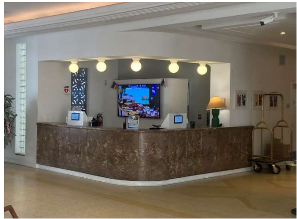
Figure 33. Detail of marble-clad reception desk, September 2023.