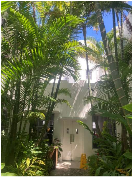
Figure 35. Detail of block connecting two wings of the "U", September 2023.