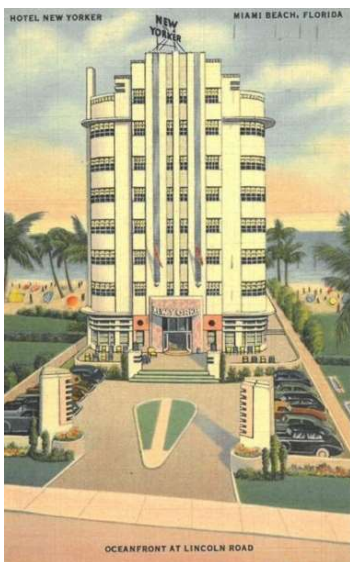
Figure 15. Postcard depicting the New Yorker Hotel, 1950s. (Miami Beach Visual Memoirs)