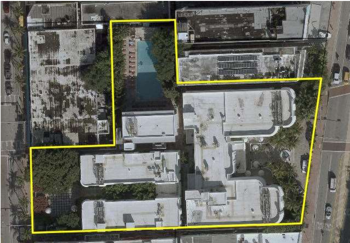
Figure 17. Tax parcel map showing property line of the Haddon Hall Properties (Miami-Dade County Property Appraiser)

The Haddon Hall Properties are located on Miami-Dade County Tax Parcel 02-3234-019-1190, which is located on the east side of Washington Avenue and the west side of Collins Avenue between 15 th and 16 th Streets. (Figure 17) The properties are approximately two blocks south of Lincoln Road.