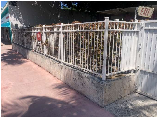
Figure 20. Detail of metal fence at Washington Avenue, September 2023.