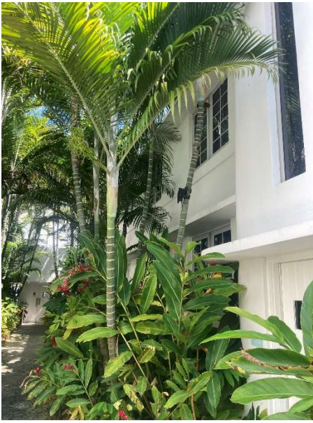
Figure 39. Detail of eyebrow, September 2023.