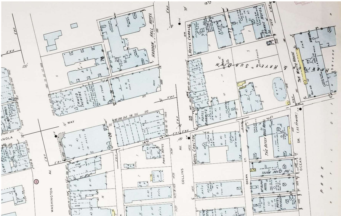
Figure 3. Sanborn map showing Haddon Hall Properties, 1947.

For details on the neighborhood development up to 1940, please refer to the Historic Resources Report for 1509 1515 Washington Avenue. The Campton Apartment Hotel was constructed in 1940, and the Haddon Hall Hotel was constructed in 1941. Both appear on the 1947 Sanborn map. (Figure 3) The swimming pool and cabana building do not appear on the 1947 or the 1951 Sanborn maps. The properties at 1500 Collins Avenue and 1453-55 Washington Avenue were originally two separate properties that were developed by separate individuals.