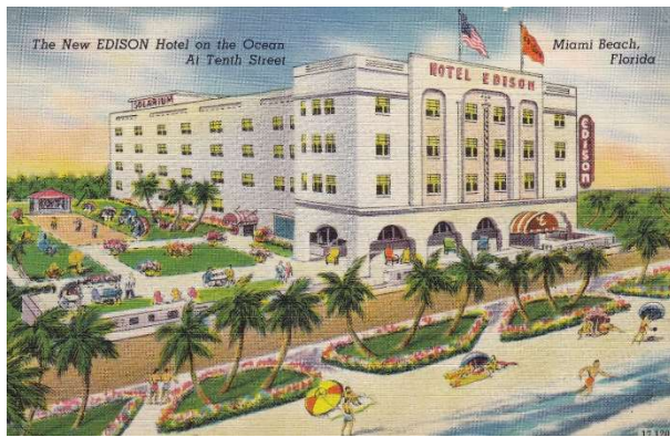
Figure 11. Postcard depicting the Edison Hotel, 1940s. (Miami Beach Visual Memoirs)