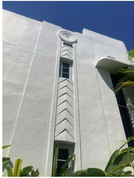
Figure 40. Detail of chevron motif and medallion, September 2023.