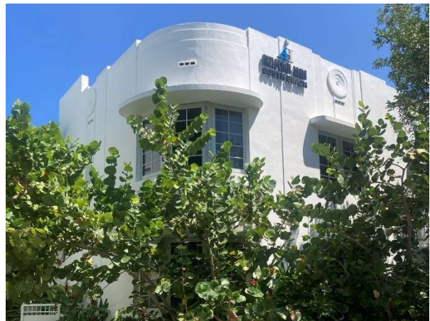
Figure 38. Detail of rounded corner and eyebrow, September 2023.