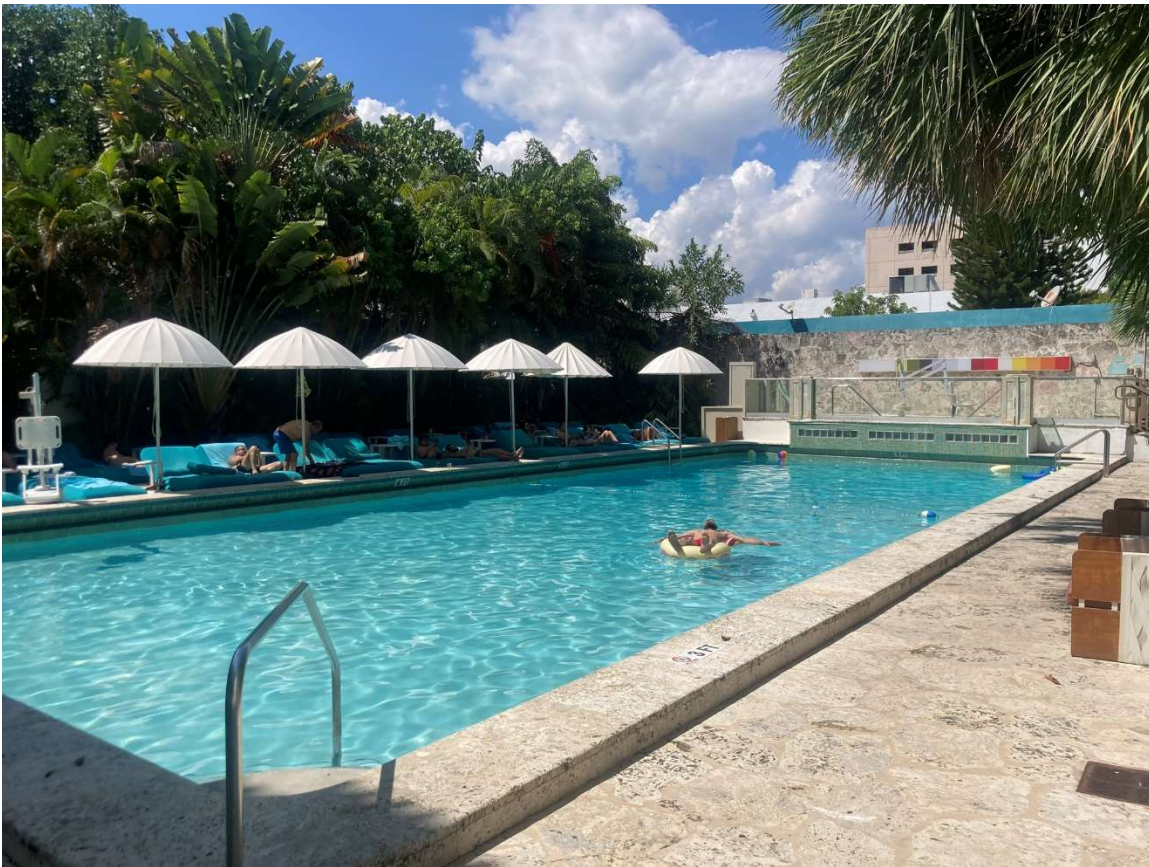
Figure 24. View of pool, looking northwest, September 2023.

The cabana is a 3-story building that is located to the south of the pool. It was constructed in 1975 with an addition in 2015 and does not contribute to the historic character of the site.