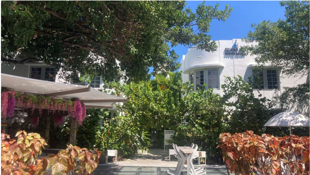
Figure 34. View of 1453-55 Washington Avenue, looking east, August 2023.

The former Campton Apartment Hotel, at 1453-55 Washington Avenue, is a two-story U shaped Streamline Moderne building. It is constructed of concrete block covered with stucco and has a spread footing foundation. (Figure 34) The wings of the “U” extend from a connecting block located at the east. (Figure 35) A narrow landscaped courtyard is situated between the two wings. (Figure 35)