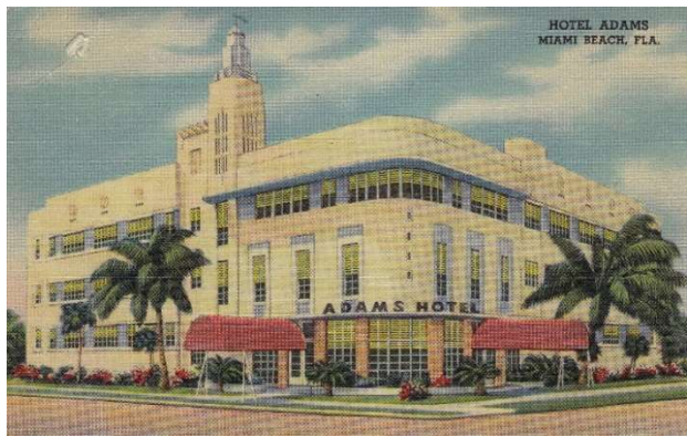
Figure 6. Postcard depicting the Adams Hotel, 1940s (Miami Beach Visual Memoirs)