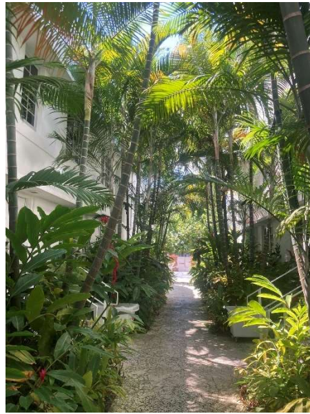
Figure 36. View of courtyard between wings, September 2023.

Significant features at the front (west) façade include rounded corners (Figure 37, Figure 38), eyebrows (Figure 39), chevron motifs and medallions (Figure 40) The other elevations are not readily visible due to the proximity of neighboring structures.