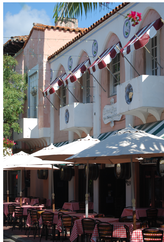
TOP: SANBORN MAP 1921 MIDDLE: CASA CASUARINA, 1930 LOWER: ESPANOLA WAY 2012