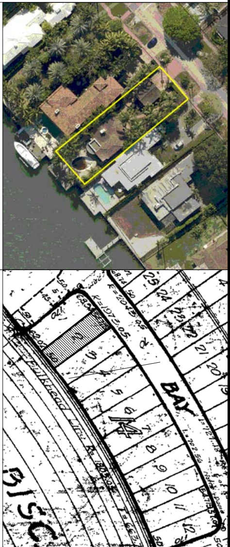
AERIAL MAP (NOT TO SCALE)