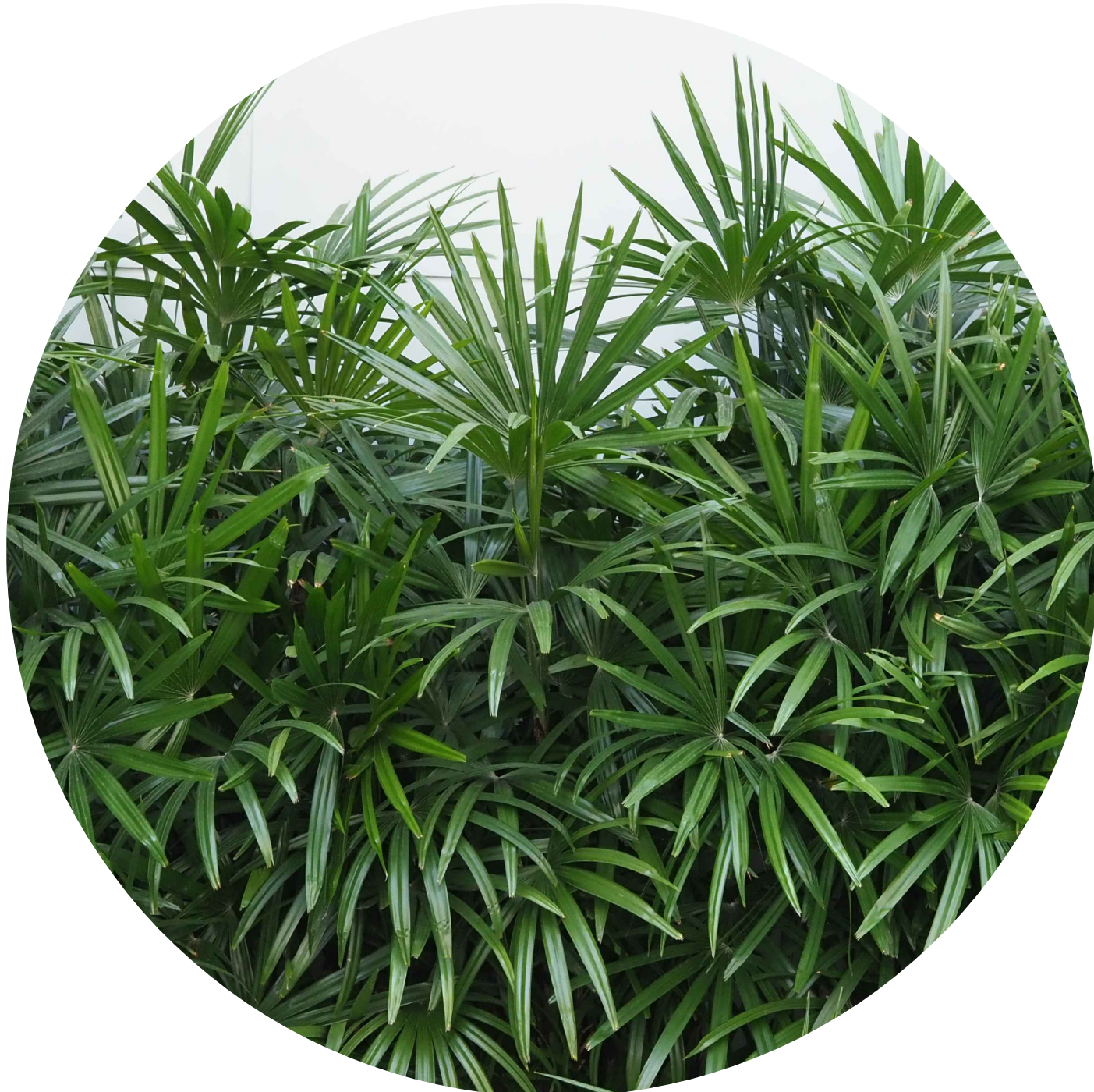
RX | LADY PALM Rhapis excelsa