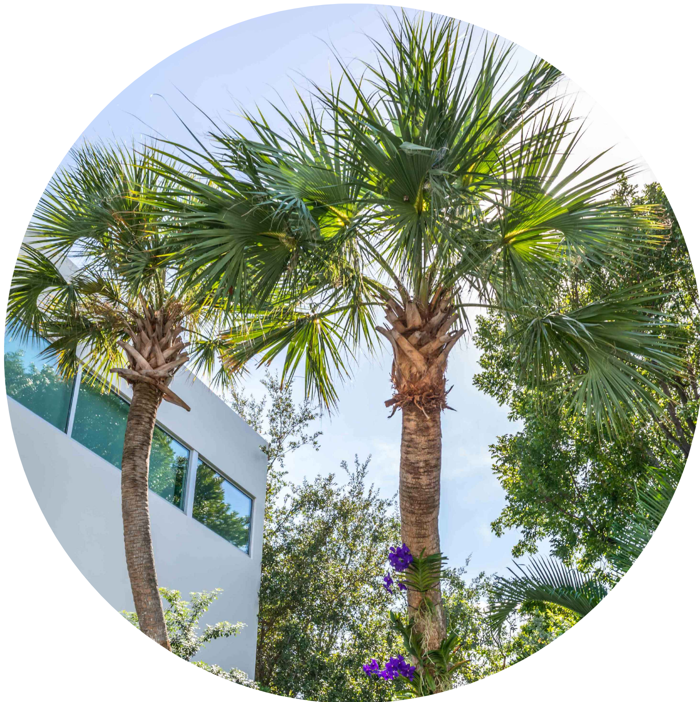
SP | SABAL PALMS Sabal palmetto