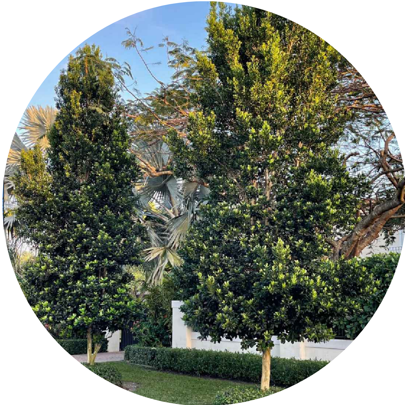
PR | BAY RUM TREE Pimenta racemosa