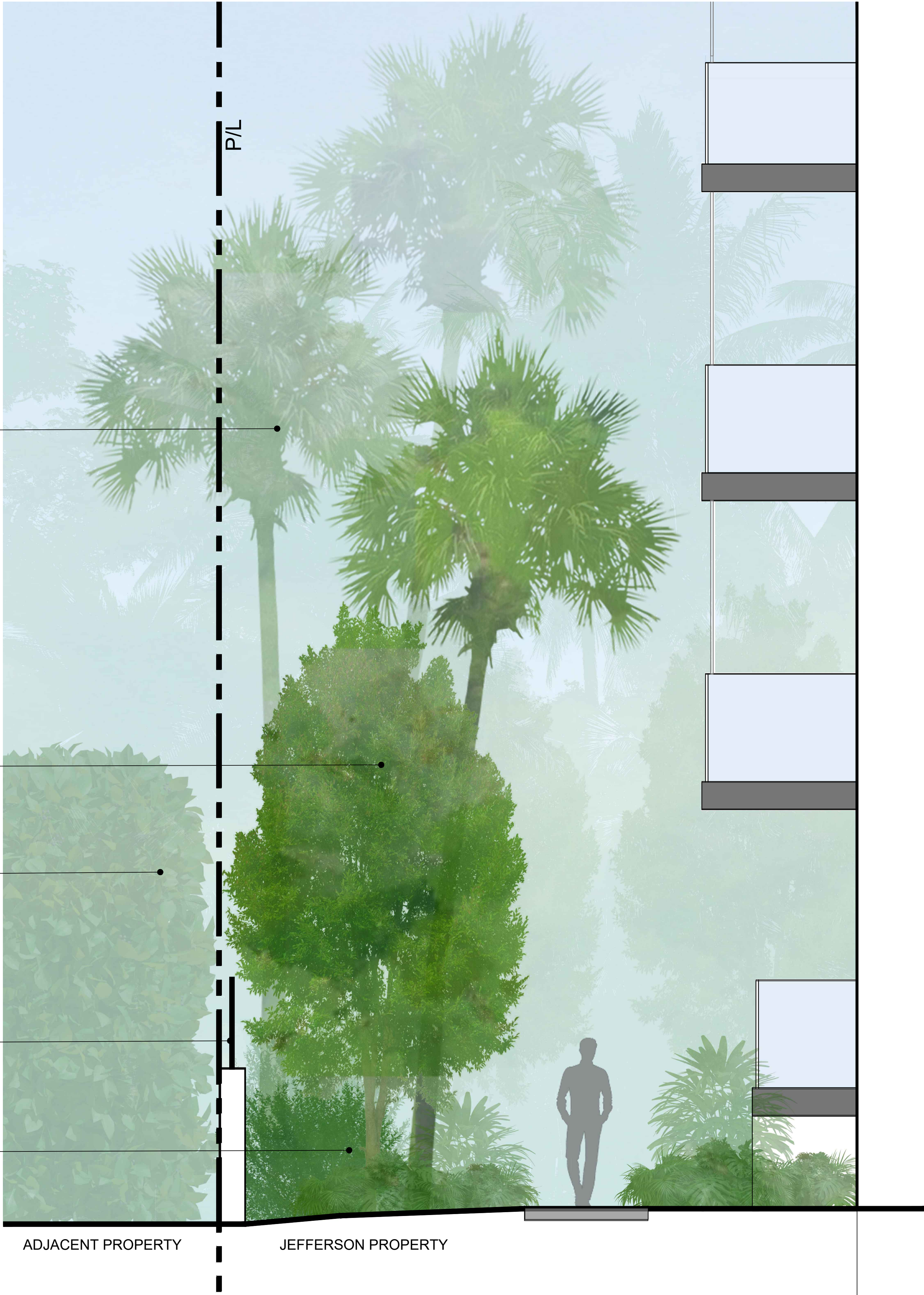
1 SCREENING SECTION ALONG NORTHERN PROPERTY LINE 1/2" = 1'-0"

LADY PALMS AND ADDITIONAL NATIVE + TROPICAL PLANTINGS CREATE PEDESTRIAN LEVEL BUFFER ALONG NORTHERN PROPERTY LINE