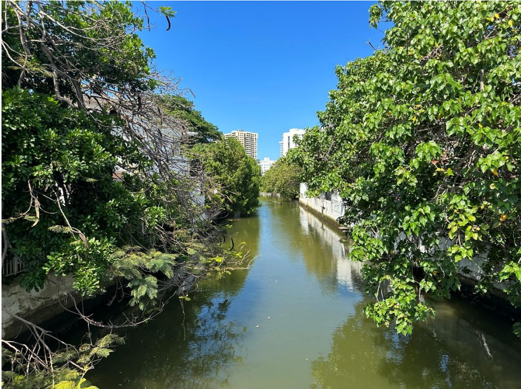
Collins Canal at 23 rd Street (looking east)