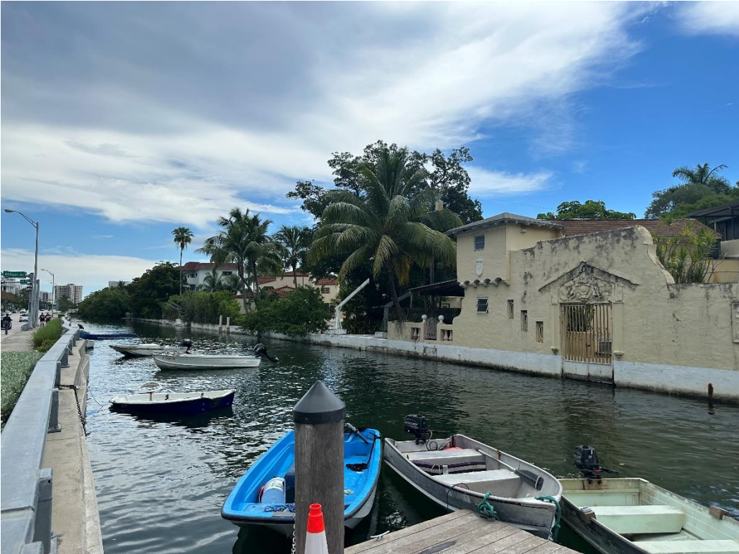
Collins Canal at Michigan Avenue (looking east)