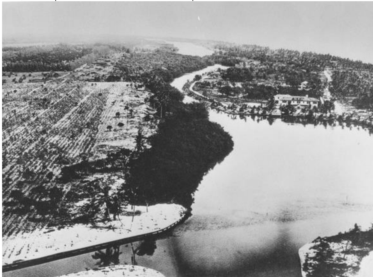
Photograph of the Collins' farm (left), Collins Canal (lower left) & Lake Pancoast (right), 1914

"At first it appeared [Collins'] efforts with avocados would parallel the failure of earlier coconut plantings. In the case of avocados, the wind sweeping in off the ocean across the narrow strip and Indian Creek and into his orchards was damaging the crop." 5 "To protect the young grove from the wind, Collins planted the twin lanes of Australian pine trees which later became Pinetree Drive." 6