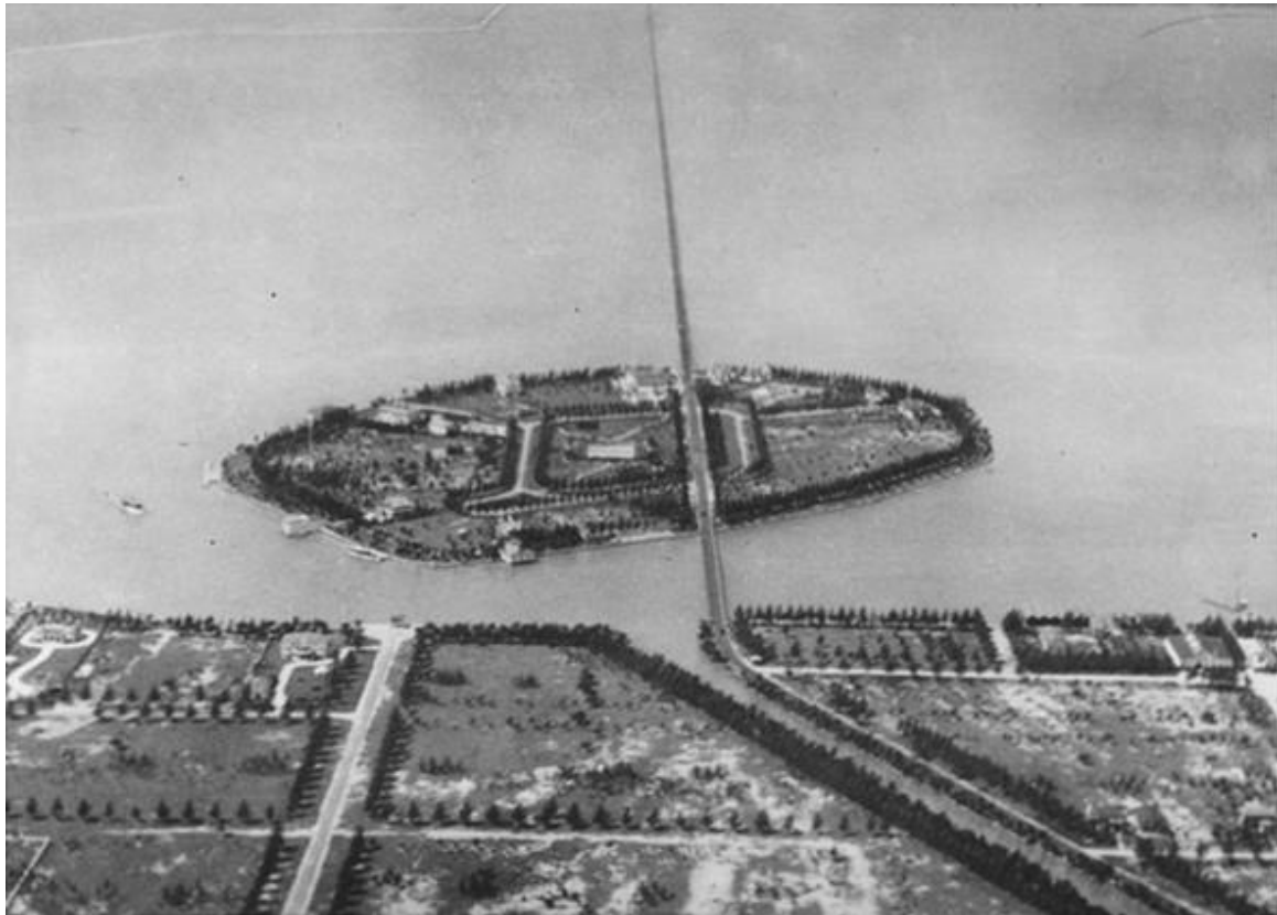
Photograph of Collins Canal, Belle Isle and the Collins Bridge, 1920