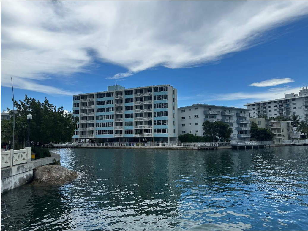
Collins Canal at Biscayne Bay (looking east)