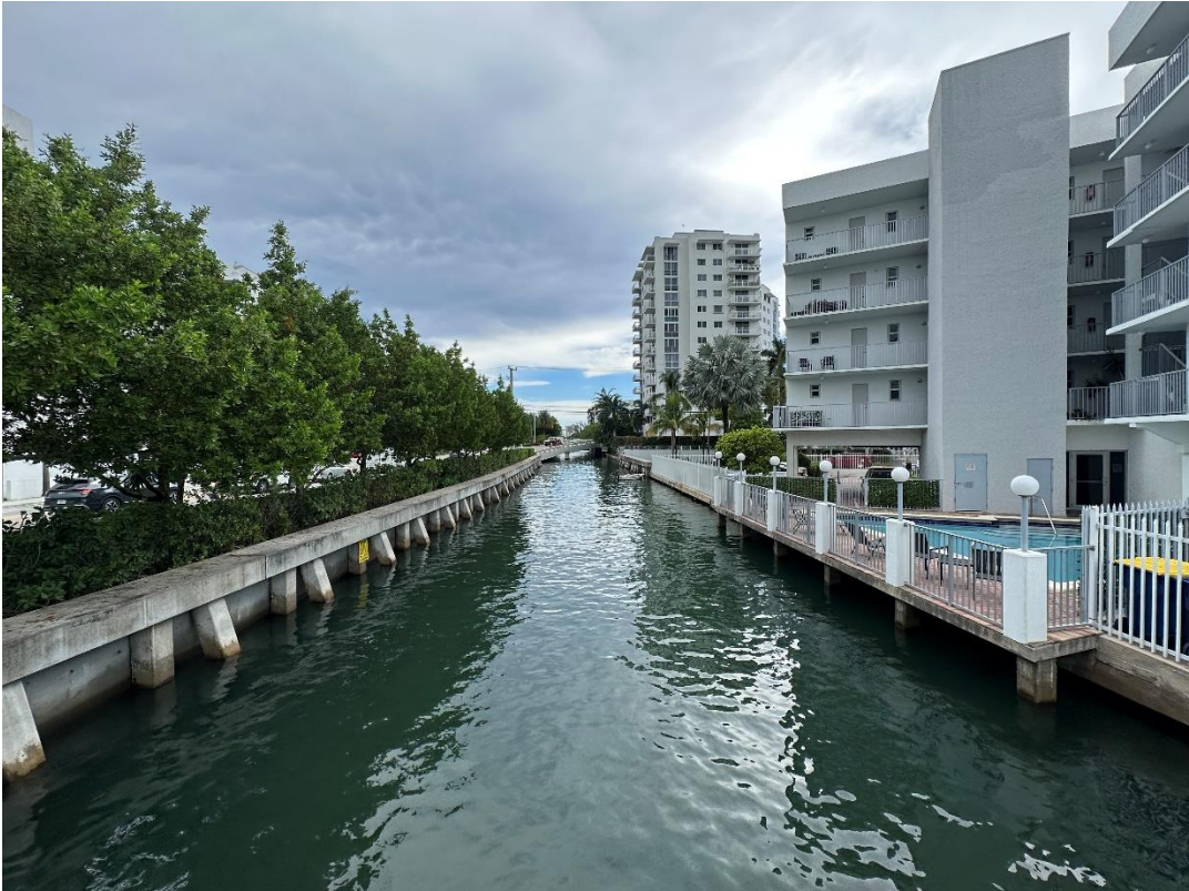
Collins Canal at Lincoln Court Pedestrian Bridge (looking east)