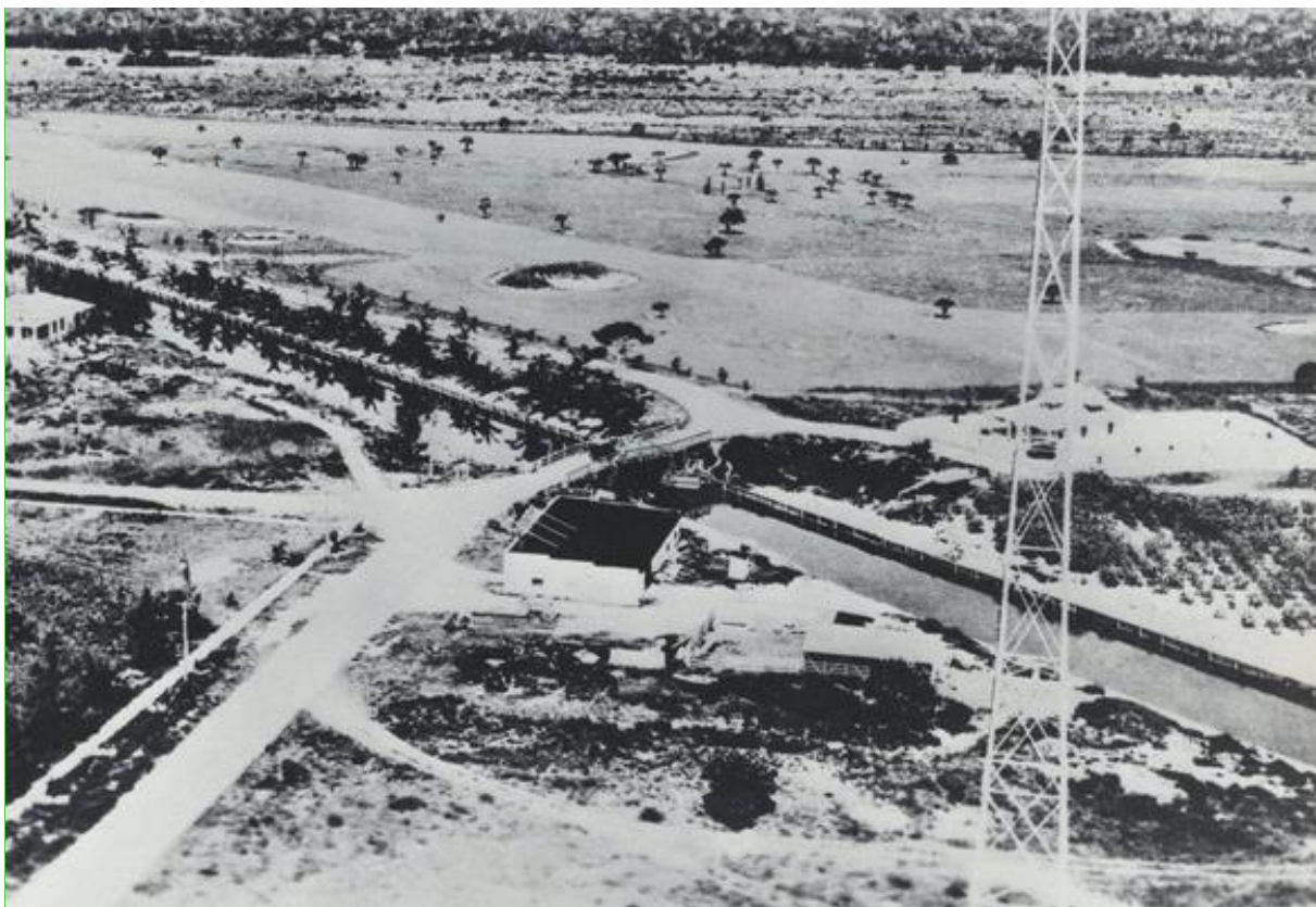
Aerial photograph of Collins Canal at 23 rd Street, 1918