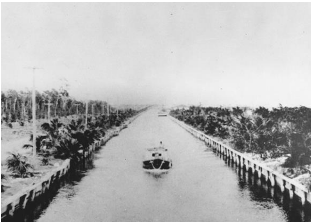
Photograph of Collins Canal looking east from Alton Road, 1916