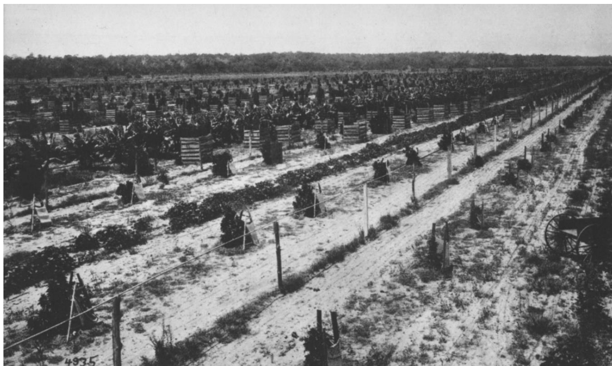
Photograph of the Collins farm, ca. 1908

In 1896, Collins traveled to Miami to investigate the failed coconut planting project. After examining the Field and Osborn property, he still saw agricultural promise in the coastal tract. Collins bought Osborn's share of the property and became partners with Field in 1907. They established a farm west of Indian Creek roughly between present day 30 th Street and 46 th Street. 3 It was located 1,000 feet west of the ocean and was a mile long and about 700 feet wide. The land clearing for the farm eventually covered 160 acres.