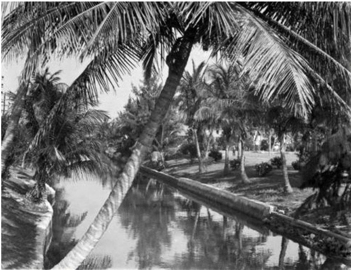
Photograph view of palms on Collins Canal, 1931