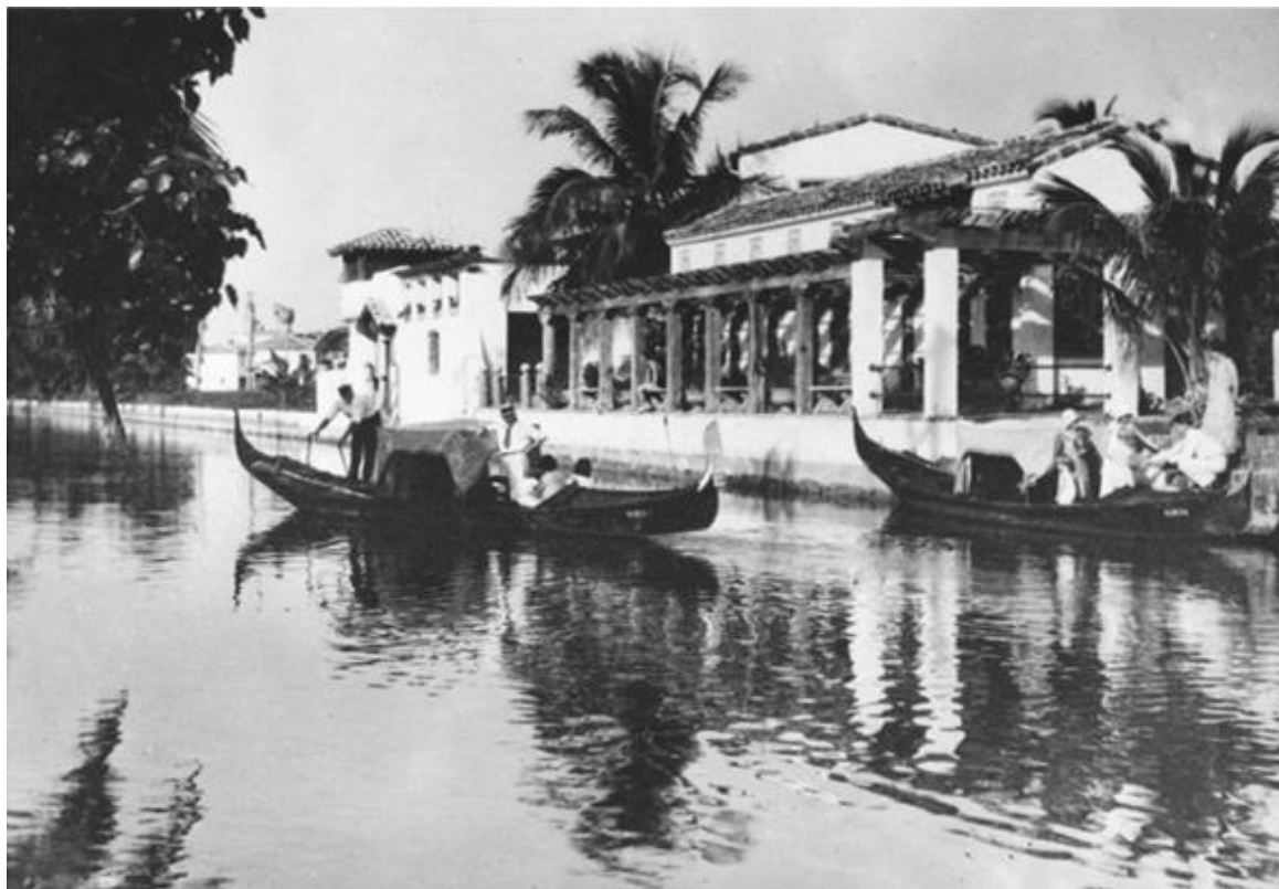
Photograph of Collins Canal with the Hubbell residence (1818 Michigan Avenue), 1930