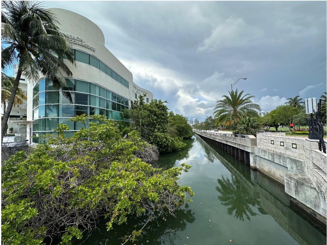
Collins Canal at Meridian Avenue (looking west)