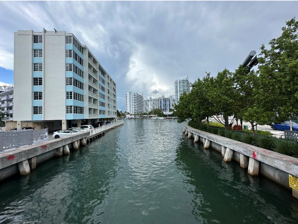
Collins Canal at Lincoln Court Pedestrian Bridge (looking west)