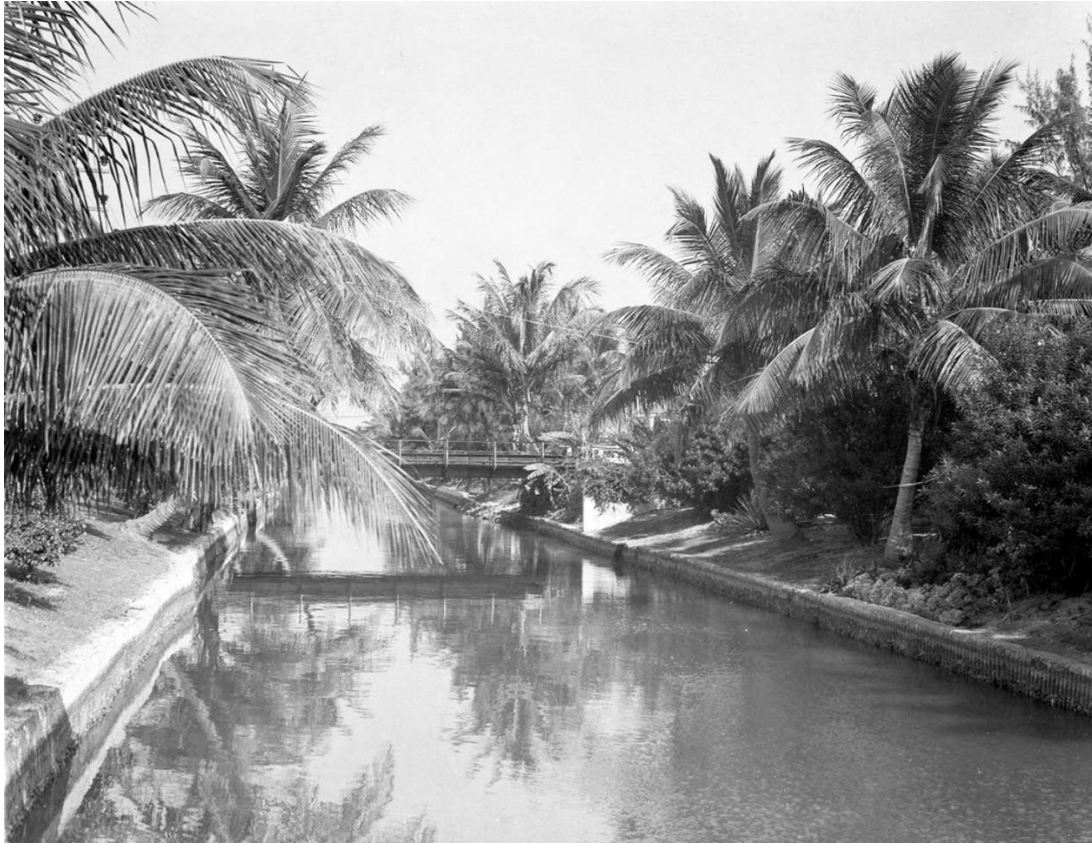
Close up of Collins Canal, 1931