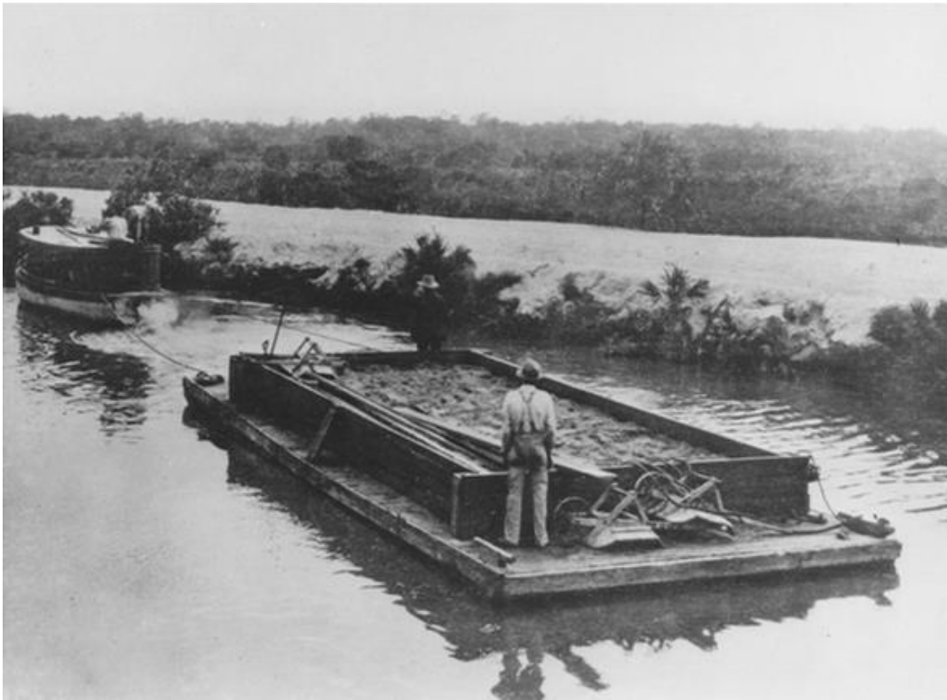
Photograph of Collins Canal at Meridian Avenue, 1913