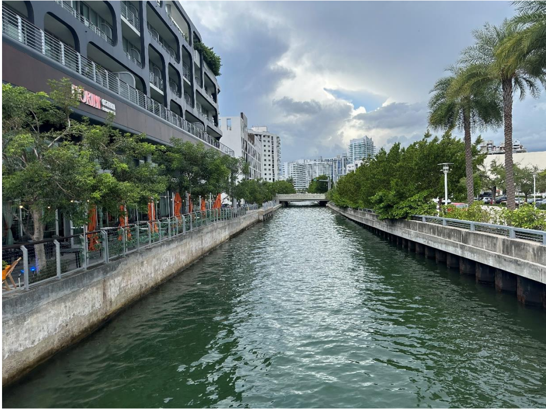
Collins Canal at Alton Road (looking west)