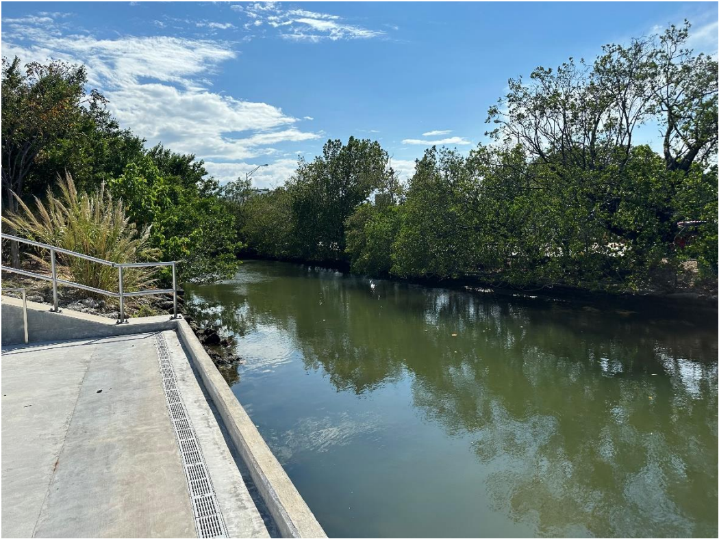
Collins Canal at the Carl Fisher Clubhouse (looking west)