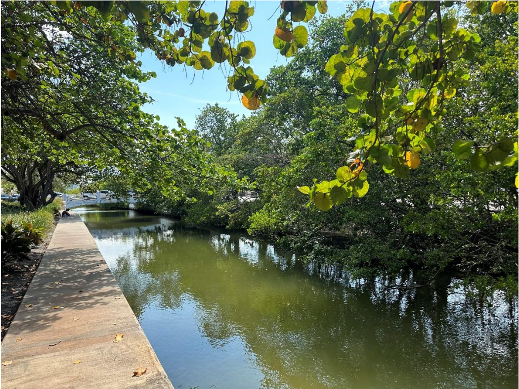
Collins Canal at Washington Avenue (looking west)