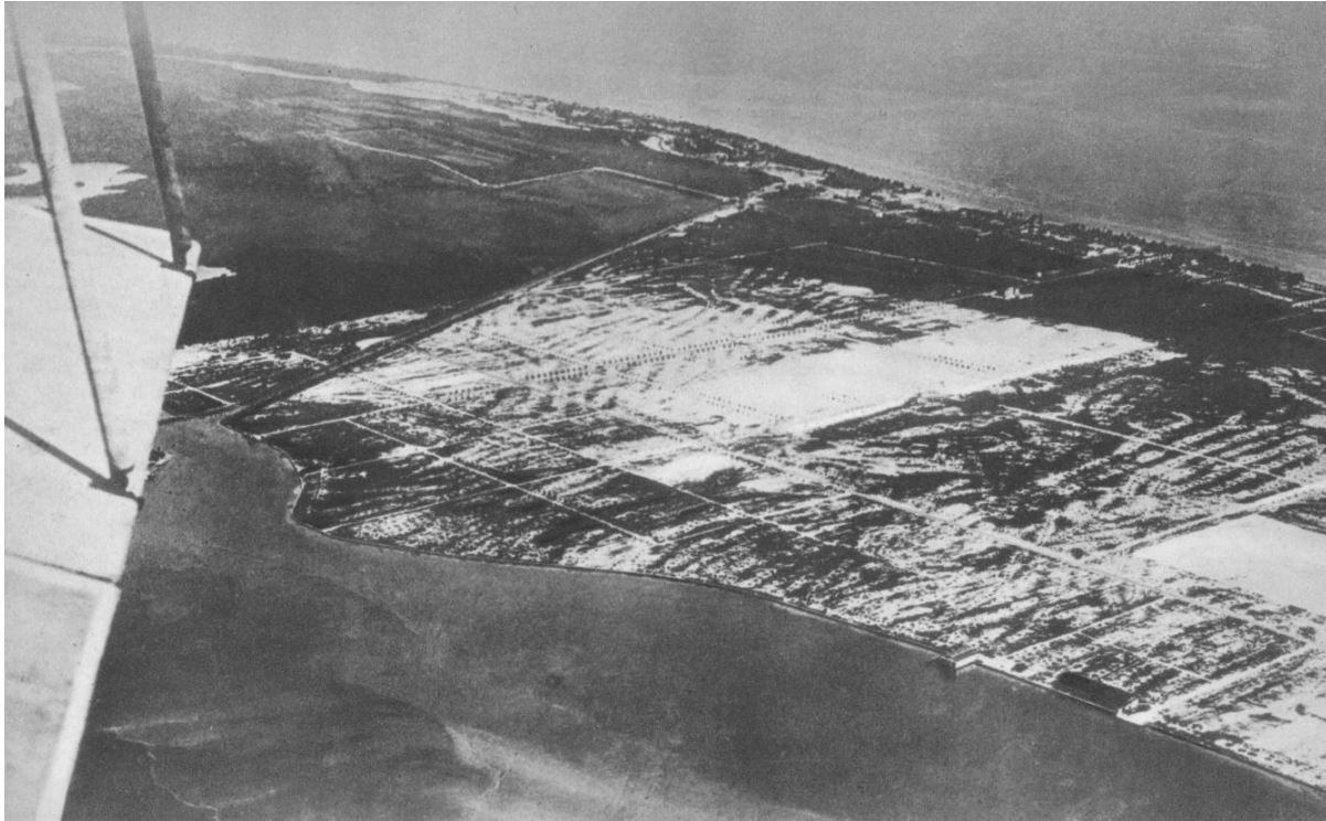
Aerial photograph of Miami Beach and Collins Canal, 1917