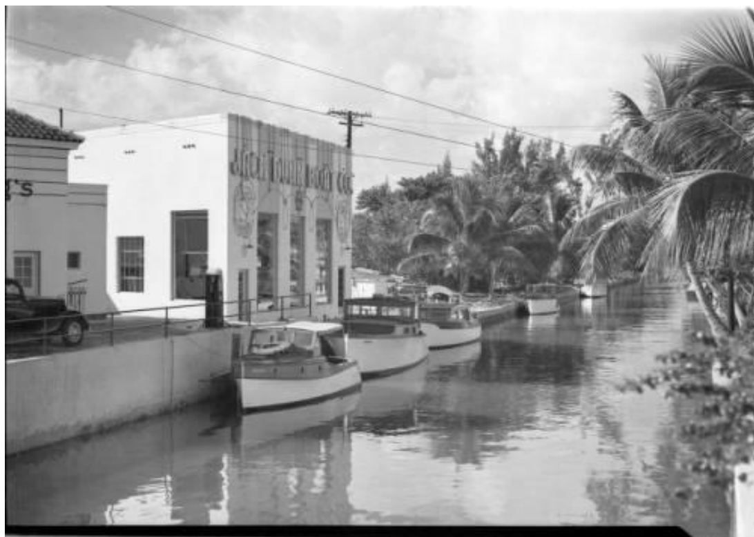
Photograph of Jack Dunn Boat Company (1740 Alton Road) and Collins Canal, 1938