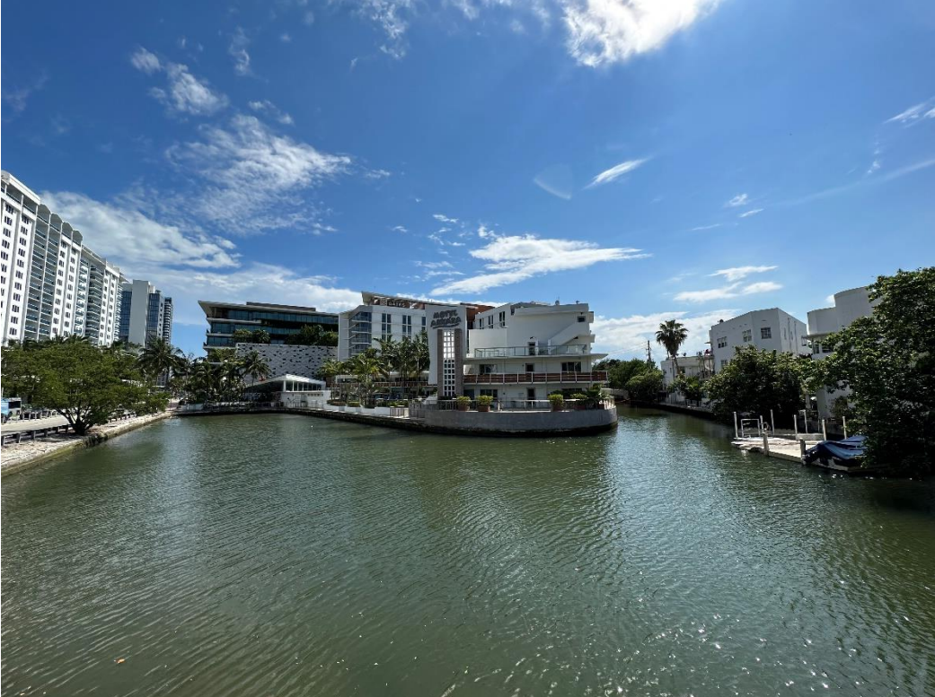
Collins Canal (right) at Lake Pancoast Pedestrian Bridge (looking east)