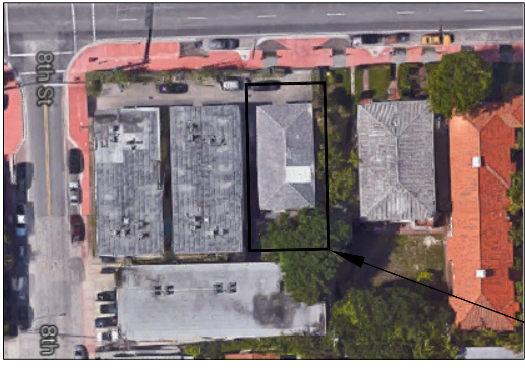
LOCATION MAP SCALE: SCALE:N.T.S.

ALL DRAWING AND WRITTEN MATERIAL CONTAINED HEREIN IS THE PROPERTY OF CASTELLANOS DESIGN STUDIO. IT IS NOT TO BE REPRODUCED, COPIED, REPRODUCED, OR USED WITHOUT THE WRITTEN CONSENT OF CASTELLANOS DESIGN STUDIO. LEGAL NOTICE: THE CONTRACTOR SHALL BE RESPONSIBLE FOR OBTAINING ALL NECESSARY PERMITS AND APPROVALS FROM THE CITY OF MIAMI BEACH. THE CONTRACTOR SHALL BE RESPONSIBLE FOR OBTAINING ALL NECESSARY PERMITS AND APPROVALS FROM THE CITY OF MIAMI BEACH. THE CONTRACTOR SHALL BE RESPONSIBLE FOR OBTAINING ALL NECESSARY PERMITS AND APPROVALS FROM THE CITY OF MIAMI BEACH. THE CONTRACTOR SHALL BE RESPONSIBLE FOR OBTAINING ALL NECESSARY PERMITS AND APPROVALS FROM THE CITY OF MIAMI BEACH.