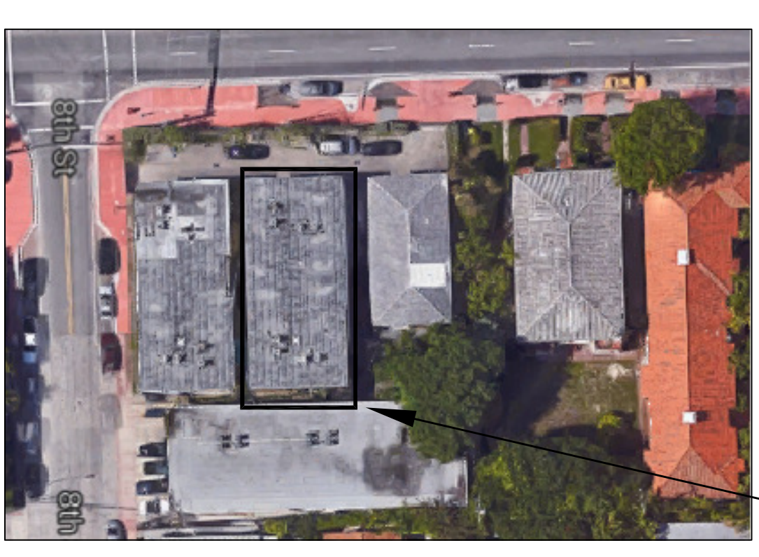
LOCATION MAP SCALE: SCALE:N/T/S