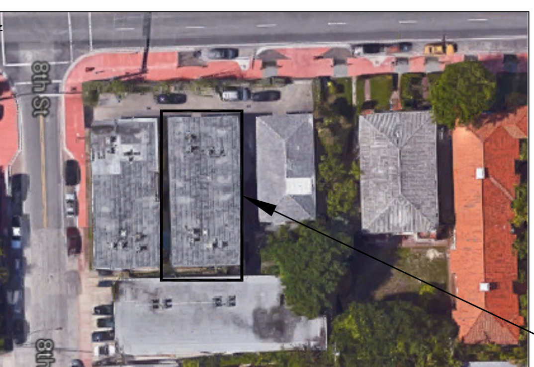
LOCATION MAP SCALE: SCALE:N.T.S.

ALL DRAWING AND WRITTEN MATERIAL CONTAINED HEREIN IS THE PROPERTY OF CASTELLANOS DESIGN STUDIO. IT IS THE PROPERTY OF CASTELLANOS DESIGN STUDIO. IT IS NOT TO BE REPRODUCED, COPIED, OR TRANSMITTED IN ANY FORM OR BY ANY MEANS, WITHOUT THE WRITTEN PERMISSION OF CASTELLANOS DESIGN STUDIO. THE GENERAL CONTRACTOR IS TO FURNISH AND INSTALL ALL MATERIALS AND EQUIPMENT AND TO BE RESPONSIBLE FOR THE PROTECTION OF ALL EXISTING UTILITIES AND STRUCTURES. THE CONTRACTOR SHALL BE RESPONSIBLE FOR OBTAINING ALL NECESSARY PERMITS AND APPROVALS FROM THE APPLICABLE AGENCIES. ANY CHANGES TO THE DRAWINGS OR SPECIFICATIONS SHALL BE MADE IN WRITING AND APPROVED BY CASTELLANOS DESIGN STUDIO. NO PART OF THIS REPORT IS TO BE USED FOR ANY OTHER PROJECT WITHOUT THE WRITTEN PERMISSION OF CASTELLANOS DESIGN STUDIO. ANY REVISIONS TO THIS REPORT SHALL BE INDICATED IN THE REVISIONS SECTION.