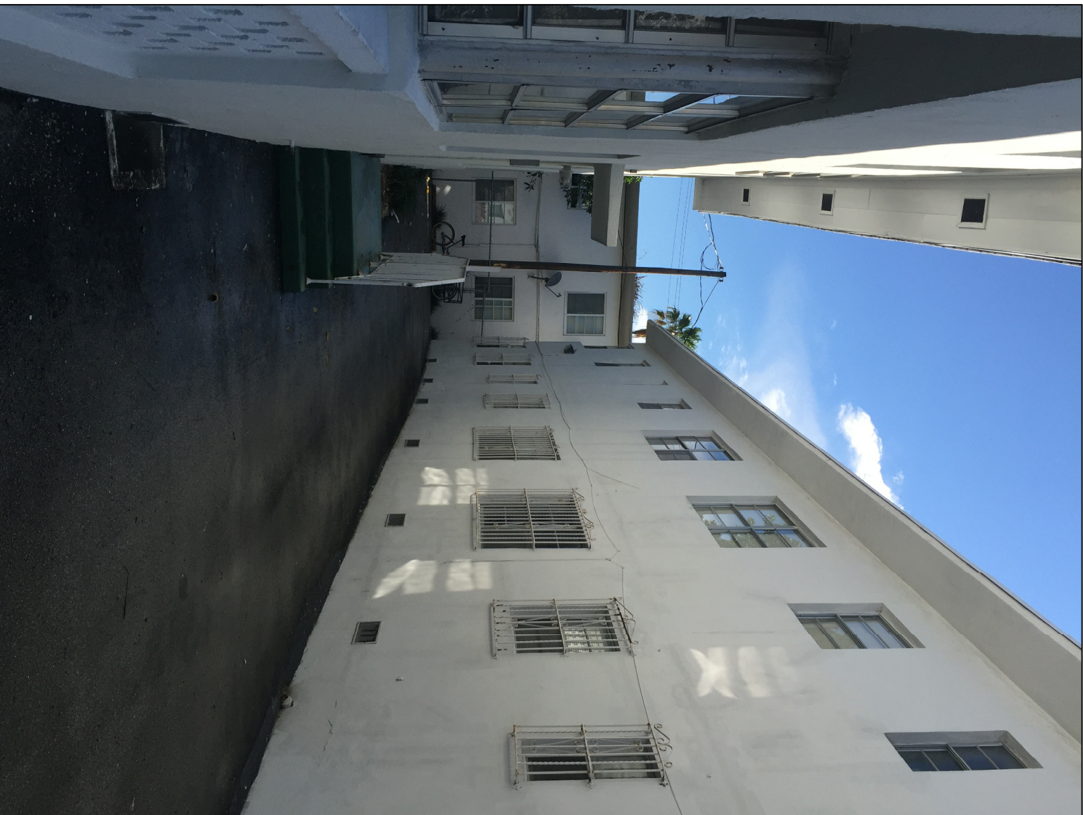
4 EXISTING NORTH ELEVATION SCALE : N.T.S.