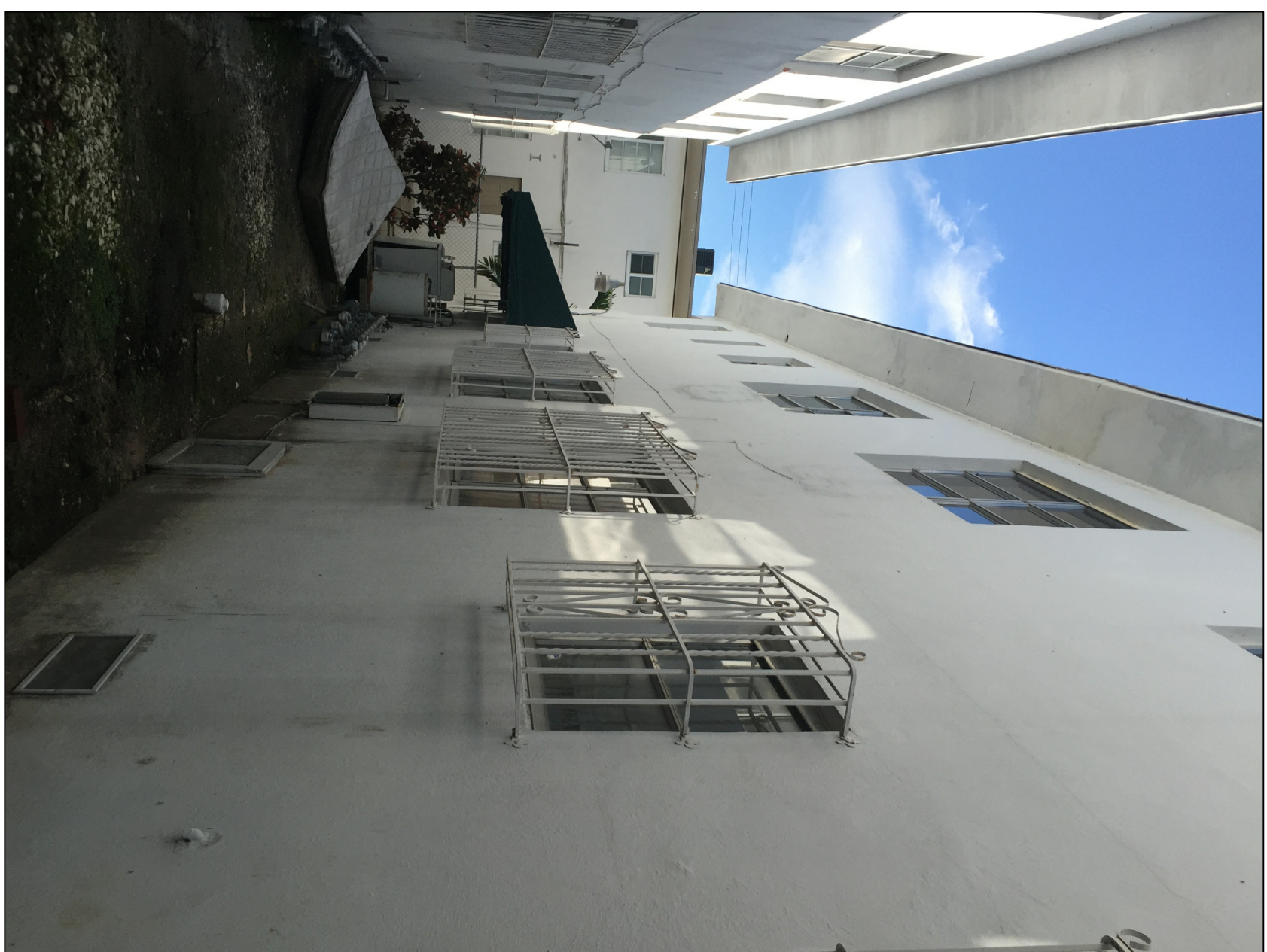
2 EXISTING SOUTH ELEVATION SCALE : N.T.S.