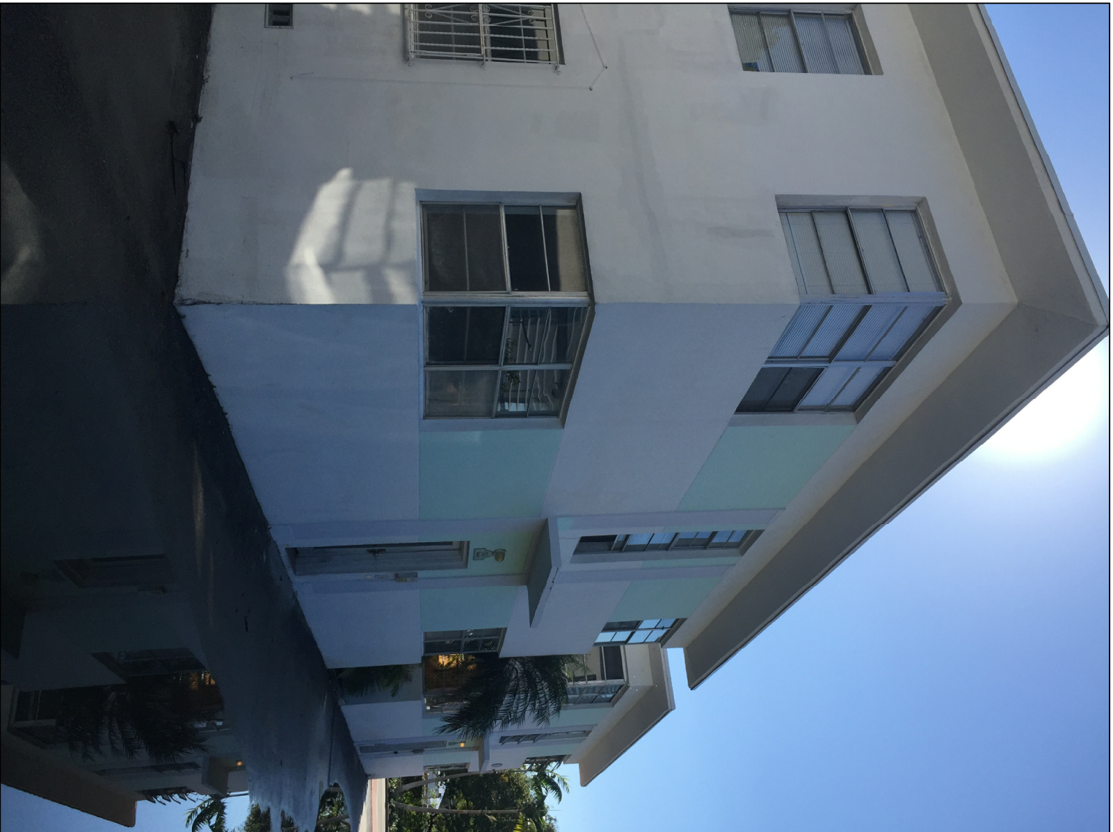
1 EXISTING WEST ELEVATION SCALE : N.T.S.