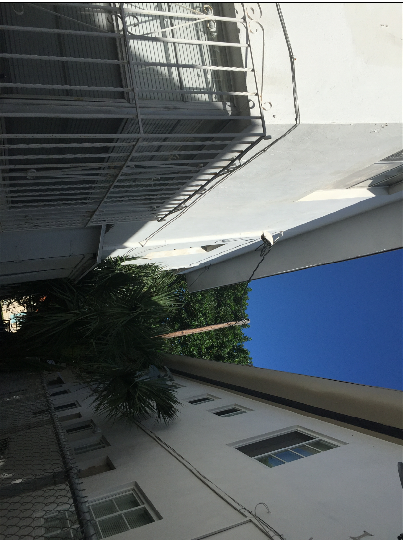
3 EXISTING EAST ELEVATION SCALE : N.T.S.