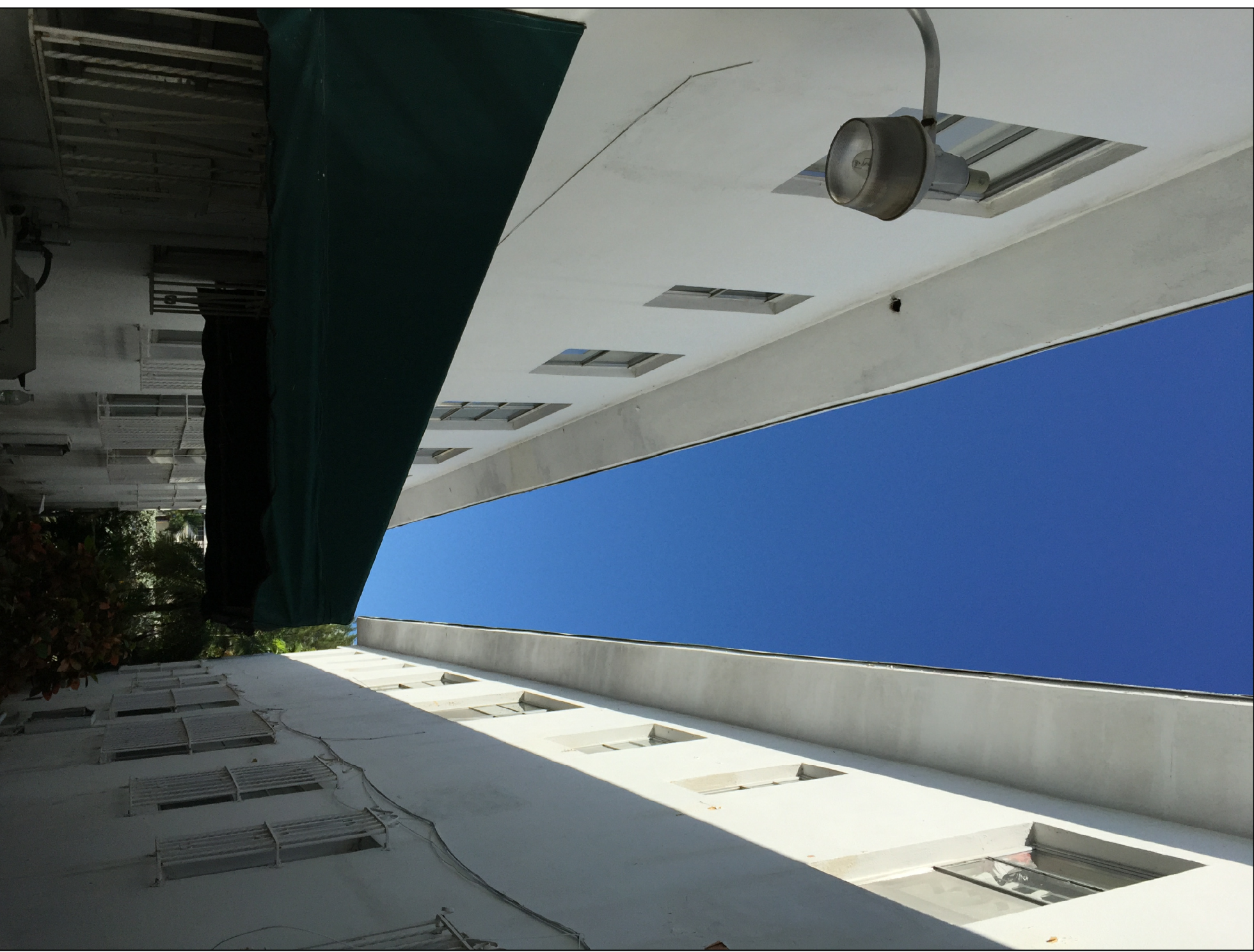
4 EXISTING NORTH ELEVATION SCALE: N.T.S.