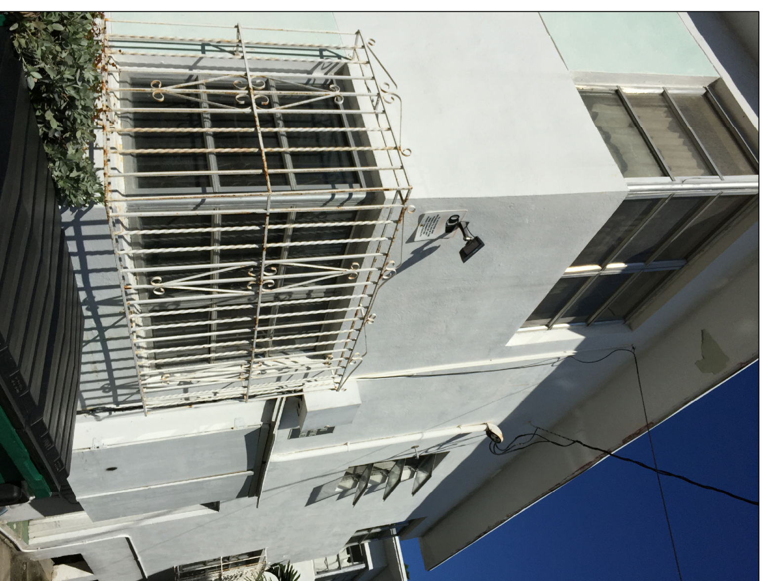
3 EXISTING EAST ELEVATION SCALE: N.T.S.