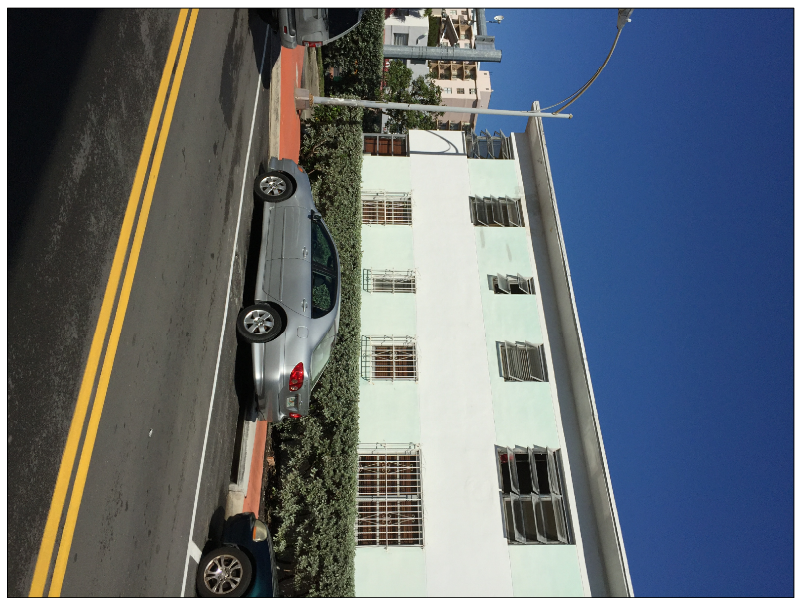
2 EXISTING SOUTH ELEVATION SCALE: N.T.S.