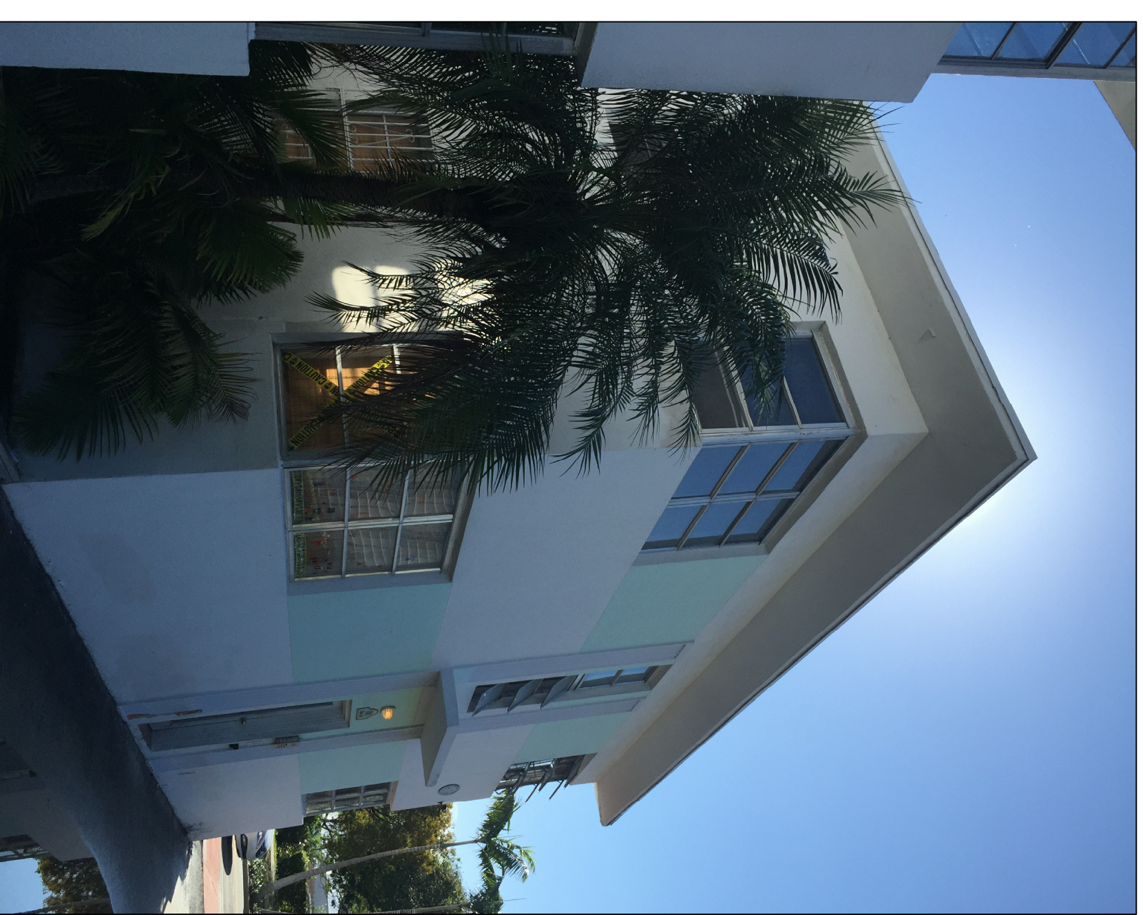
1 EXISTING WEST ELEVATION SCALE: N.T.S.