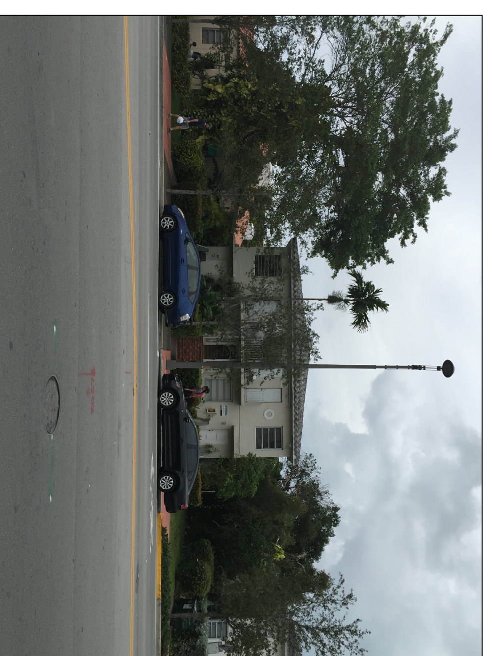
FACING EAST AT 8TH STREET