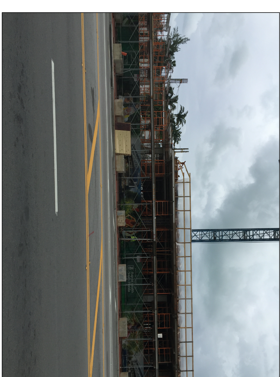
FACING EAST AT 7TH STREET