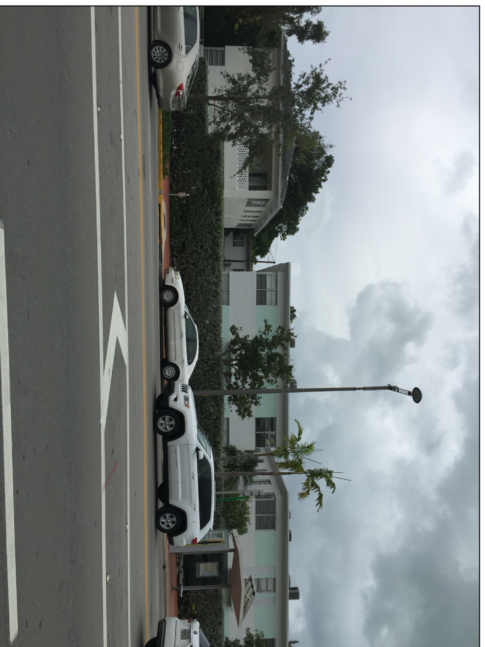
FACING EAST AT 8TH STREET