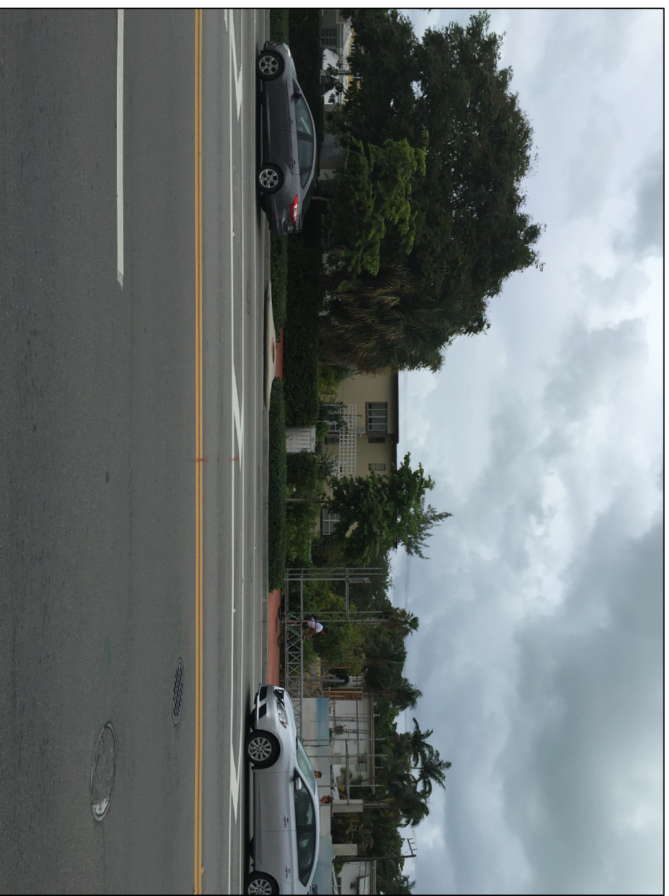
FACING EAST AT 7TH STREET