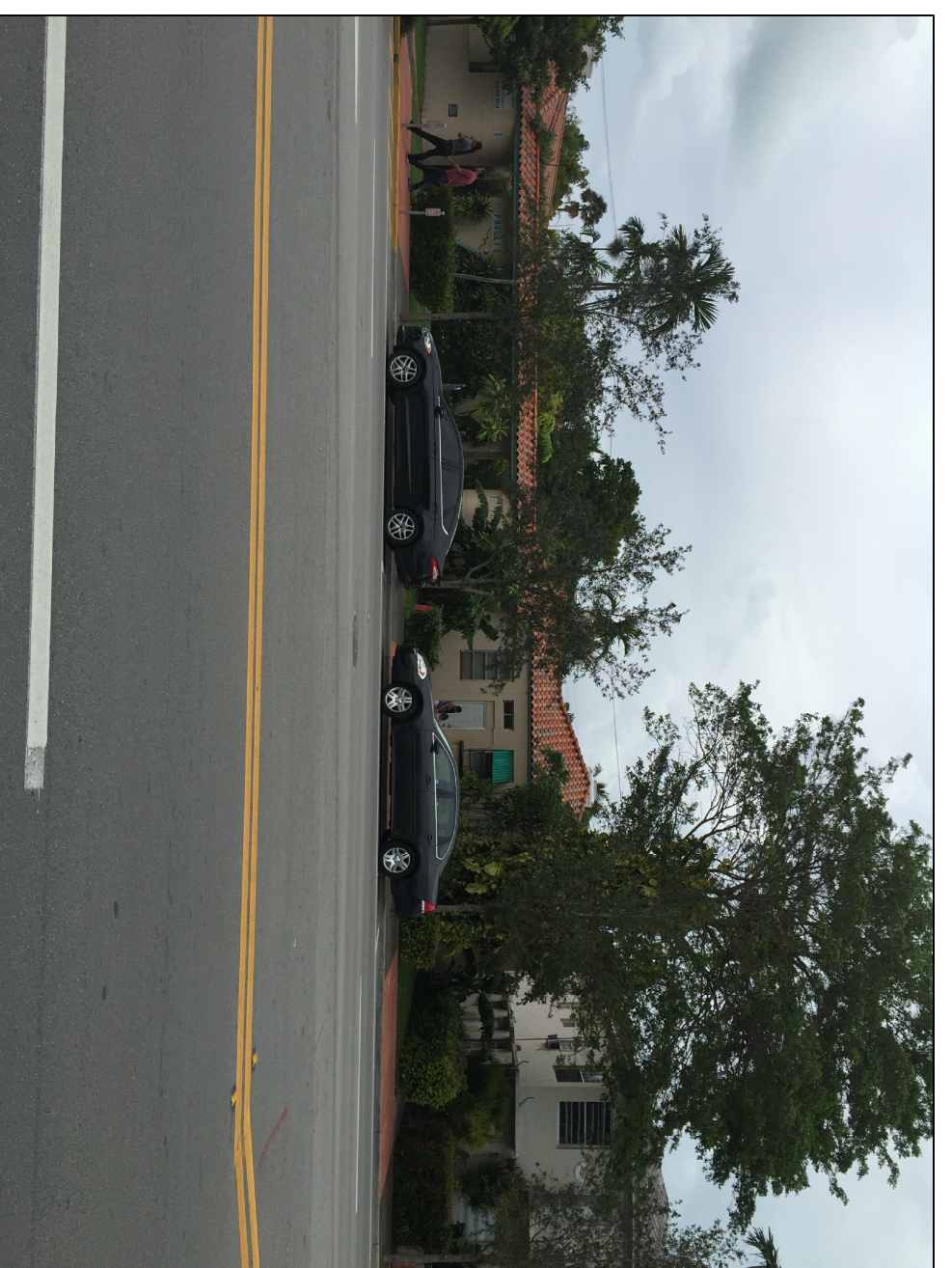
FACING EAST AT 8TH STREET