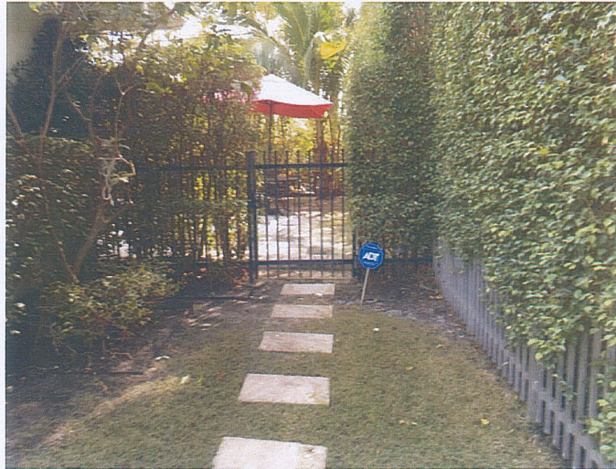
VIEWS FROM BETWEEN BLDG & HEDGE