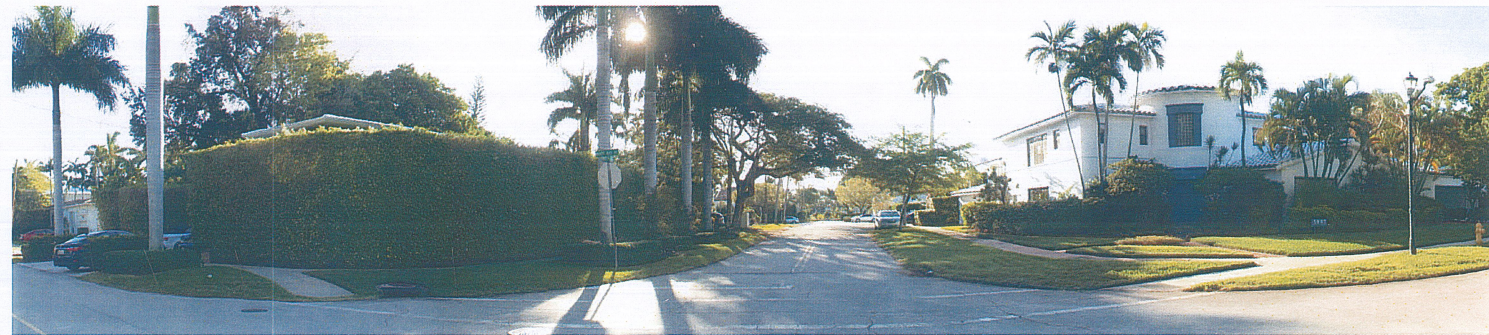
PANORAMIC VIEW TO EAST @ 60 TH STREET