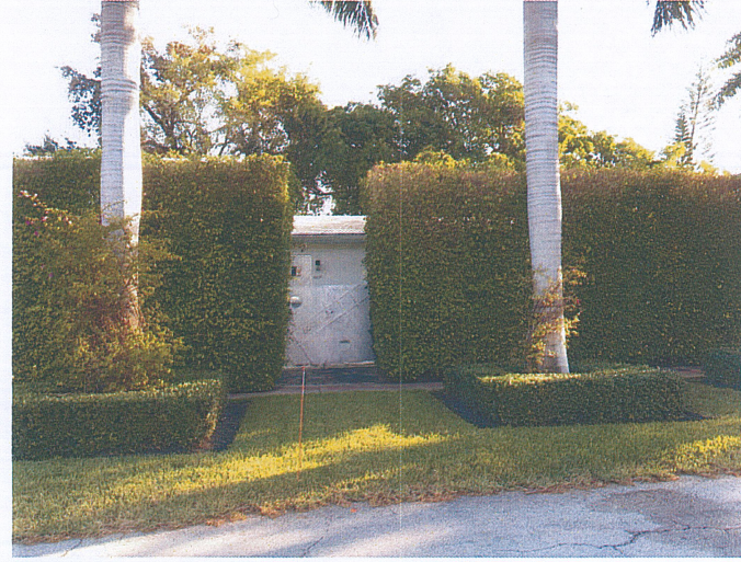
VIEW TO EAST @ ENTRY