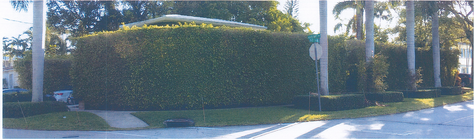
VIEW OF SW CORNER OF SUBJECT PROPERTY