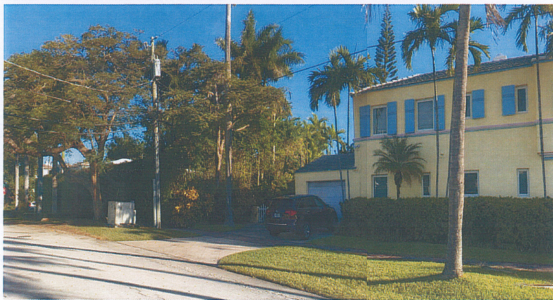
VIEW TO WEST @ 60 TH STREET