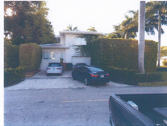
VIEW OF WEST ELEVATION