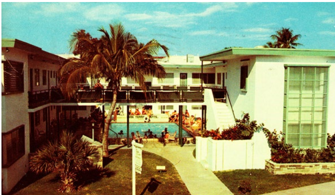
Postcard of the Park Terrace Apartments, postmarked November 2, 1957

The applicant is currently proposing a redevelopment project consisting of a 5-story addition and rooftop pool deck. In order to construct the new ground level addition, the applicant is proposing to demolish the entire rear portion of the existing building, as well as approximately 75% of the east wing and approximately 60% of the west wing. Within the two portions of the building proposed to be retained (fronting 19 th Street), the applicant is proposing to remove the 2 nd level floor plate creating double-height spaces for the hotel lobby and gym. While the amount of demolition is substantial, staff would note that the portions of the building to be retained contain the majority of the existing architectural features and will be substantially restored or reconstructed consistent with historical documentation and the Board's previous approval including the reconstruction of the elevated pedestrian walkway and the reintroduction of the original screening elements at the corners of the wings. Further, staff is supportive of the design of the new 5-story addition which successfully recalls the garden style courtyard plan of the existing building.