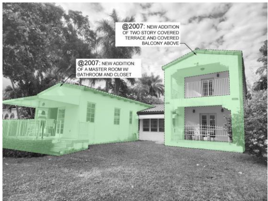
EXHIBIT (G): CURRENT PHOTOS: REAR VIEW TO THE MAIN HOUSE