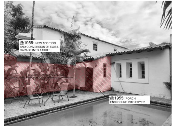
EXHIBIT (C): CURRENT PHOTOS: INTERIOR PATIO VIEW TO THE MAIN HOUSE