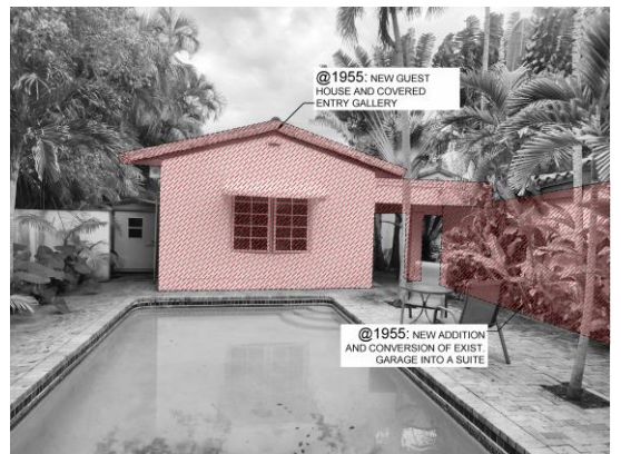
EXHIBIT (D): CURRENT PHOTOS: INTERIOR PATIO VIEW