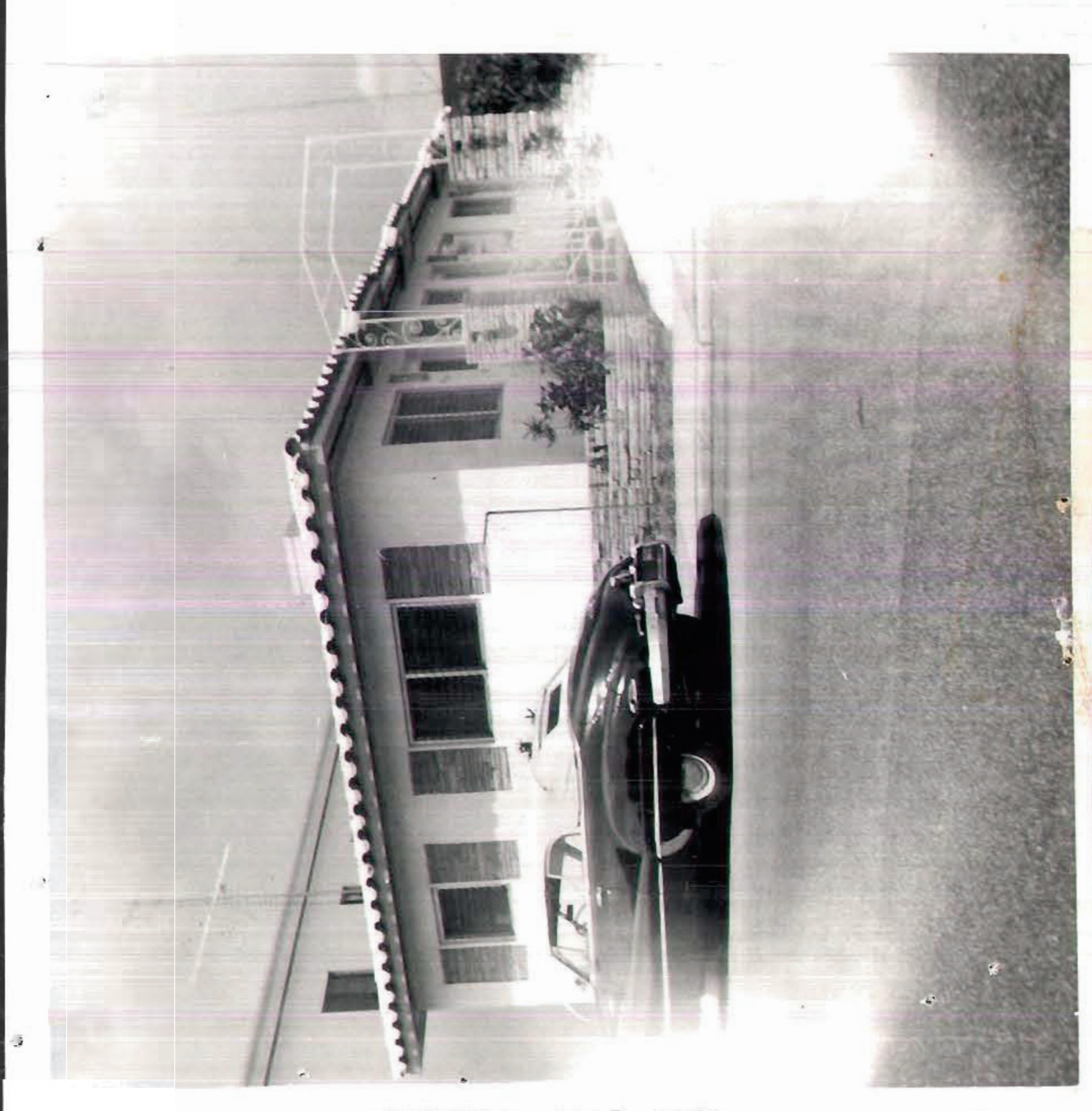
FLORIDA MAR. 1955