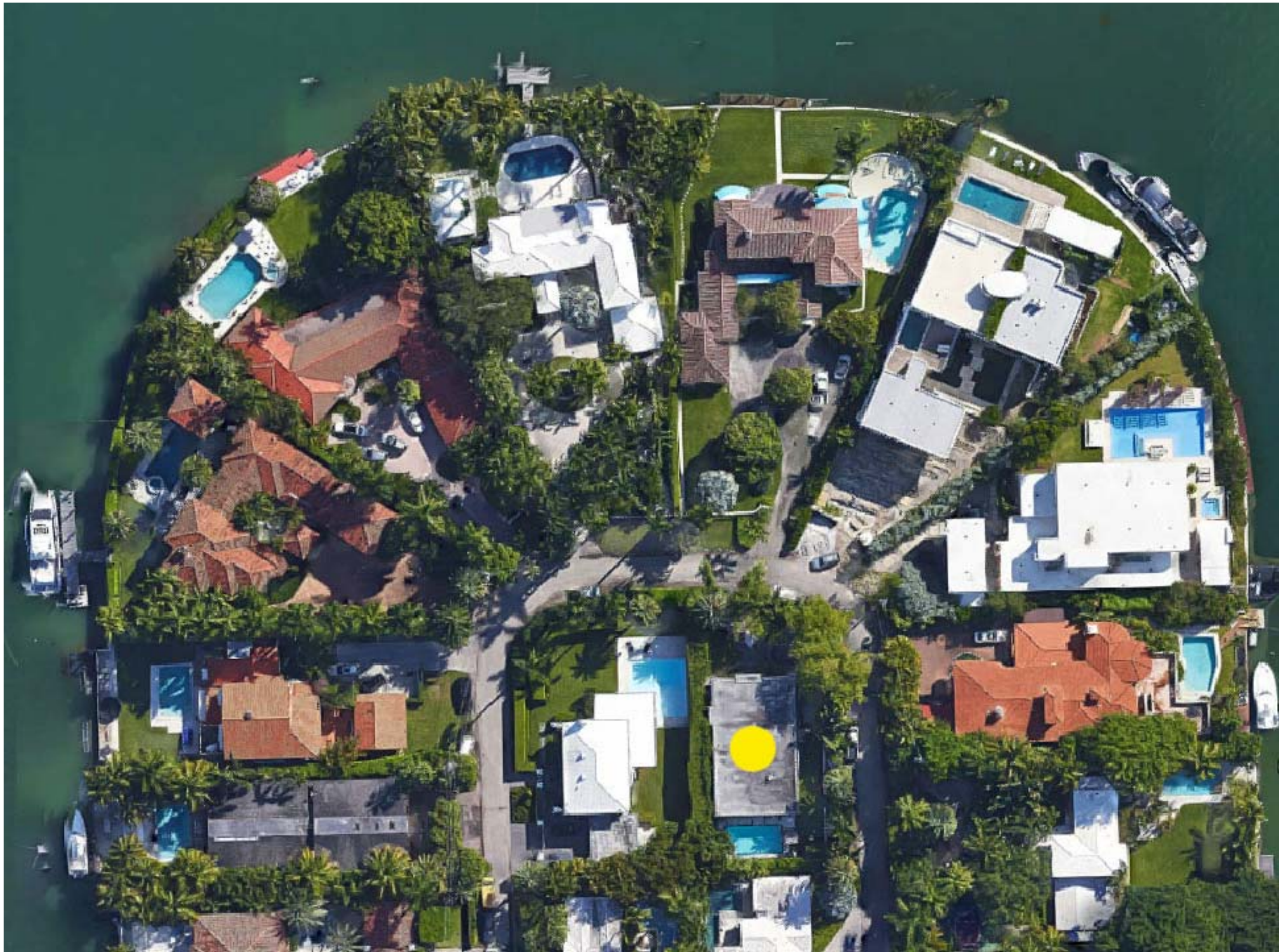
3 KEY PLAN G1.0 | G1.1 EXISTING SITE N.T.S.