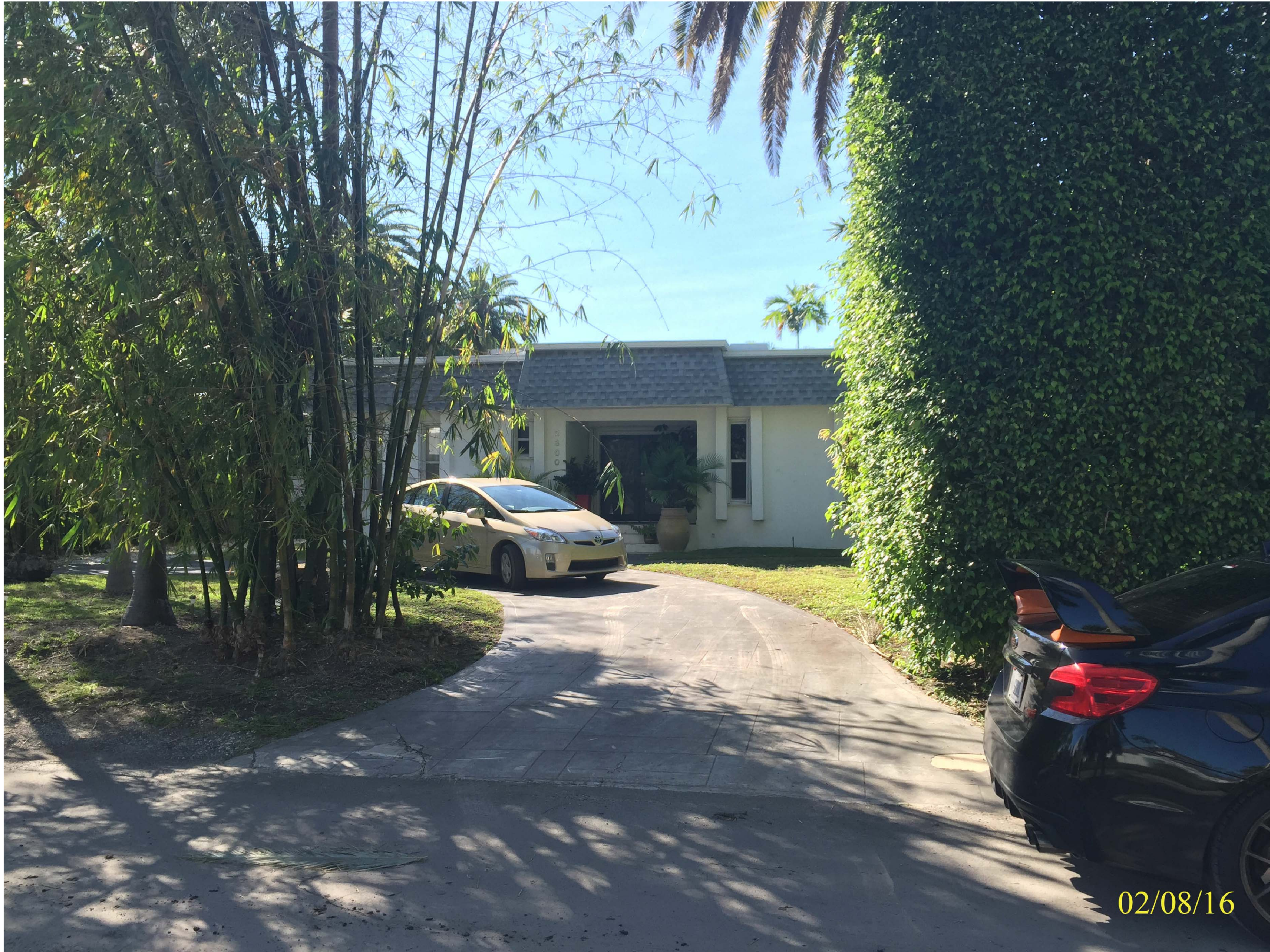
2 2300 LAKE AVE. G1.0 | G1.1 EXISTING SITE N.T.S.