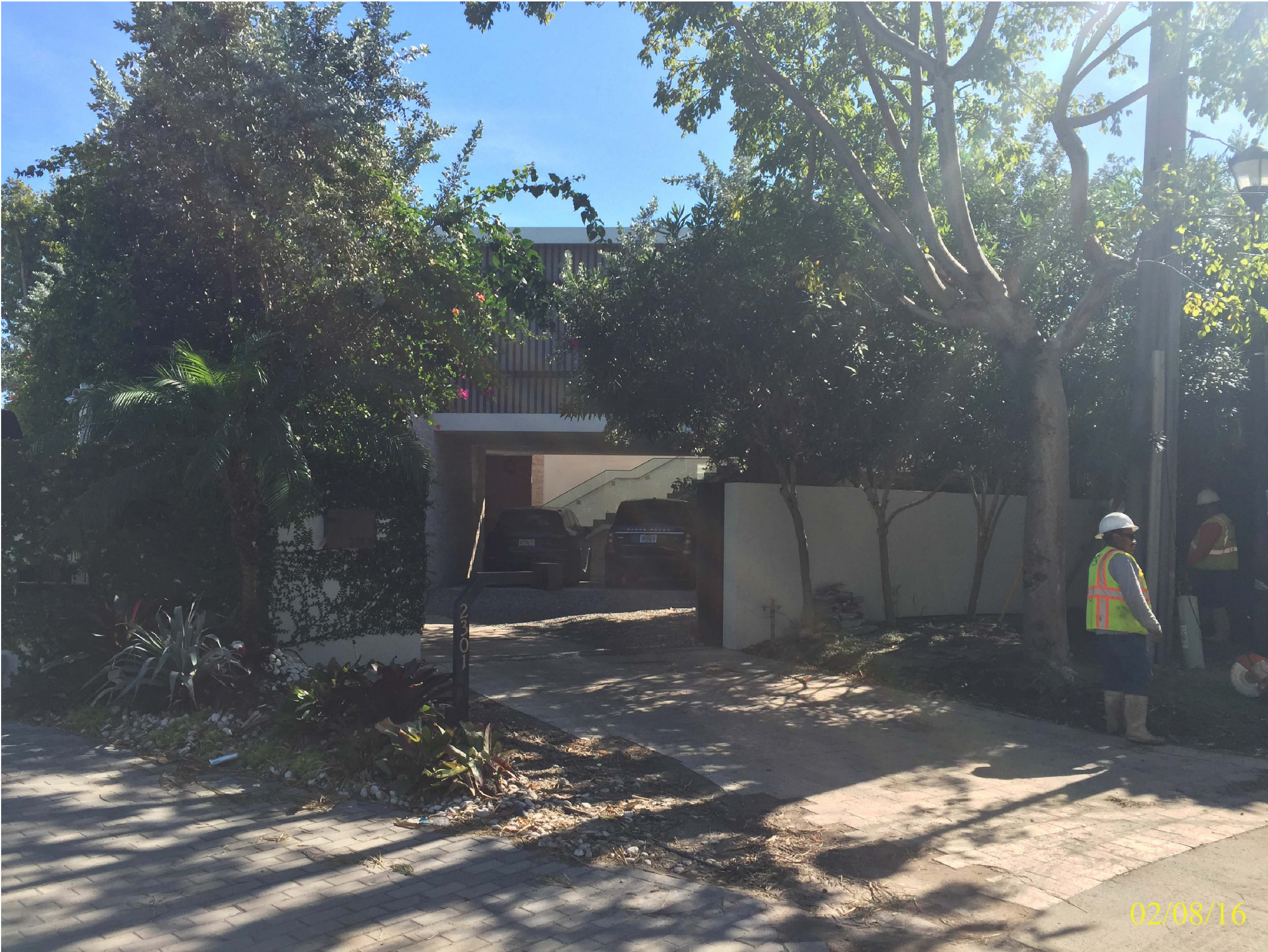
2 2301 LAKE AVE. G1.0 | G1.3 N.T.S.