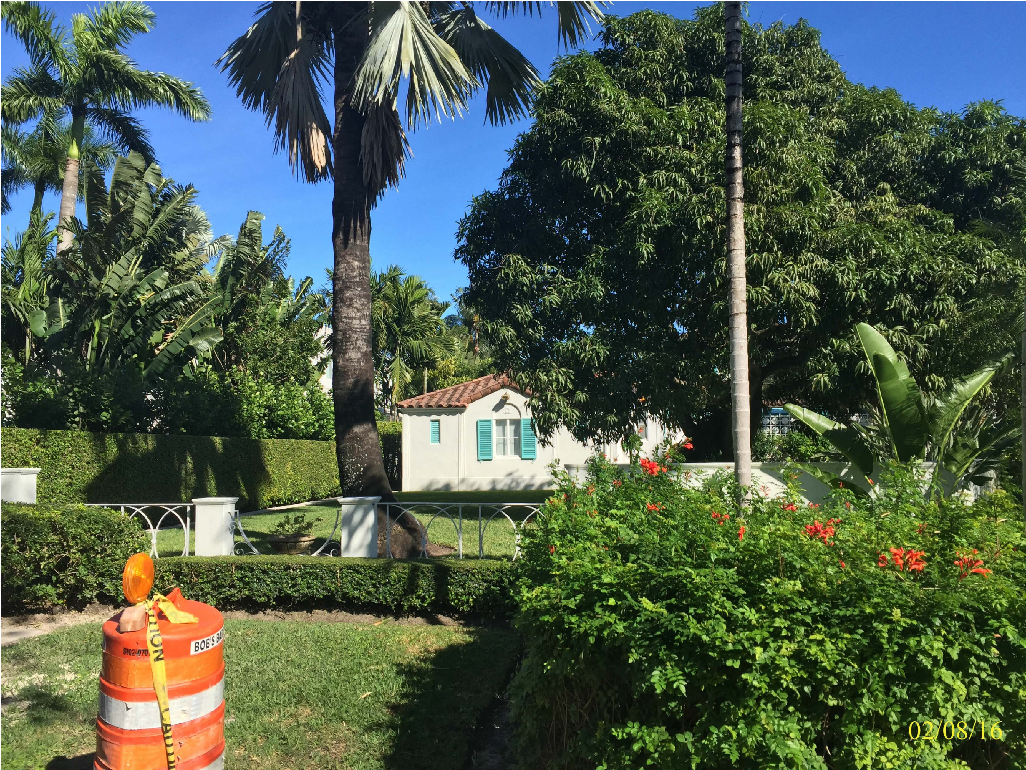
1 2315 LAKE AVE. G1.0 | G1.3 N.T.S.