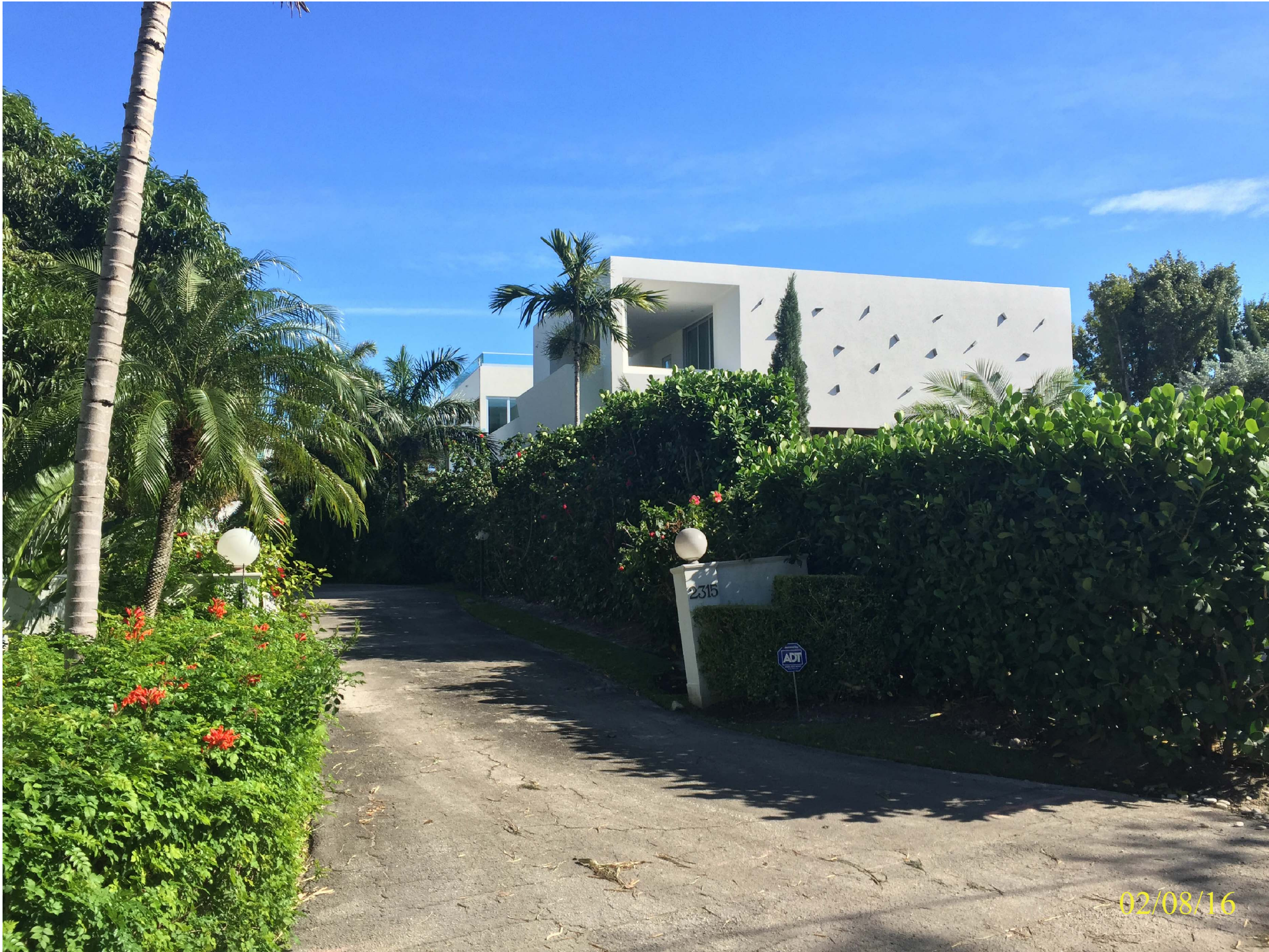
2 2305 LAKE AVE. G1.0 | G1.2 N.T.S.