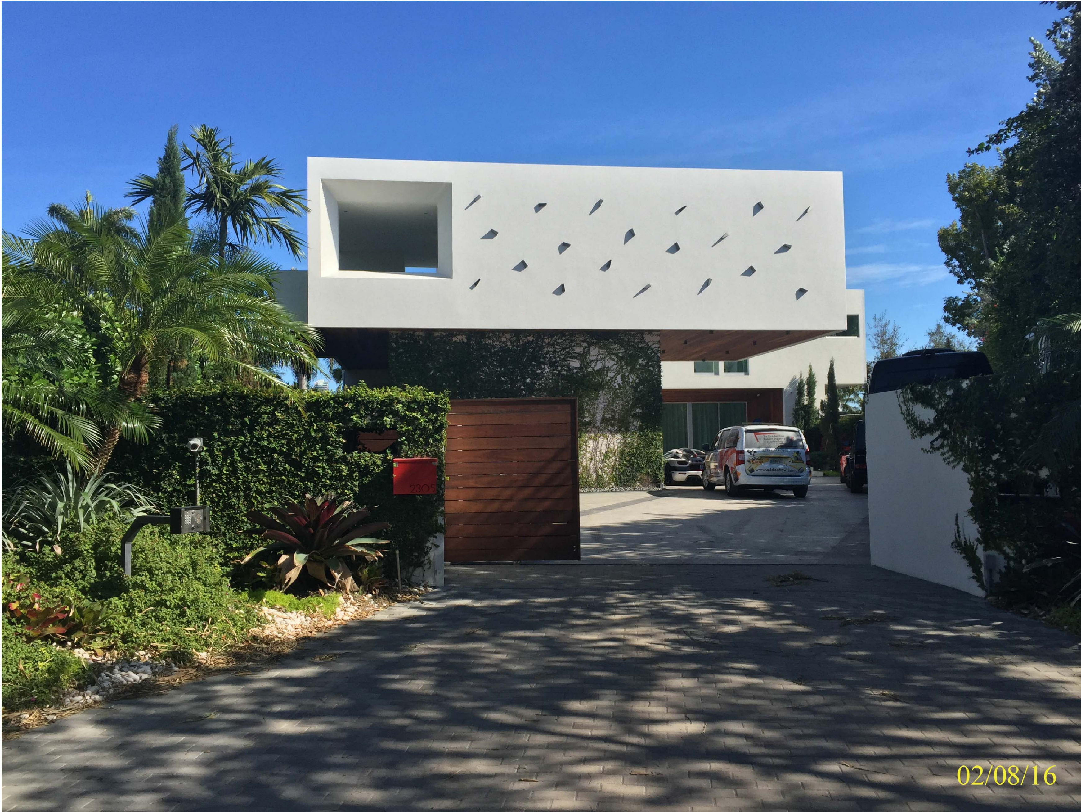
1 2305 LAKE AVE. G1.0 | G1.2 N.T.S.