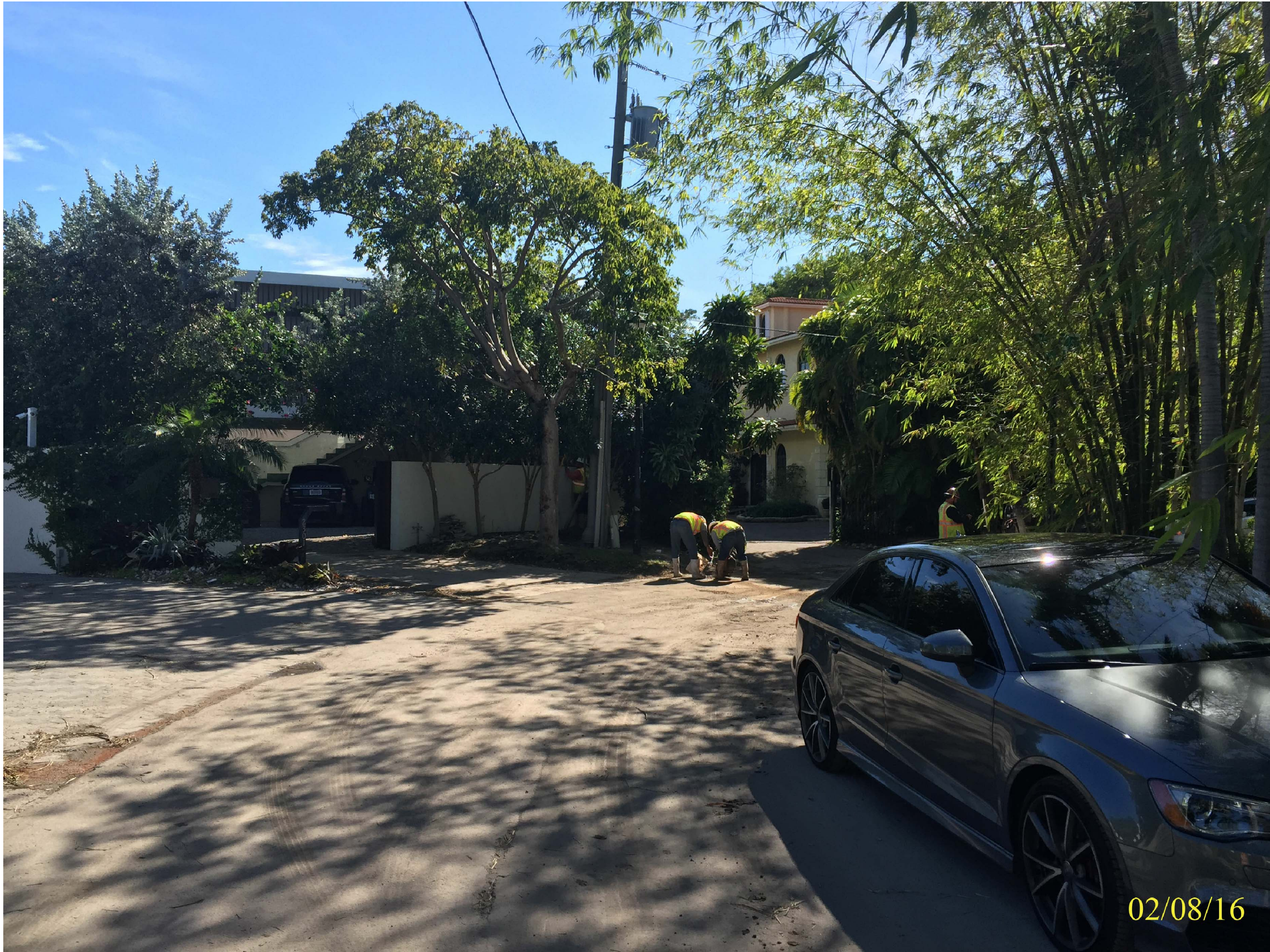
2 1400 W. 23RD ST. G1.0 | G1.4 N.T.S.