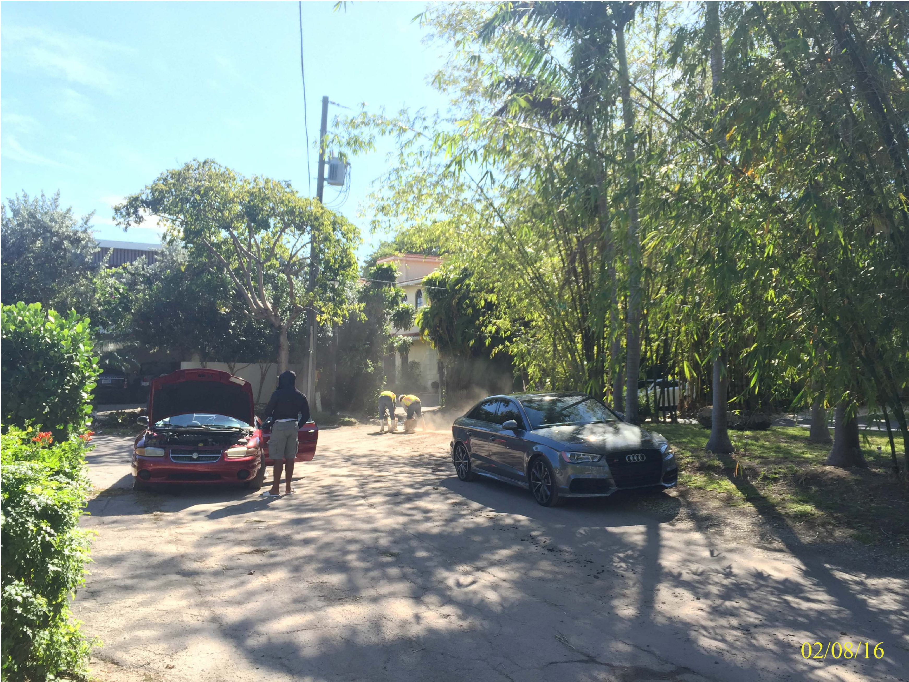
1 1400 W. 23RD ST. G1.0 | G1.4 N.T.S.