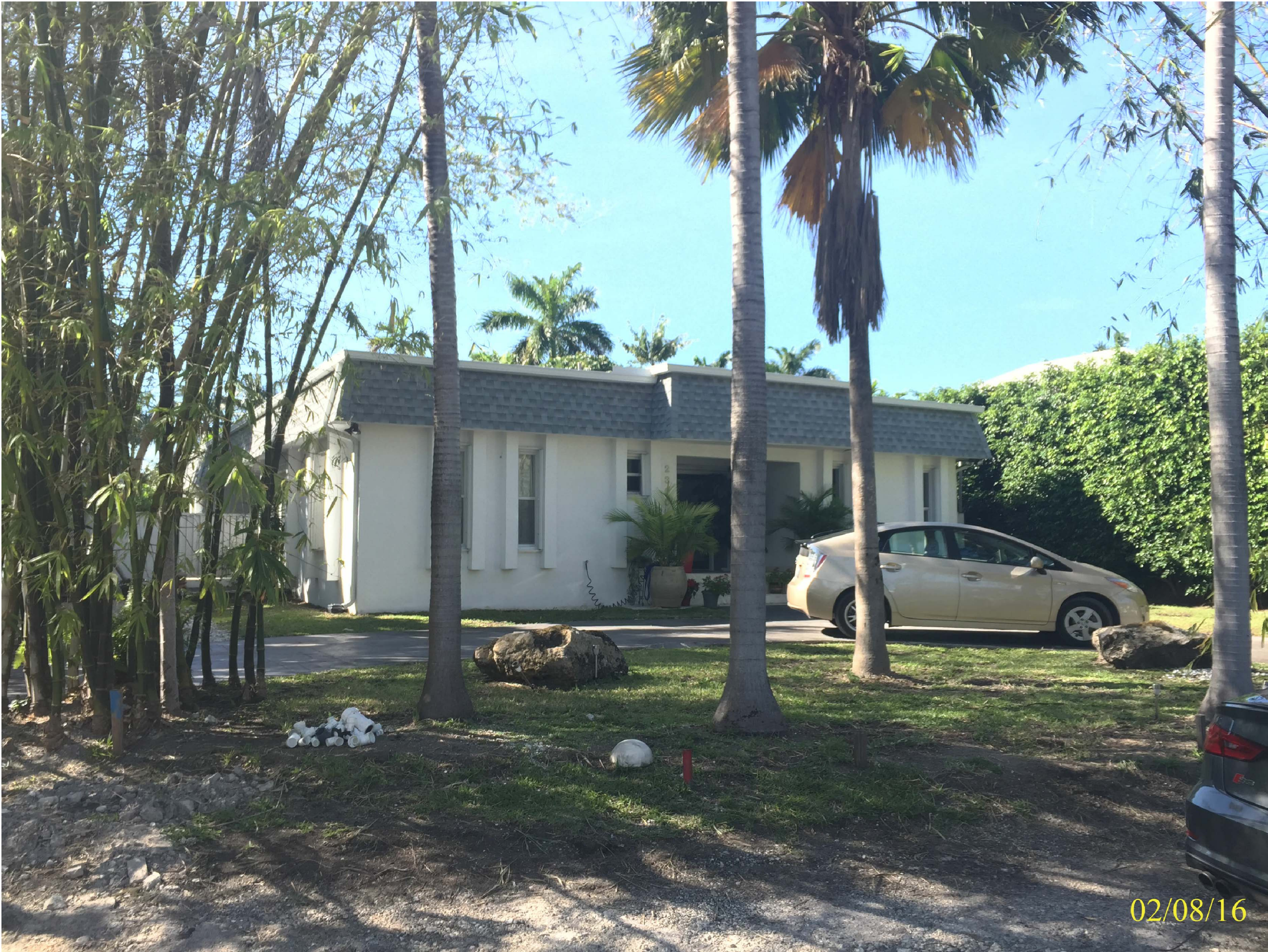
1 2300 LAKE AVE. G1.0 | G1.1 EXISTING SITE N.T.S.