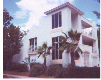
Jorge Nuche Designs