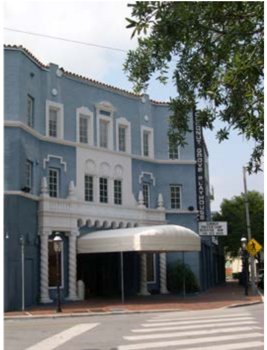
TOP PHOTO: COCONUT GROVE PLAYHOUSE, MIAMI (8)

"Some years later Mizner wrote about his own design process, and what he had to say explains a great deal about the architectural style he was inventing. Basically, he created an imaginary history for his buildings.: "I sometimes start a house with a Romanesque corner, pretend it has fallen into disrepair and been added onto in the Gothic spirit, when suddenly the great wealth of the New World has poured in and the owner added a very rich Renaissance addition." (14)