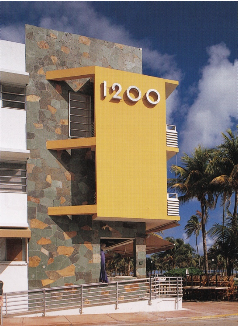
1200 OCEAN DRIVE circa 1980's