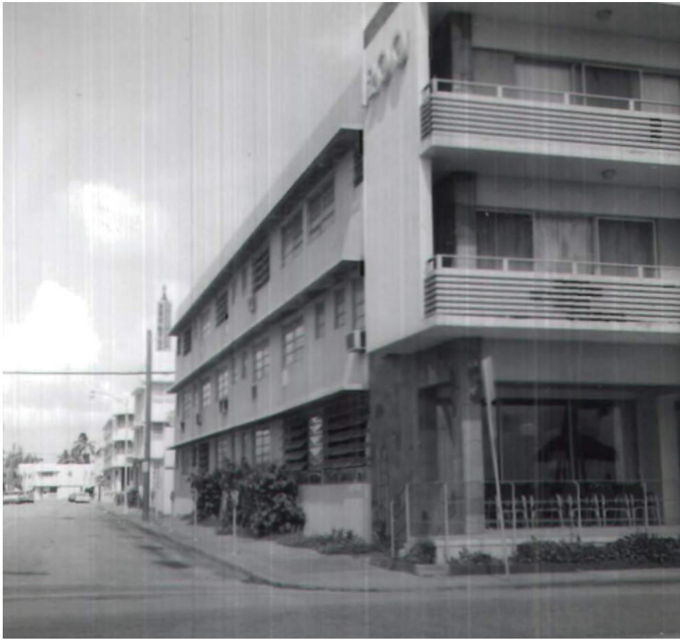
TOP PHOTO: 1970 SOUTH ELEVATION FACING 12TH STREET (9)