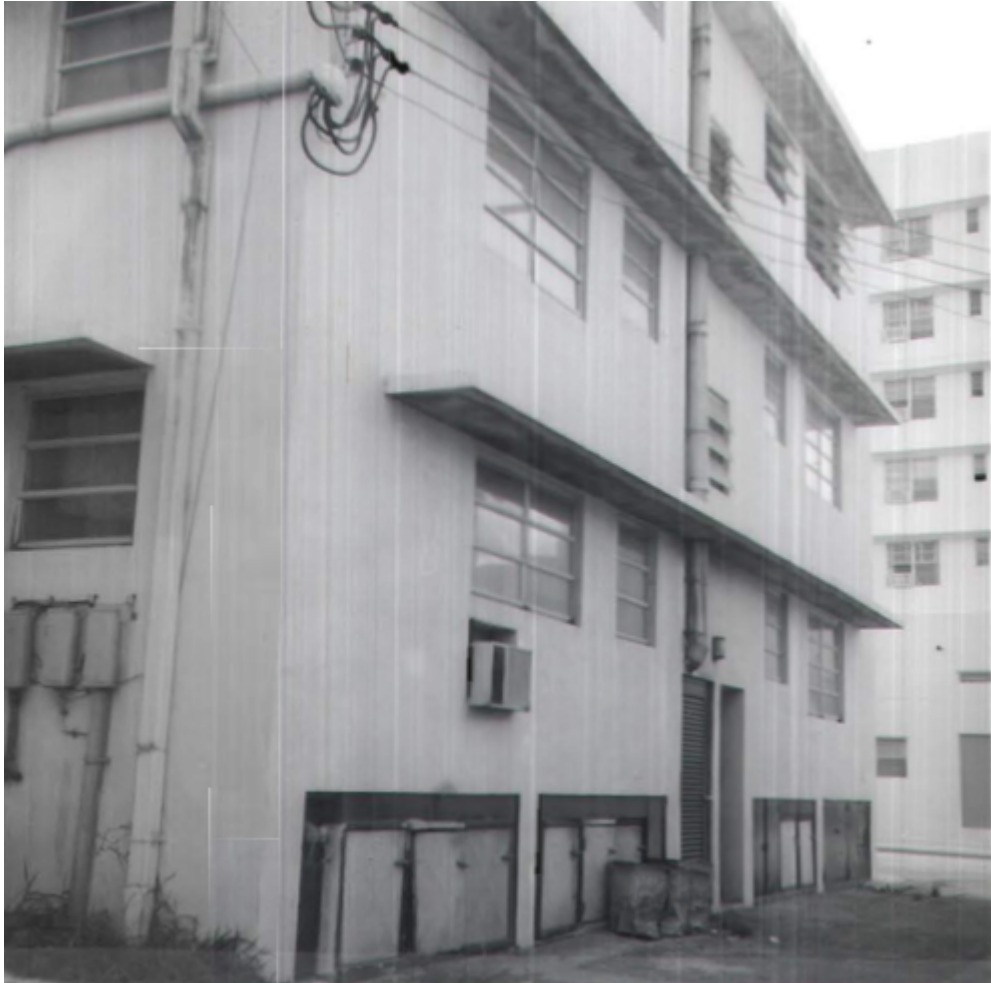
LOWER PHOTO: 1970 LOOKING SOUTH TOWARDS WEST (ALLEY) ELEVATION (9)