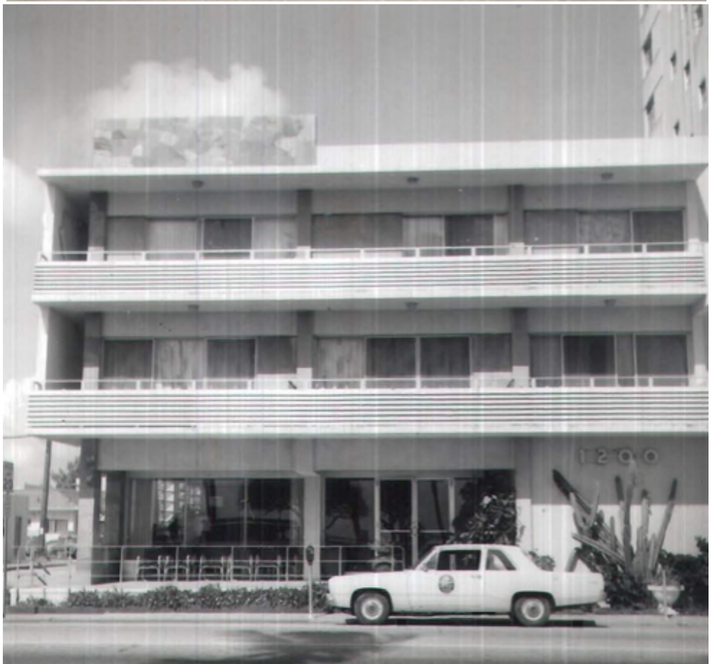
TOP PHOTO: 1959 EAST AND SOUTH ELEVATIONS SHOWS ORIGINAL FULL HEIGHT WINDOWS AT FRONT CORNER LOBBY AREA ON FIRST FLOOR. (9)