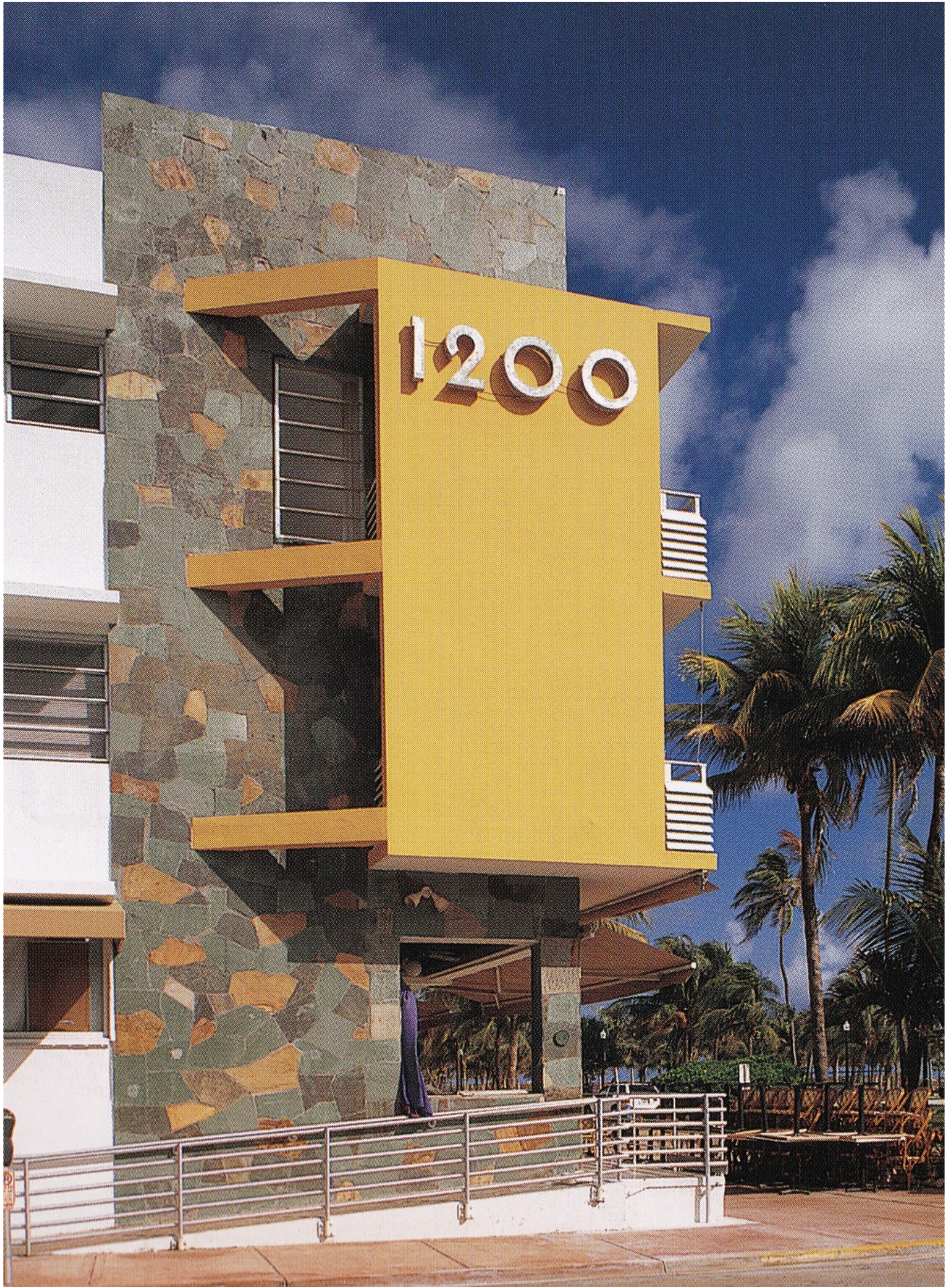
PHOTOGRAPH by THOMAS DELBECK from MiMo: MIAMI MODERN REVEALED 2004, P. 11