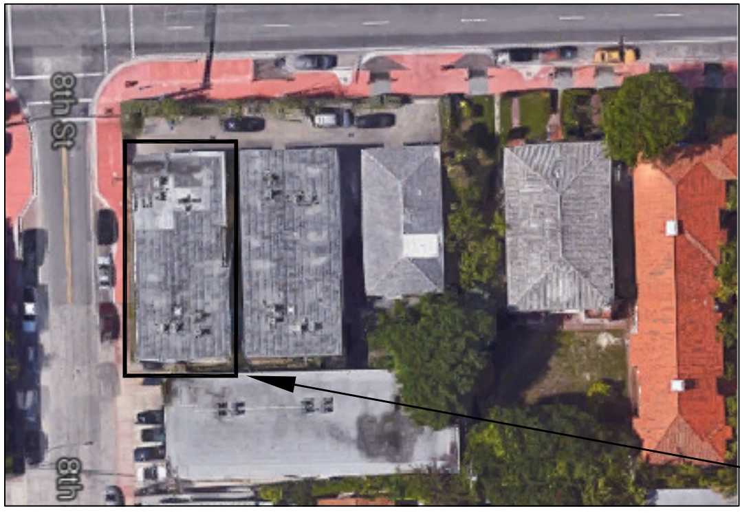
LOCATION MAP SCALE: SCALE:N/T/S

ALL DRAWING AND WRITTEN MATERIAL CONTAINED HEREIN IS THE PROPERTY OF WESLEY ART CASTELLANOS ARCHITECT. IT IS NOT TO BE REPRODUCED, COPIED, REPRODUCED, OR USED WITHOUT THE WRITTEN CONSENT OF WESLEY ART CASTELLANOS ARCHITECT. THE GENERAL CONTRACTOR IS TO FURNISH AND INSTALL ALL MATERIALS AND FINISHES TO THE CONTRACT AMOUNT UNLESS OTHERWISE SPECIFIED IN THE CONTRACT DOCUMENTS. THE CONTRACTOR SHALL BE RESPONSIBLE FOR OBTAINING ALL NECESSARY PERMITS AND APPROVALS FROM THE APPROPRIATE AGENCIES. THE CONTRACTOR SHALL BE RESPONSIBLE FOR OBTAINING ALL NECESSARY PERMITS AND APPROVALS FROM THE APPROPRIATE AGENCIES. THE CONTRACTOR SHALL BE RESPONSIBLE FOR OBTAINING ALL NECESSARY PERMITS AND APPROVALS FROM THE APPROPRIATE AGENCIES.