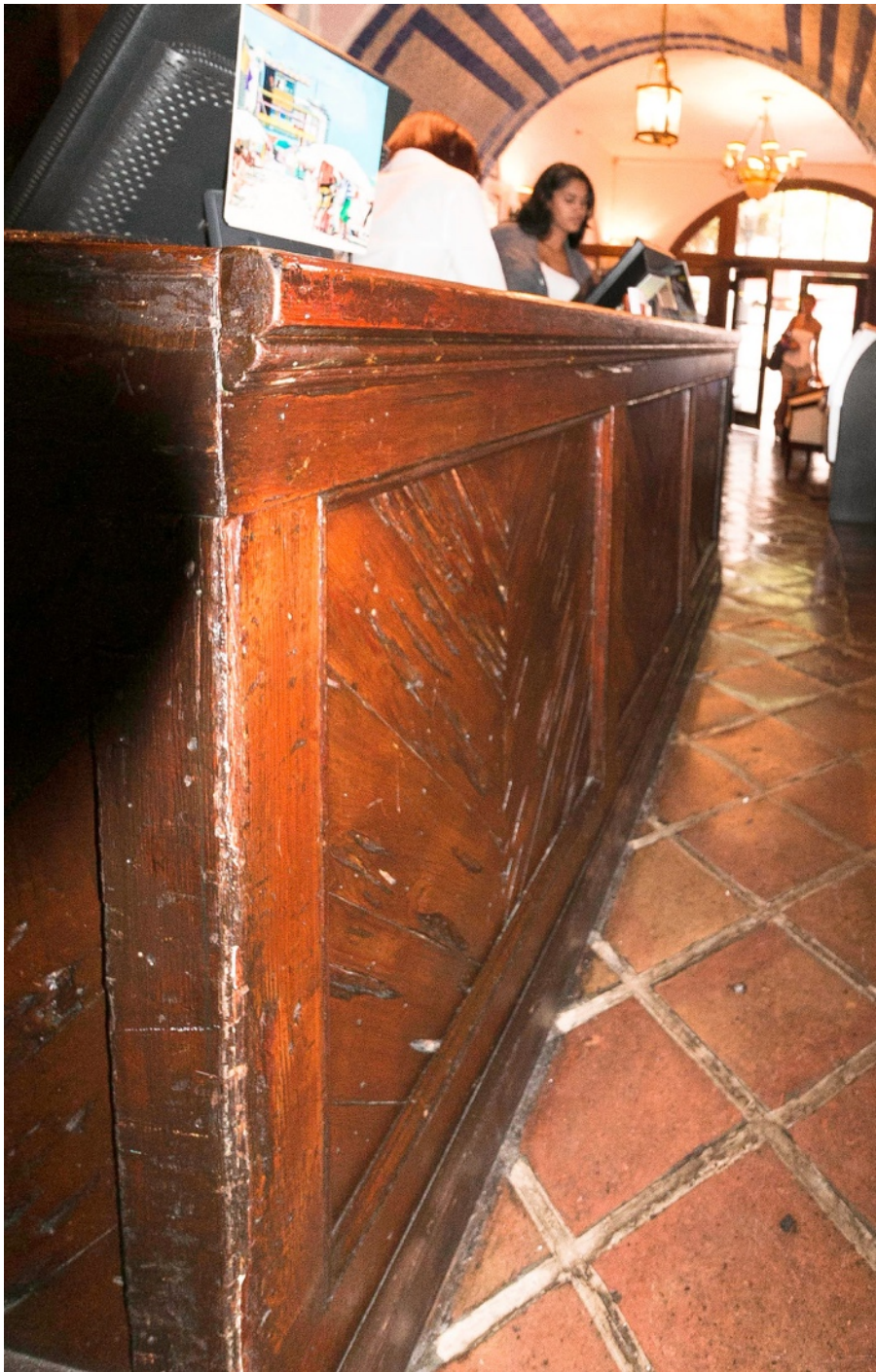
BELOW: 2016 INTERIOR LOBBY RECEPTION DESK (8)