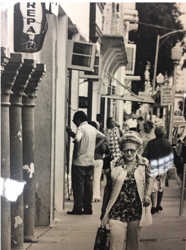
COLOR PHOTOGRAPHS 2006 (8) SEPIA TONE PHOTO MIAMI NEWS 1975