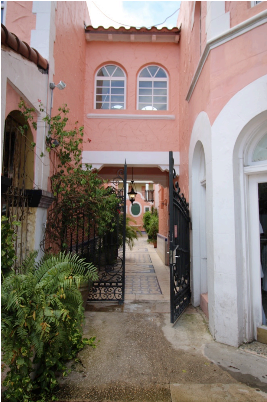
ENTRANCES TO THE INNER COURTYARDS FROM ESPANOLA WAY (8)