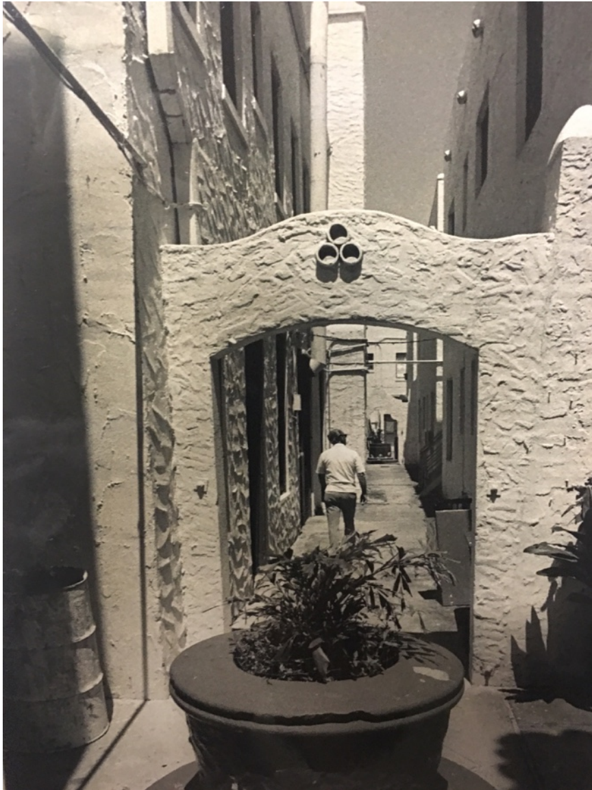
ABOVE LEFT: CIRCA 1975 MID-BLOCK COURTYARD PASSAGEWAY (8)