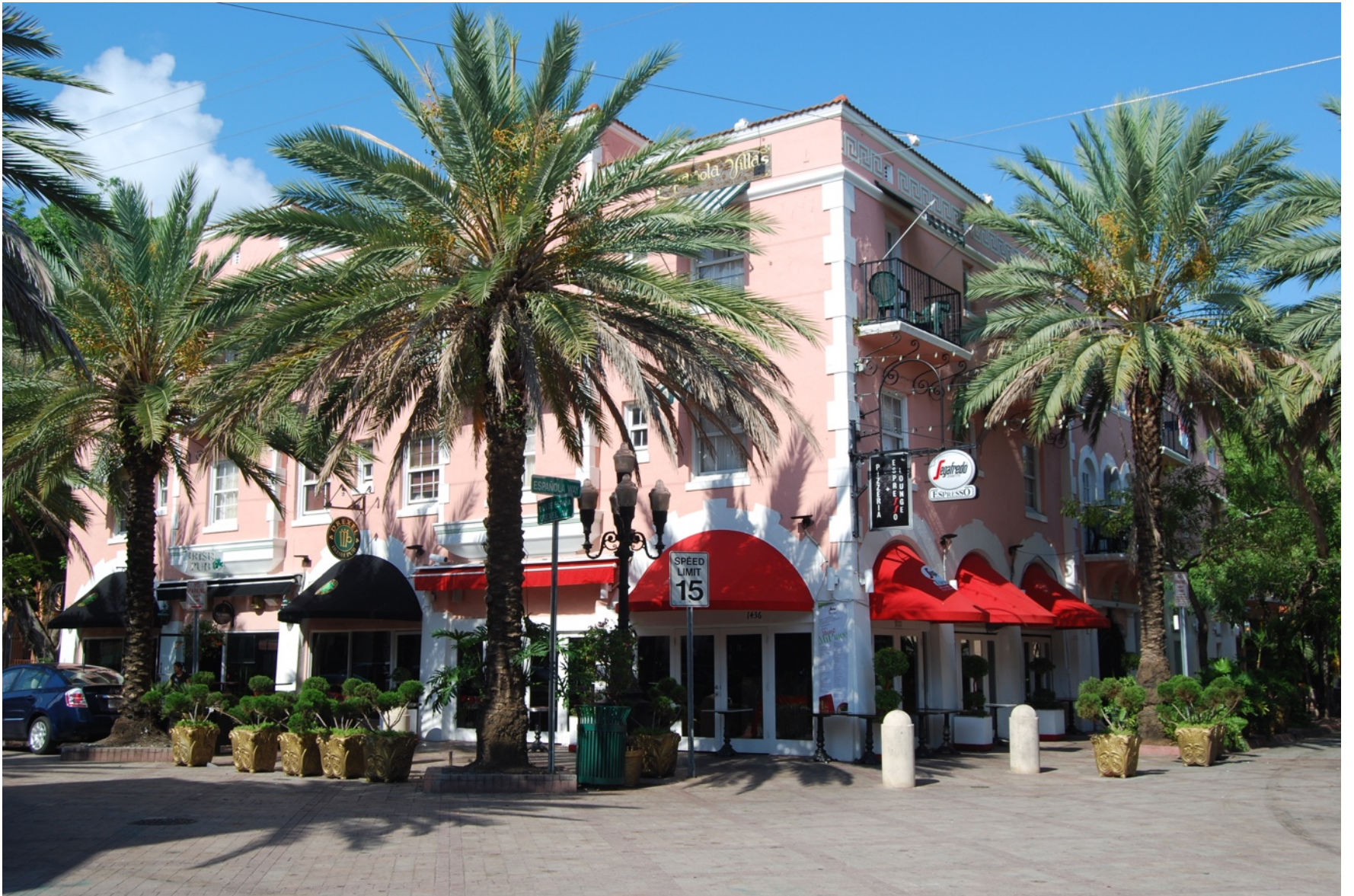
TOP PHOTO: 2011 VIEW OF MATANZAS HOTEL (8)