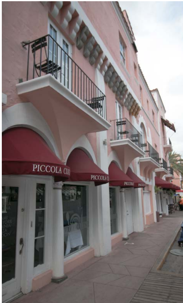
2016 PHOTOGRAPHS OF BUILDINGS ALONG ESPANOLA WAY BETWEEN WASHINGTON AVENUE AND DREXEL AVENUE (8)