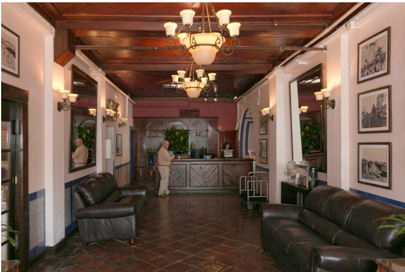
ABOVE: 2016 INTERIOR LOBBY LOOKING WEST TOWARDS RECEPTION DESK (8)