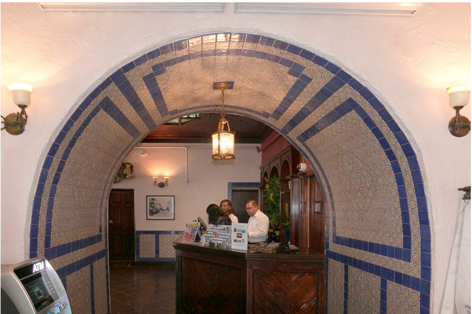
BELOW: 2016 VIEW OF TILED ARCHWAY LOOKING TOWARDS RECEPTION DESK (8)