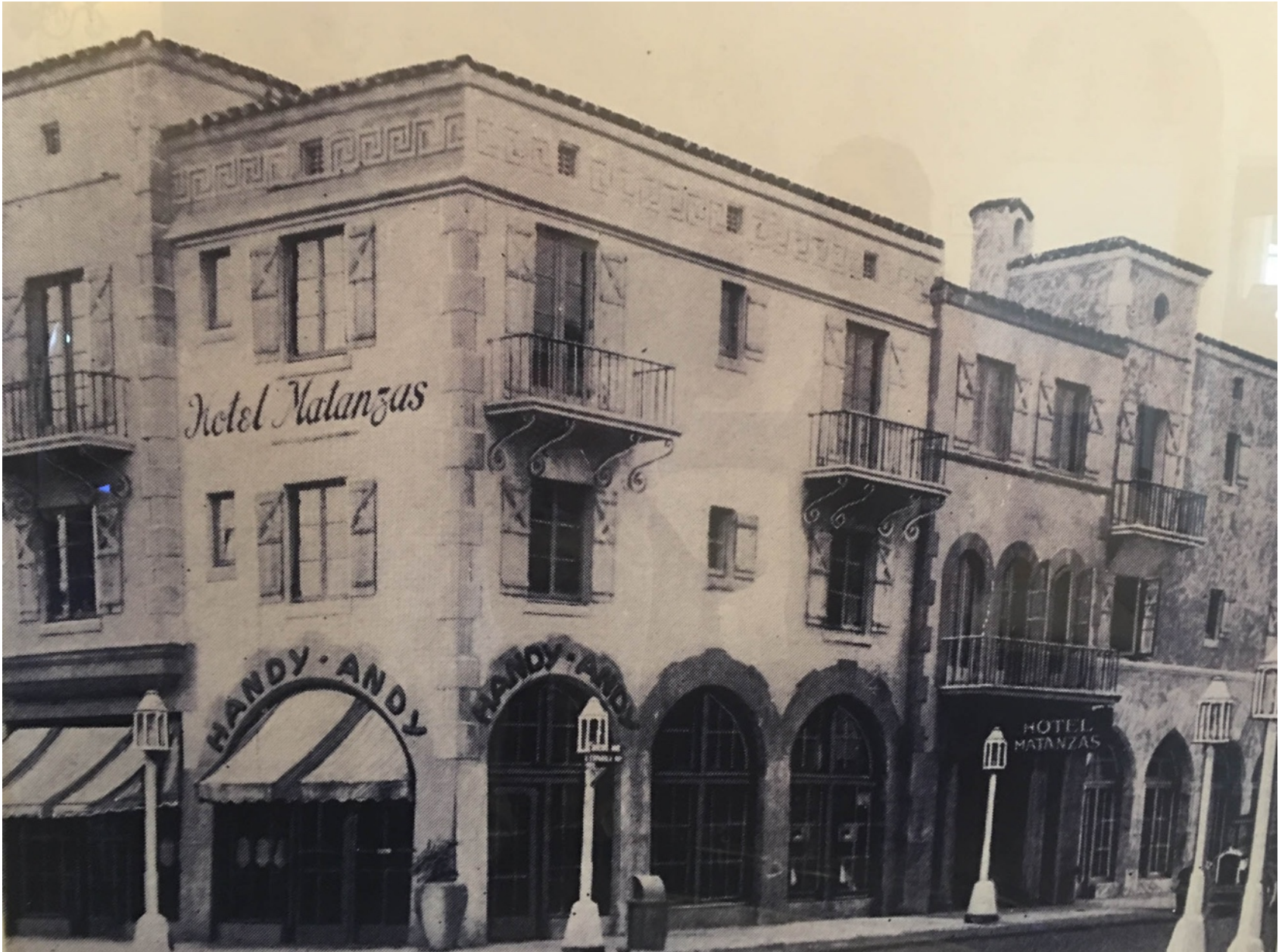
1926 PHOTOGRAPH VIEW OF MATANZAS HOTEL (22)