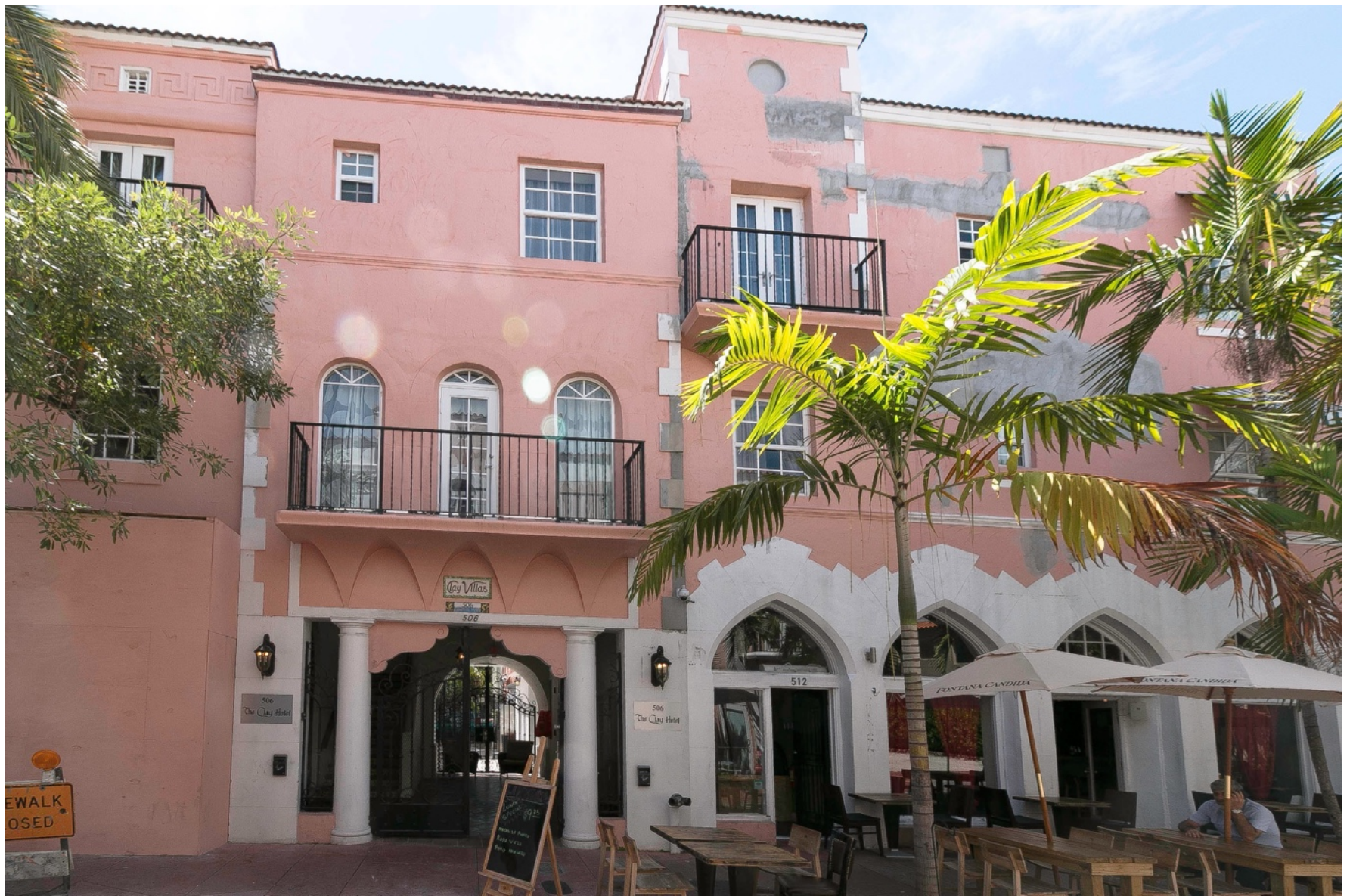
2016 VIEW OF ESPANOLA WAY FACADE (8)