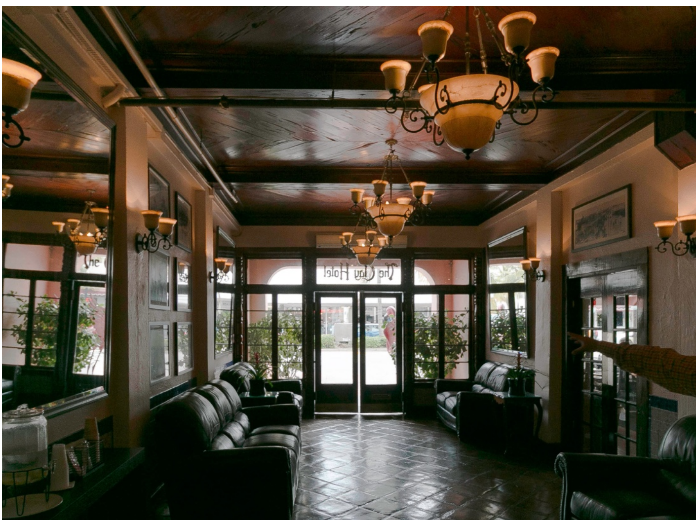
BELOW: 2016 INTERIOR LOBBY LOOKING EAST TOWARDS ENTRANCE + WASHINGTON AVENUE (8) LIGHT FIXTURES ARE NOT HISTORIC