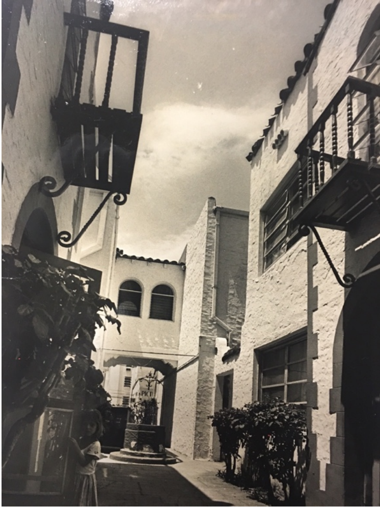
LEFT: CIRCA 1975 MID-BLOCK COURTYARD PASSAGEWAYS (8)