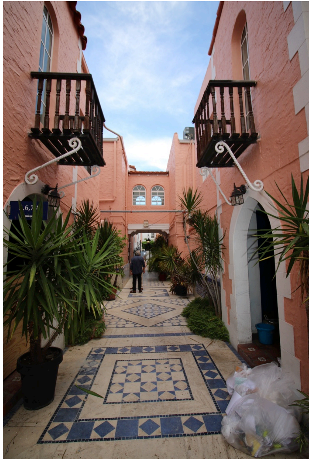
BELOW 2016 MID-BLOCK COURTYARD PASSAGEWAYS (8)