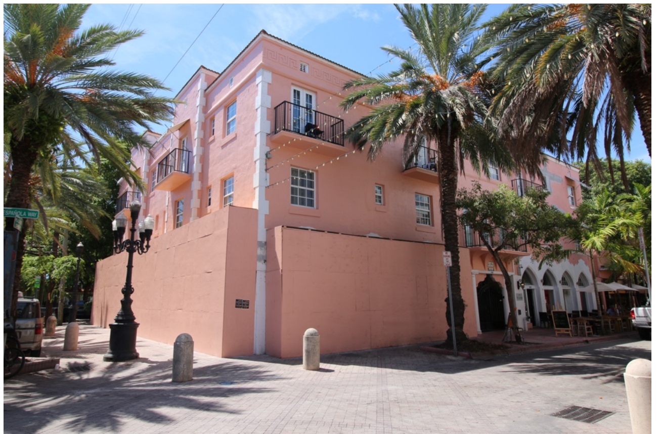
LOWER PHOTO: 2016 VIEW OF MATANZAS HOTEL (8)