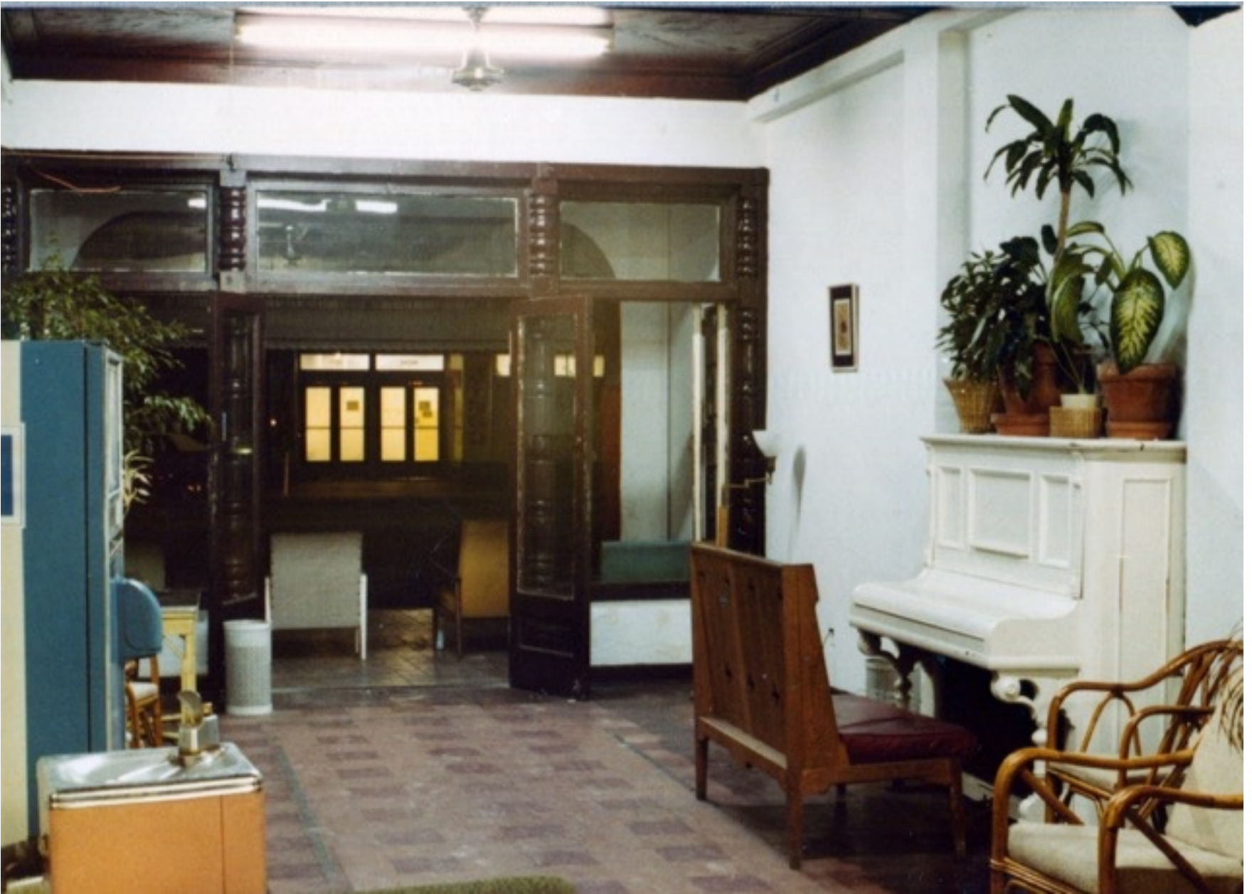
CLAY HOTEL CIRCA 1979 (21)

The above photograph was taken in the lobby of the Clay Hotel in 1979 and has been provided courtesy of the Clay Hotel. This view is looking towards the east and towards the main entrance and Washington Avenue from inside the lobby. It clearly shows that the existing flooring in the lobby is not the original flooring.