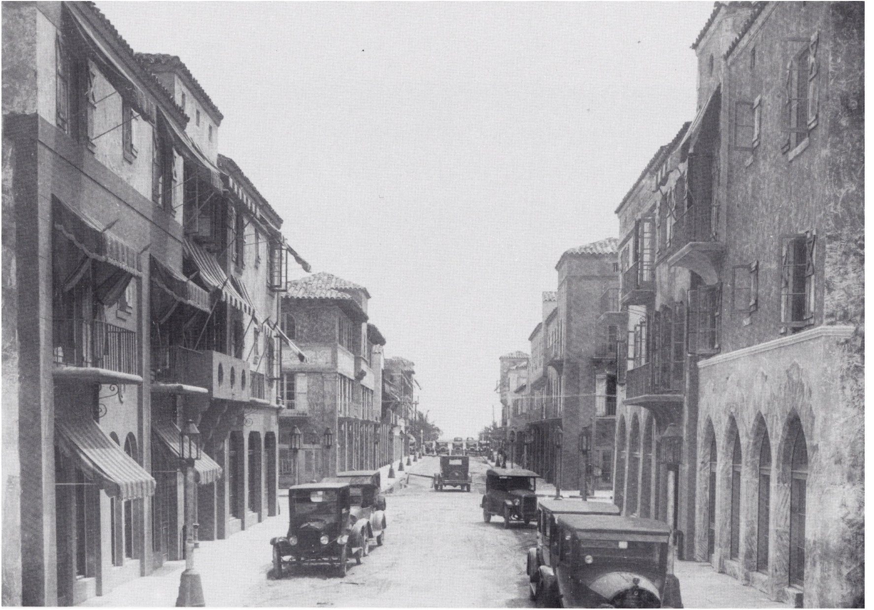
1926 VIEW LOOKING EAST ON ESPANOLA WAY WITH MATANZAS HOTEL AT MIDDLE RIGHT (22)