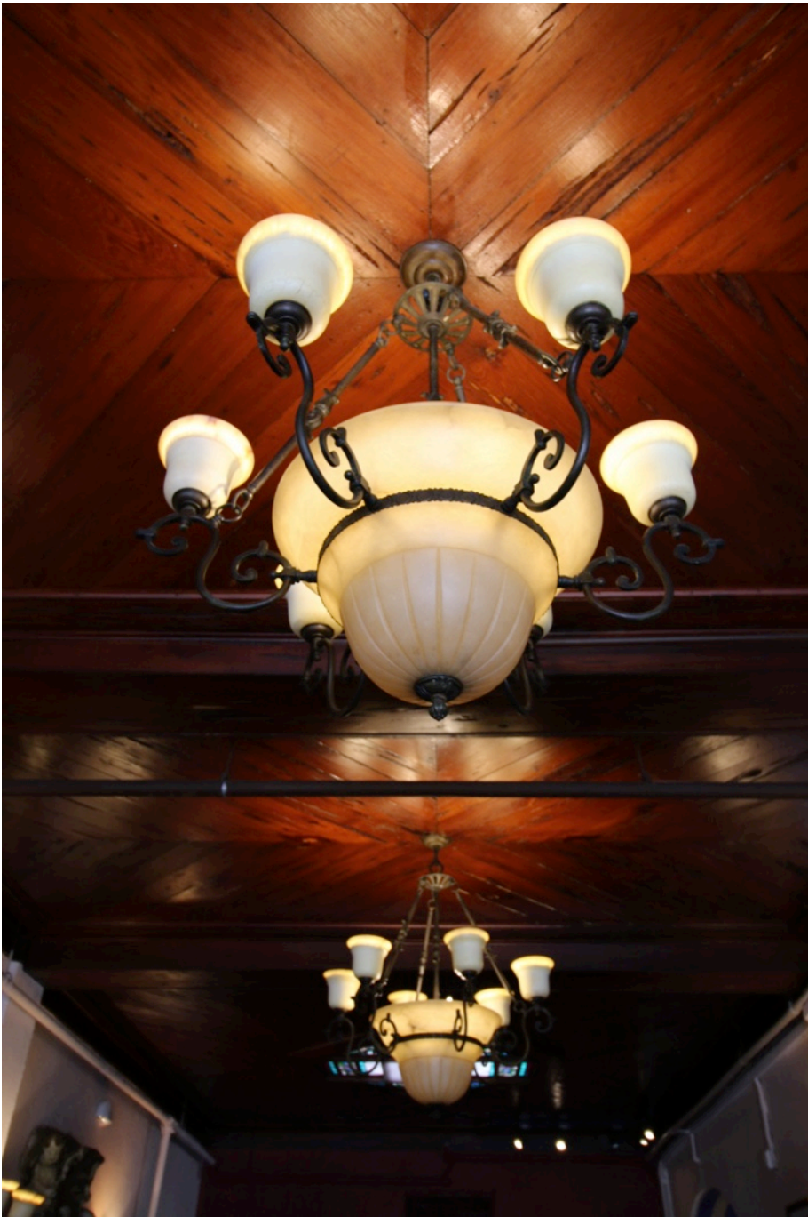
ABOVE LEFT: 2016 PHOTOGRAPH OF HISTORIC PECKY CYPRESS WOOD AT INTERIOR LOBBY CEILING WITH NON-HISTORIC CHANDELIER (8)