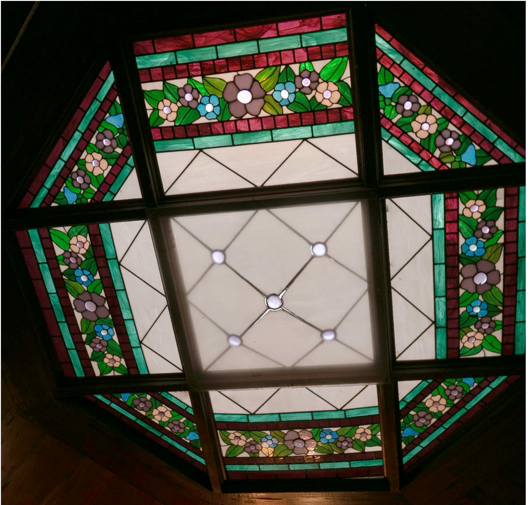
ABOVE: 2016 INTERIOR LOBBY SKYLIGHT (8)