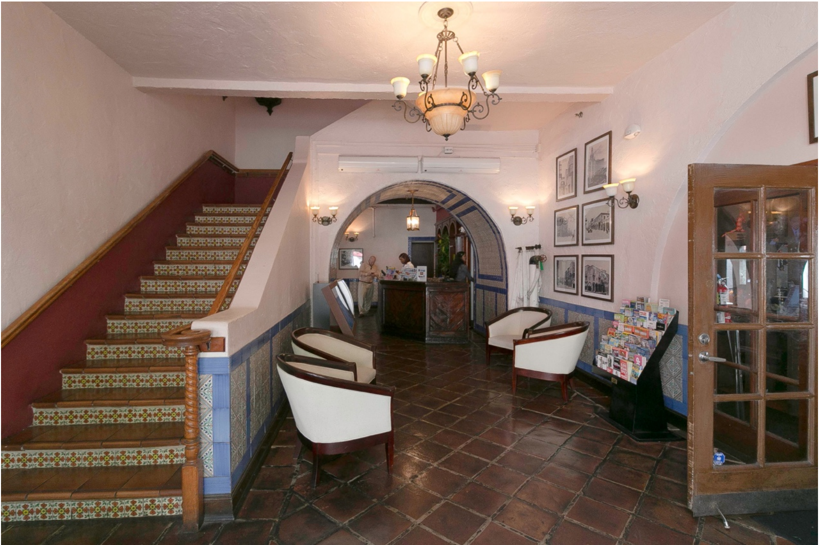
ABOVE: 2016 INTERIOR OF ESPANOLA WAY LOBBY LOOKING WEST TOWARDS RECEPTION DESK.. NOTE THAT THE FLOORING MATERIAL AND THE TILES ON THE STAIRS RISERS ARE NOT ORIGINAL THROUGHOUT THE LOBBY. (8)