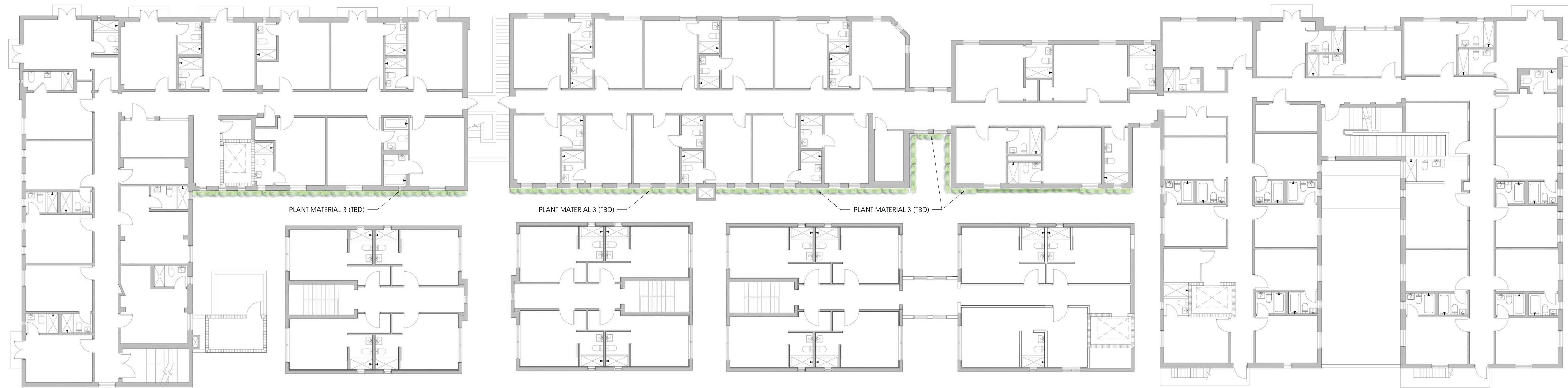
SECOND FLOOR LANDSCAPE PLAN 0 10'-8" 21'-4" 42'-8" SCALE: 3/32" = 1'-0"