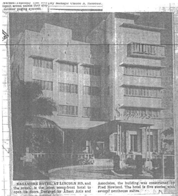
1949, Miami Daily News

the vertical extension of the parapet wall and the introduction of monumental signage along the northern portion of the façade as shown in the two images below.