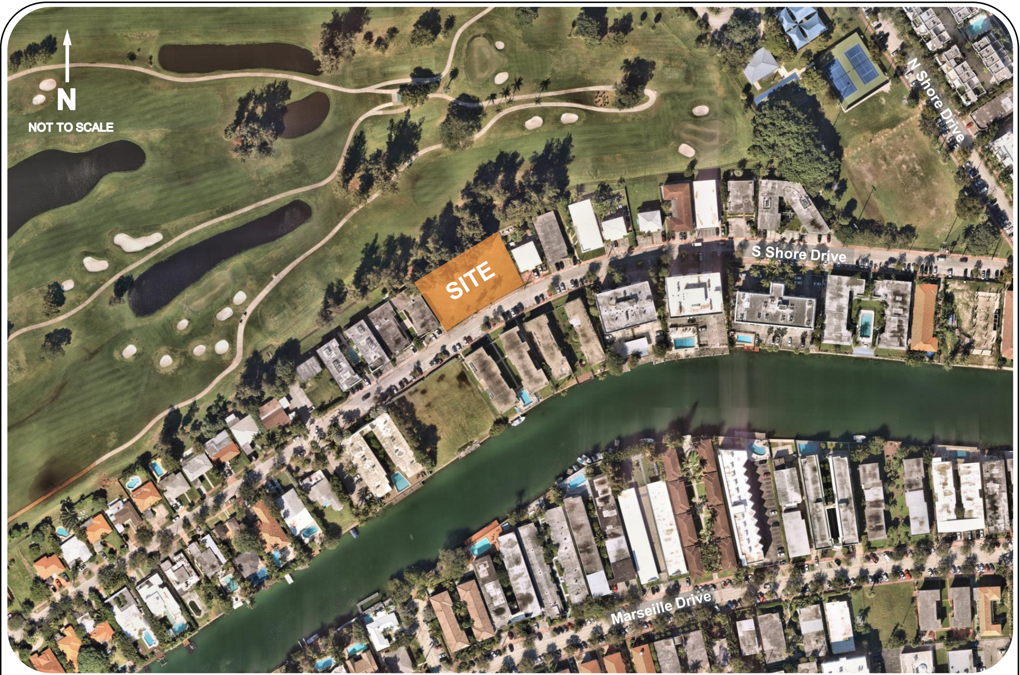
Figure 1 Location Map HACMB Development Miami Beach, Florida