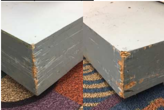
Base Damage Left and Right Corners

No background or supplemental material found on the City's Folio Data Base and Kardx Files