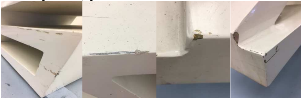
Sculpture is damaged at various sections. These photographs depict a sampling of overall condition.