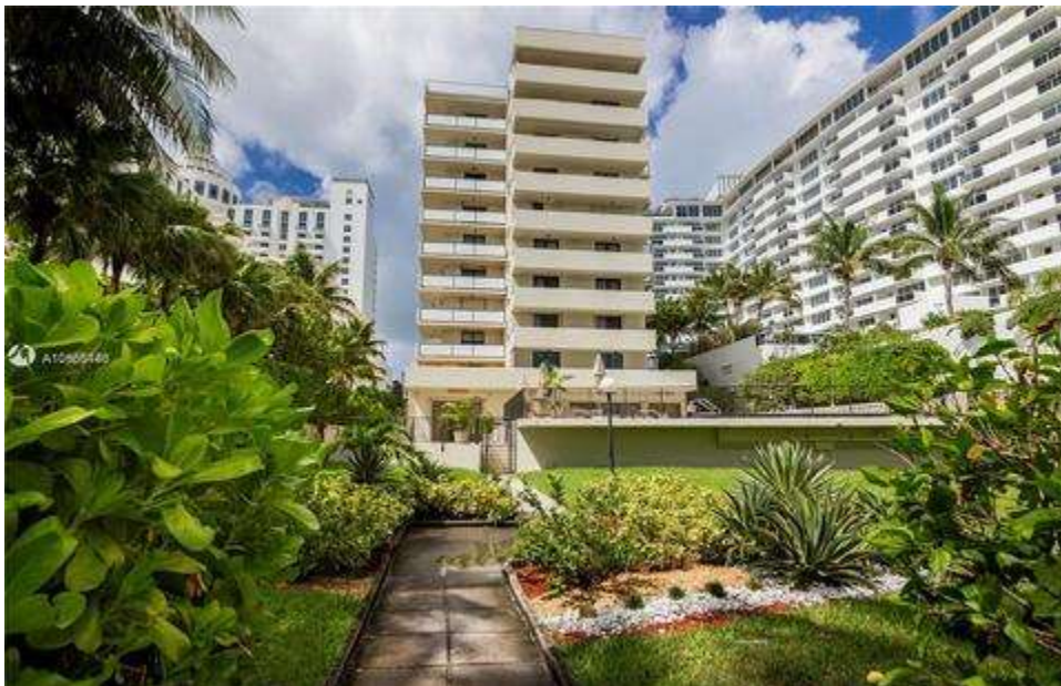
The Georgian Condominium 1621 Collins Avenue Abutting the Beachwalk