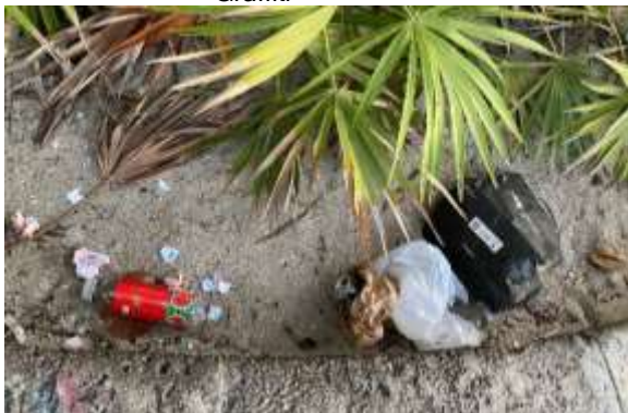
Litter & Dead Vegetation