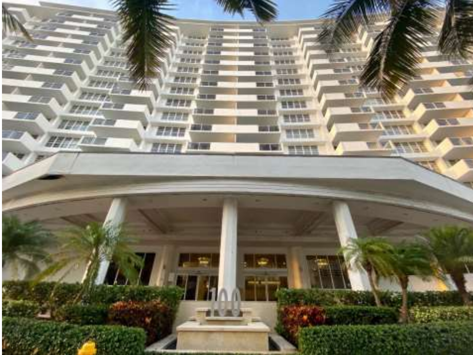
The Decoplage Condominium 100 Lincoln Road Abutting the Beachwalk and Lincoln Road