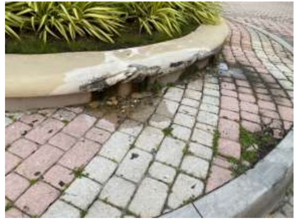
Lack of repair