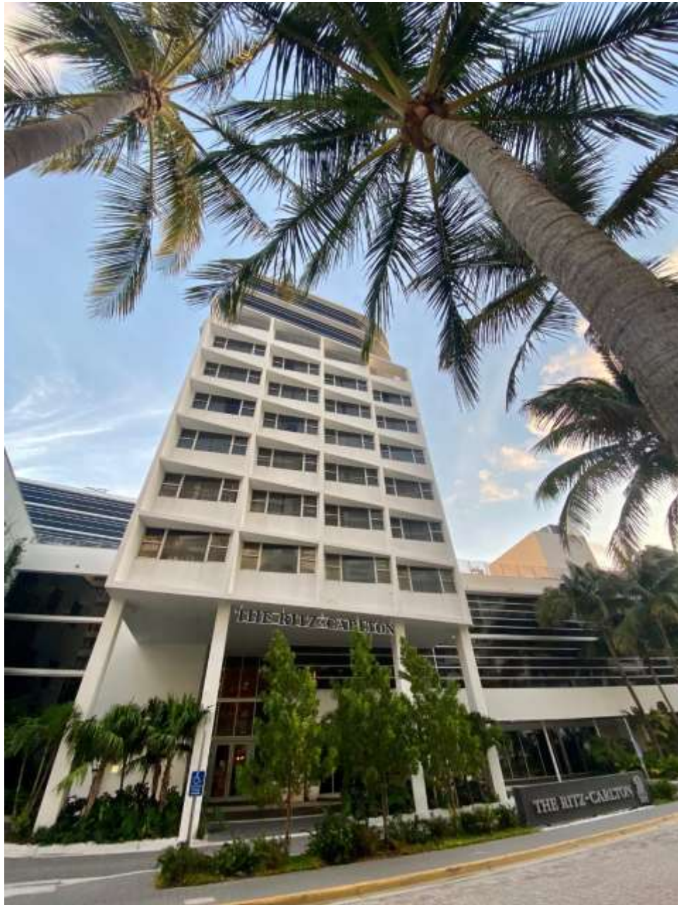
The Ritz-Carlton Hotel 1 Lincoln Road Abutting the Beachwalk and Lincoln Road