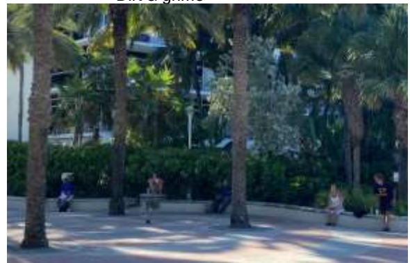
Loitering & Solicitation (location of proposed concession)