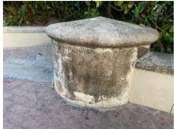
Dirt & grime