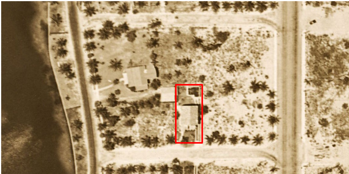
1929 aerial image

The subject Contributing building was originally constructed in 1928 as a 2-story residence (used as a rooming house) with a detached rear garage. In 1986, the Board of Adjustment granted variances for the construction of two additions (a 2-story addition to the front of the house and a 1-story addition to the west side of the garage) on the site as part of the conversion of the property to a religious institutional use.