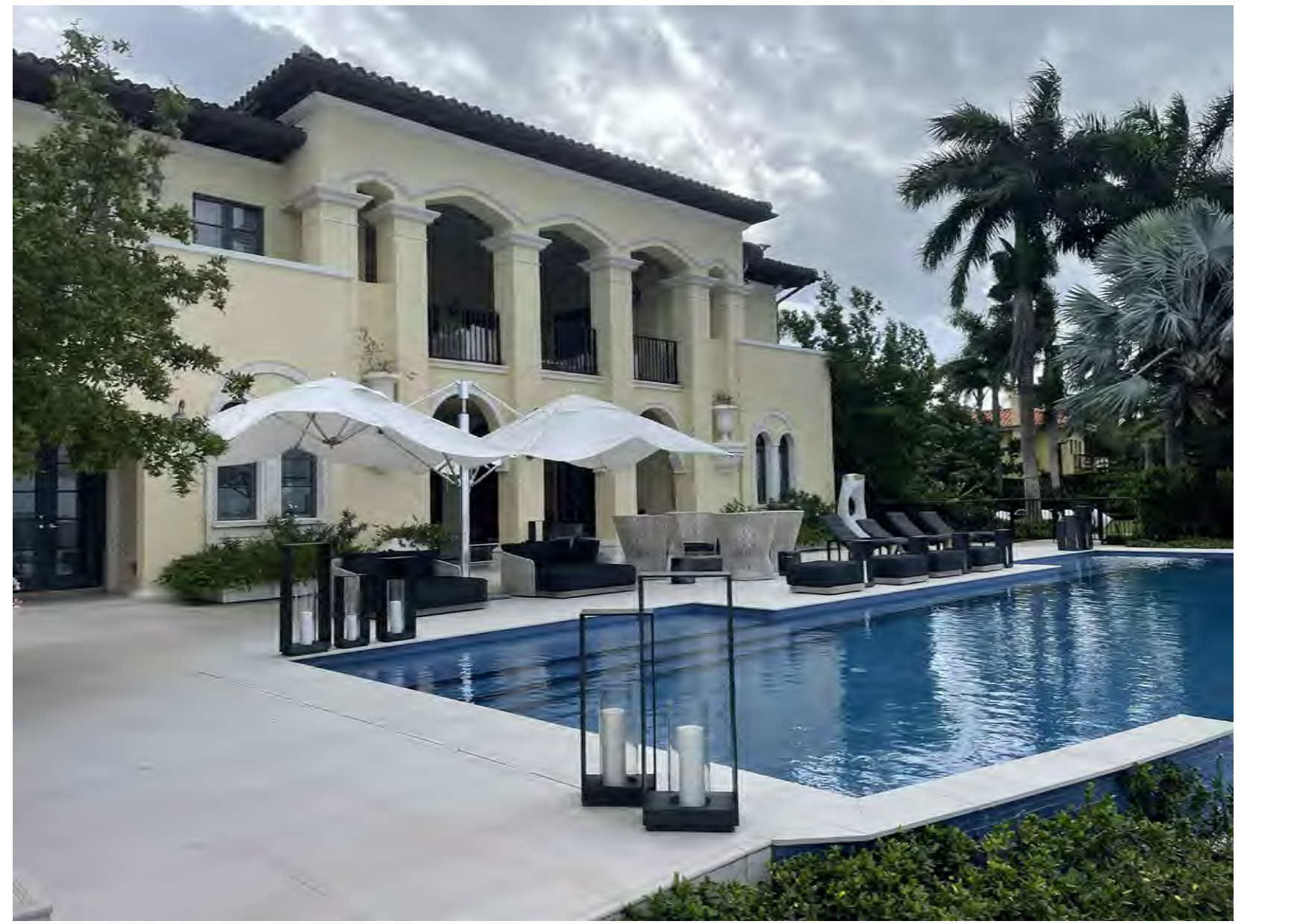
17 4580 PROPERTY - VIEW AT REAR TOWARDS HOUSE (NW CORNER) 2021-11-19