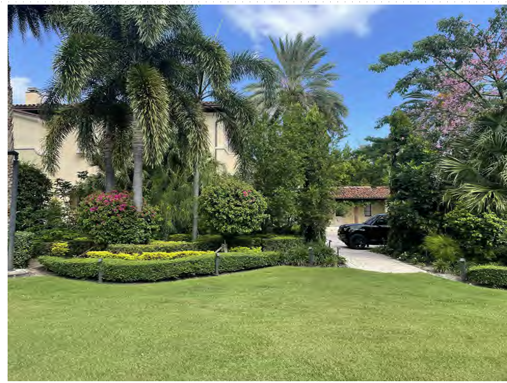
2 VACANT PROPERTY - VIEW TOWARDS 4580 PROPERTY 2021-11-19