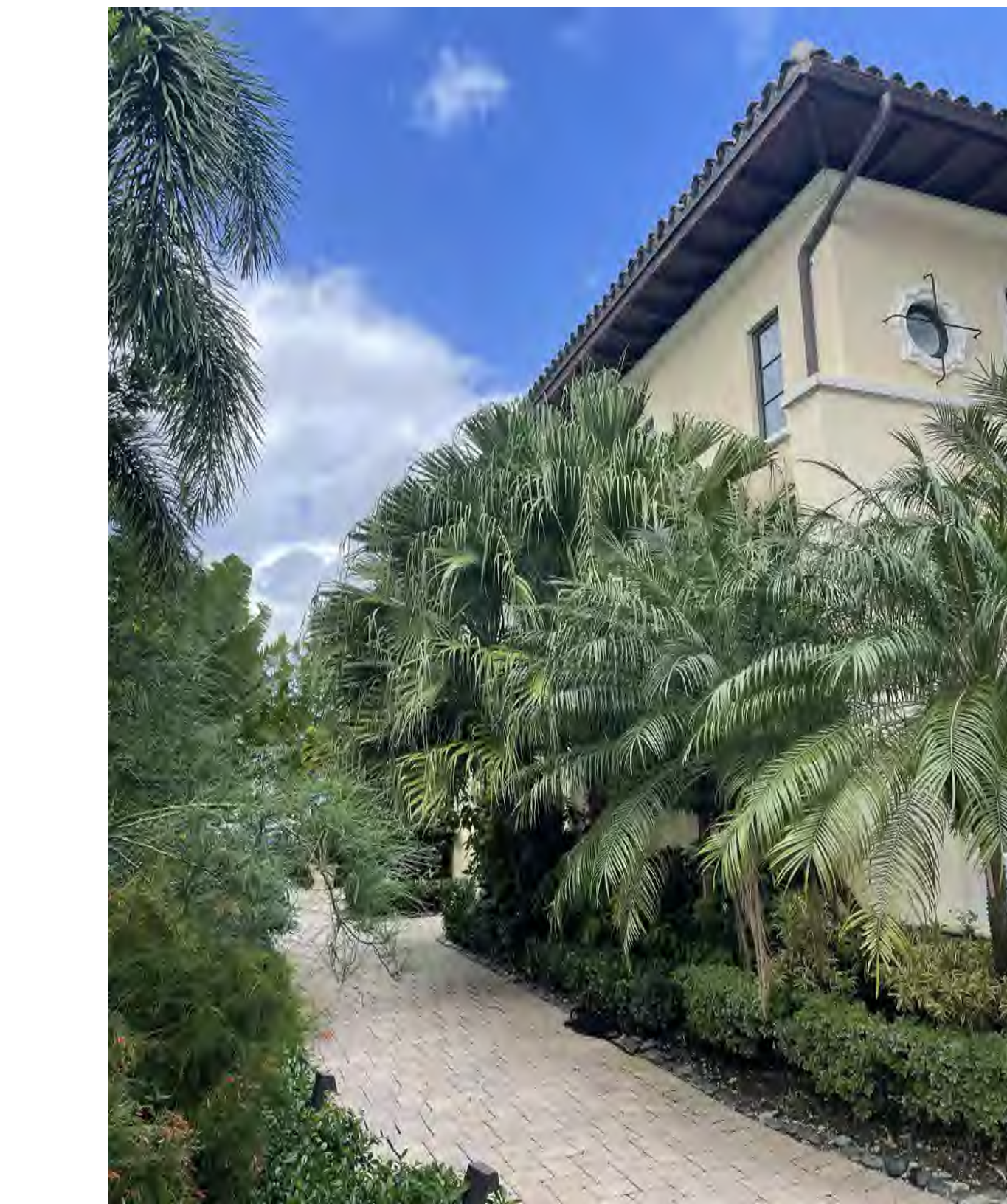
7 4580 PROPERTY - PANORAMA TOWARDS HOUSE 2021-11-19