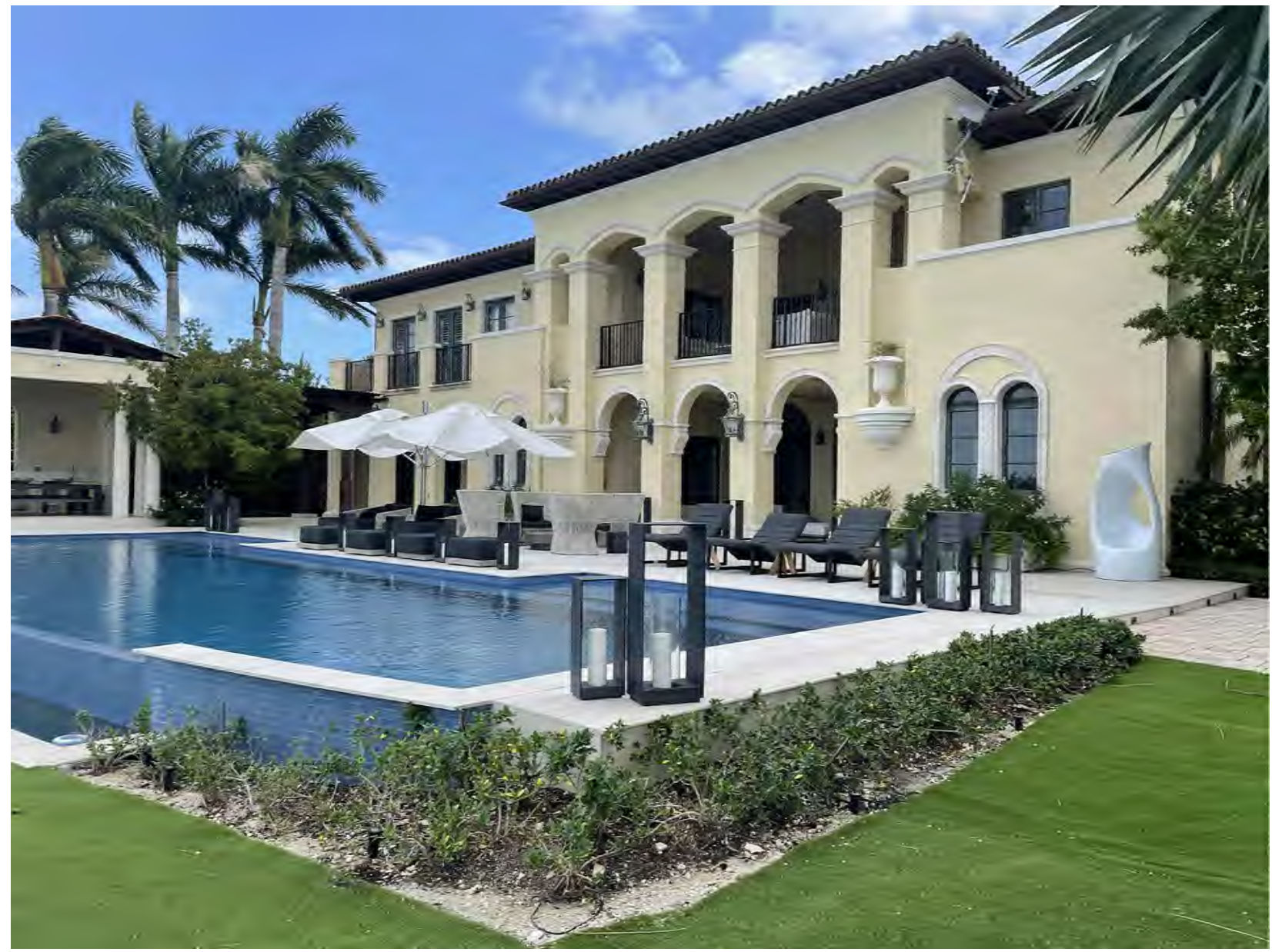
16 4580 PROPERTY - VIEW AT REAR TOWARDS HOUSE (SW CORNER) 2021-11-19