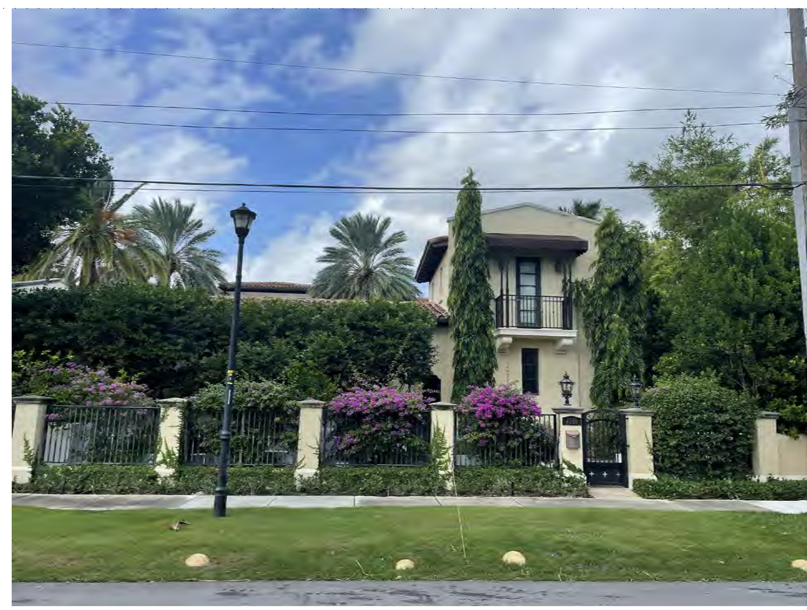
11 4580 PROPERTY - VIEW AT FRONT SITE WALL 2021-11-19