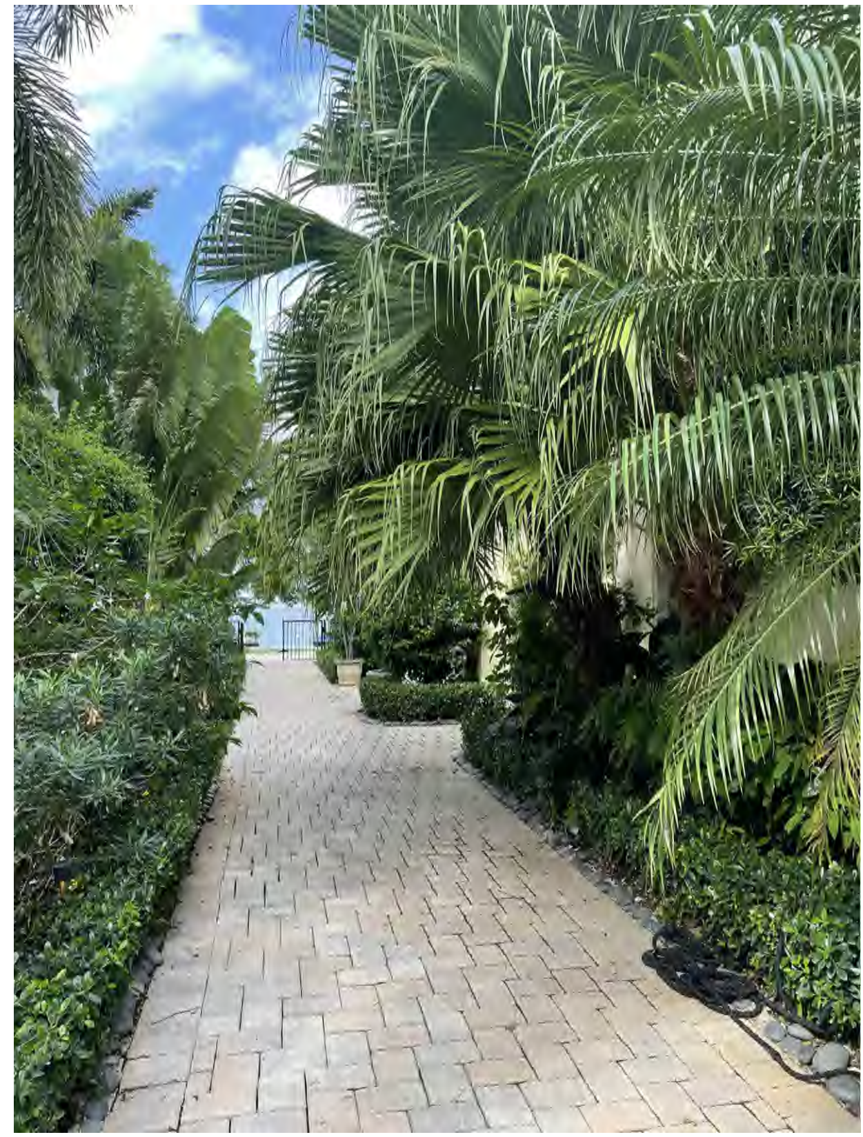
14 4580 PROPERTY - VIEW ALONG SOUTH SIDE 2021-11-19