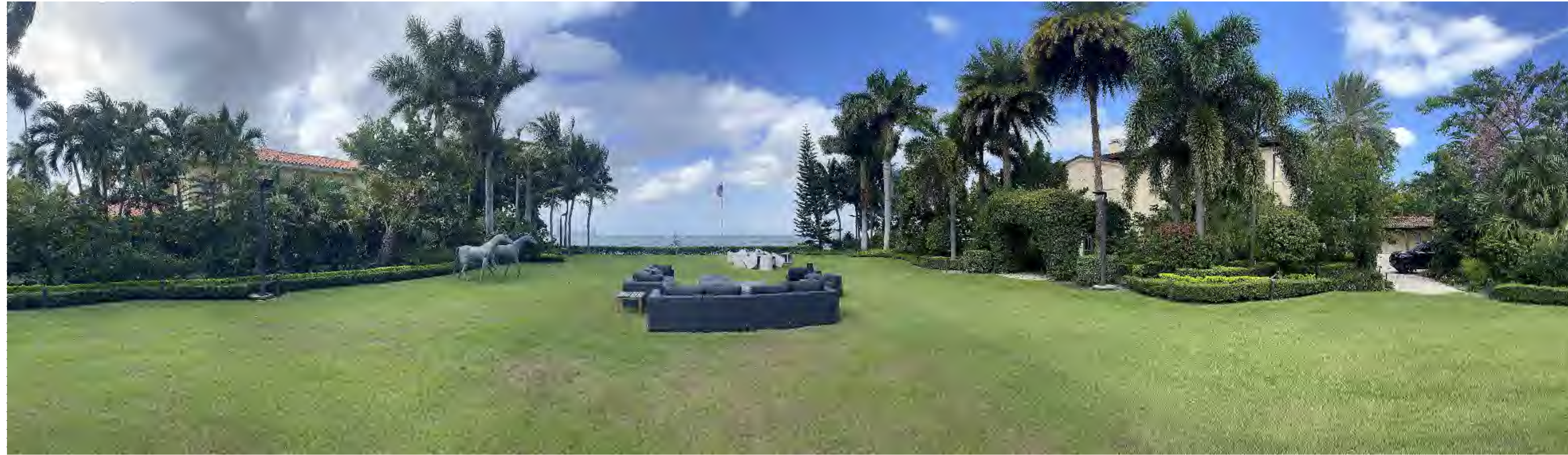
P5 VACANT PROPERTY - PANORAMA TOWARDS WATER 2021-11-19