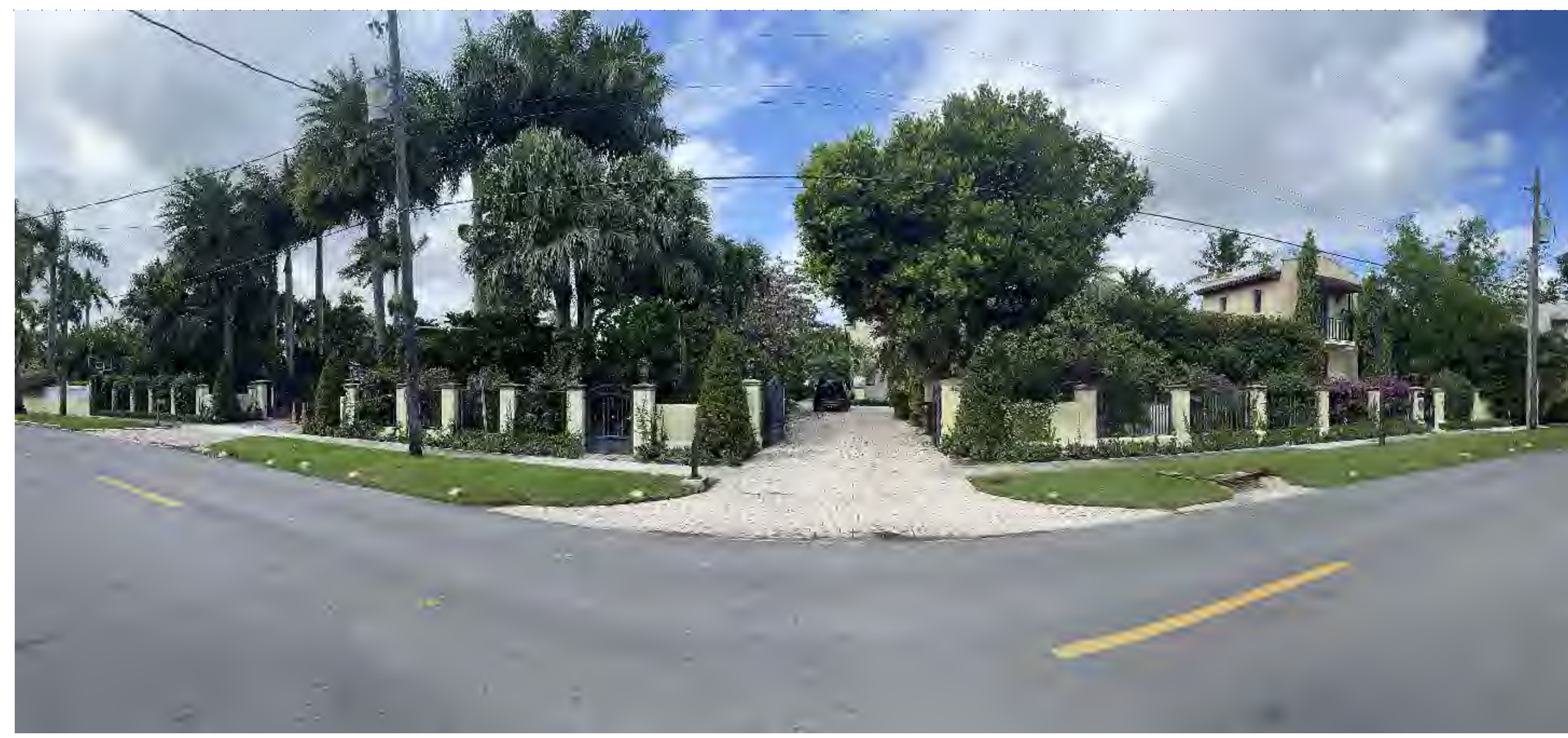
P12 4580 PROPERTY - PANORAMA AT FRONT OF PROPERTY 2021-11-19