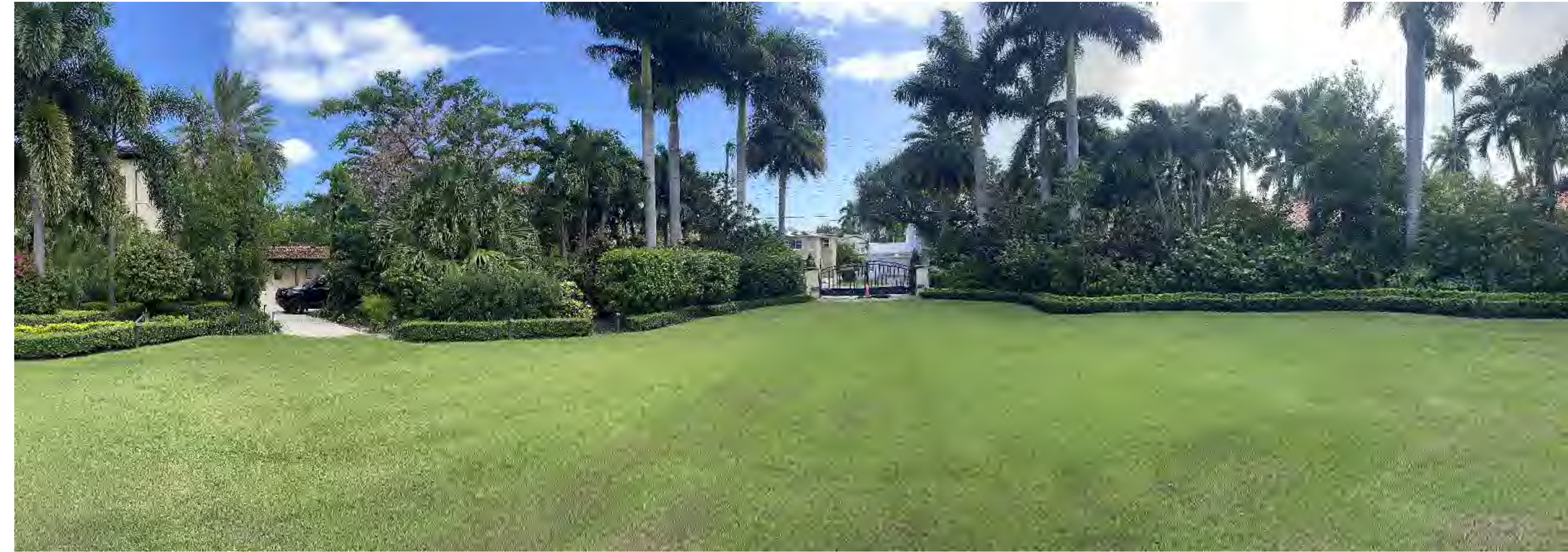
P6 VACANT PROPERTY - PANORAMA TOWARDS STREET 2021-11-19