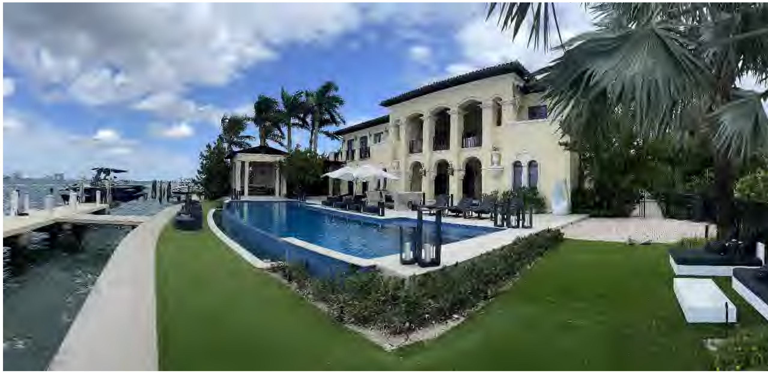
P18 4580 PROPERTY - PANORAMA FROM SW CORNER 2021-11-19