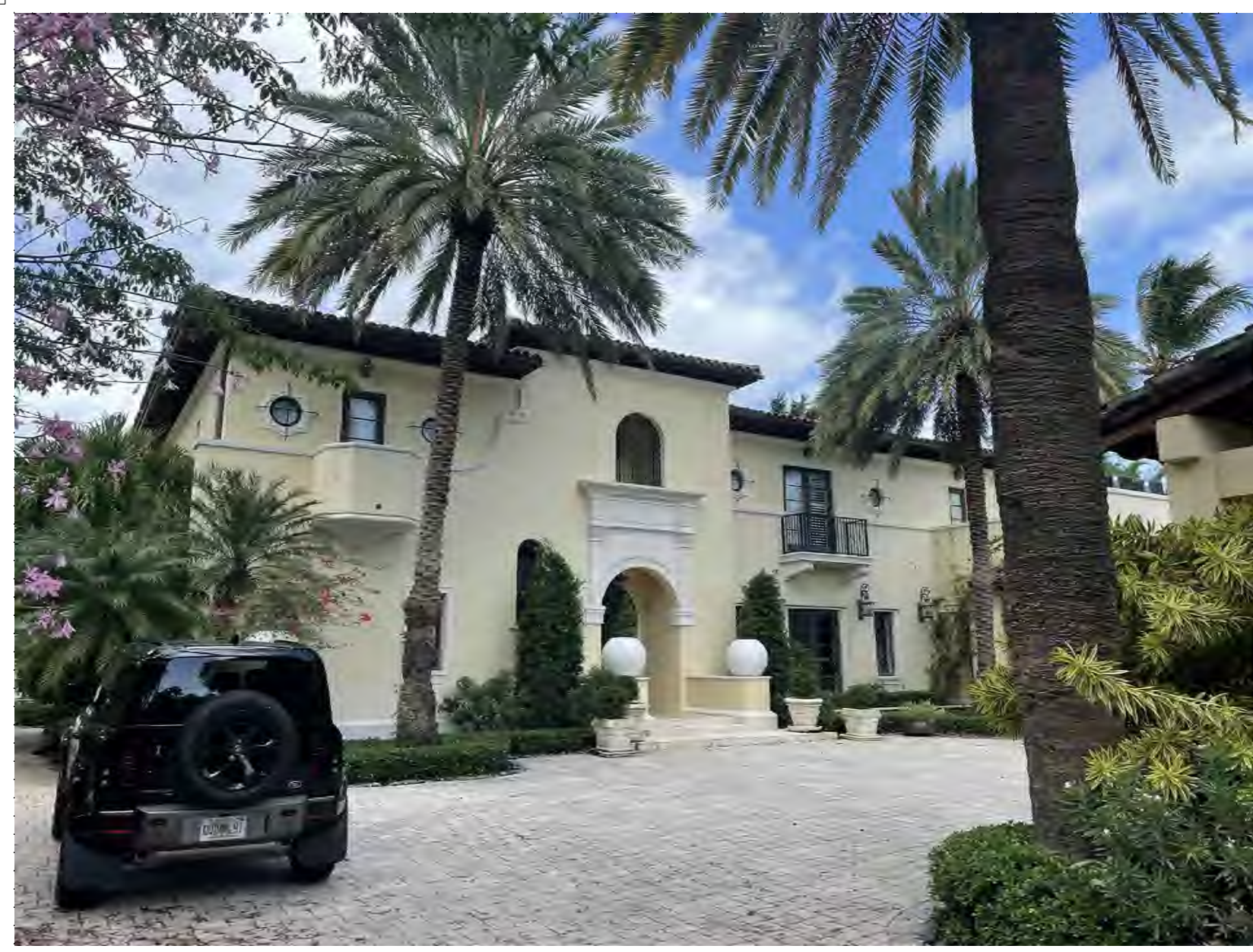
9 4580 PROPERTY - VIEW TOWARDS EX. HOUSE 2021-11-19