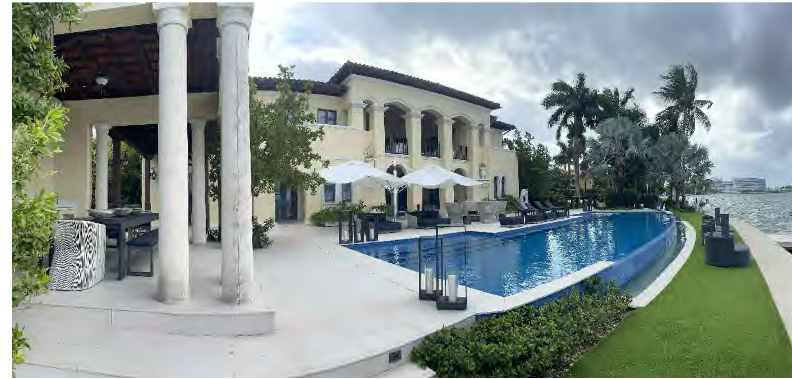
P19 4580 PROPERTY - PANORAMA FROM NW CORNER 2021-11-19