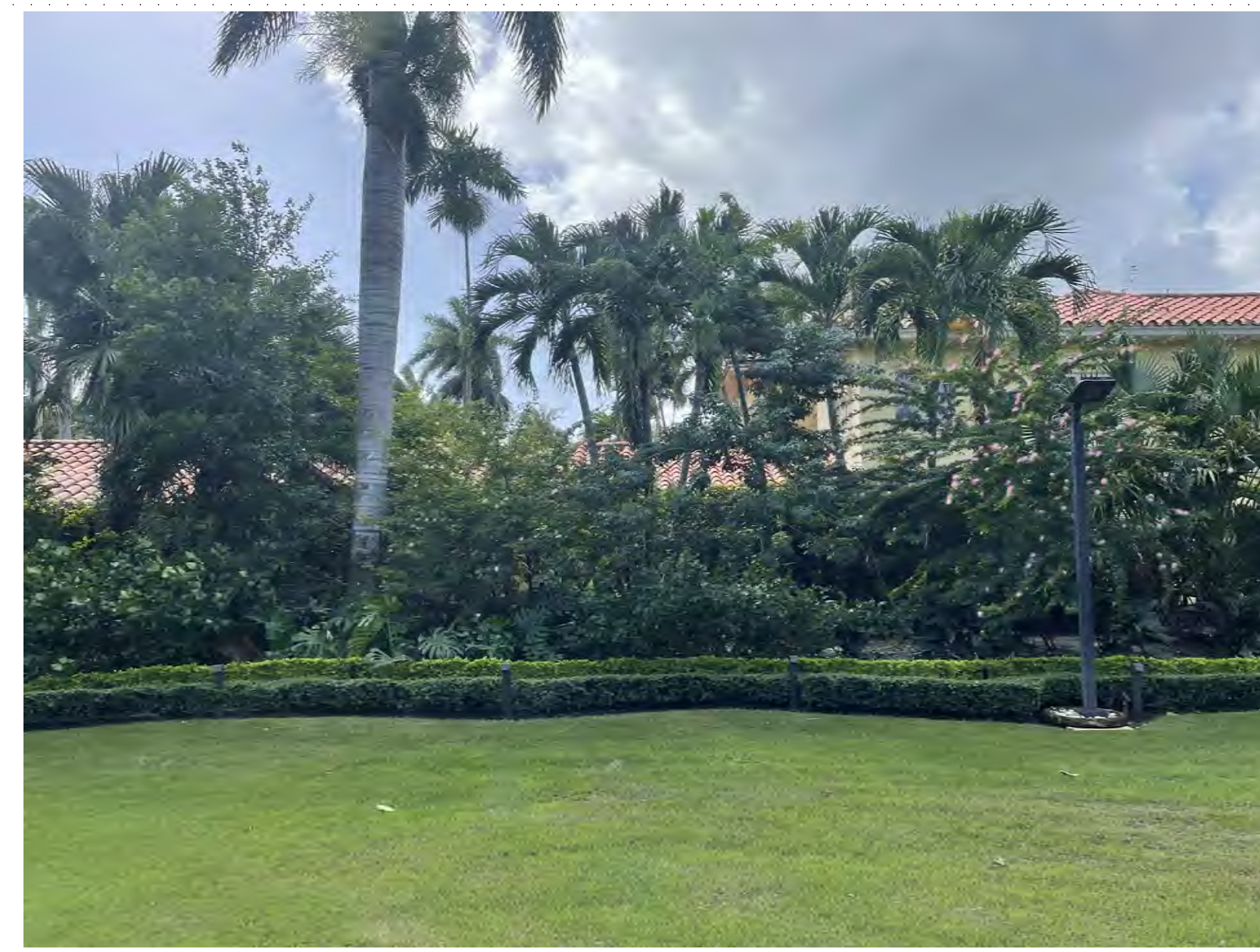
4 VACANT PROPERTY - VIEW TOWARDS SOUTH LINE 2021-11-19