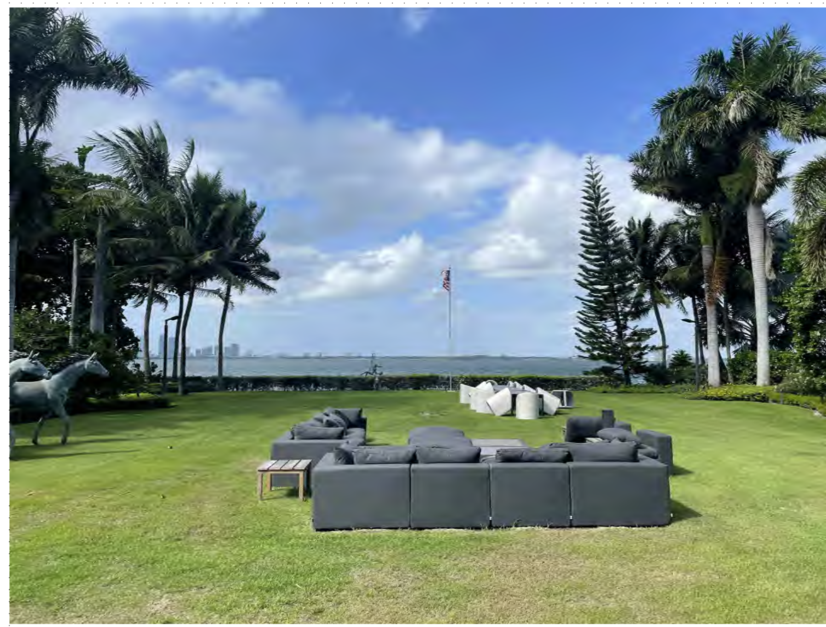
1 VACANT PROPERTY - VIEW TOWARDS WATER 2021-11-19