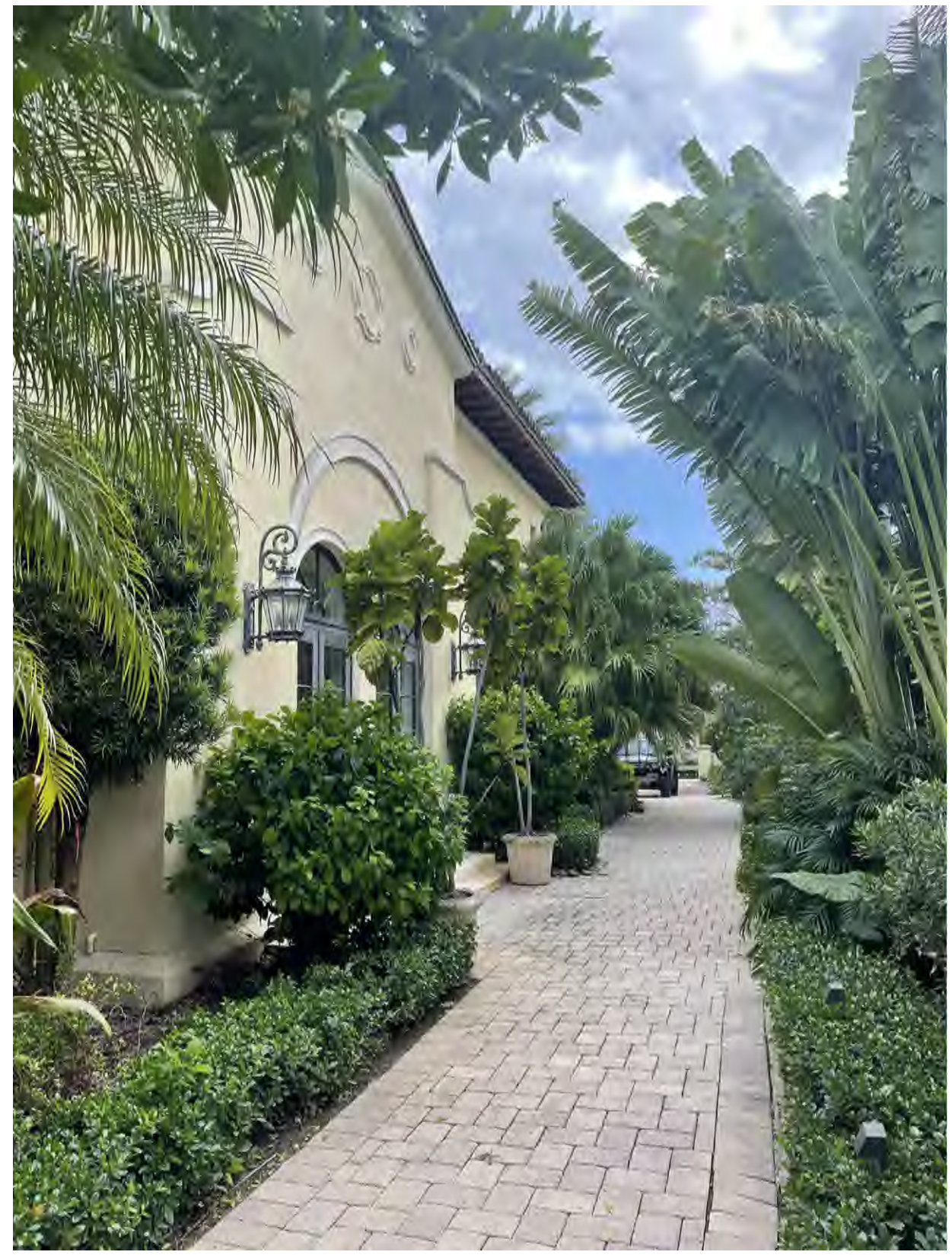
15 4580 PROPERTY - VIEW ALONG NORTH SIDE 2021-11-19