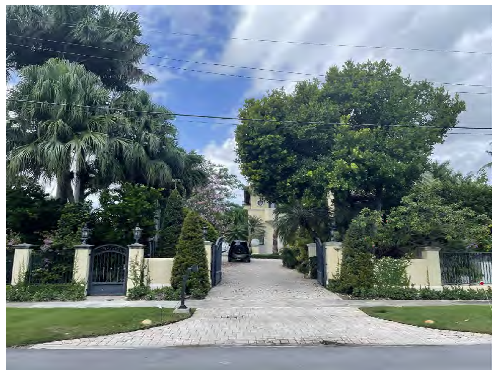
10 4580 PROPERTY - VIEW AT FRONT GATE 2021-11-19