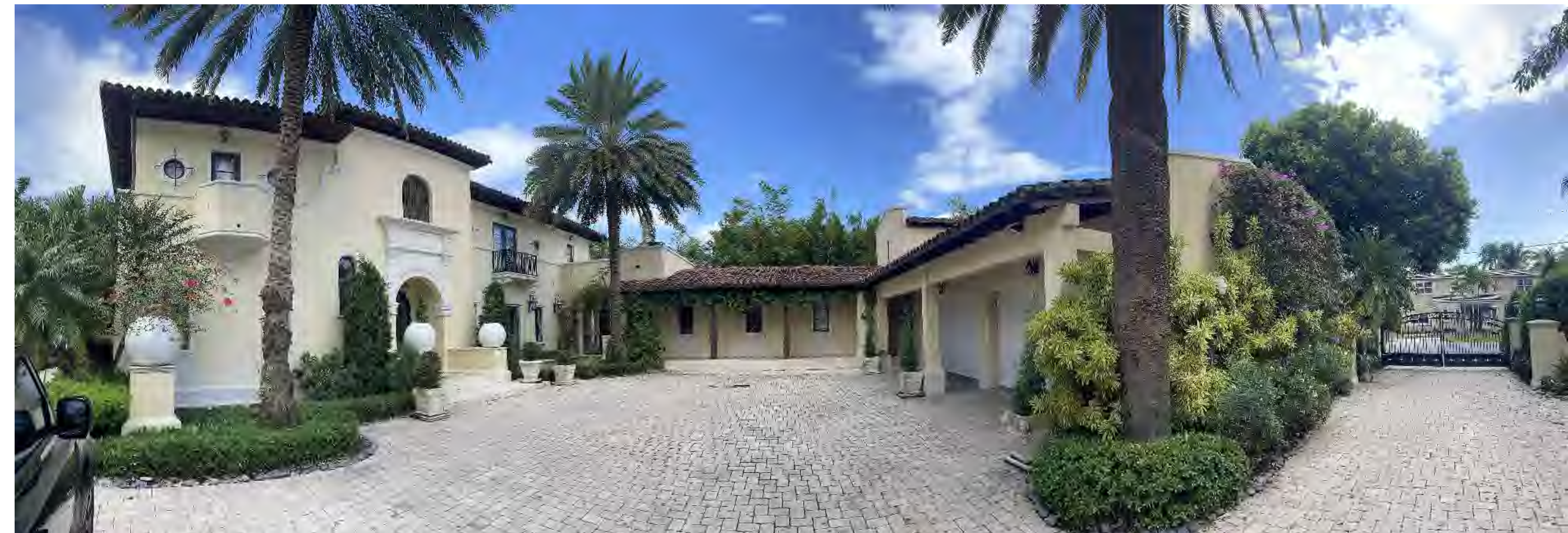
P8 4580 PROPERTY - PANORAMA TOWARDS HOUSE 2021-11-19