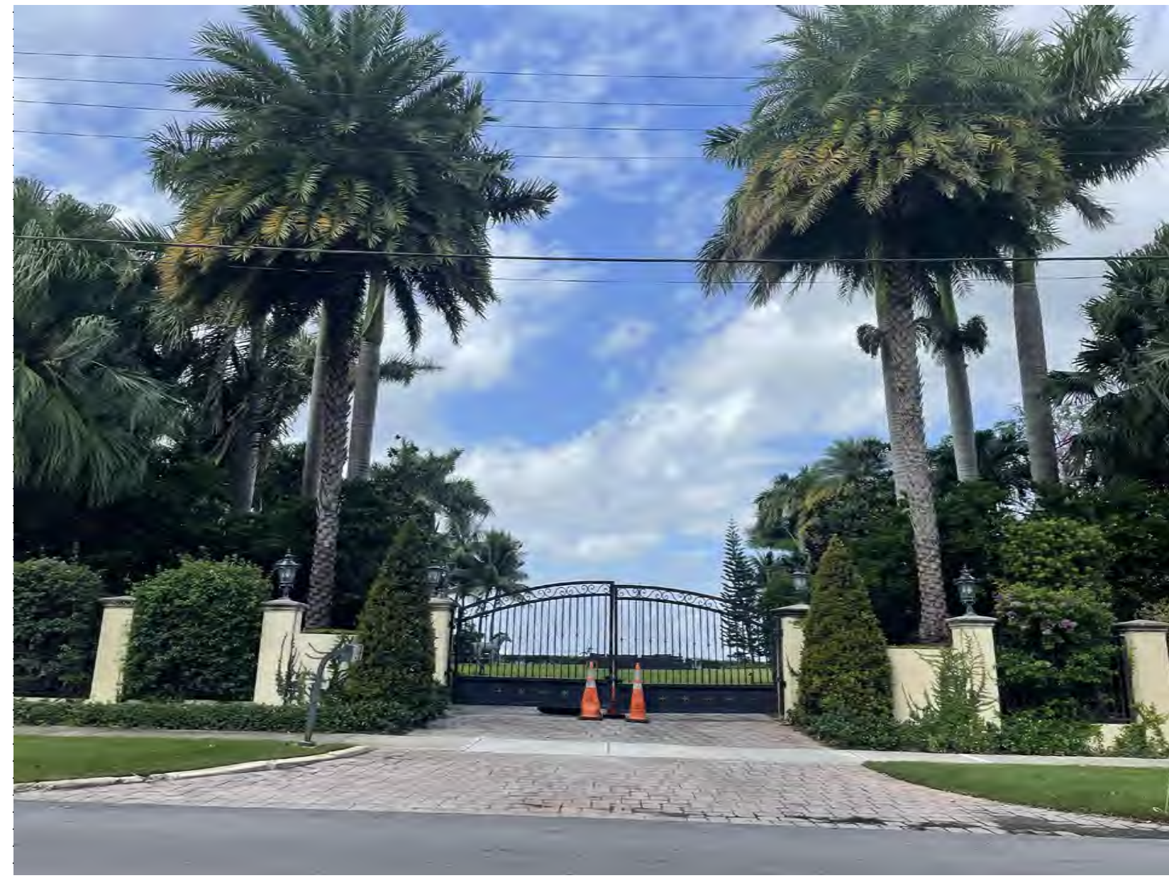
13 VACANT PROPERTY - VIEW AT FRONT GATE 2021-11-19