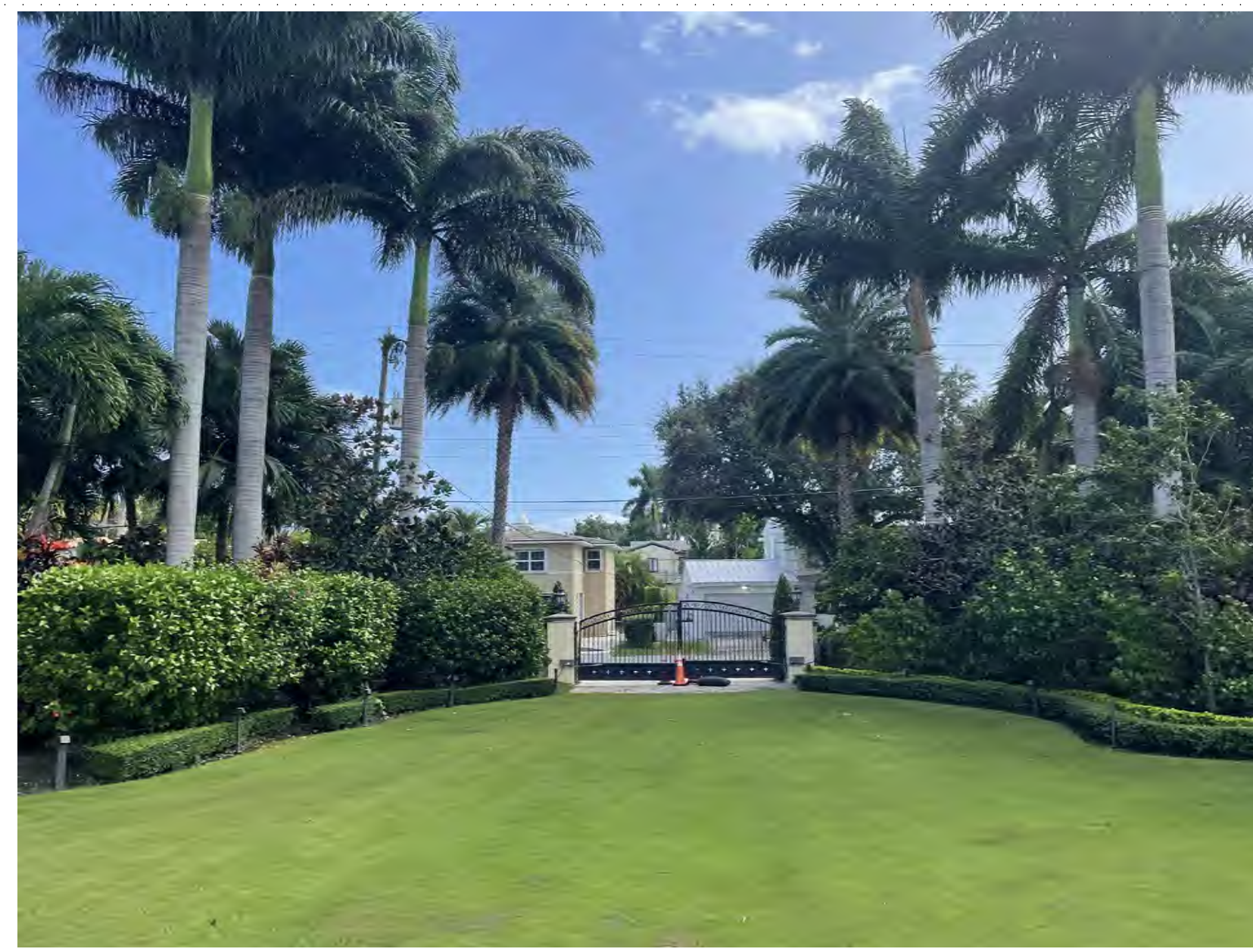
3 VACANT PROPERTY - VIEW TOWARDS STREET 2021-11-19