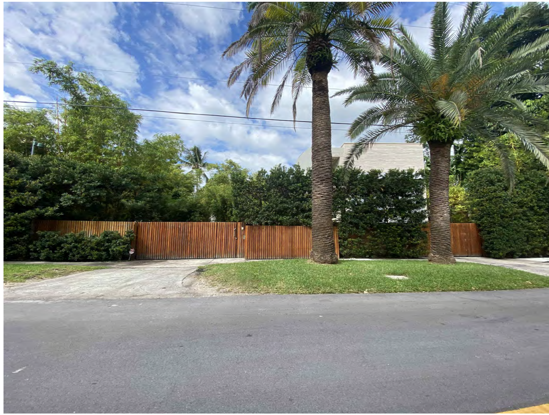
7 4600 NORTH BAY ROAD 2021-11-19