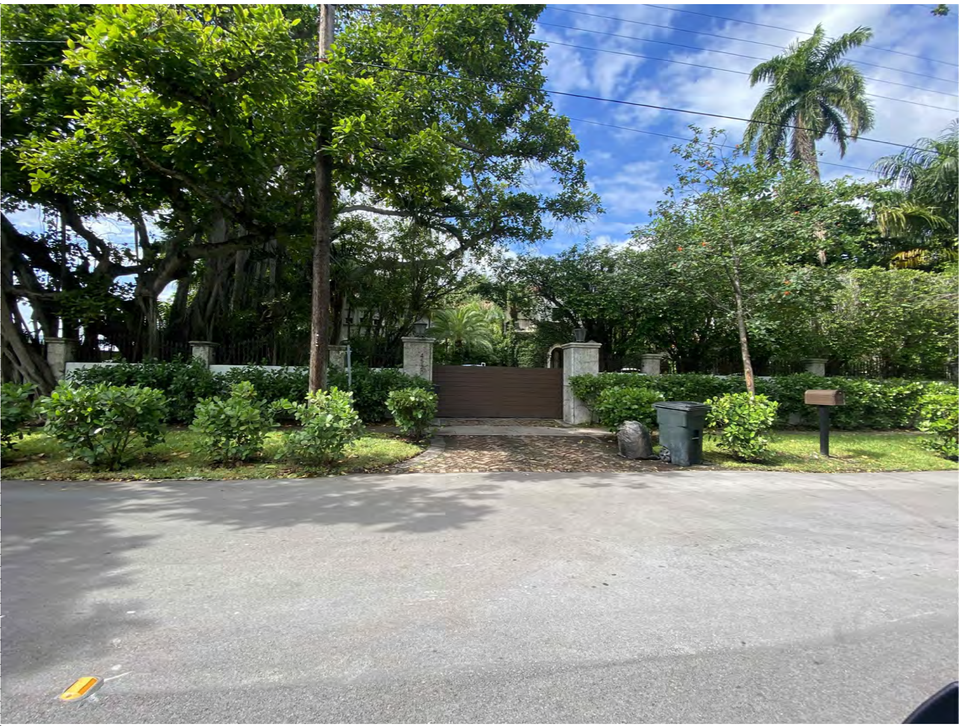
1 4520 NORTH BAY ROAD 2021-11-19