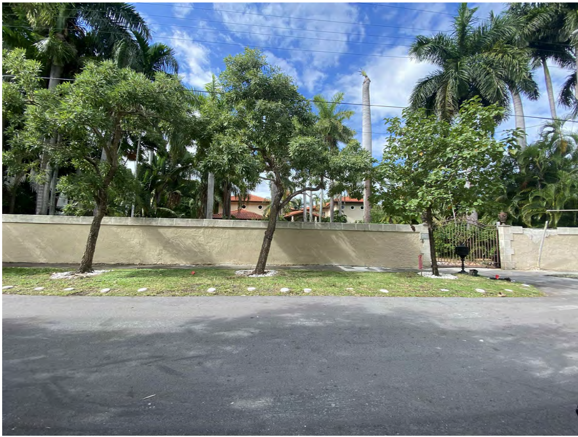
2 4540 NORTH BAY ROAD 2021-11-19