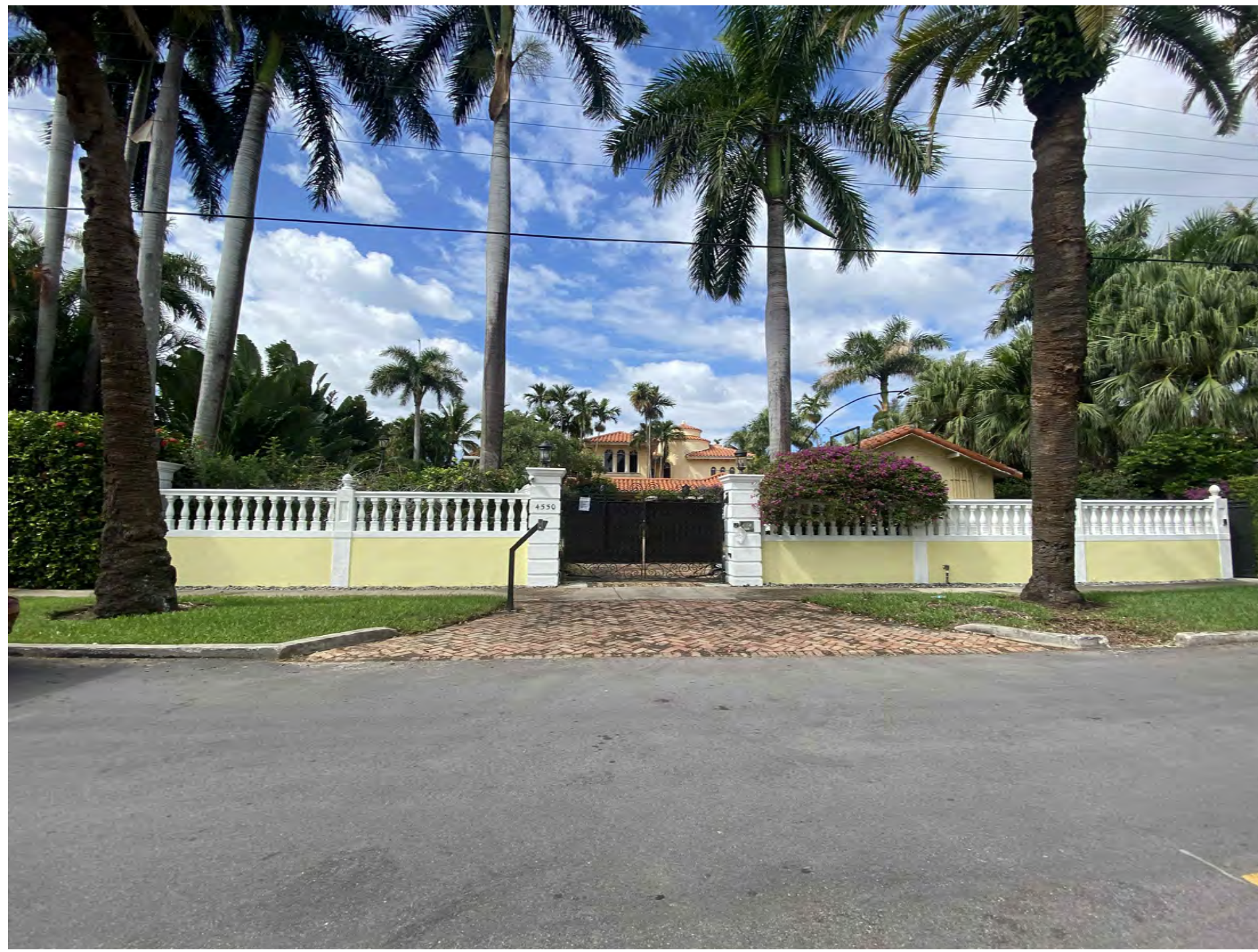
3 4550 NORTH BAY ROAD 2021-11-19