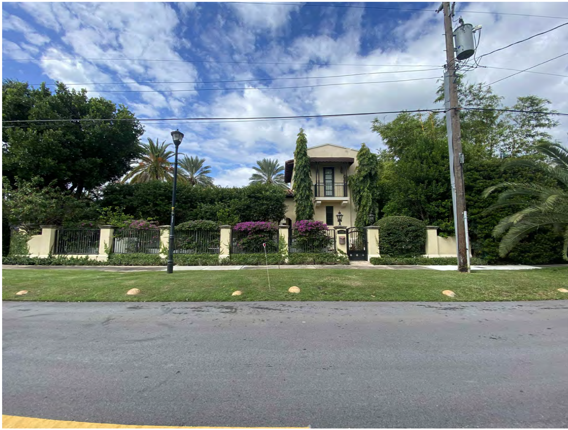
6 4580 NORTH BAY ROAD (SUBJECT PROPERTY) 2021-11-19