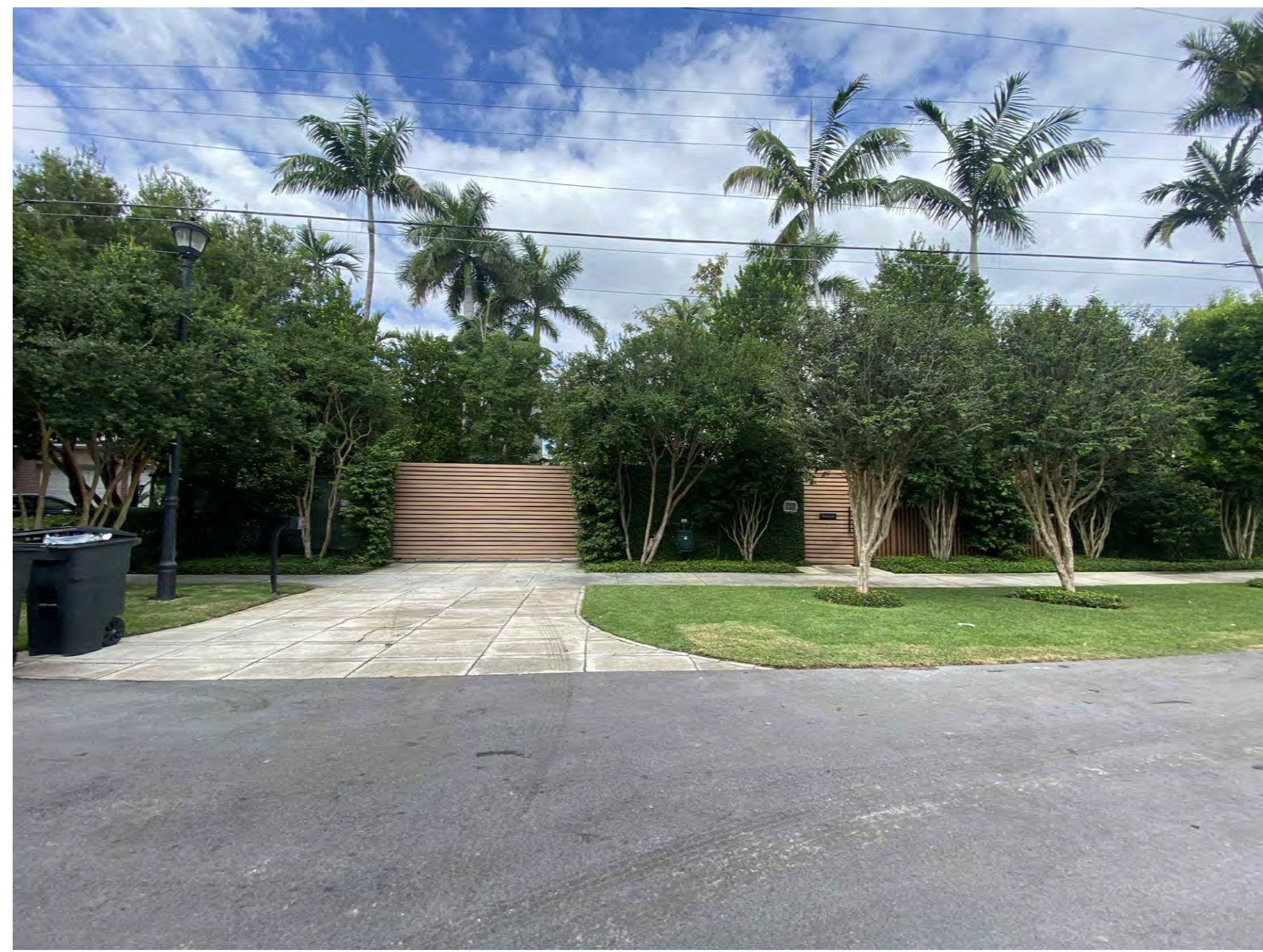
12 4666 NORTH BAY ROAD 2021-11-19

*FINAL SUBMITTAL* DRB21-0771 - JAN 3 2022