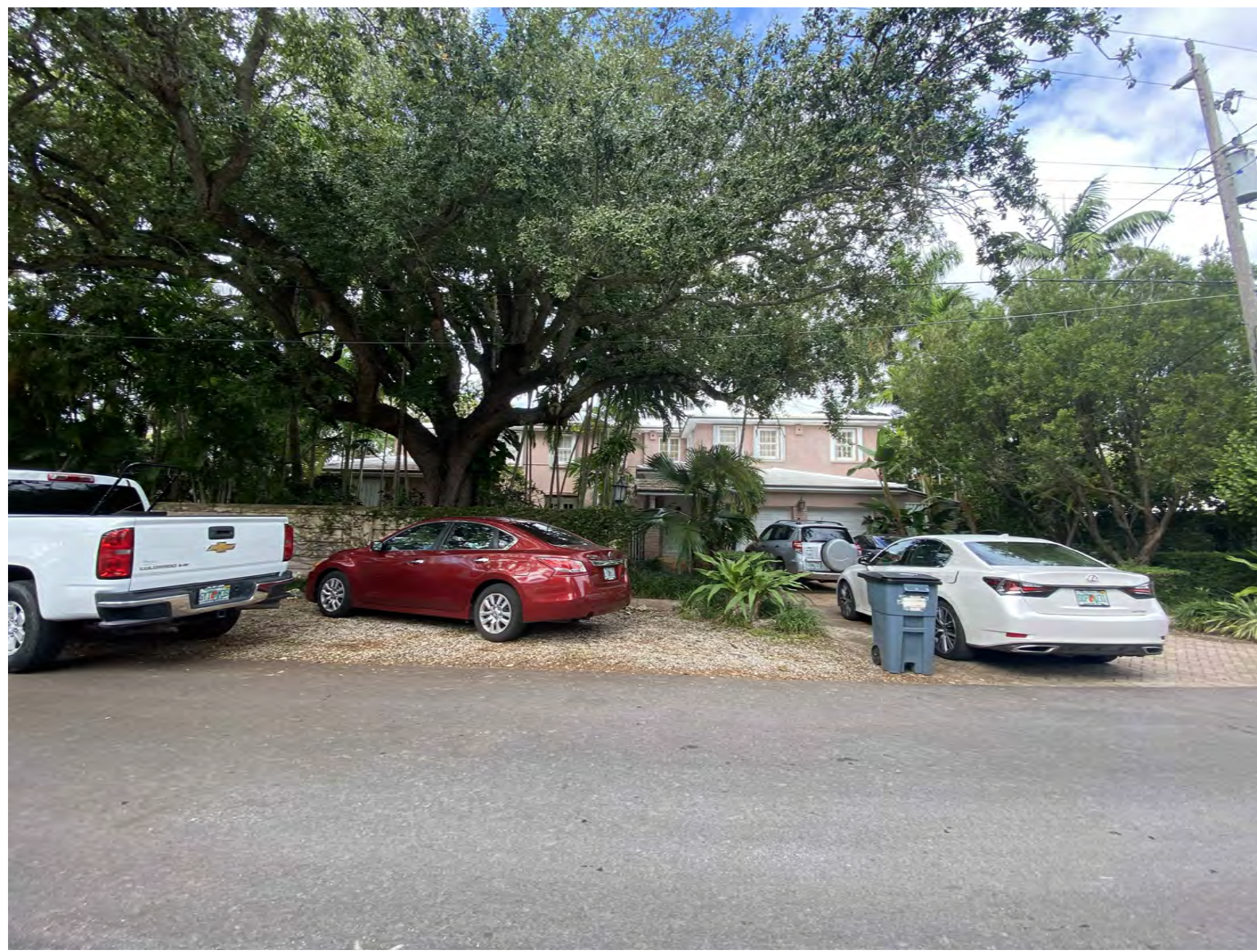
11 4646 NORTH BAY ROAD 2021-11-19