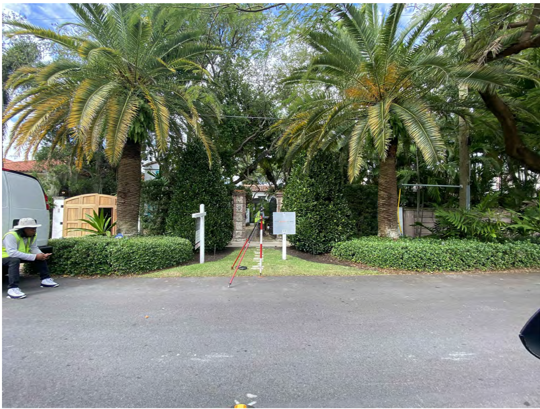
10 4640 NORTH BAY ROAD 2021-11-19