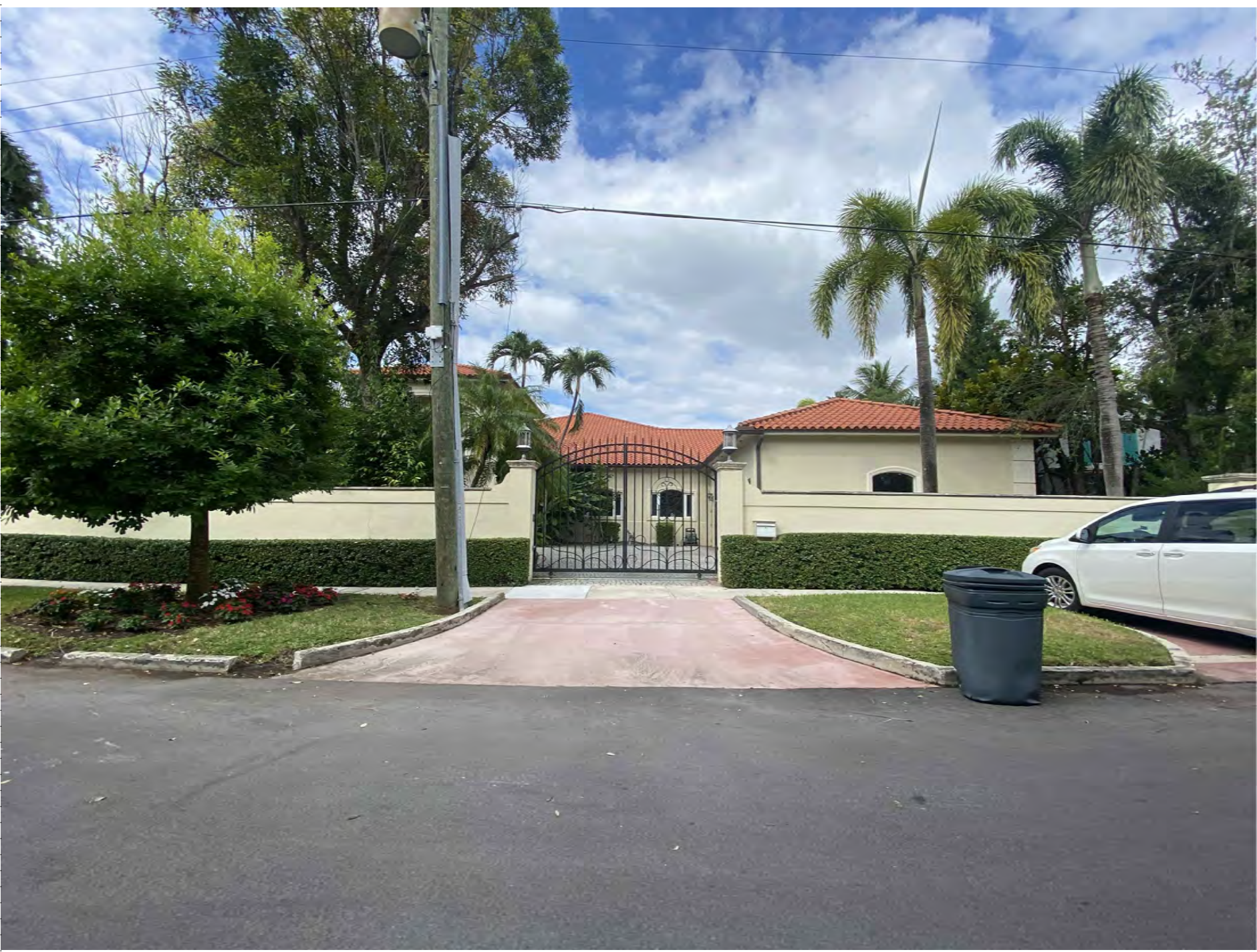
9 4622 NORTH BAY ROAD 2021-11-19