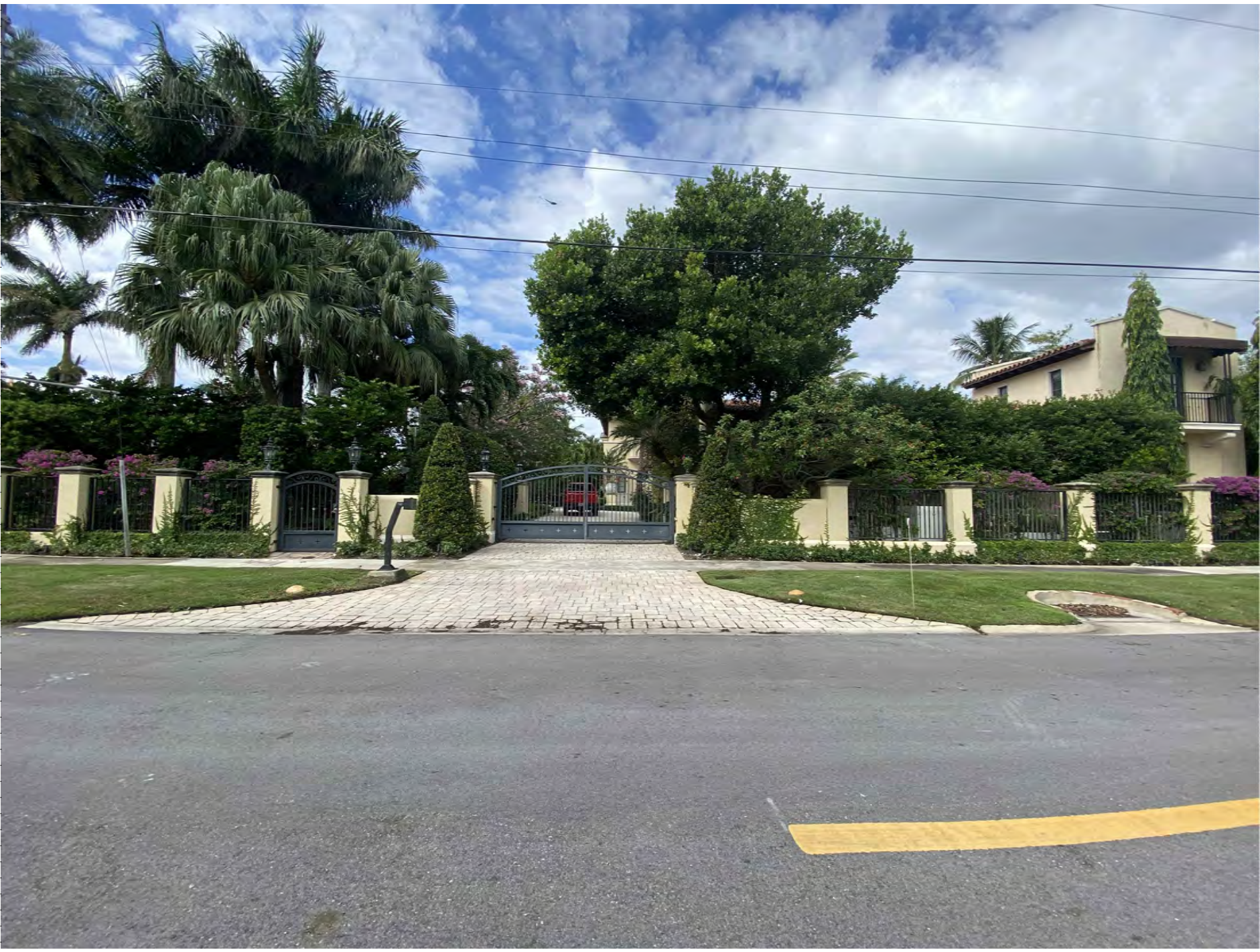
5 4570 NORTH BAY ROAD (SUBJECT PROPERTY) 2021-11-19