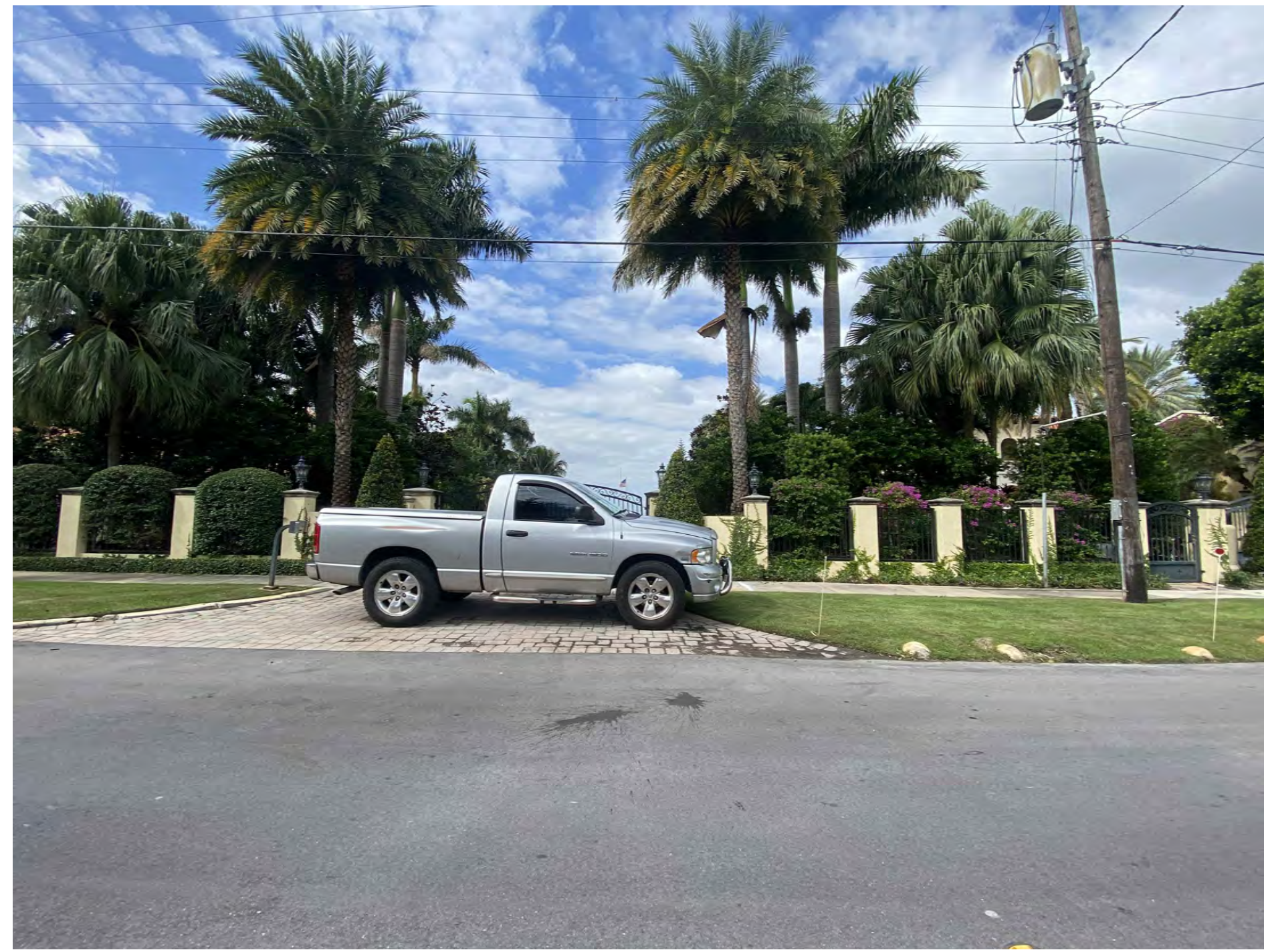
4 4570 NORTH BAY ROAD (SUBJECT PROPERTY) 2021-11-19