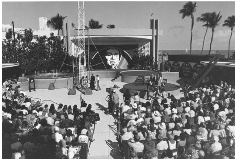
Figure 4: Historic photograph of 1974 filming of the Mike Douglas Show at the North Beach Bandshell.