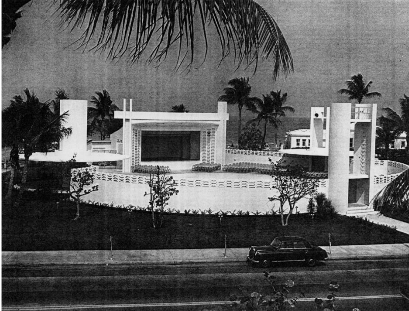
Figure 3: Historic photograph of North Beach Bandshell taken between 1961 and 1974.

Name of multiple listing (if applicable)