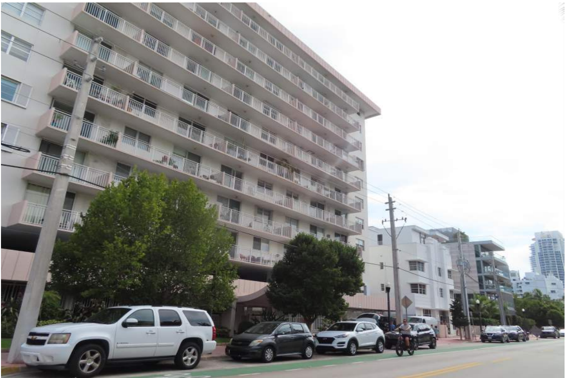
Figure 8: West face of 345 Ocean Drive Miami Beach, FL