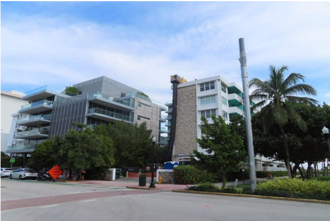
Figure 2: West face of 321 Ocean Drive (left) and 301 Ocean Drive (right).