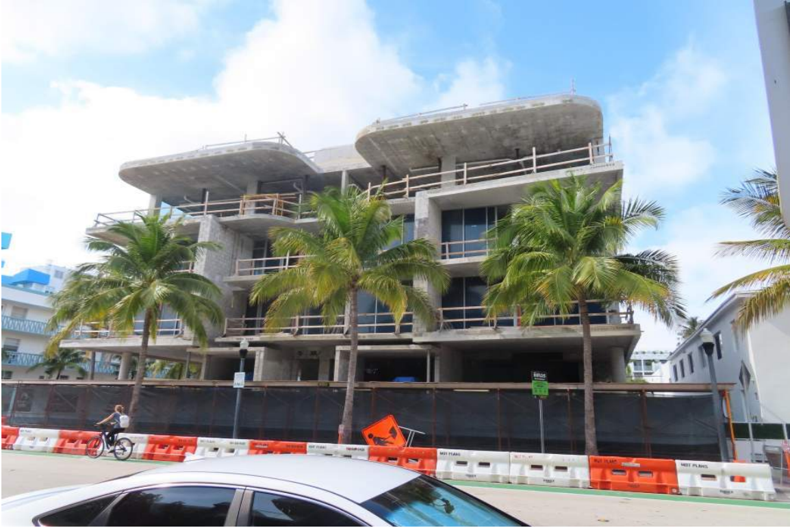
Figure 5: East face of building under construction at 310 Ocean Drive.