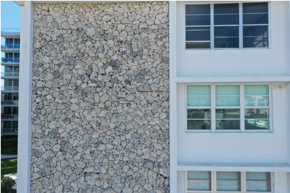
Figure 6: General view of West elevation.