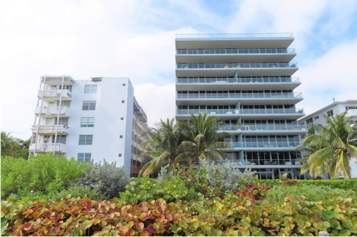
Figure 1: East face of 301 Ocean Drive (left) and 321 Ocean Drive (right).