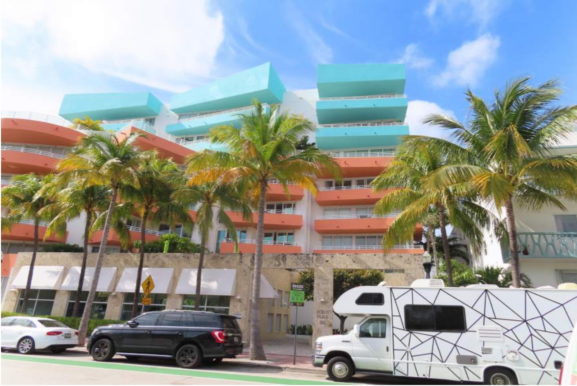
Figure 3: East face of 226 Ocean Drive. Photo taken from the southwest corner of 301 Ocean Drive.