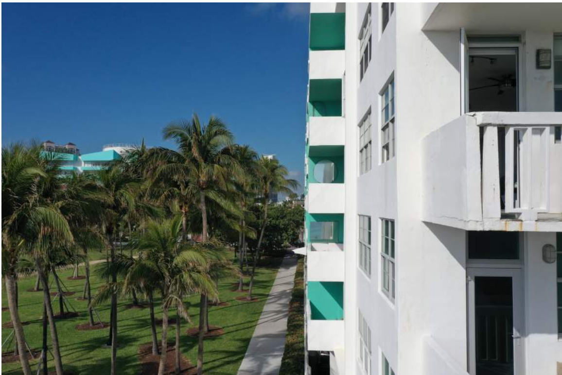
Figure 2: Existing South and East balconies.