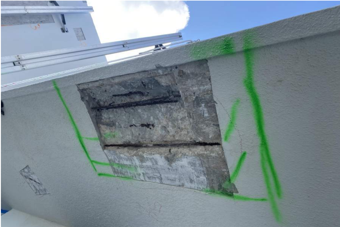
Figure 9: Probing performed on underside of concrete slab at North catwalk revealing extent of deterioration and previous repairs.