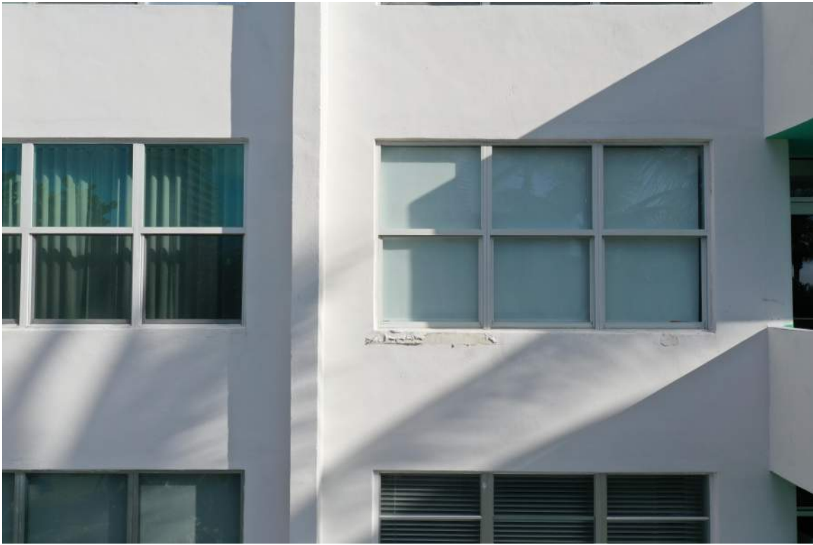
Figure 7: Photo taken at Level 2 along south building face.