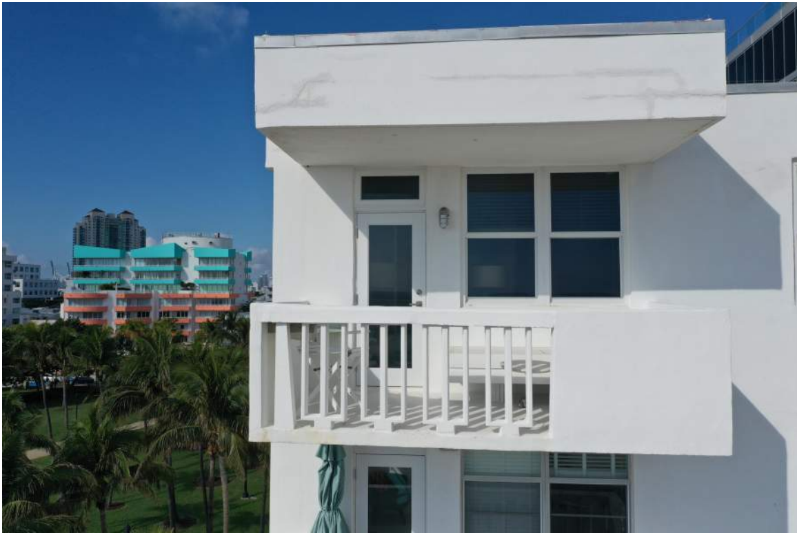
Figure 1: East balcony at 6th floor with existing precast decorative railing.