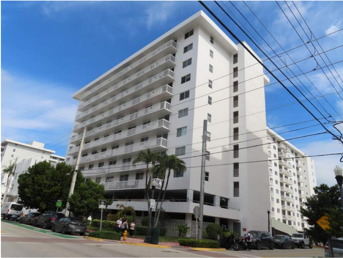
Figure 9: West face of 401 Ocean Drive Miami Beach, FL