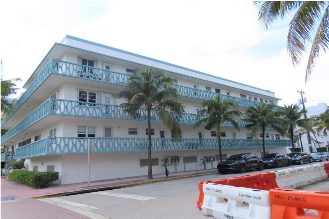
Figure 4: Northwest corner of building exterior at 260 Ocean Drive Miami Beach, FL. Property located on the corner of Ocean Drive and 3rd St.