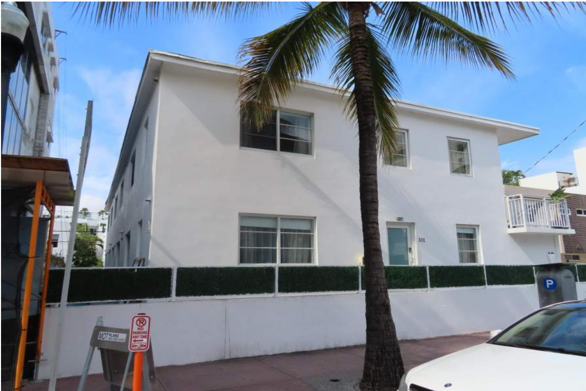
Figure 6: East face of existing structure at 320 Ocean Drive.