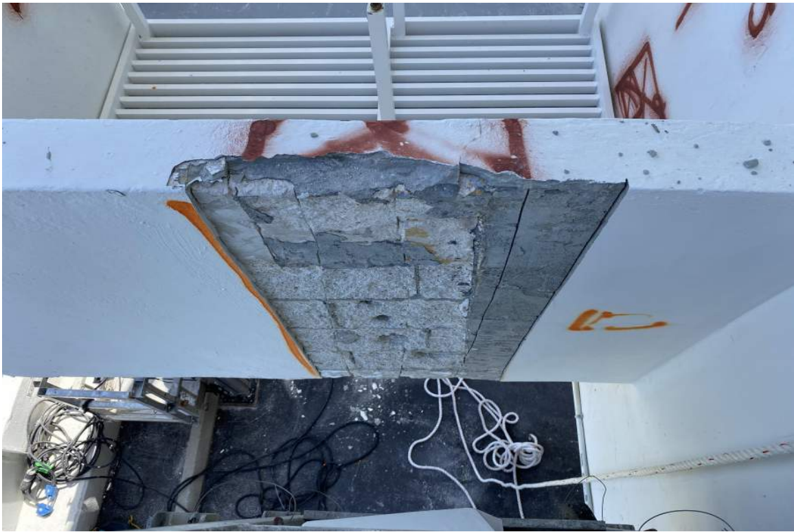
Figure 5: Condition of existing masonry walls at East balcony.