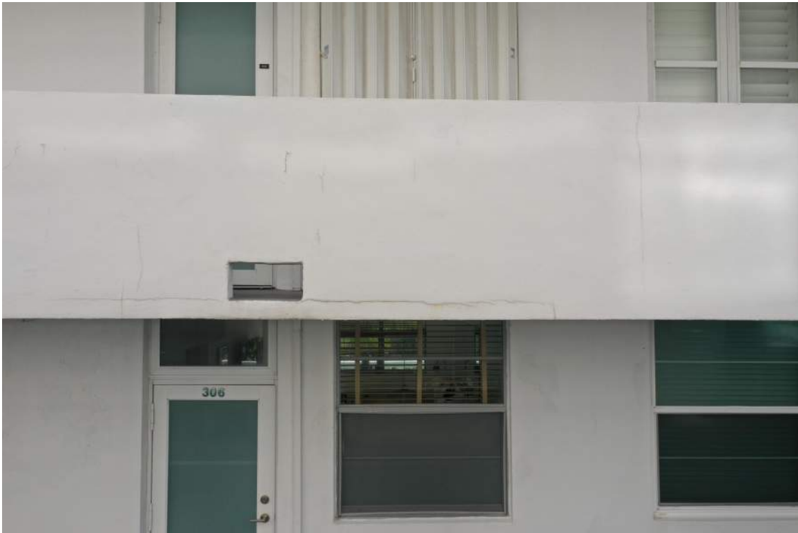
Figure 3: Existing North catwalks with signs of cracking and deterioration.