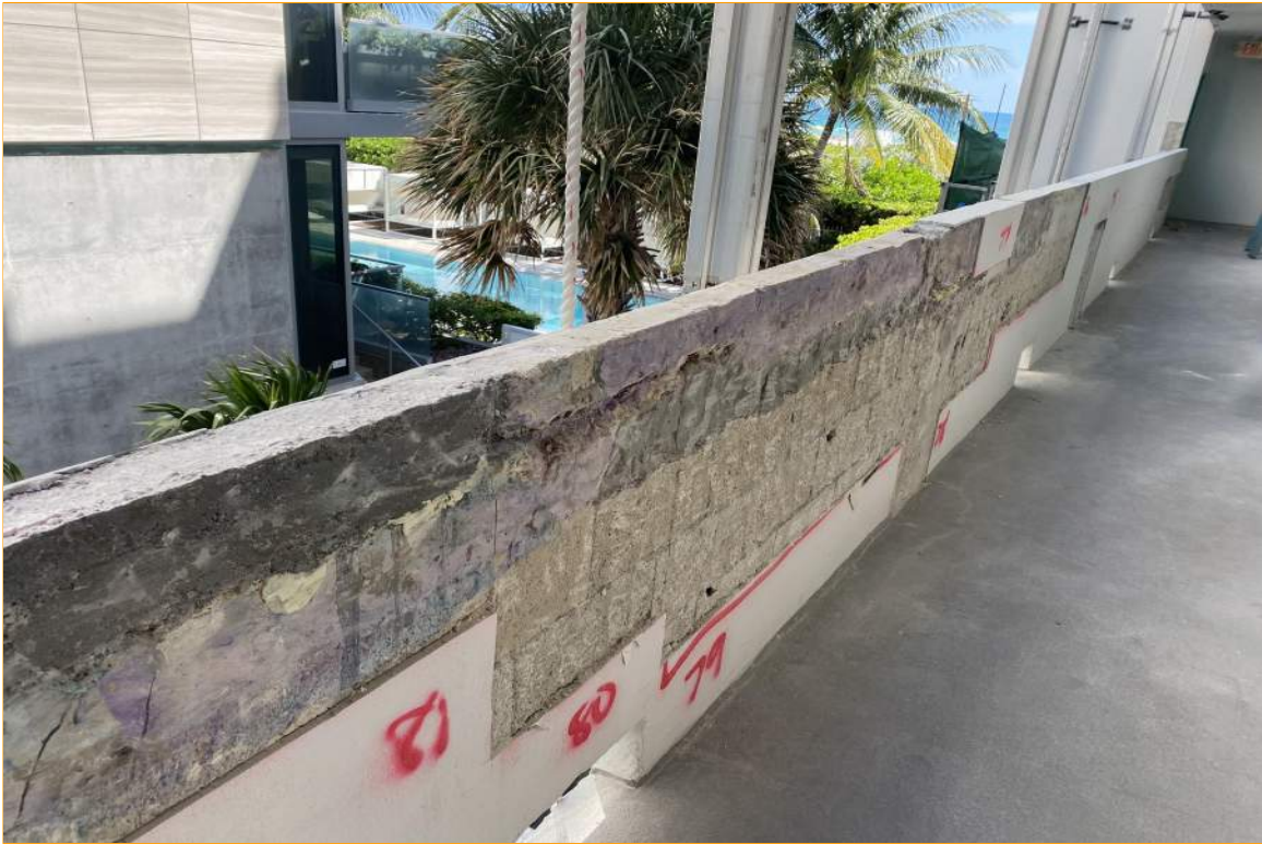
Figure 8: Existing deteriorated condition of masonry wall at North catwalks.