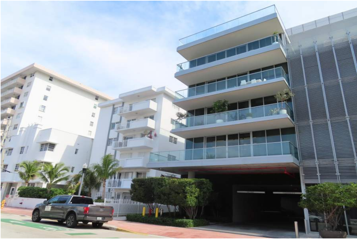
Figure 7: West face of 325 Ocean Drive Miami Beach, FL