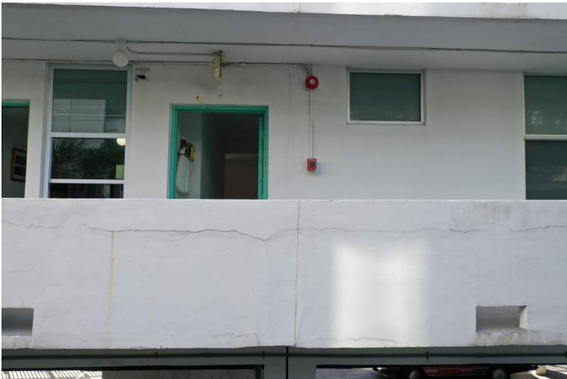
Figure 4: Existing North catwalks with signs of cracking and deterioration.