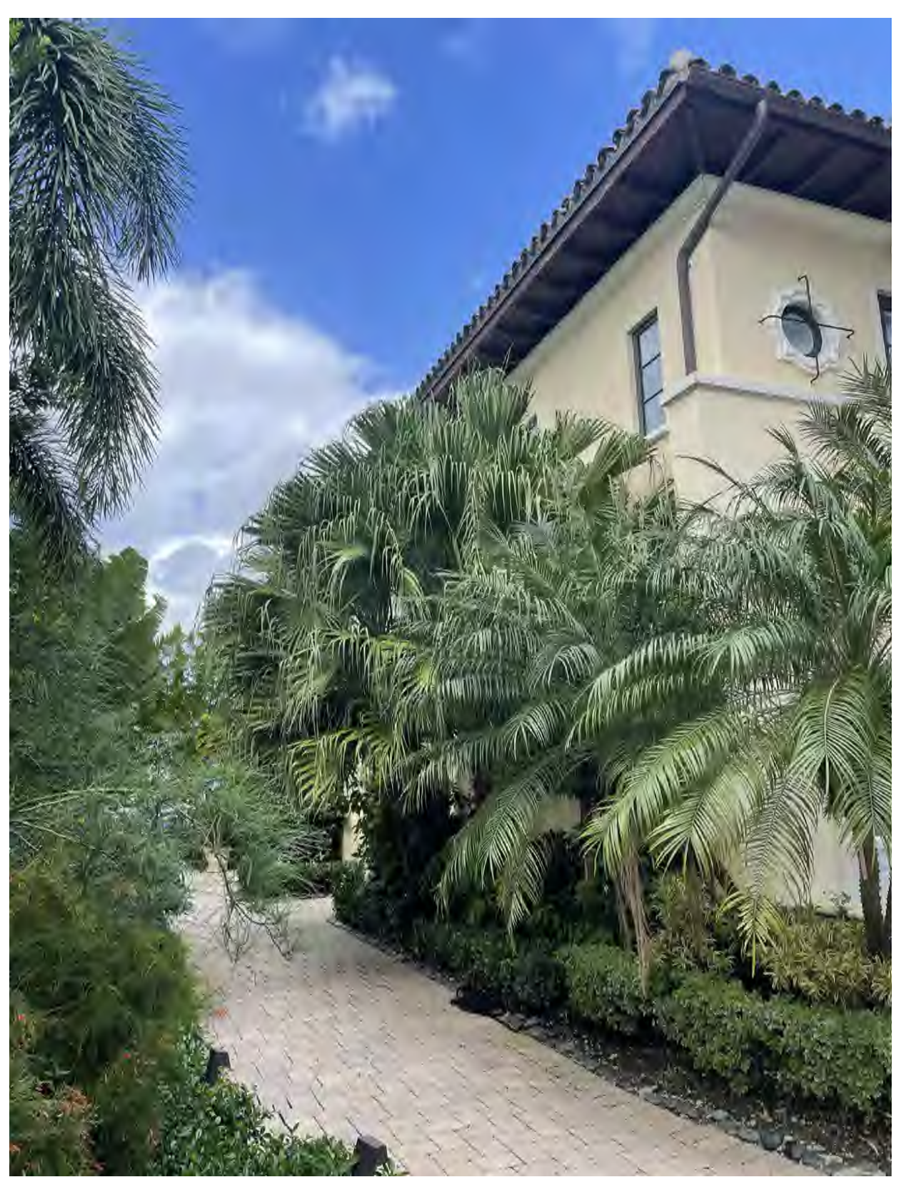
4580 PROPERTY - PANORAMA TOWARDS HOUSE