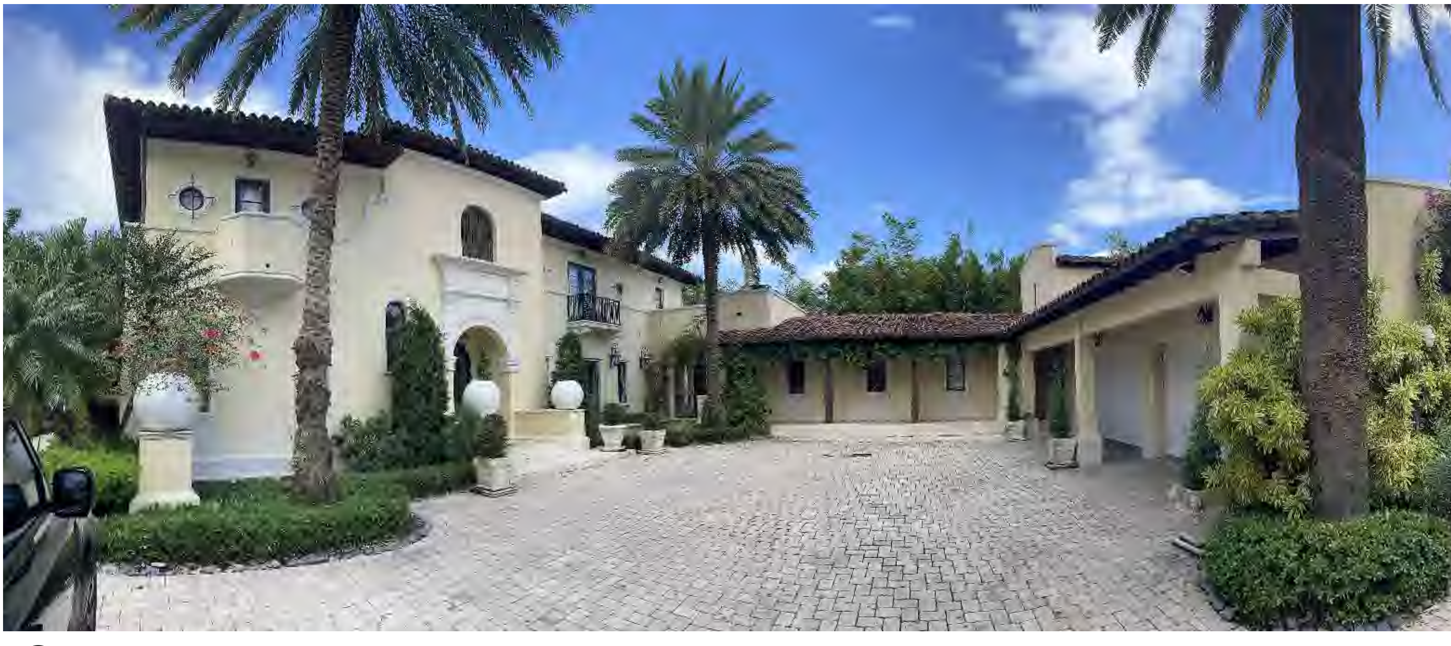
(P8) 4580 PROPERTY - PANORAMA TOWARDS HOUSE