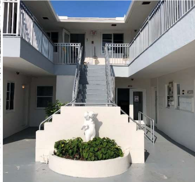
Photograph of stepped low wall with fountain

The applicant is currently proposing the construction of a 2-story addition and a small 1-story rooftop addition as part of a redevelopment project consisting of 49 hotel units and a rooftop amenity deck. In order to construct the new additions, the applicant is proposing to demolish portions of the 1956 addition. The remainder of the building is proposed to be substantially restored including the removal of the likely non-original office enclosure as well as the restoration of the historic pole sign. Staff would note that the applicant is also proposing to remove the exterior catwalk stairs to create private terraces for the second level units. Staff is not opposed to this modification; however, staff recommends that the original stepped low wall with planter and sculpture (presumed to have been a fountain) be retained and restored.