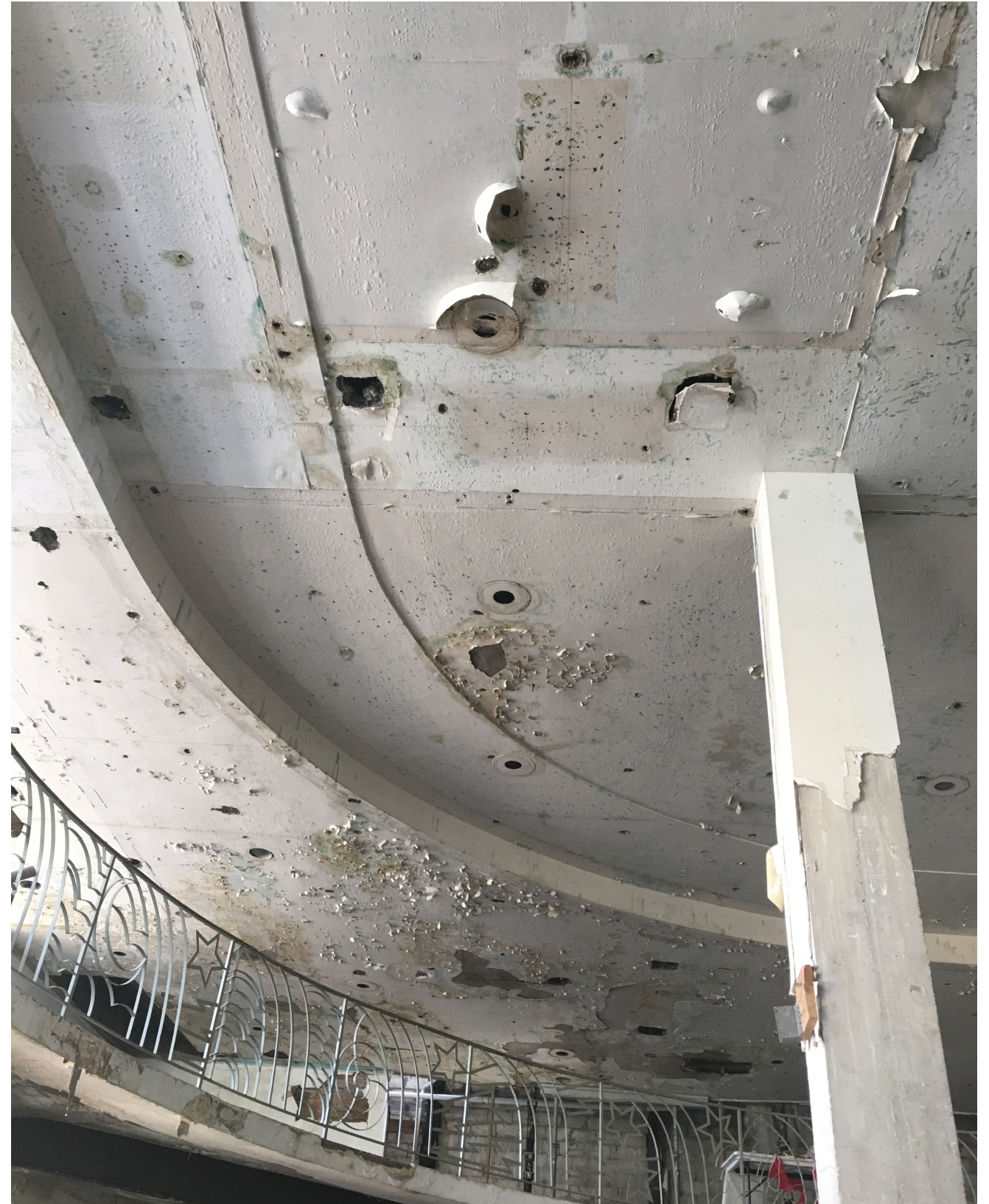
REPRESENTATIVE PHOTOS OF DAMAGED PLASTER CEILING