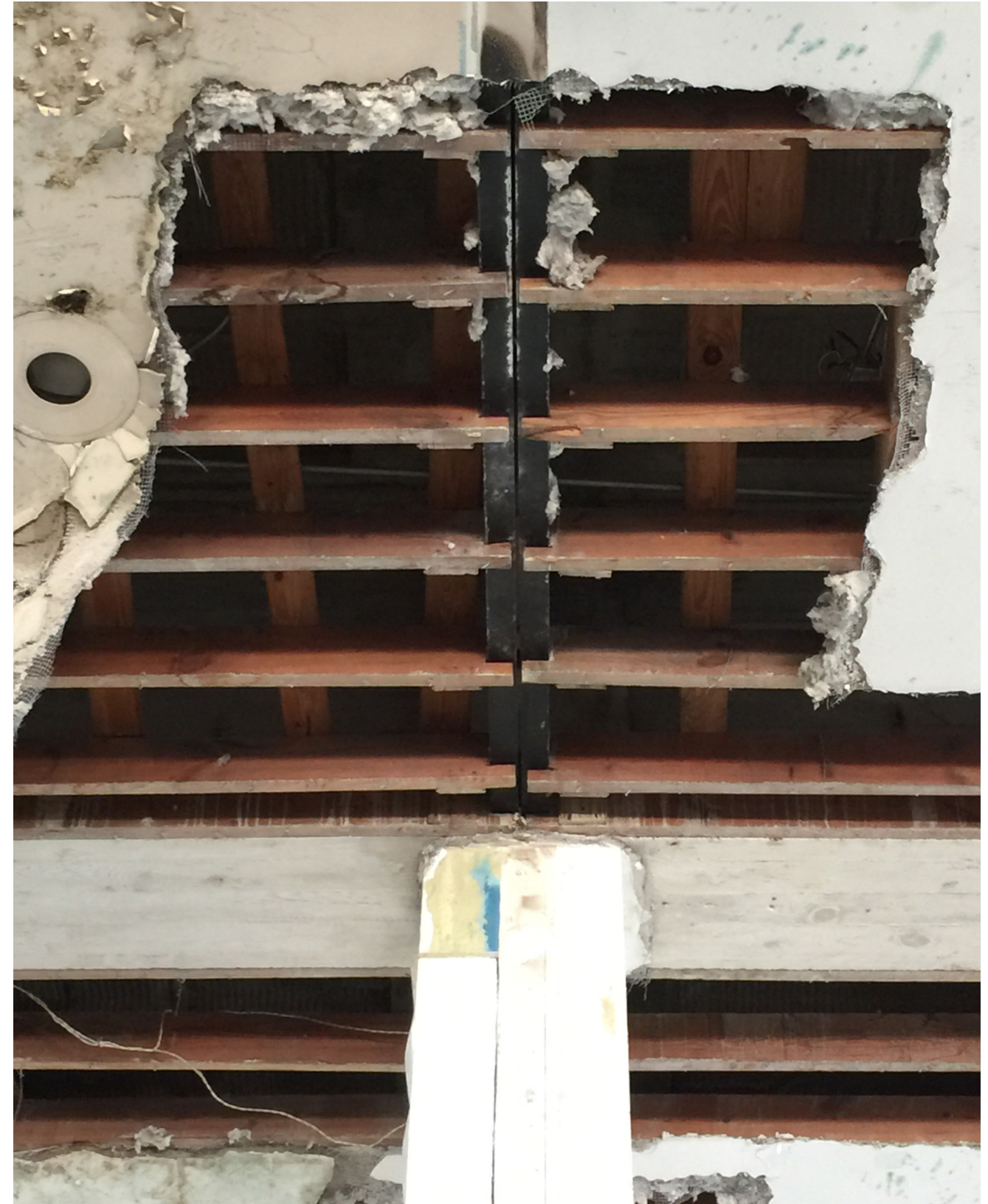
EXPOSED PORTIONS OF NON-COMPLIANT CEILING SUPPORT SYSTEM