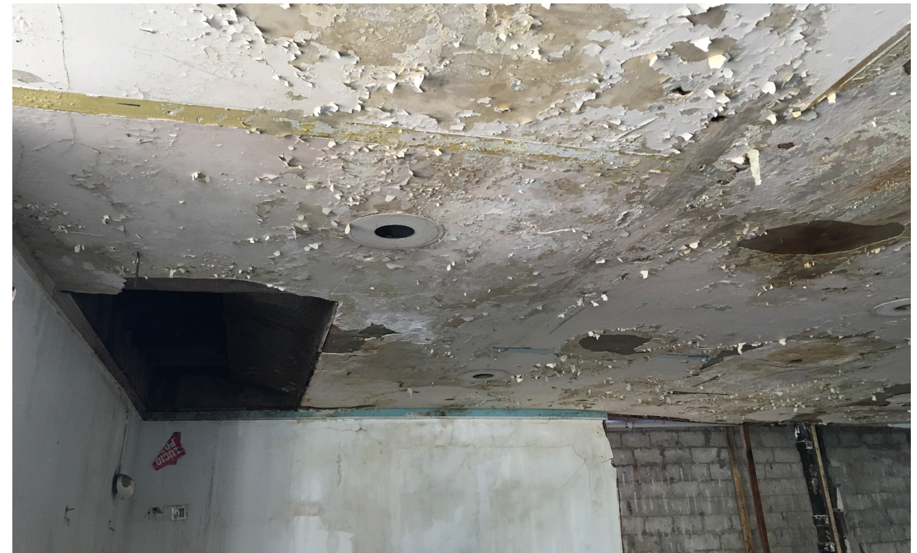
REPRESENTATIVE PHOTOS OF DAMAGED PLASTER CEILING