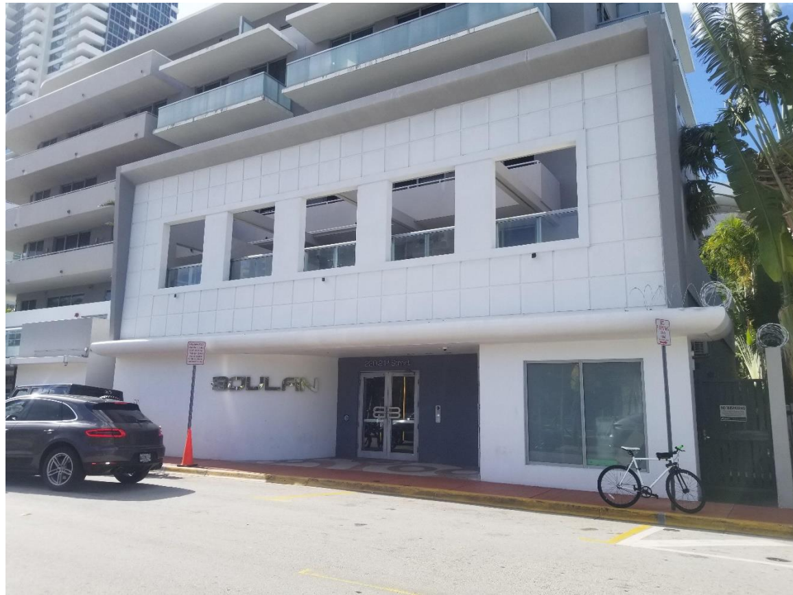
(1) - 3/8/21