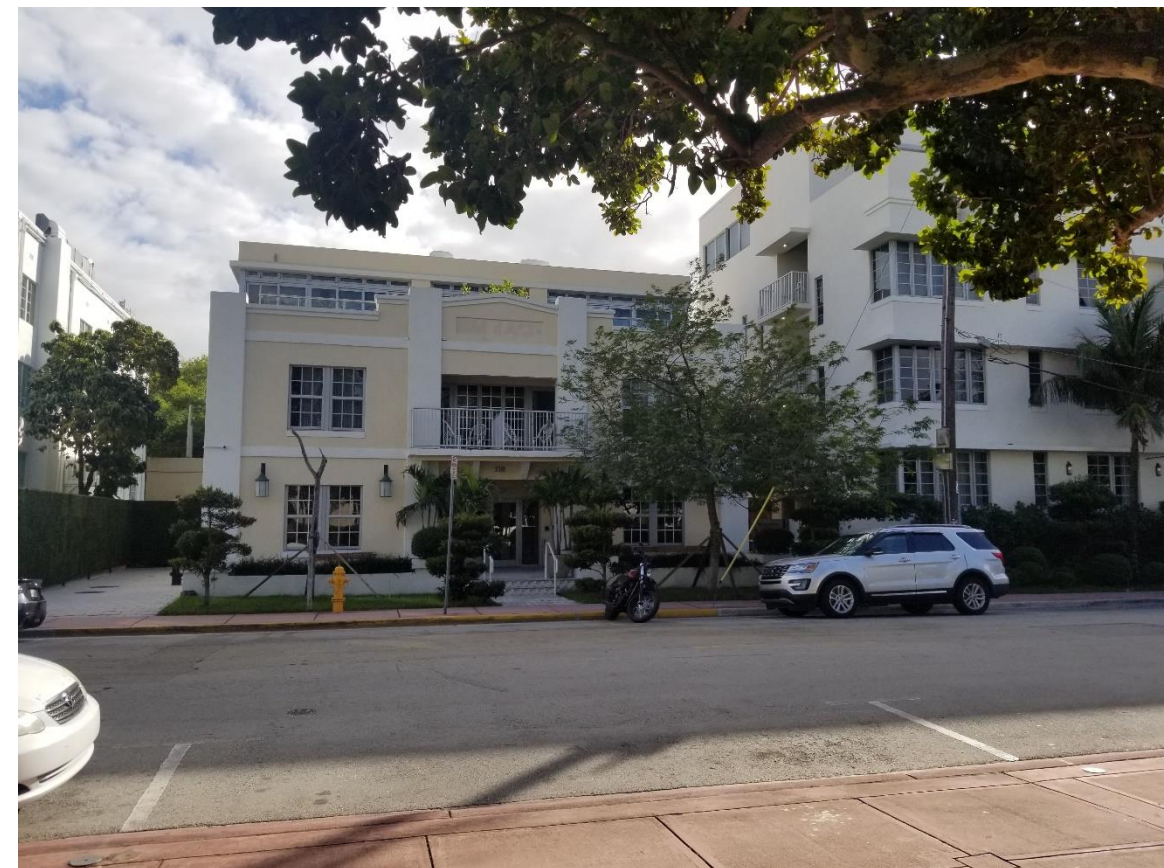
(3) - 3/8/21