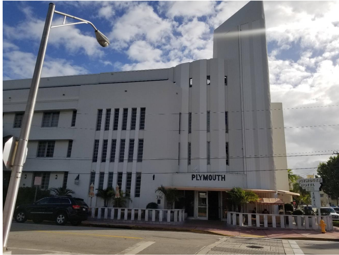
(5) - 3/8/21