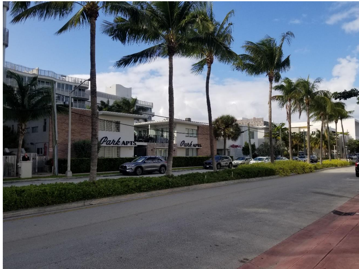
(7) - 3/8/21