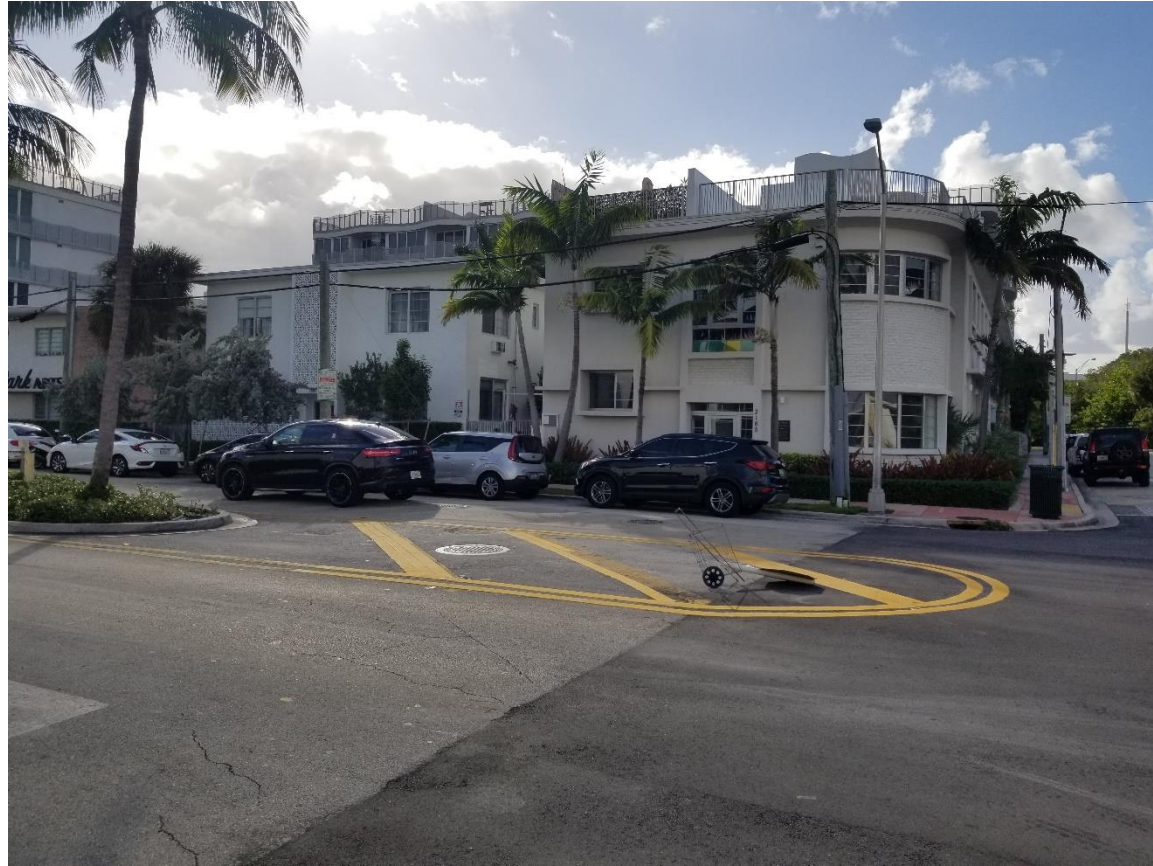
(9) - 3/8/21