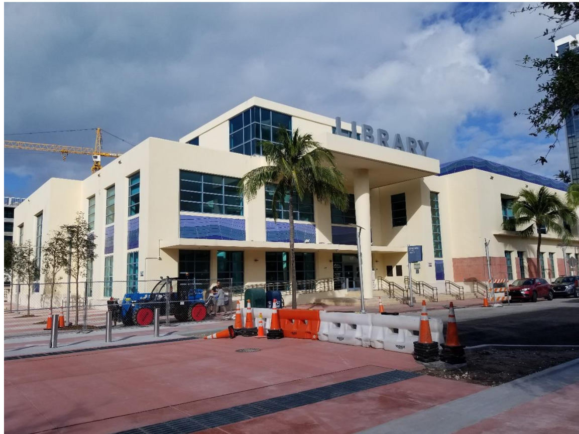
(11) - 3/8/21