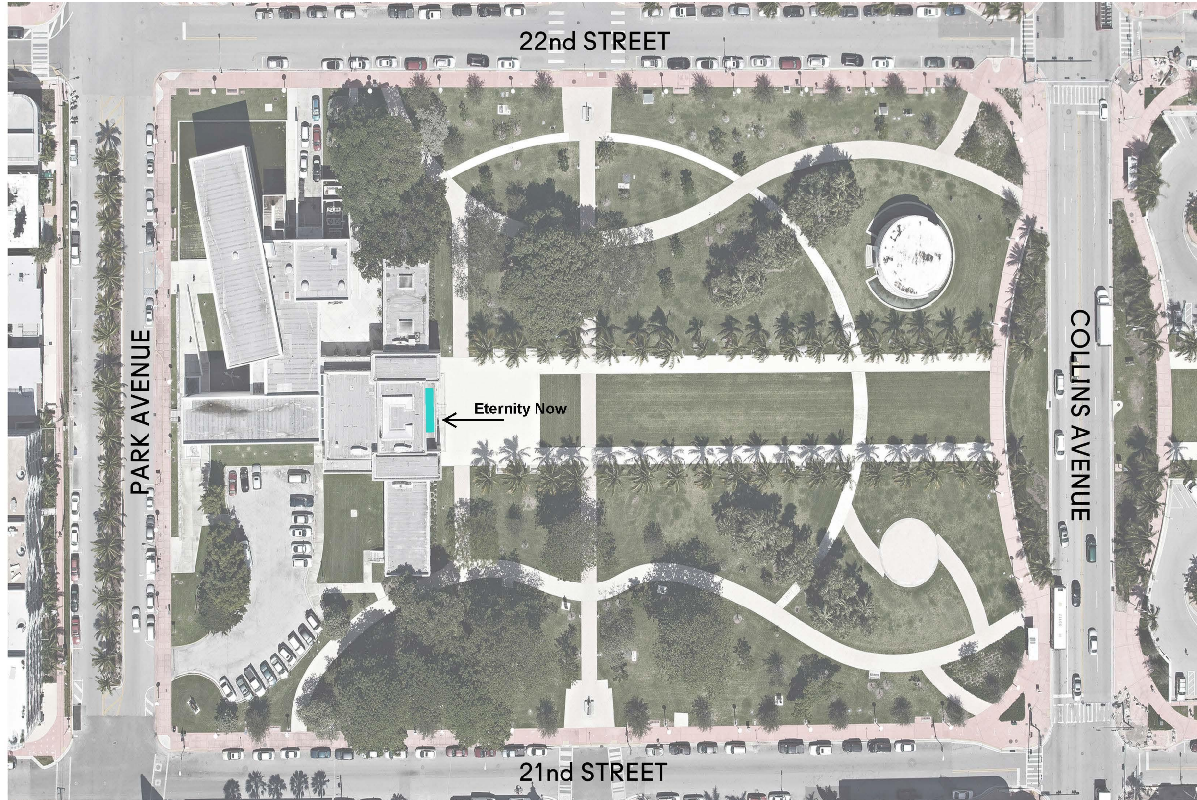
Exhibit 9d – Context Location Plan