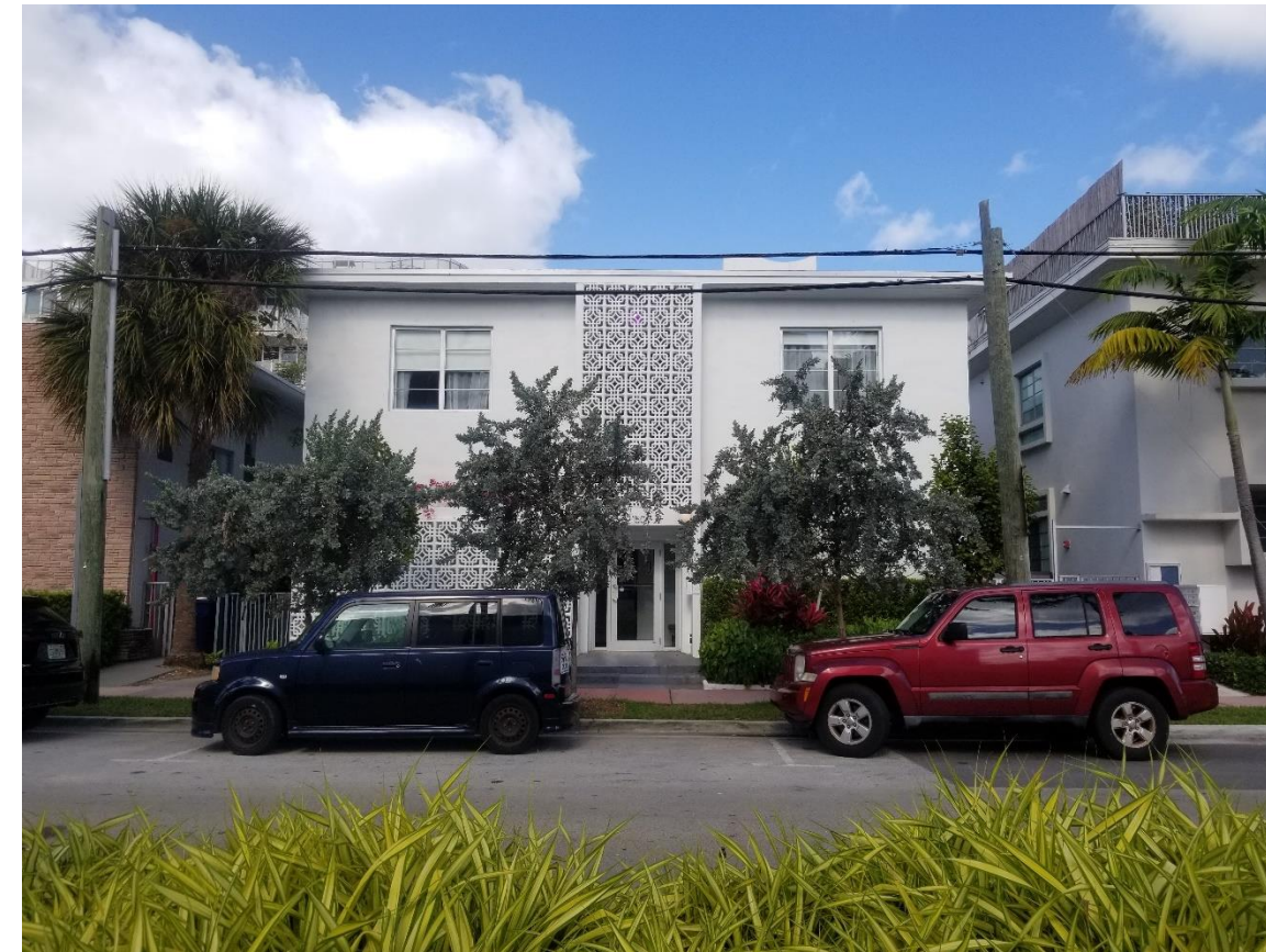
(8) - 3/8/21