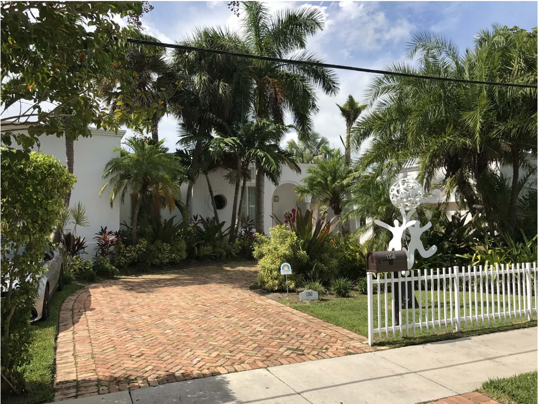
23 1350 S. BISCAYNE POINT RD 2016/09/24