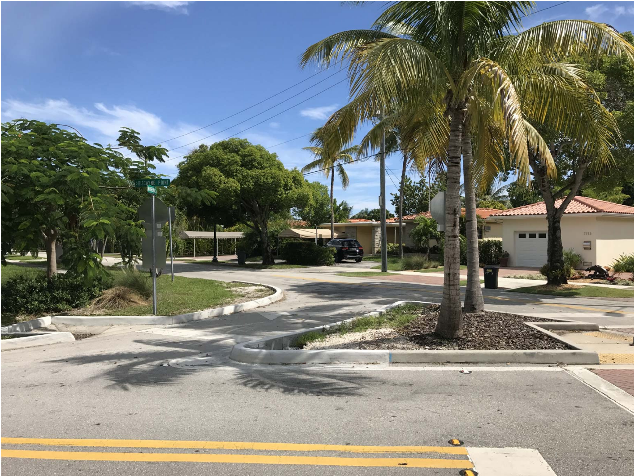
40 INTERSECTION OF NOREMAC AVENUE AND S. BISCAYNE POINT RD 2016/09/24