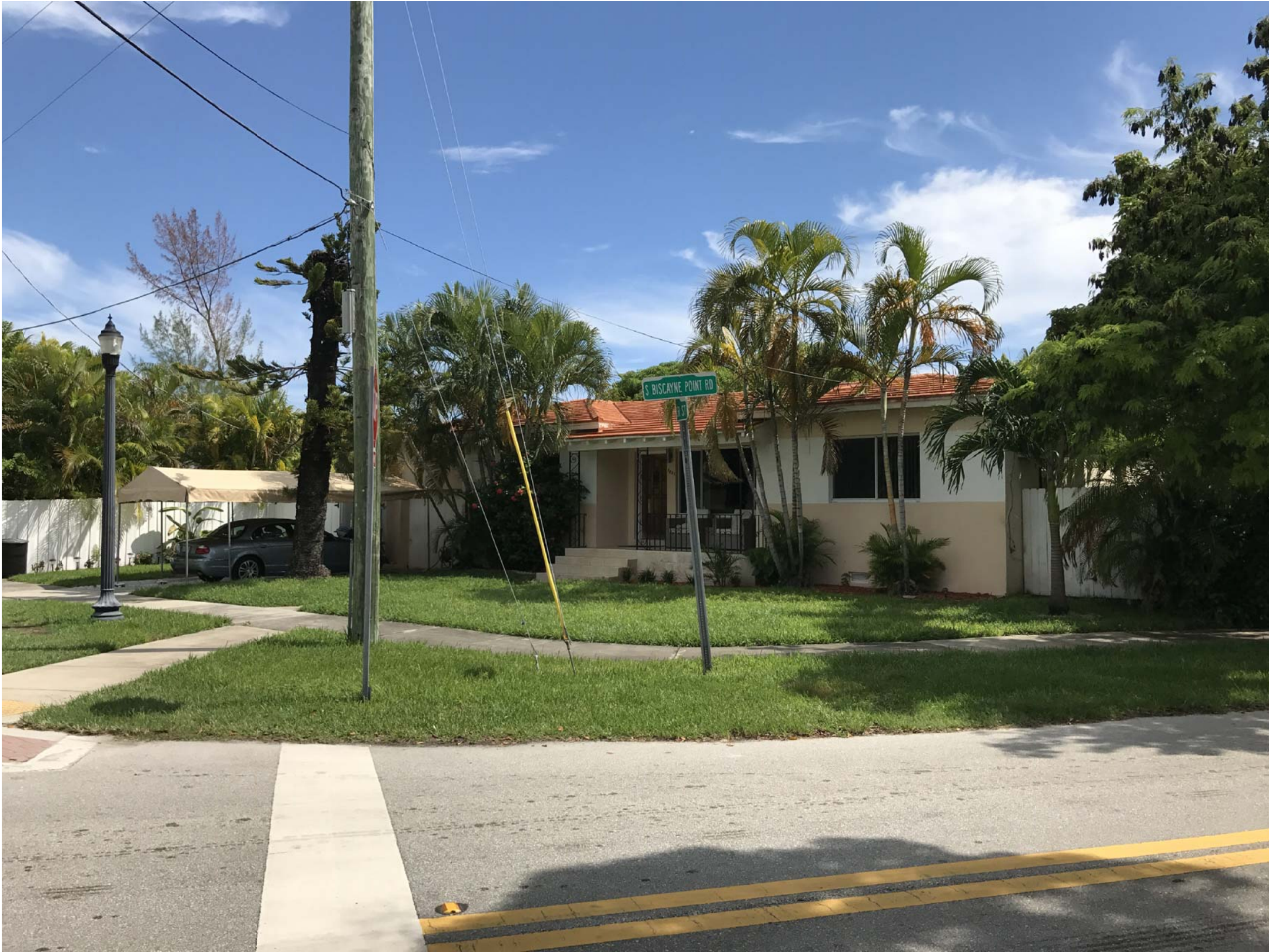
37 7801 FOWLER STREET 2016/09/24