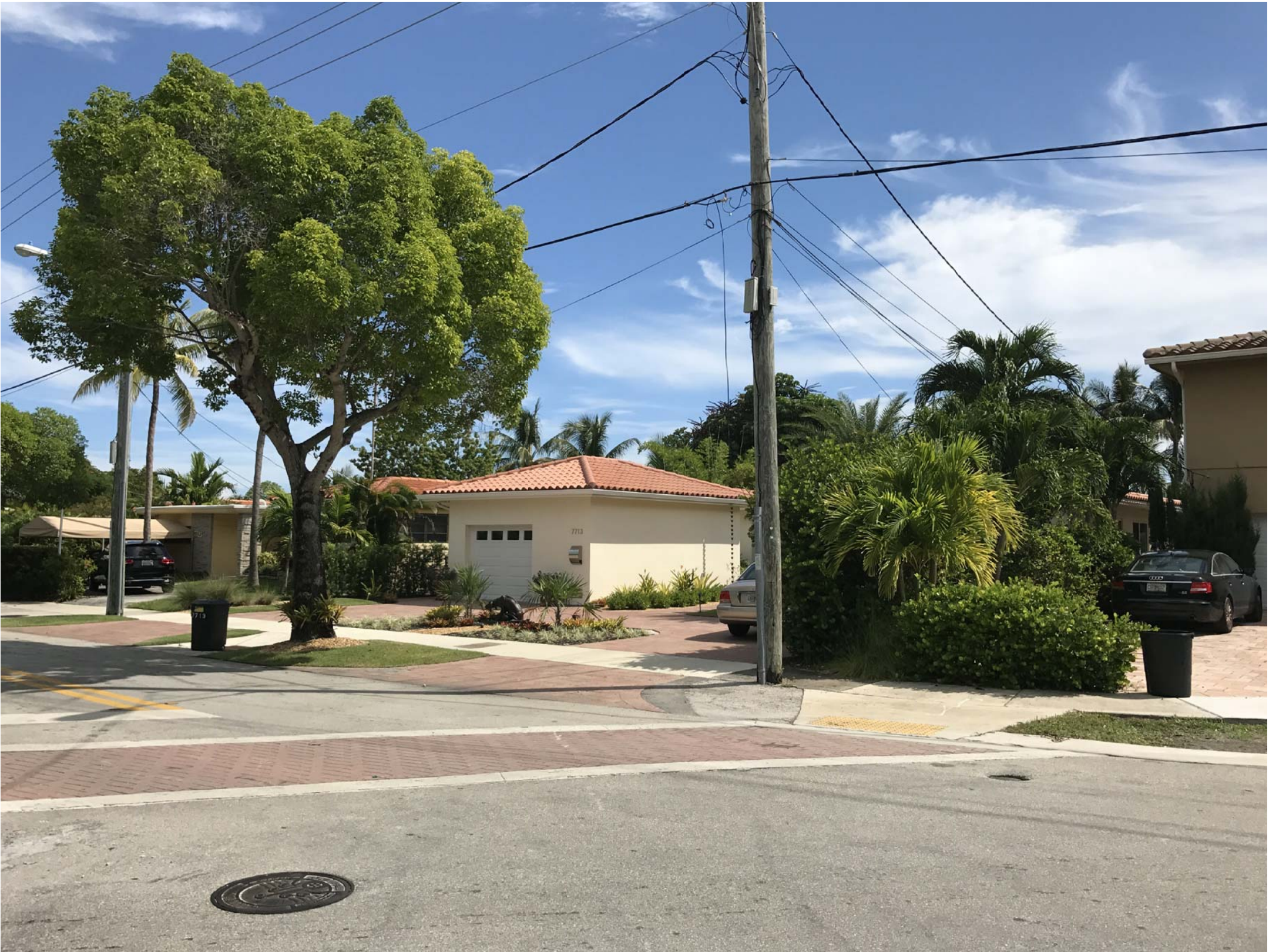
41 7713 NOREMAC AVENUE 2016/09/24