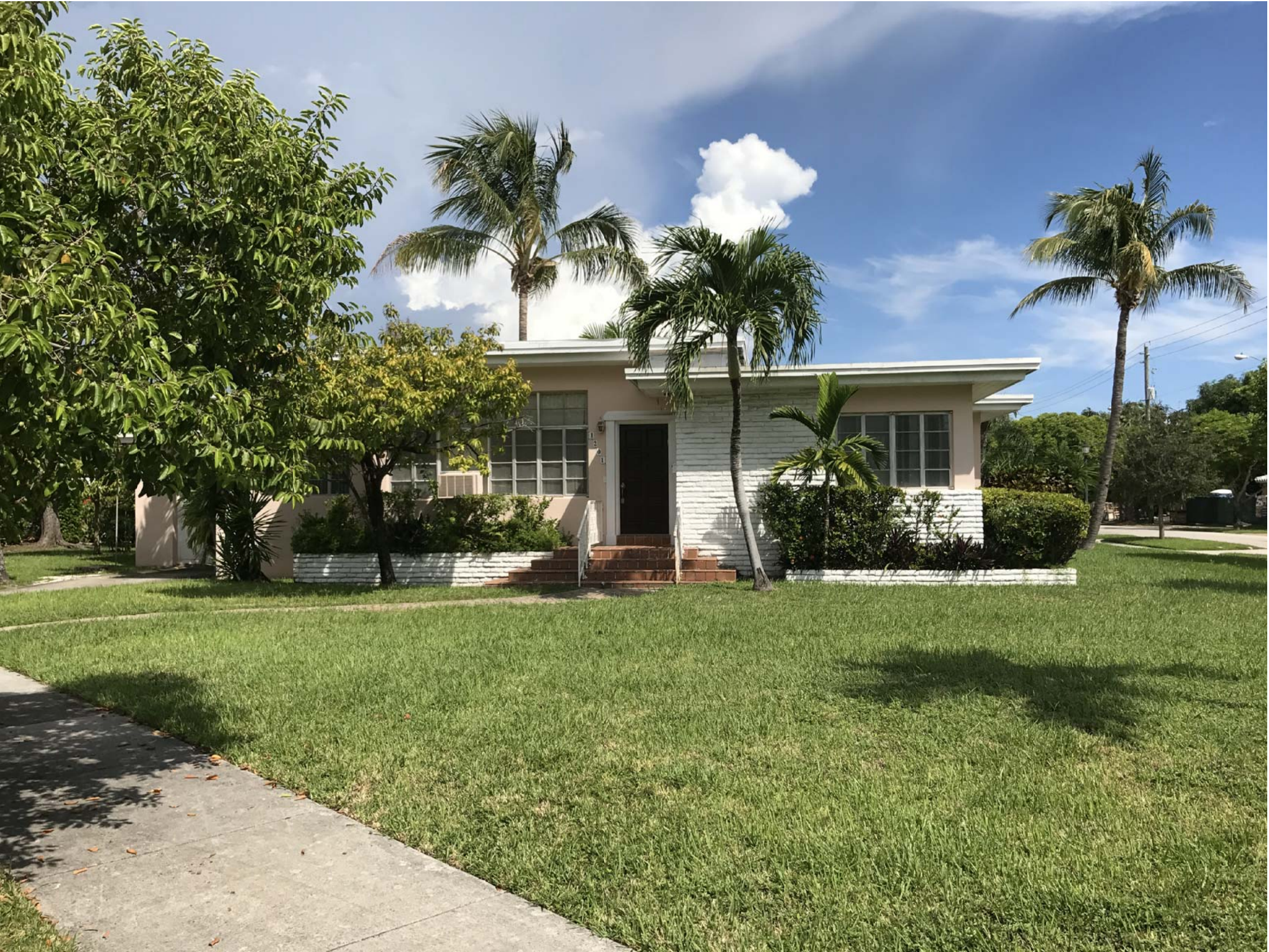
39 1201 S. BISCAYNE POINT RD 2016/09/24