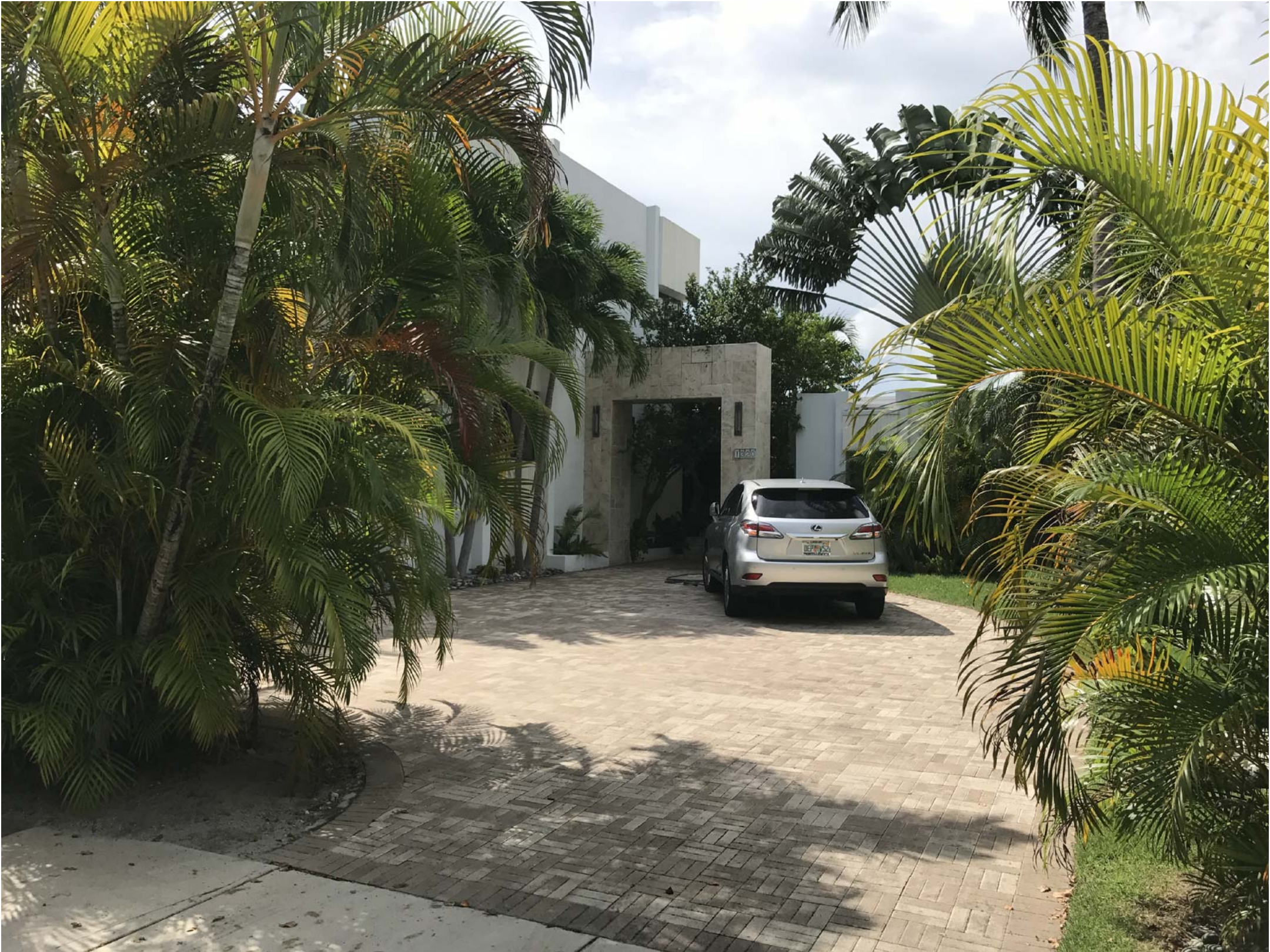
20 1320 S. BISCAYNE POINT RD 2016/09/24