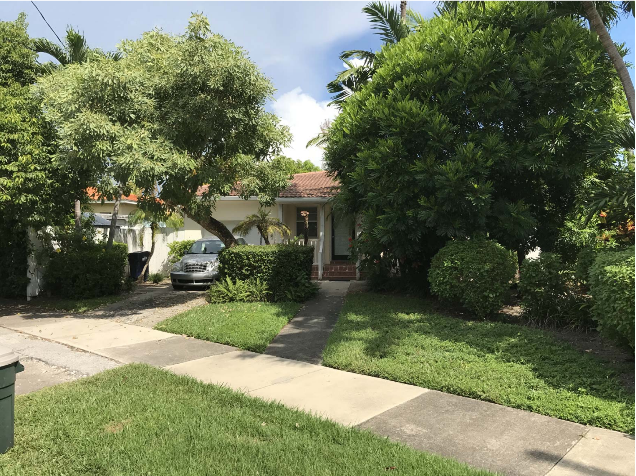
38 1225 S. BISCAYNE POINT RD 2016/09/24