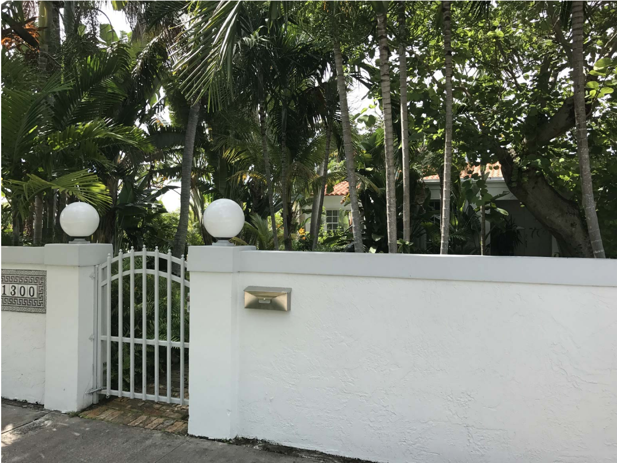
19 1300 S. BISCAYNE POINT RD 2016/09/24