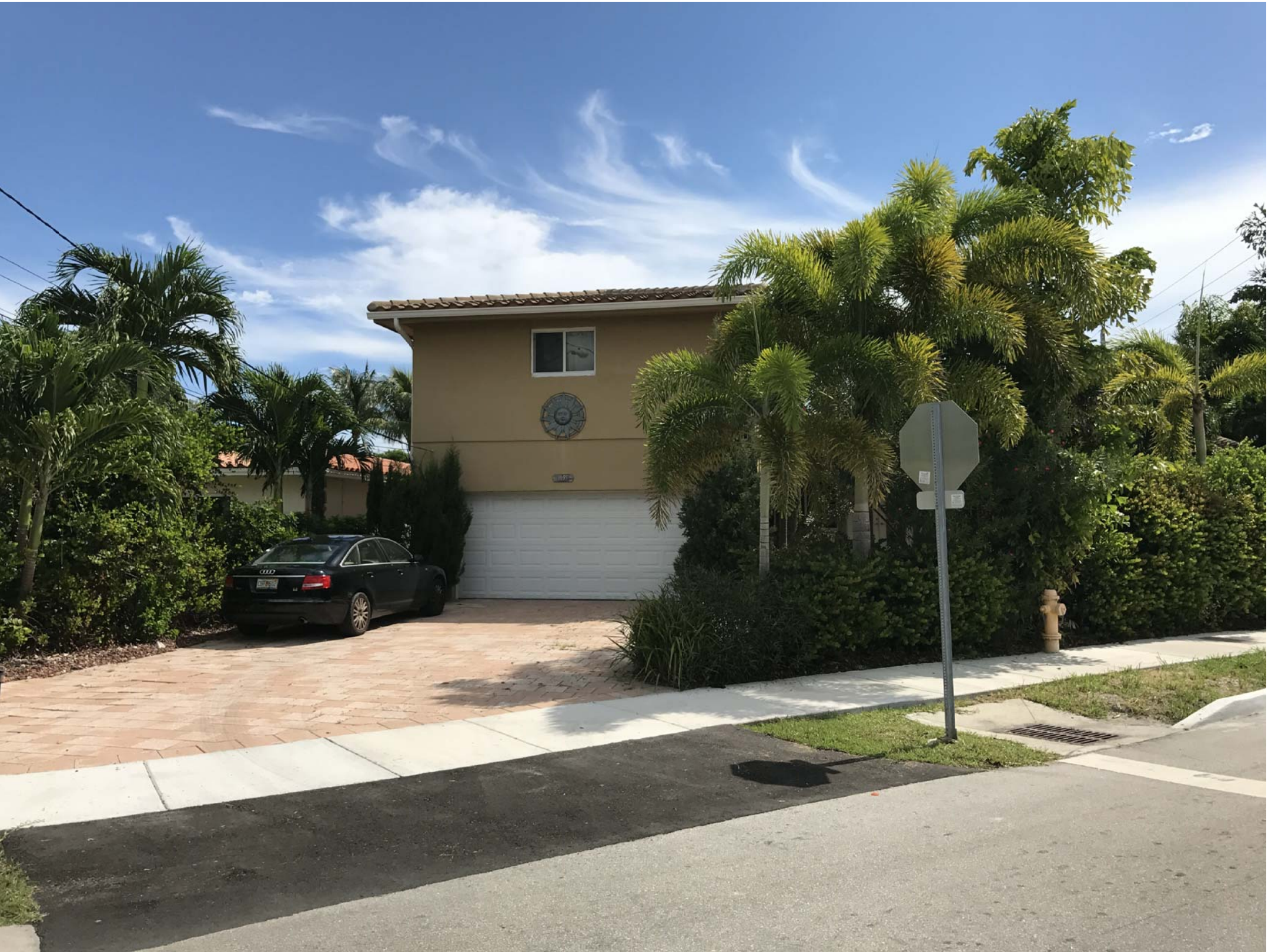
42 1155 S. BISCAYNE POINT RD 2016/09/24