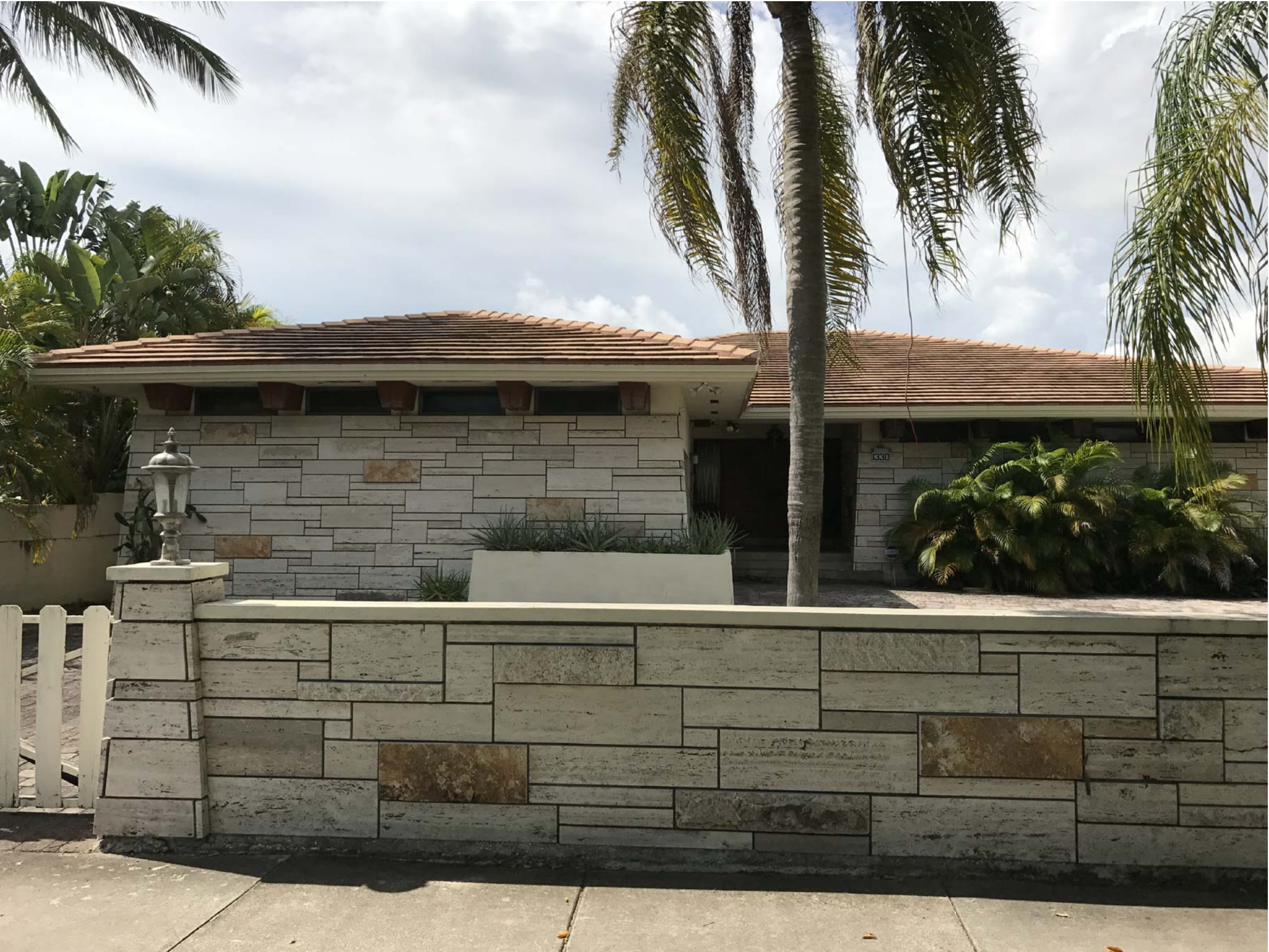
21 1330 S. BISCAYNE POINT RD 2016/09/24