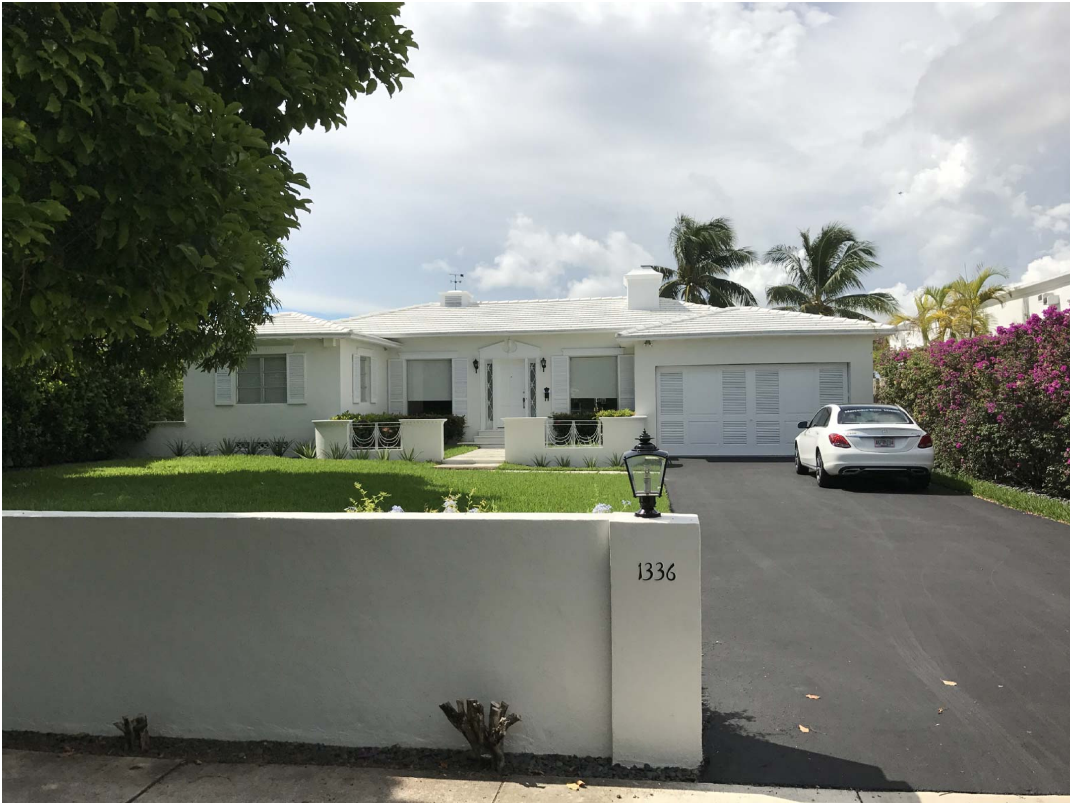
22 1336 S. BISCAYNE POINT RD 2016/09/24