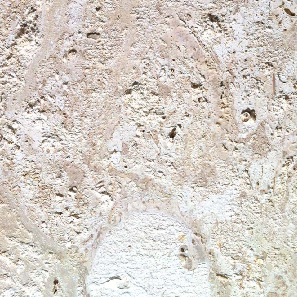
CORAL STONE SLABS