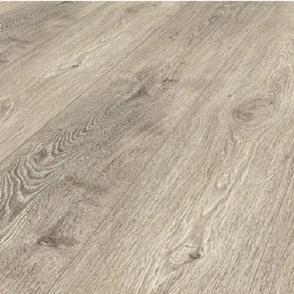
LIMED OAK FLOORING