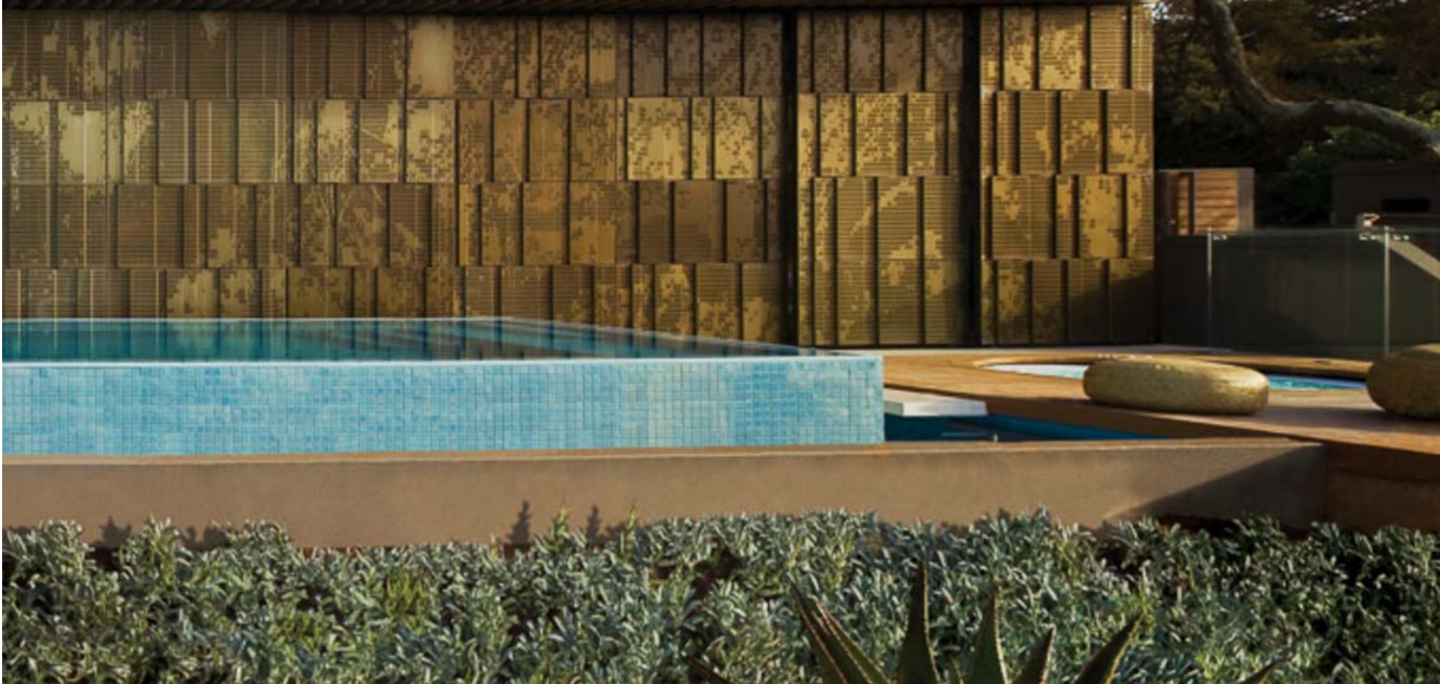
ALUMINUM SOLAR SCREENS