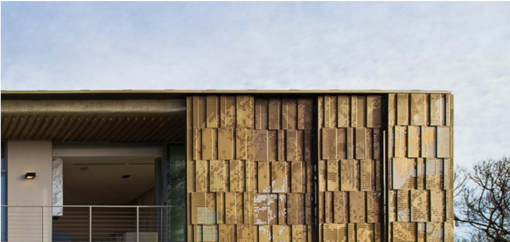
ALUMINUM SOLAR SCREENS