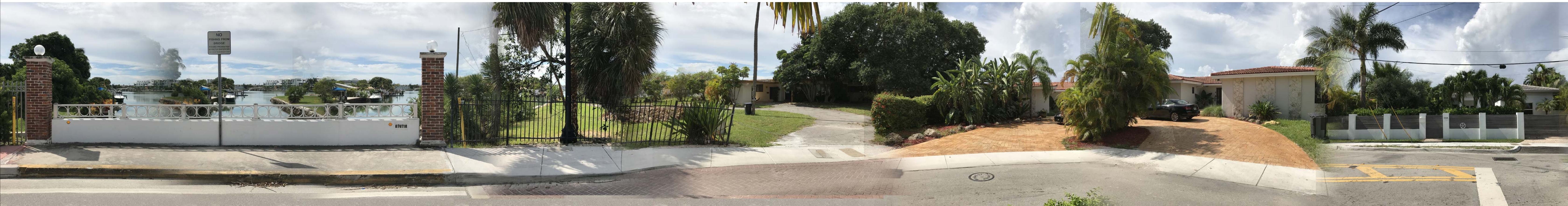
S. BISCAYNE POINT RD BRIDGE