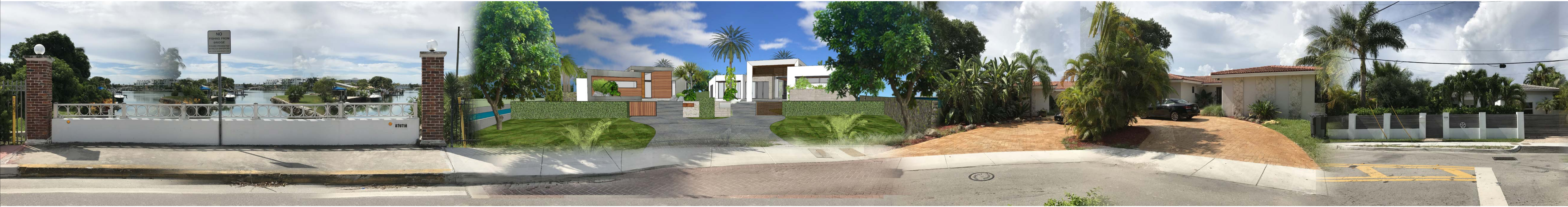
S. BISCAYNE POINT RD BRIDGE