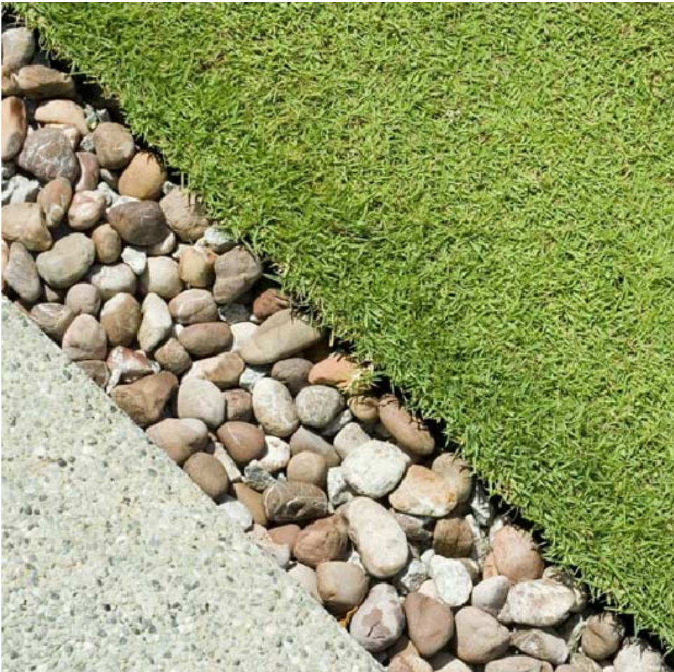
PEBBLE LANDSCAPING TRIM