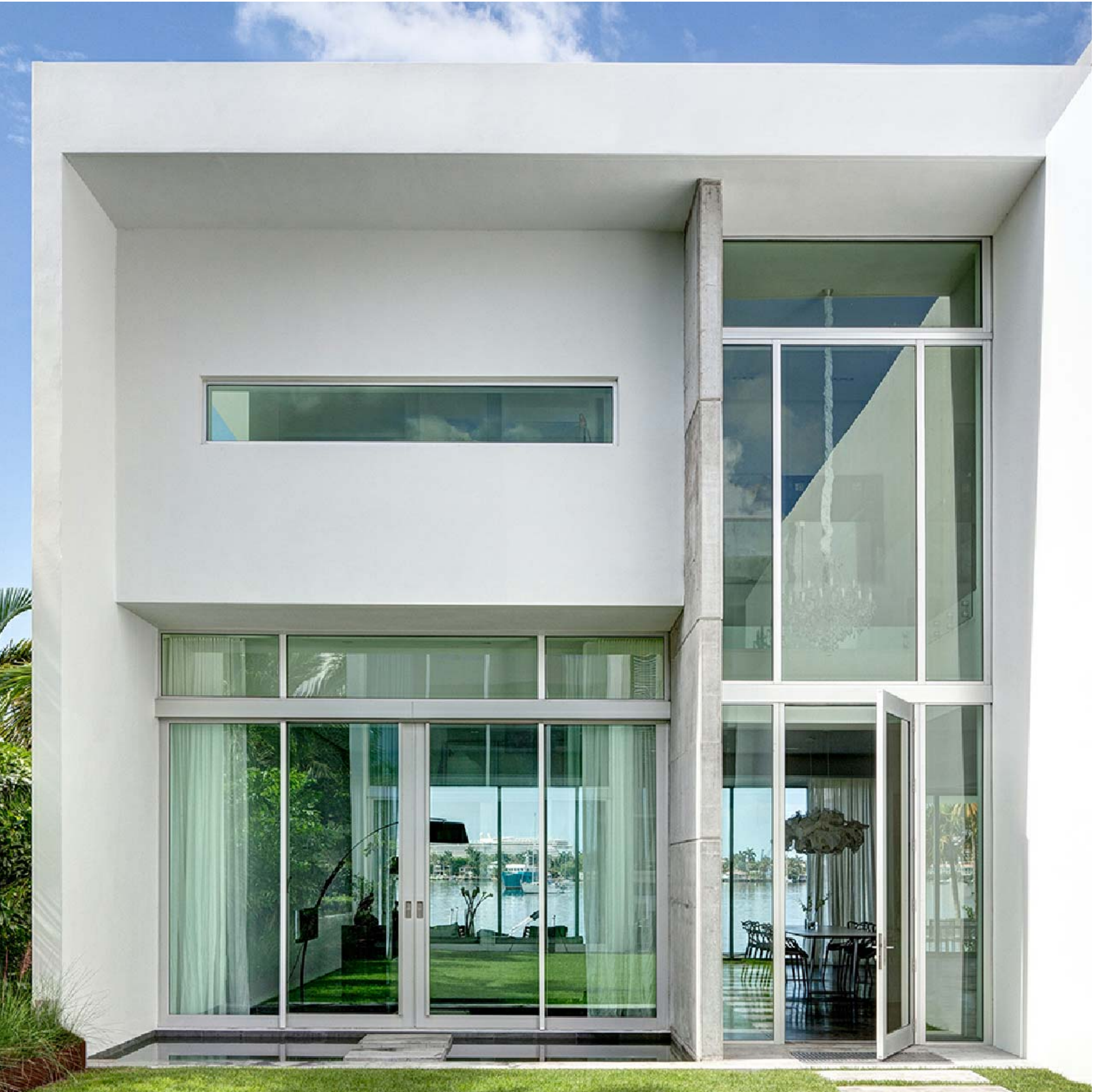
WHITE STUCCO + ALUMINUM DOORS