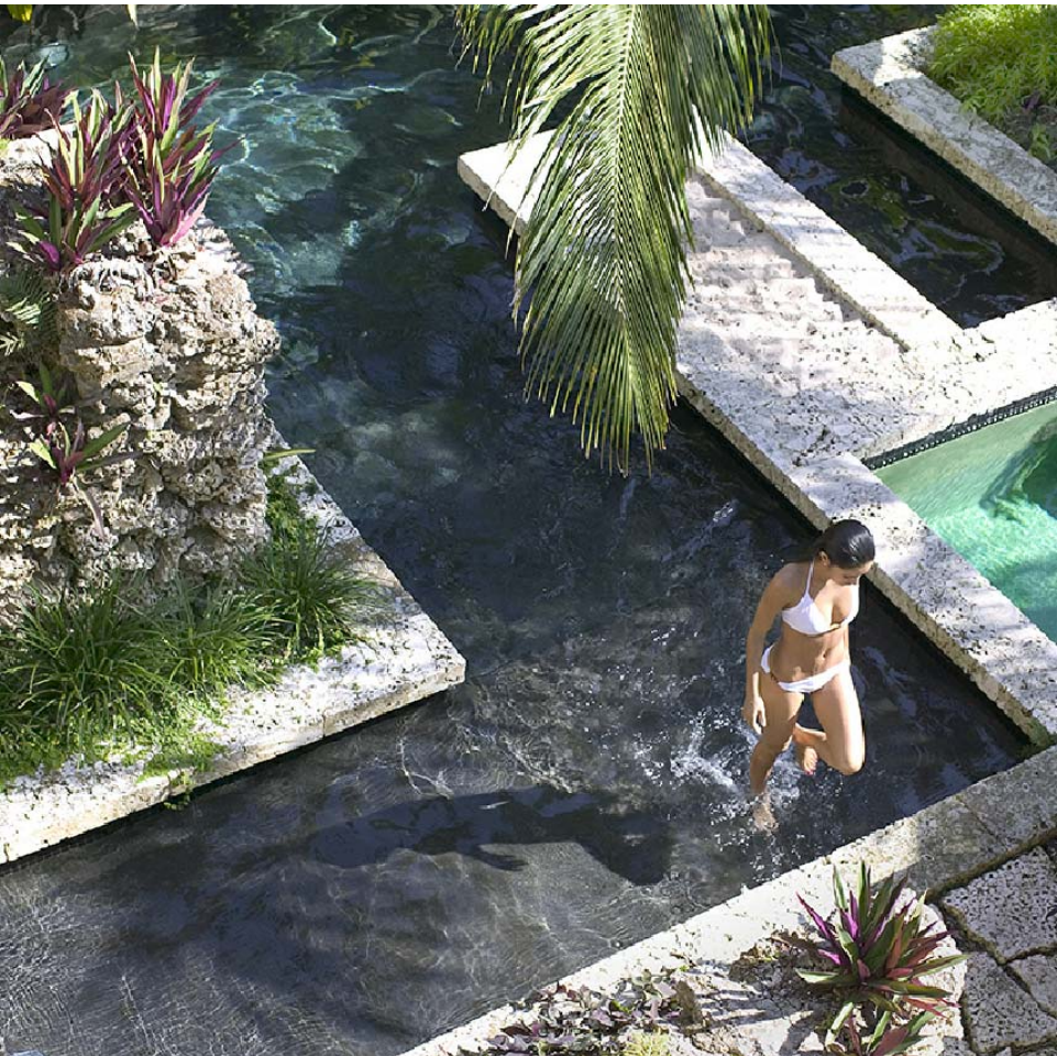
LAVA STONE POOL