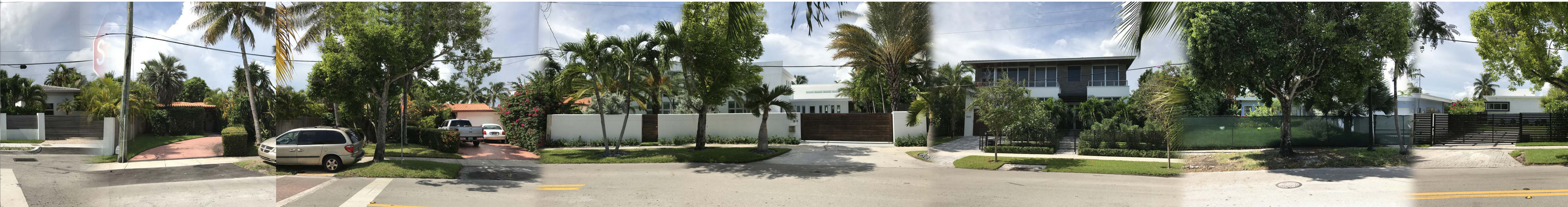
1158 S. BISCAYNE POINT RD