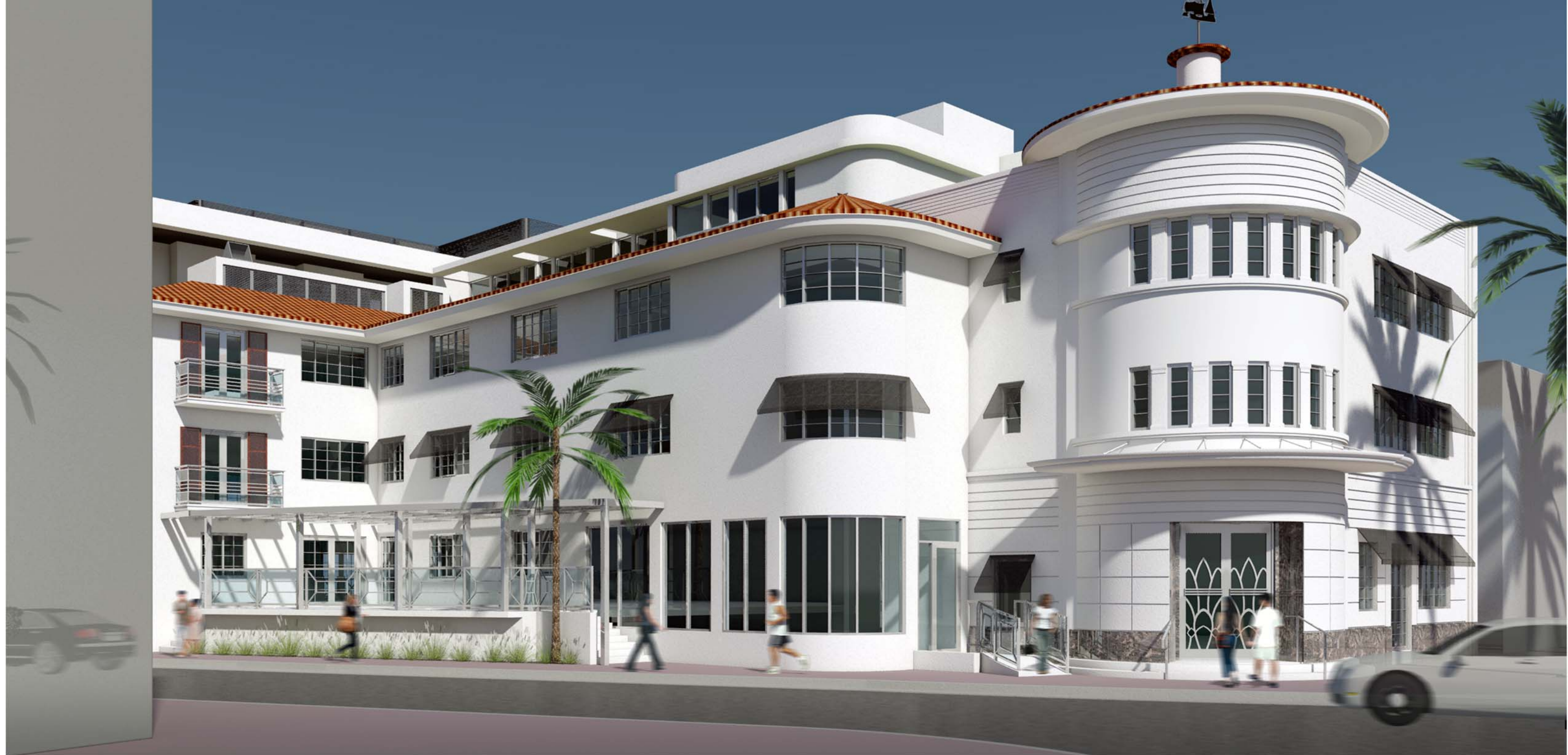
LENNOX HOTEL - BUILDING 1