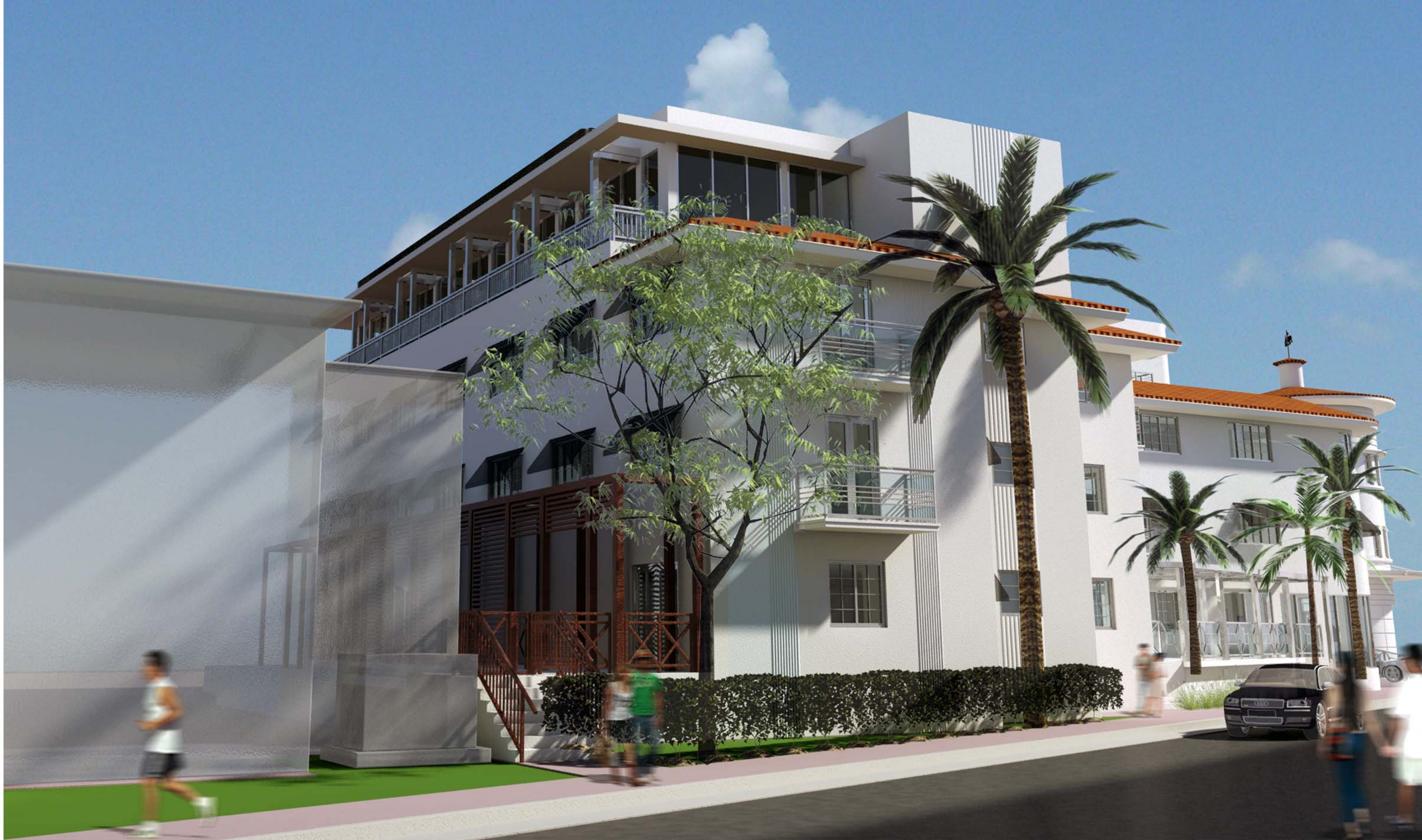
LENNOX HOTEL - BUILDING 1 PROPOSED