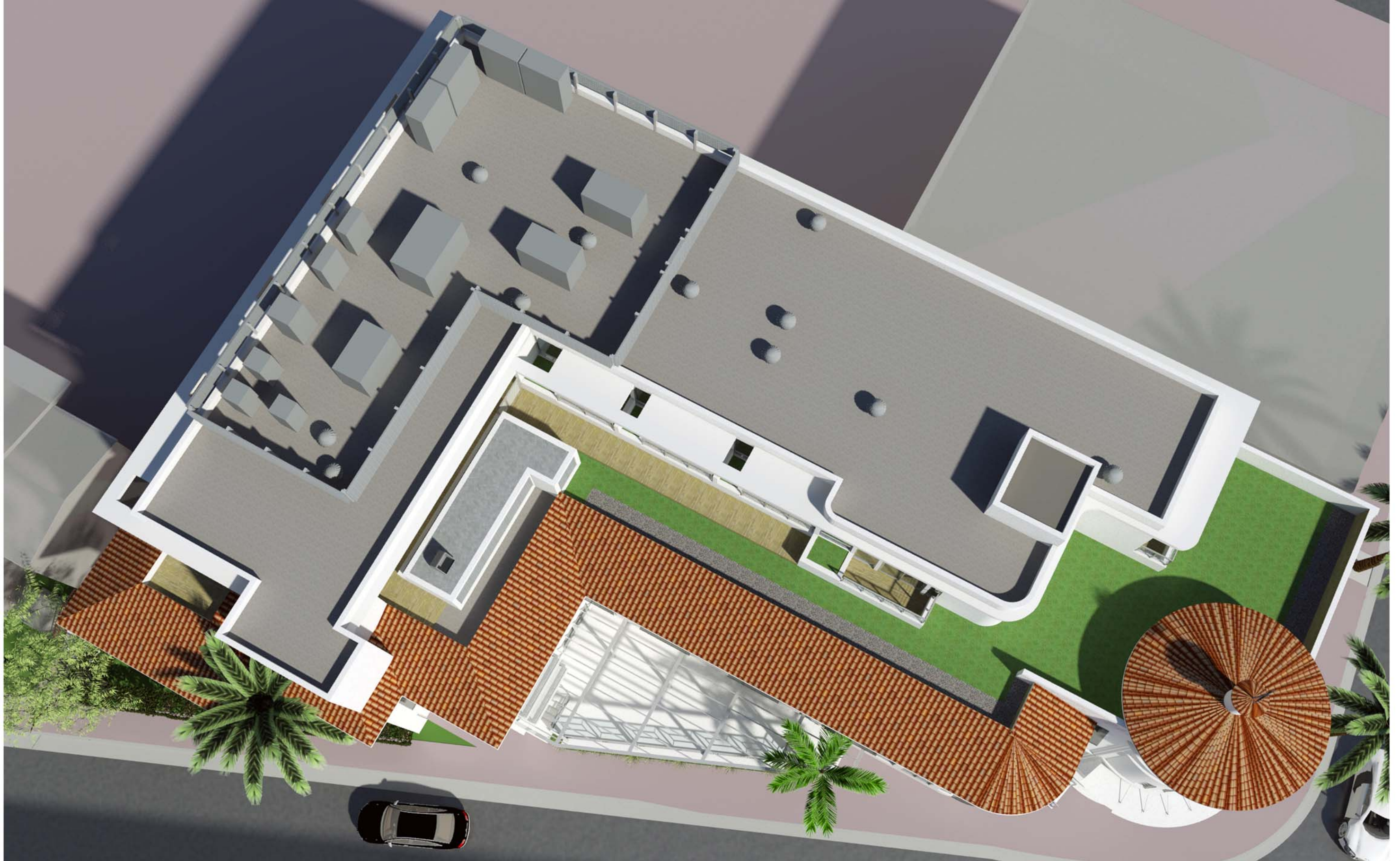
LENNOX HOTEL - BUILDING 1 PROPOSED