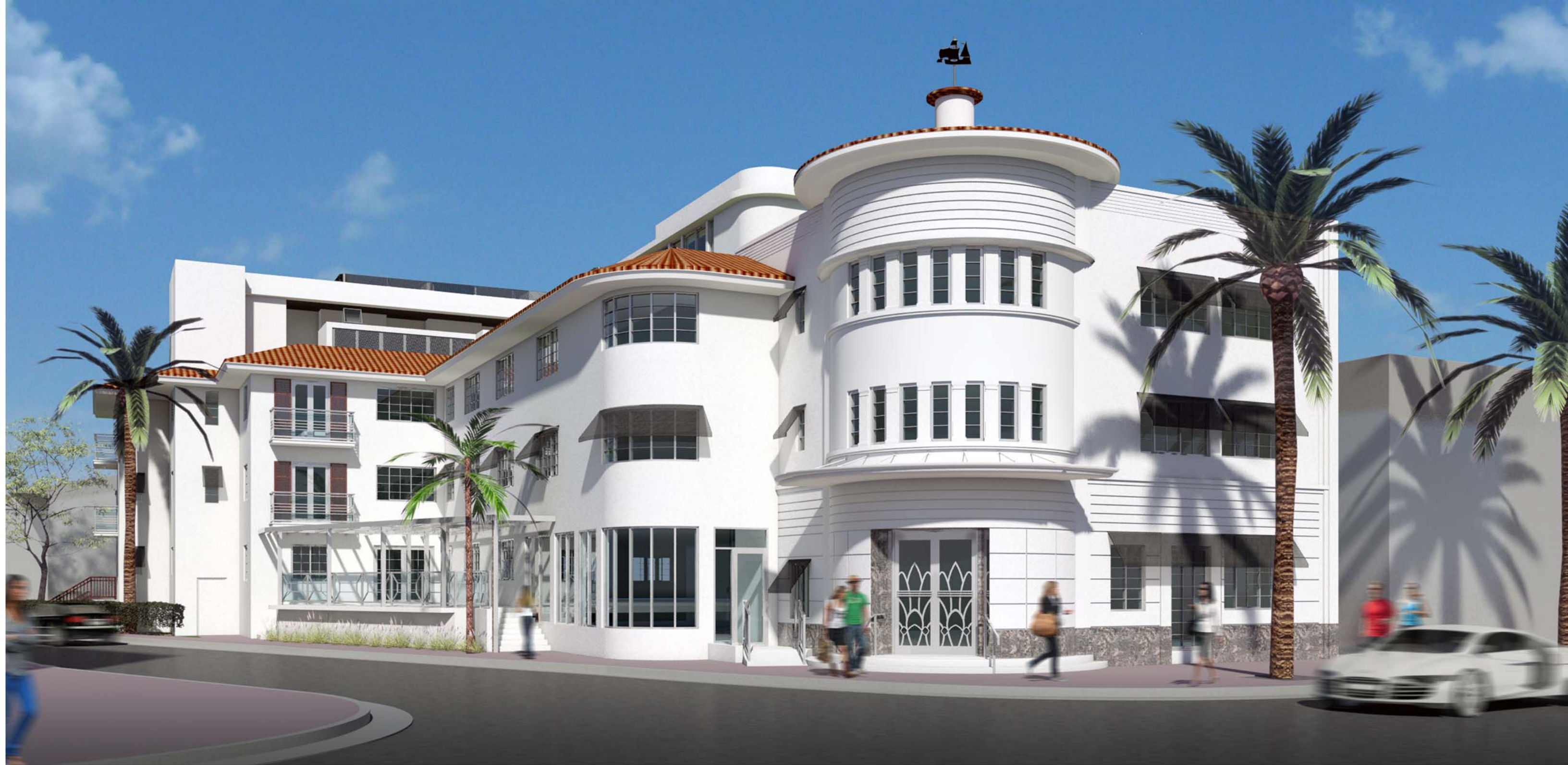
LENNOX HOTEL - BUILDING 1