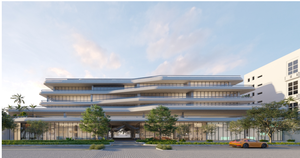
Current Allowable Height