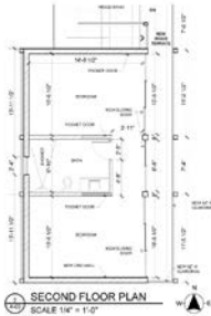
SECOND FLOOR PLAN SCALE 1/4" = 1'-0"