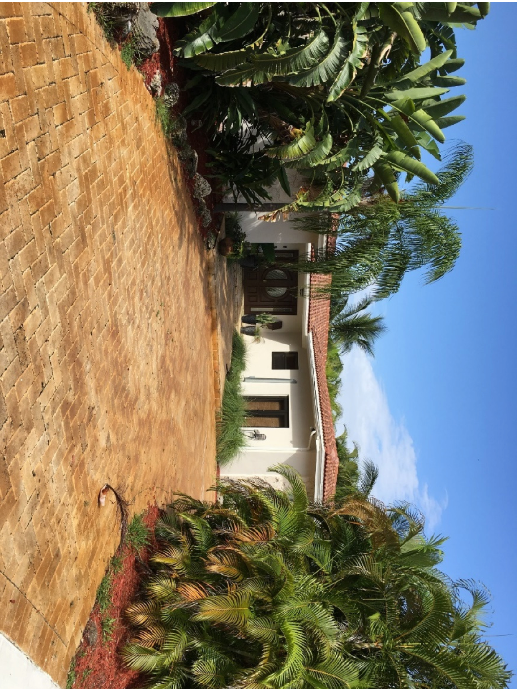
PROPERTY TO THE RIGHT