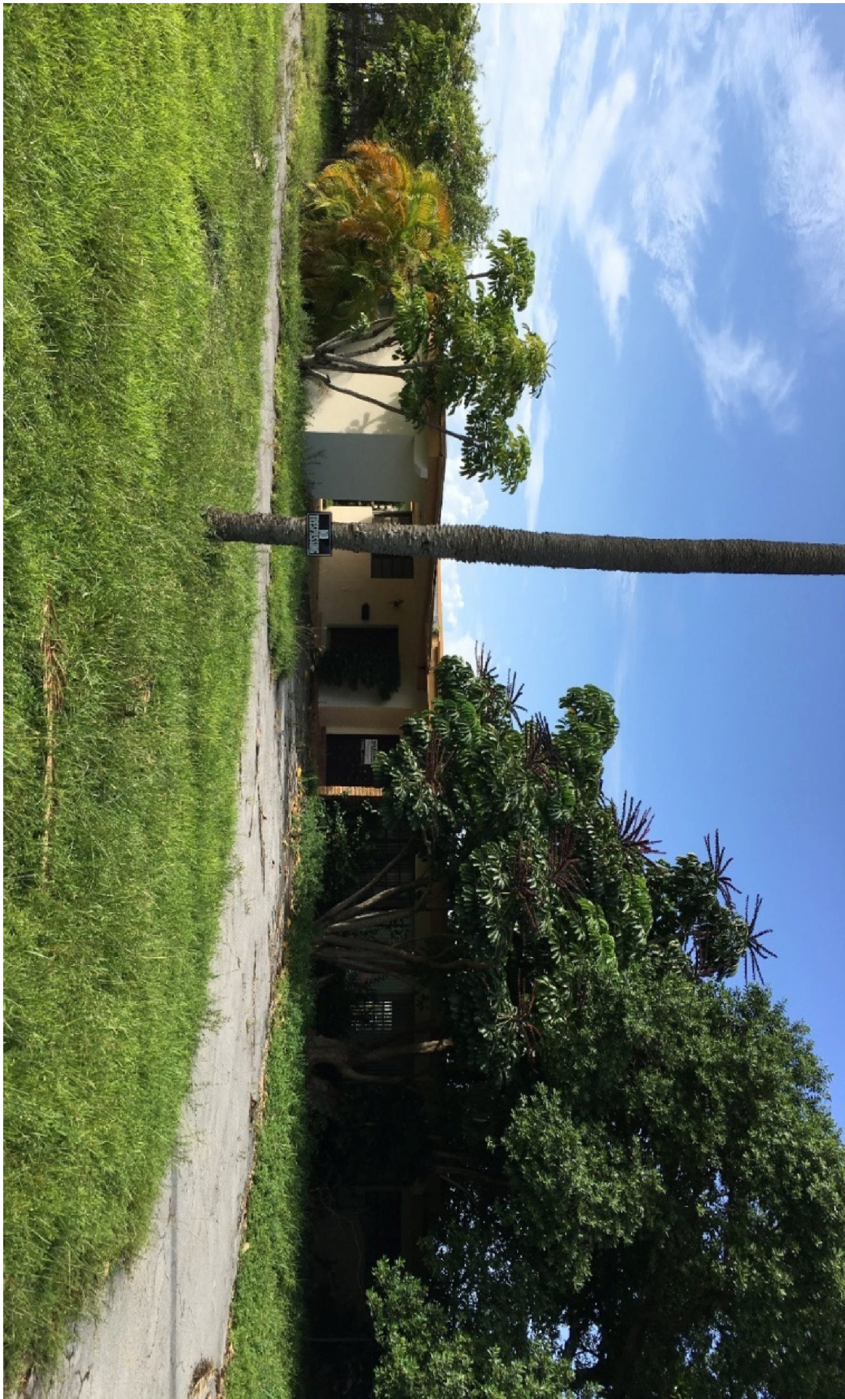
EXISTING HOUSE- FRONT