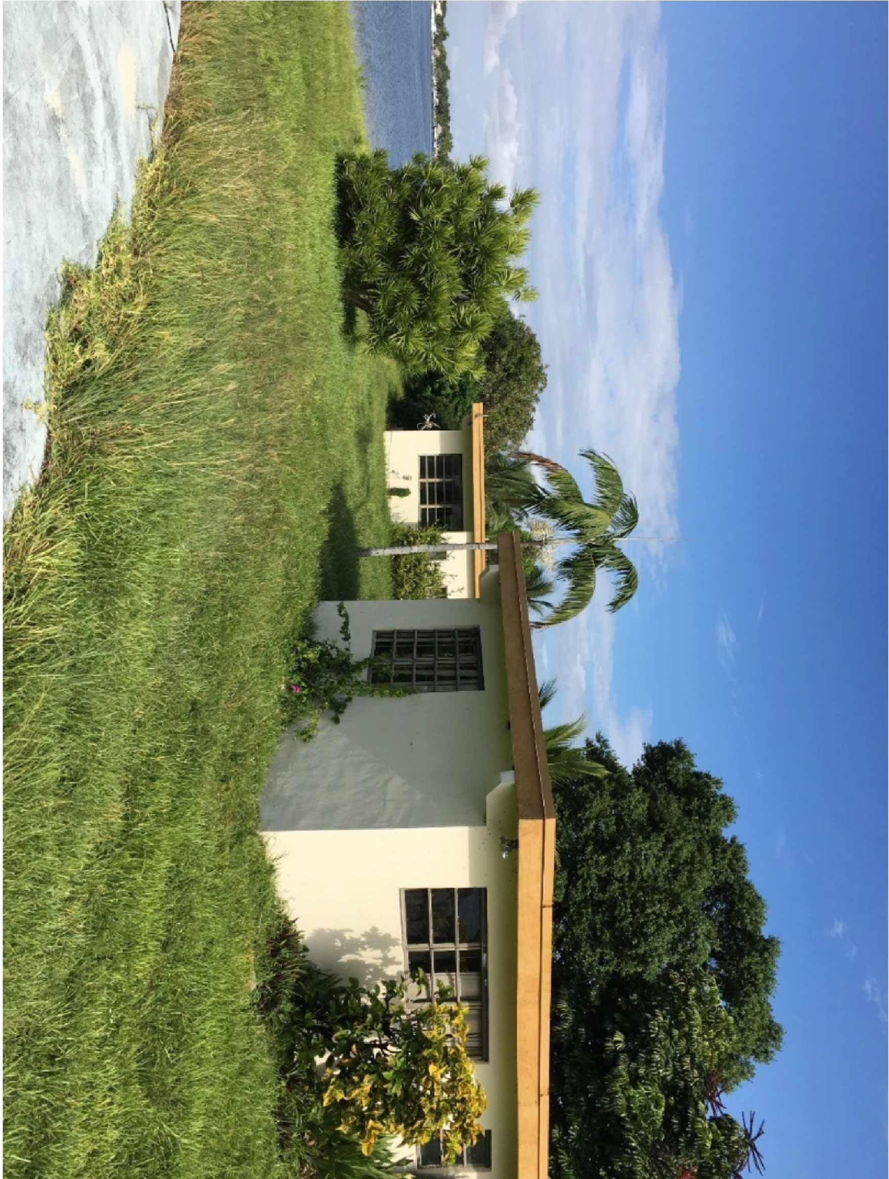
EXISTING HOUSE-SIDE VIEW