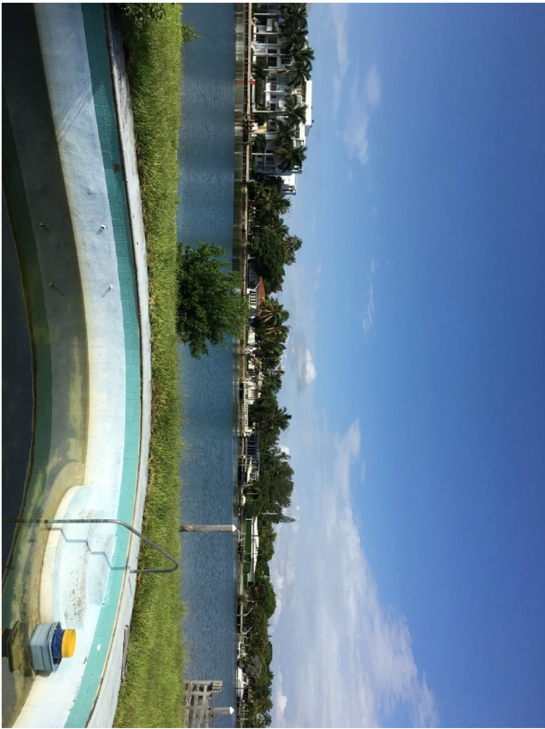
EXISTING HOUSE -CANAL VIEW