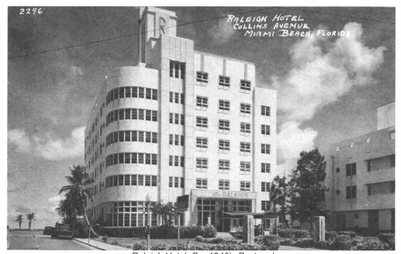
Raleigh Hotel, Ca. 1940's Postcard

The Raleigh Hotel constructed in 1940 and designed by L. Murray Dixon is an excellent example of the Streamline Moderne style in a larger scale hotel. Notable design features include, a broad rounded corner with ribbon windows, pink keystone clad entry portal, vertical accents and porthole windows. Additionally, the multi-foliated swimming pool is one of the most celebrated pool designs in America.