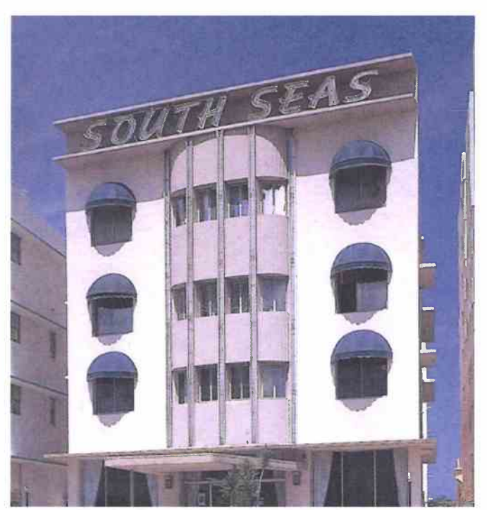
South Seas Hotel, 1988 Photograph 1954 Grossman façade design

The applicant is currently proposing the substantial demolition, renovation and partial restoration of the Richmond Hotel and the construction of an attached 3-story rear addition. The demolition requested incudes the removal of the Melvin Grossman designed front façade treatment, the rear approximately 84% of the building and the non-original 1-story cabana structure located east of the main hotel building. While the amount of demolition is extensive, the applicant is proposing the full restoration of the original 1941 Dixon façade design including the restoration/reintroduction of all significant architectural elements and materials that have been completely obscured by 1954 renovation. The restoration of the primary façade of this significant Art Deco hotel will serve to enhance the historic and architectural character of the district and is more consistent with the period of significance established for the Miami Beach Architectural District listed on the National Register of Historic Places.