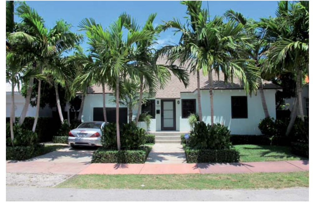
A3 – 1331 Flamingo Way, 04/25/16