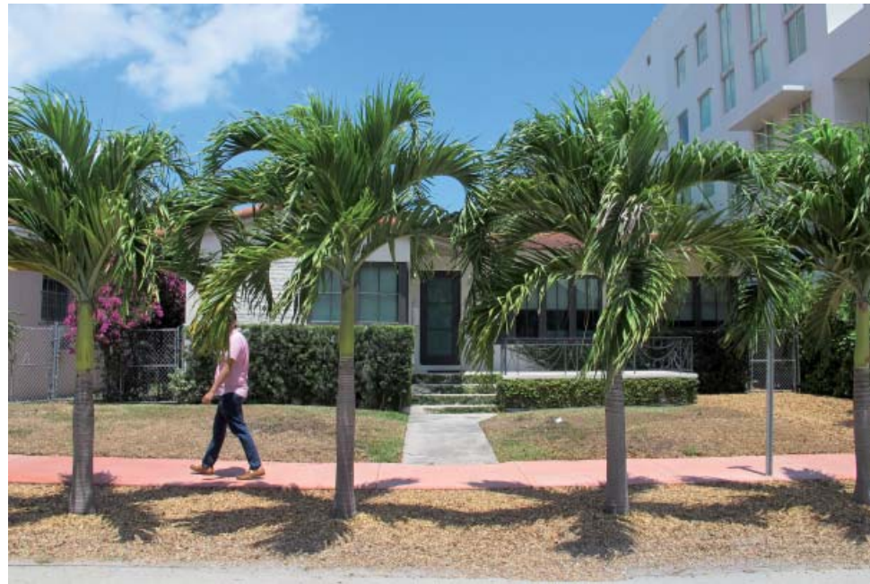
C5 – 1311 14th Terrace, 04/25/16