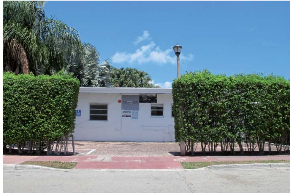
A1 – 1445 Bay Road, 04/25/16