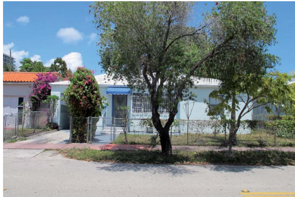
A5 – 1315 Flamingo Way, 04/25/16