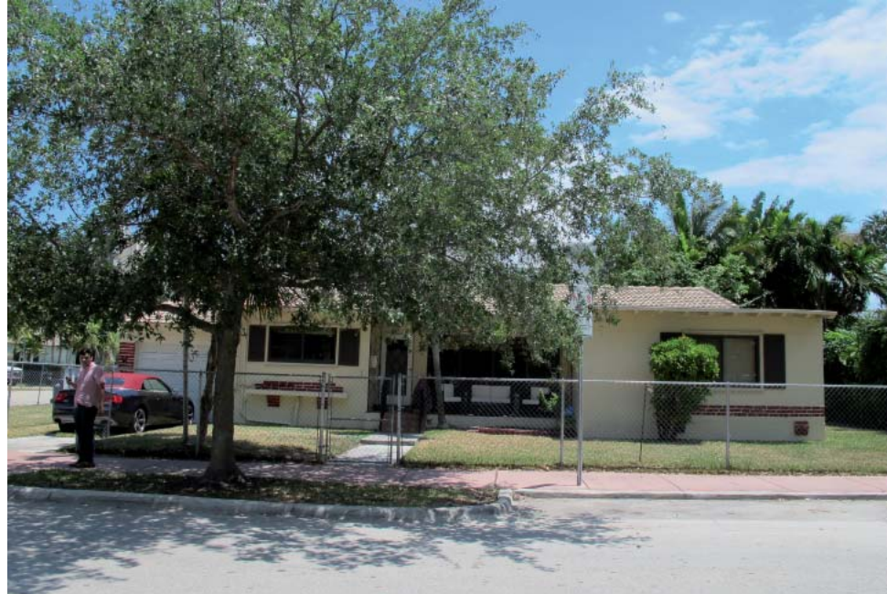
1435 Bay Road, West view, 04/25/16