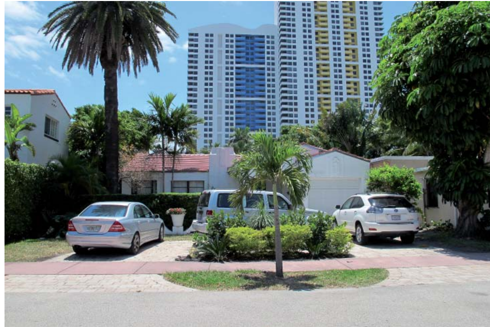
B4 – 1330 Flamingo Way, 04/25/16