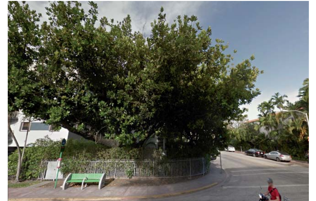
B9 – 1435 West Avenue, 04/25/16

TBD GROUP DESIGN + RE DEVELOPMENT WWW.TBD-DEVELOPMENT.COM TBD_DEVELOPMENT@GMAIL.COM +(305) 890-1523 +(661) 670-7462