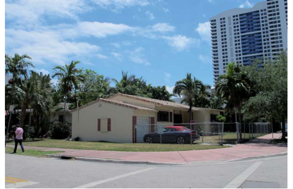
1435 Bay Road, Northwest corner street view, 04/25/16