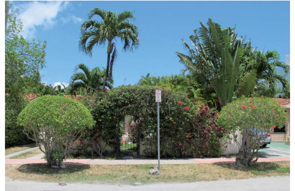
C3 – 1331 14th Terrace, 04/25/16