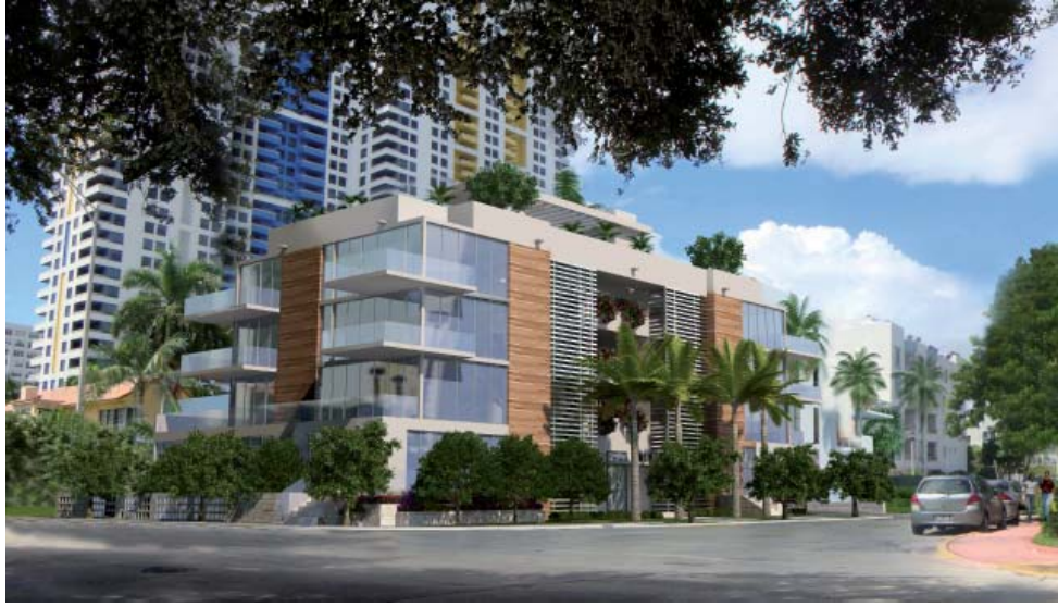
D1(1) – 1412 14th Terrace, Rendering