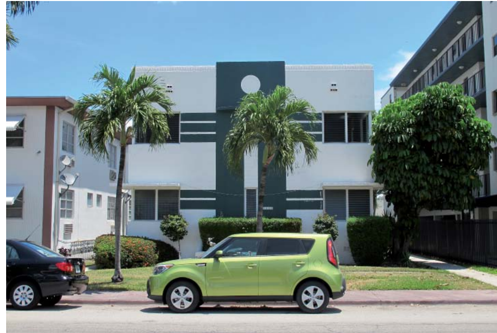
A8 – 1443 West Avenue, 04/25/16