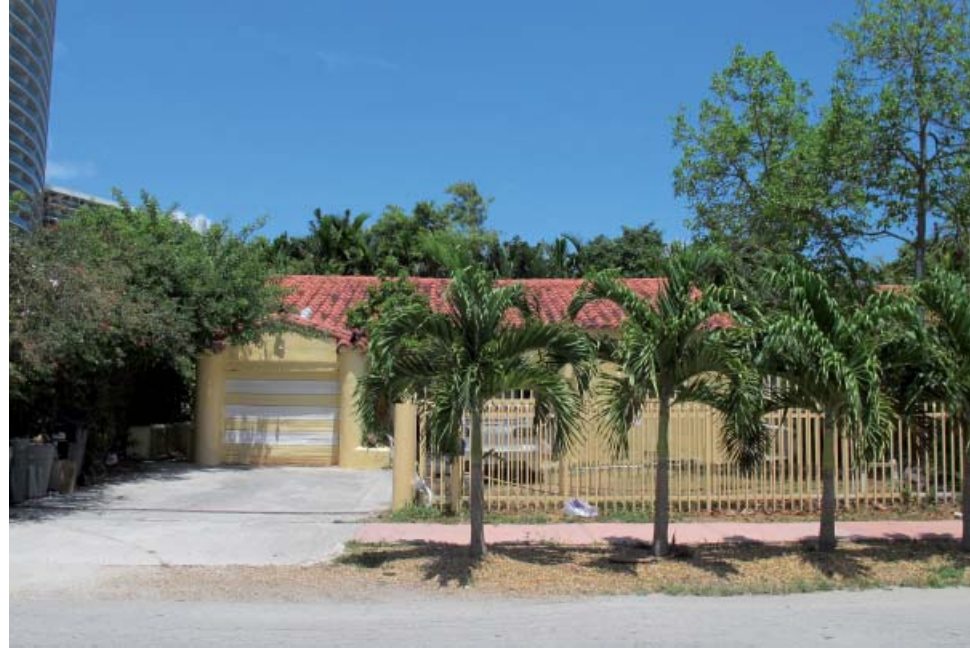
D1(2) – 1412 14th Terrace, Rendering