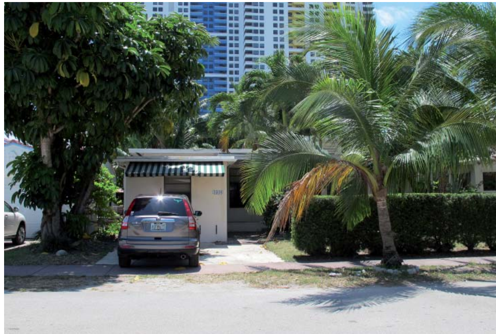
1340 Flamingo Way, North view, 04/25/16

TBD GROUP DESIGN + RE DEVELOPMENT WWW.TBD-DEVELOPMENT.COM TBD_DEVELOPMENT@GMAIL.COM +(305)890-1523 +(661)670-7462