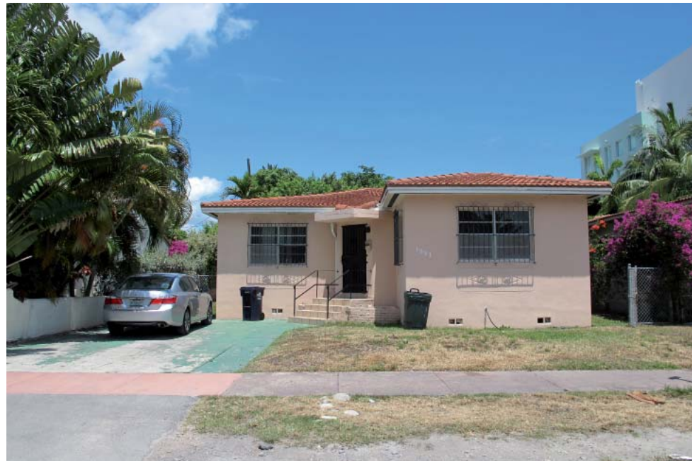
C4 – 1321 14th Terrace, 04/25/16