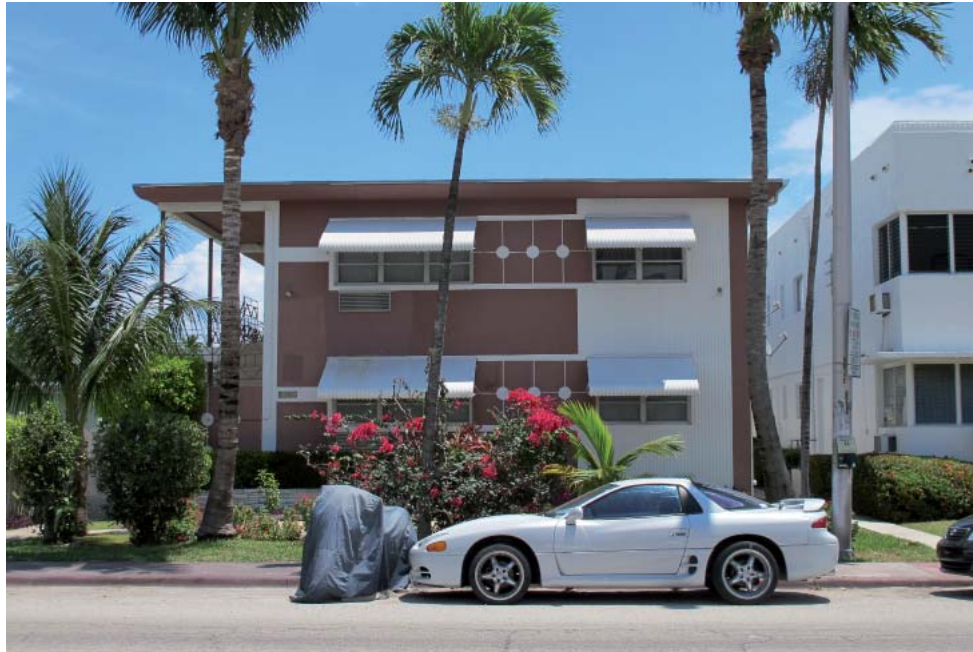
A7 – 1445 West Avenue, 04/25/16