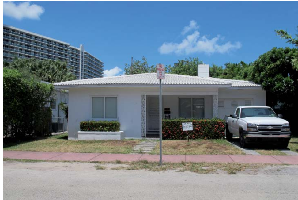
A2 – 1339 Flamingo Way, 04/25/16