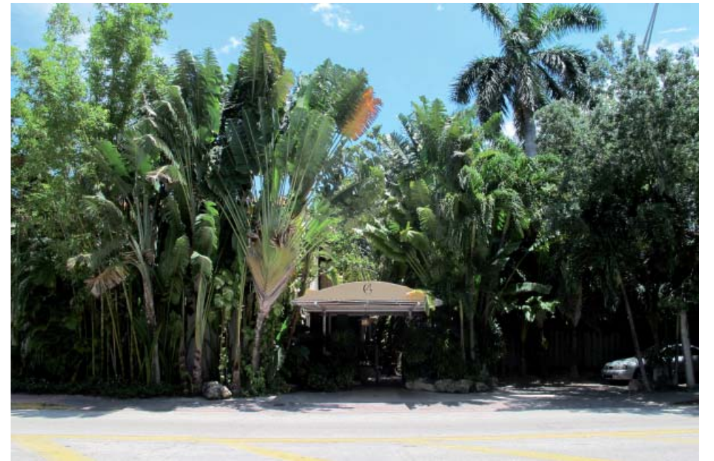
C6 – 1427 West Avenue, 04/25/16

TBD GROUP DESIGN + RE DEVELOPMENT WWW.TBD-DEVELOPMENT.COM TBD_DEVELOPMENT@GMAIL.COM +(305)890-1523 +(661)670-7462