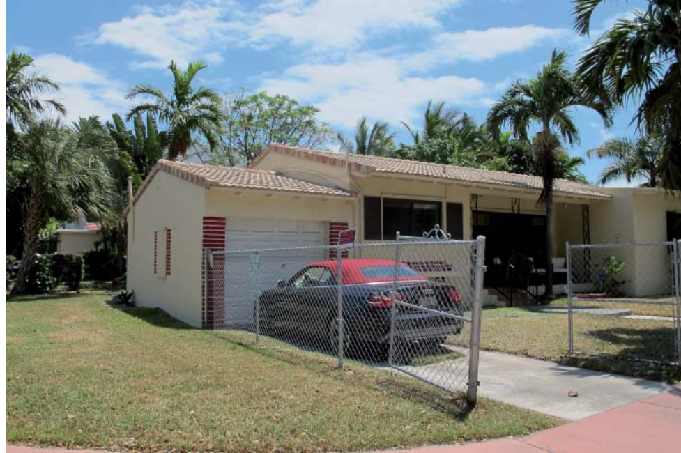
1435 Bay Road, Northwest corner view, 04/25/16