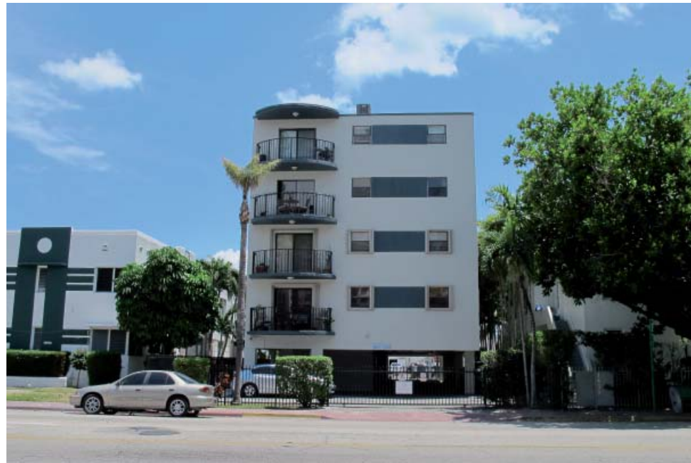
B8 – 1439 West Avenue, 04/25/16