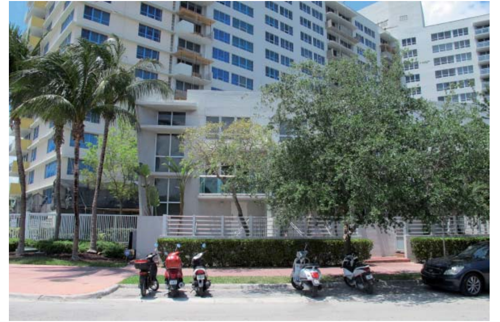
B1 (1) – 1420 Bay Road, 04/25/16