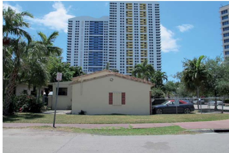
B2 – 1435 Bay Road (SITE), 04/25/16