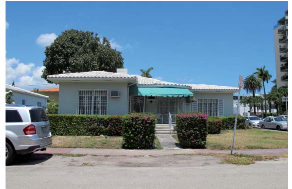
A6 – 1301 West Avenue, 04/25/16

TBD GROUP DESIGN + RE DEVELOPMENT WWW.TBD-DEVELOPMENT.COM TBD_DEVELOPMENT@GMAIL.COM +(305)890-1523 +(661)670-7462