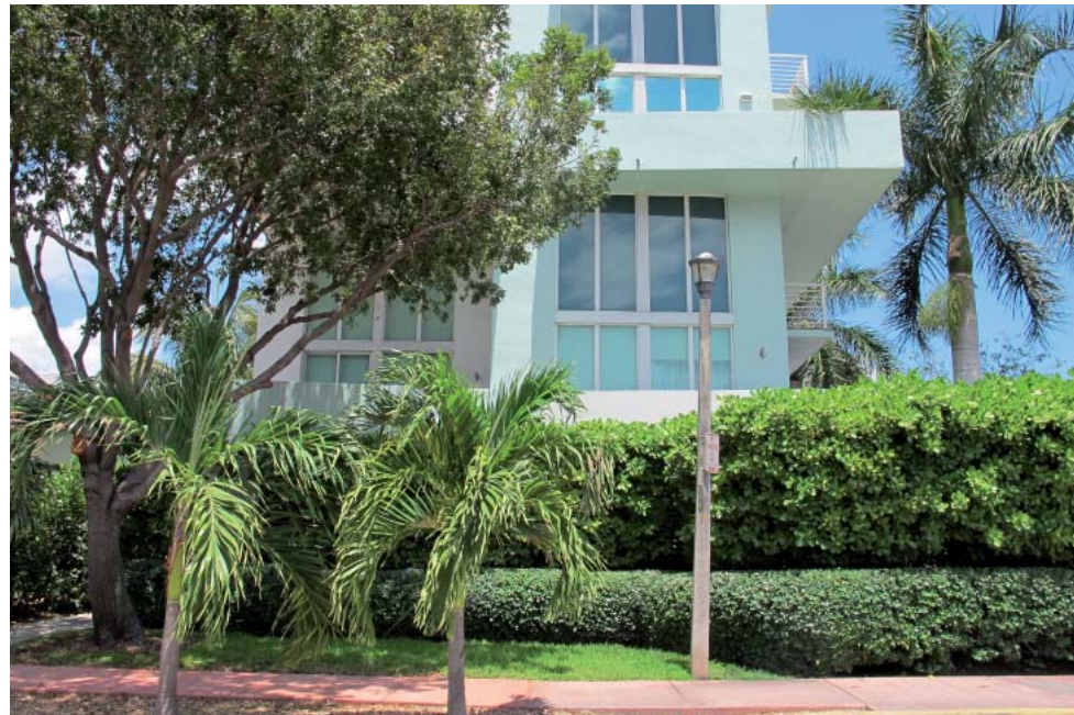
B7 – 1428 Flamingo Way, 04/25/16