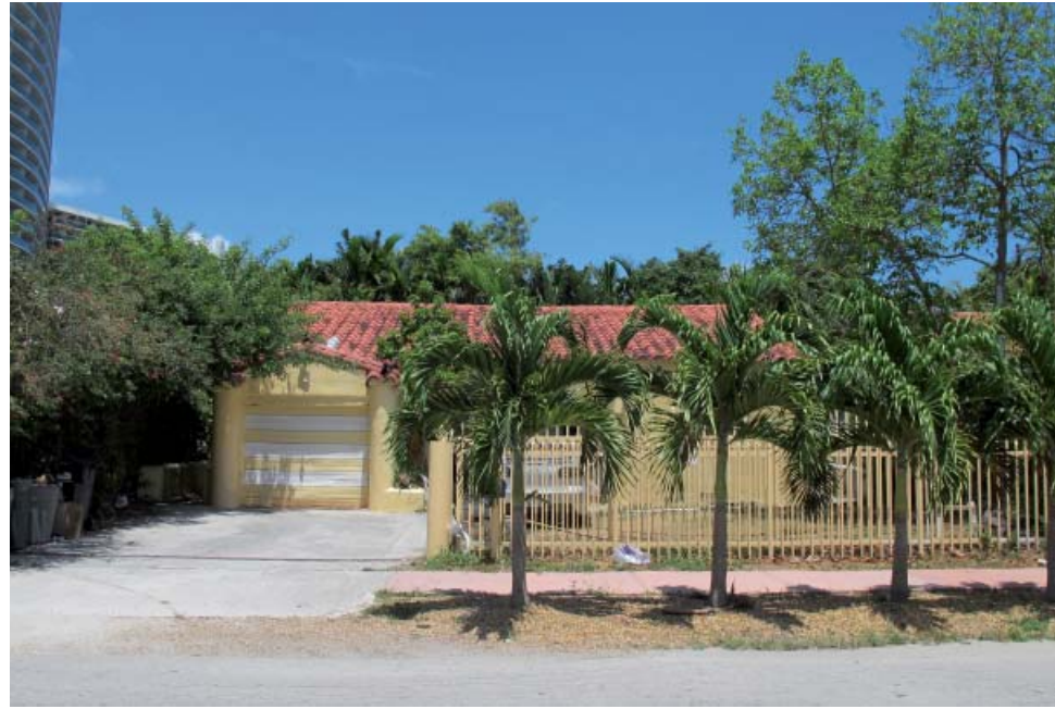
C2 – 1339 14th Terrace