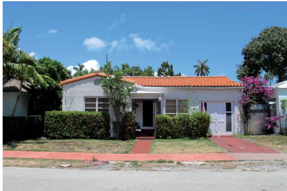
A4 – 1321 Flamingo Way, 04/25/16