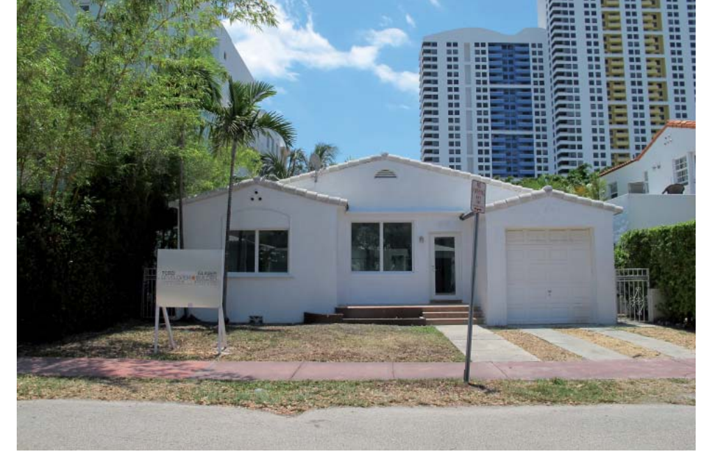
B6 – 1310 Flamingo Way, 04/25/16