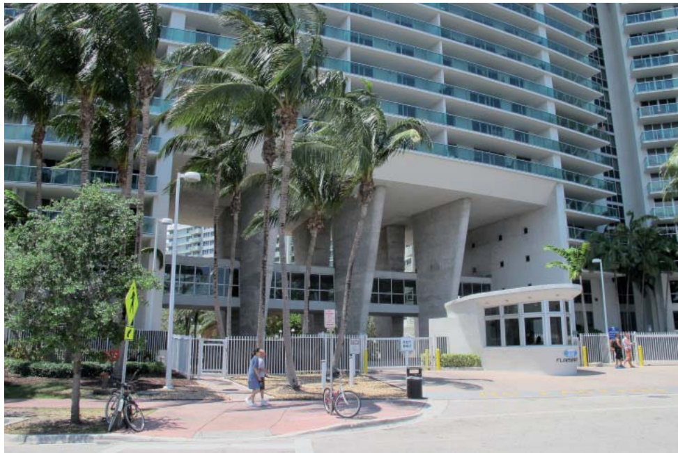
B1 (2) – 1422 Bay Road, 04/25/16