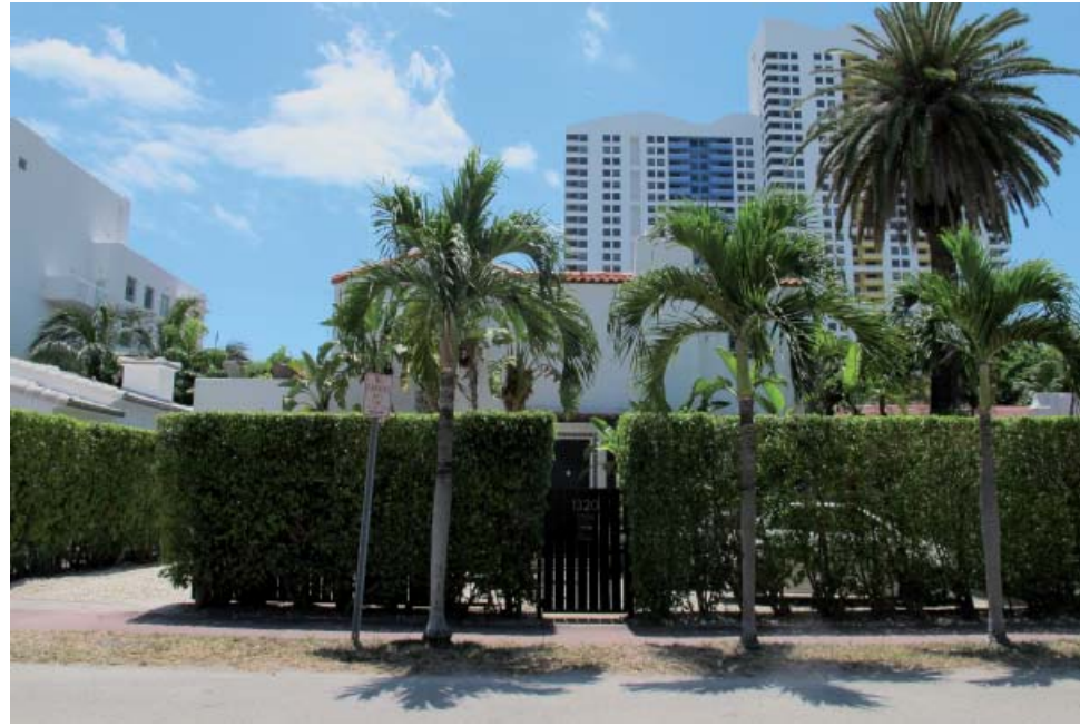
B5 – 1320 Flamingo Way, 04/25/16