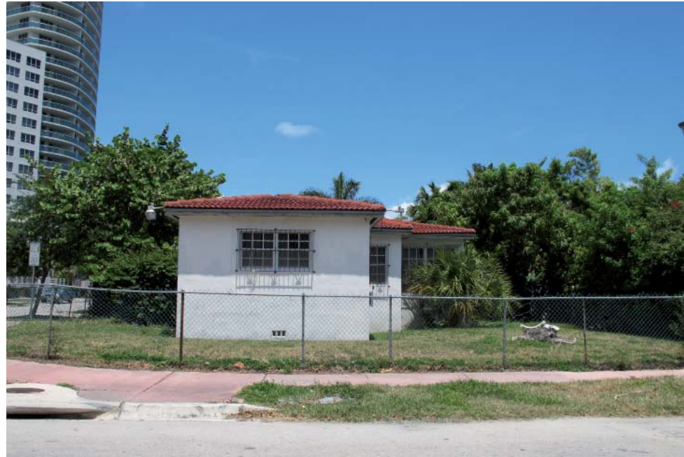
C1 – 1425 Bay Road, 04/25/16