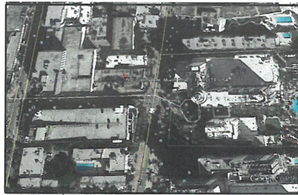
VICINITY MAP (NOT TO SCALE) NEAR 1600 COLLINS AVENUE MIAMI BEACH FL 33139