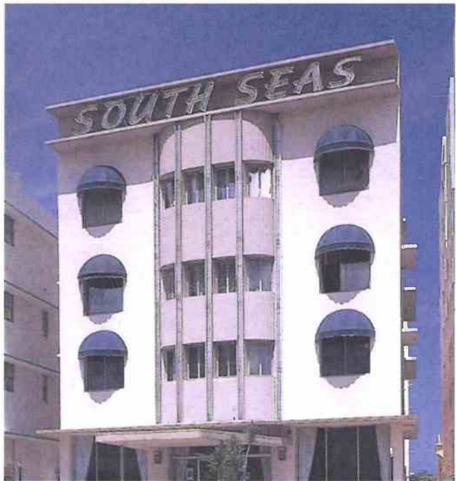
South Seas Hotel, 1988 Photograph 1954 Grossman façade design

The applicant is currently proposing the substantial demolition, renovation and partial restoration of the Richmond Hotel and the construction of an attached 3-story rear addition. The demolition requested includes the removal of the Melvin Grossman designed front façade treatment, the rear approximately 84% of the building and the non-original 1-story cabana structure located east of the main hotel building. While the amount of demolition is extensive, the applicant is proposing the full restoration of the original 1941 Dixon façade design including the restoration/reintroduction of all significant architectural elements and materials that have been completely obscured by 1954 renovation. The restoration of the primary façade of this significant Art Deco hotel will serve to enhance the historic and architectural character of the district and is more consistent with the period of significance established for the Miami Beach Architectural District listed on the National Register of Historic Places.