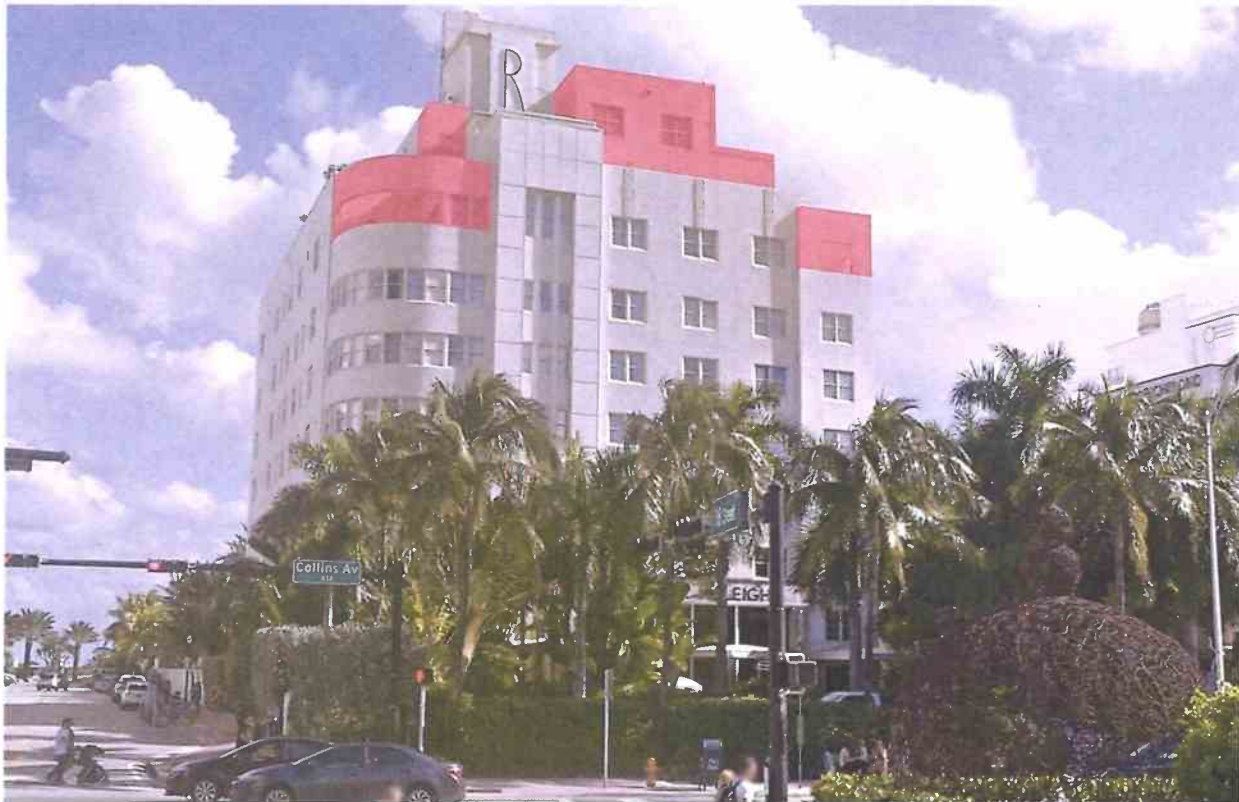
Raleigh Hotel, 2016 Photograph (rooftop additions highlighted in red proposed to be removed)

Staff is extremely supportive and enthusiastic of the expanded scope of restorative work. This additional scope in conjunction with the previously approved restoration will reposition the Raleigh Hotel as one of the most meticulously restored Streamline style hotels in the world.