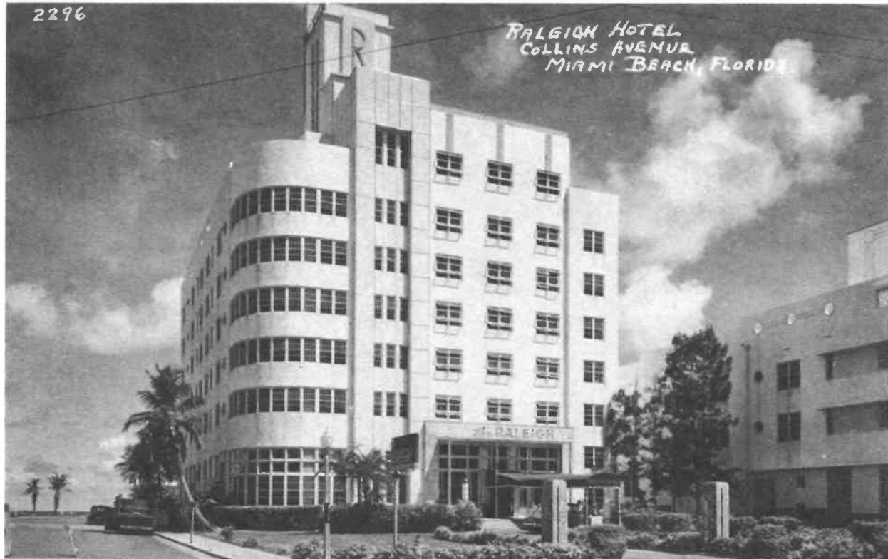
Raleigh Hotel, Ca. 1940's Postcard

The Raleigh Hotel constructed in 1940 and designed by L. Murray Dixon is an excellent example of the Streamline Moderne style in a larger scale hotel. Notable design features include, a broad rounded corner with ribbon windows, pink keystone clad entry portal, vertical accents and porthole windows. Additionally, the multi-foliated swimming pool is one of the most celebrated pool designs in America.