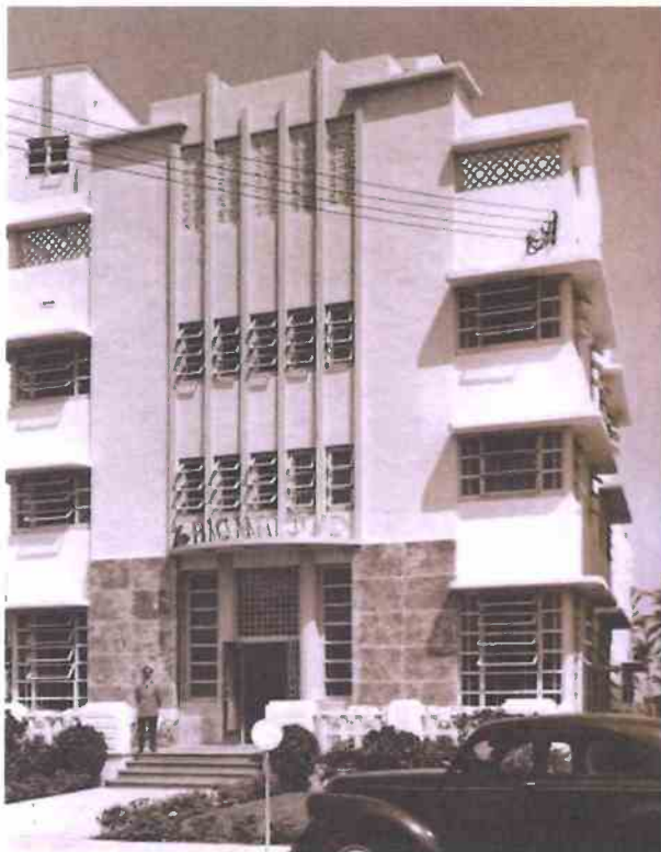
Richmond Hotel, Photograph, Ca. 1940's 1941 Dixon façade design