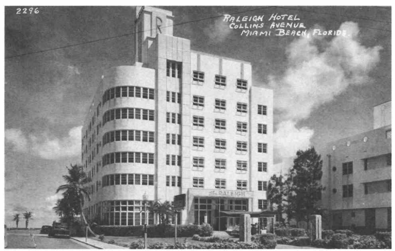
Raleigh Hotel, Ca. 1940's Postcard

The Raleigh Hotel constructed in 1940 and designed by L. Murray Dixon is an excellent example of the Streamline Moderne style in a larger scale hotel. Notable design features include, a broad rounded corner with ribbon windows, pink keystone clad entry portal, vertical accents and porthole windows. Additionally, the multi-foliated swimming pool is one of the most celebrated pool designs in America.