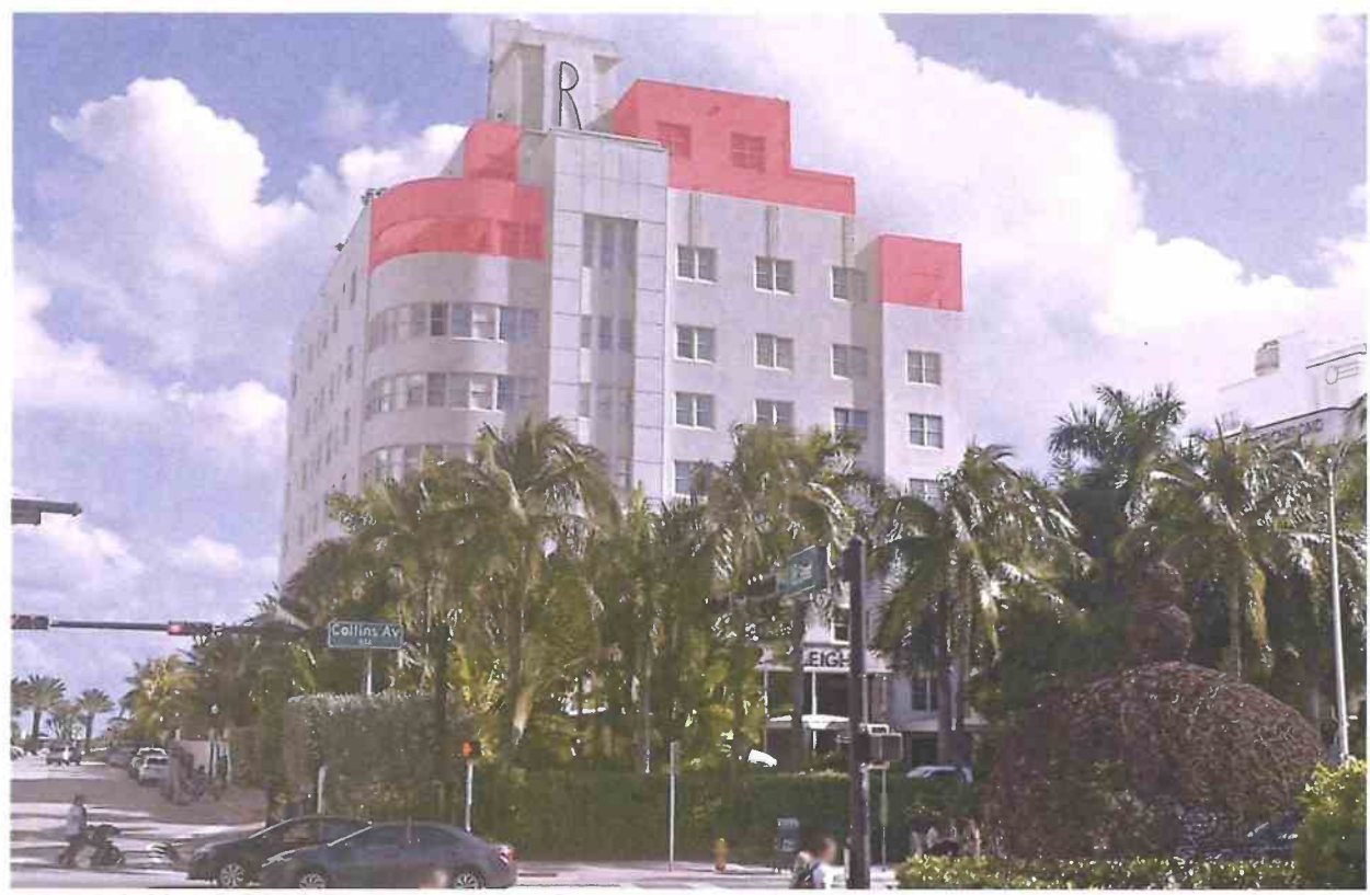
Raleigh Hotel, 2016 Photograph (rooftop additions highlighted in red proposed to be removed)

Staff is extremely supportive and enthusiastic of the expanded scope of restorative work. This additional scope in conjunction with the previously approved restoration will reposition the Raleigh Hotel as one of the most meticulously restored Streamline style hotels in the world.