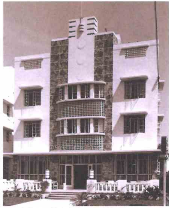
South Seas Hotel, Ca. 1940's Photograph 1941 Dixon façade design

The South Seas Hotel was constructed in 1941 and designed by architect L. Murray Dixon in the Art Deco style of architecture. Similarly to the Richmond Hotel, a Melvin Grossman designed new Collins Avenue façade and an attached 7-story rear addition were constructed in 1954. However, the façade of South Seas Hotel was more dramatically altered in comparison to the Richmond Hotel. The new South Seas façade was completely modernized in the Post War Modern style of architecture including the construction of a 1-story penthouse, the removal of the projecting eyebrows, the introduction of a porte-cohere at the ground level and monumental signage at the parapet.