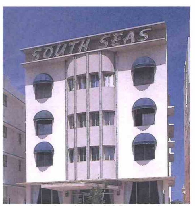
South Seas Hotel, 1988 Photograph 1954 Grossman façade design

The applicant is currently proposing the substantial demolition, renovation and partial restoration of the Richmond Hotel and the construction of an attached 3-story rear addition. The demolition requested incudes the removal of the Melvin Grossman designed front façade treatment, the rear approximately 84% of the building and the non-original 1-story cabana structure located east of the main hotel building. While the amount of demolition is extensive, the applicant is proposing the full restoration of the original 1941 Dixon façade design including the restoration/reintroduction of all significant architectural elements and materials that have been completely obscured by 1954 renovation. The restoration of the primary façade of this significant Art Deco hotel will serve to enhance the historic and architectural character of the district and is more consistent with the period of significance established for the Miami Beach Architectural District listed on the National Register of Historic Places.